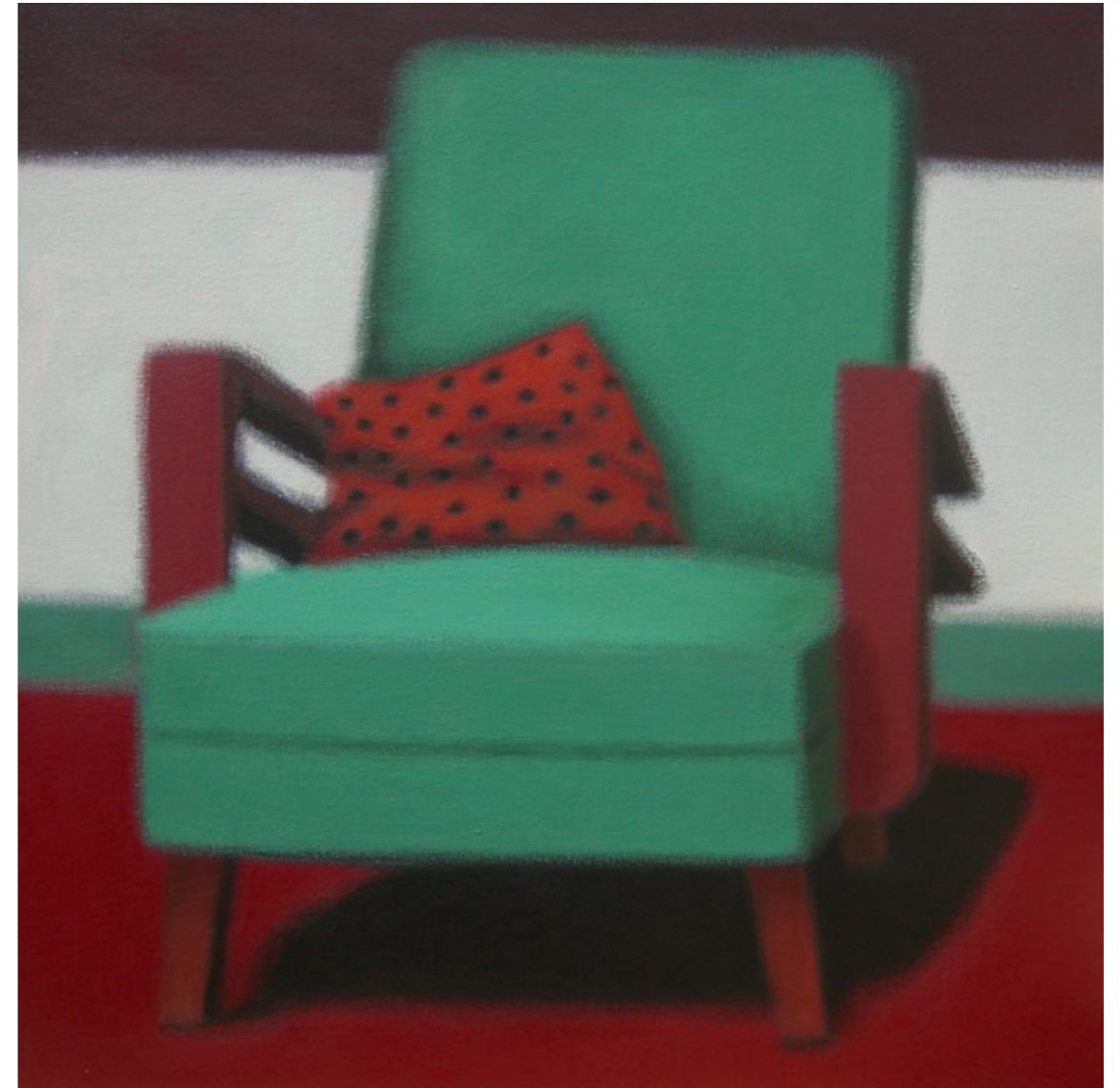
Spotted Cushion Acrylic on canvas 56 x 56cm 2009