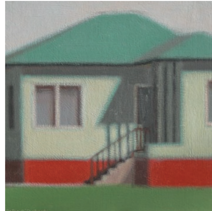
Green Fibro, Lithgow Acrylic on canvas 31 x 31cm 2009