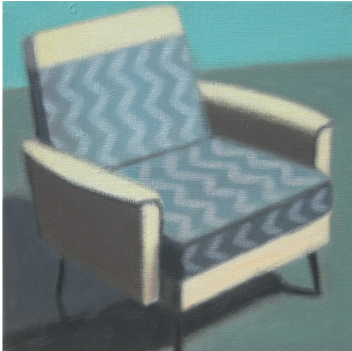
Zig Zag Chair Acrylic on canvas 31 x 31cm 2009