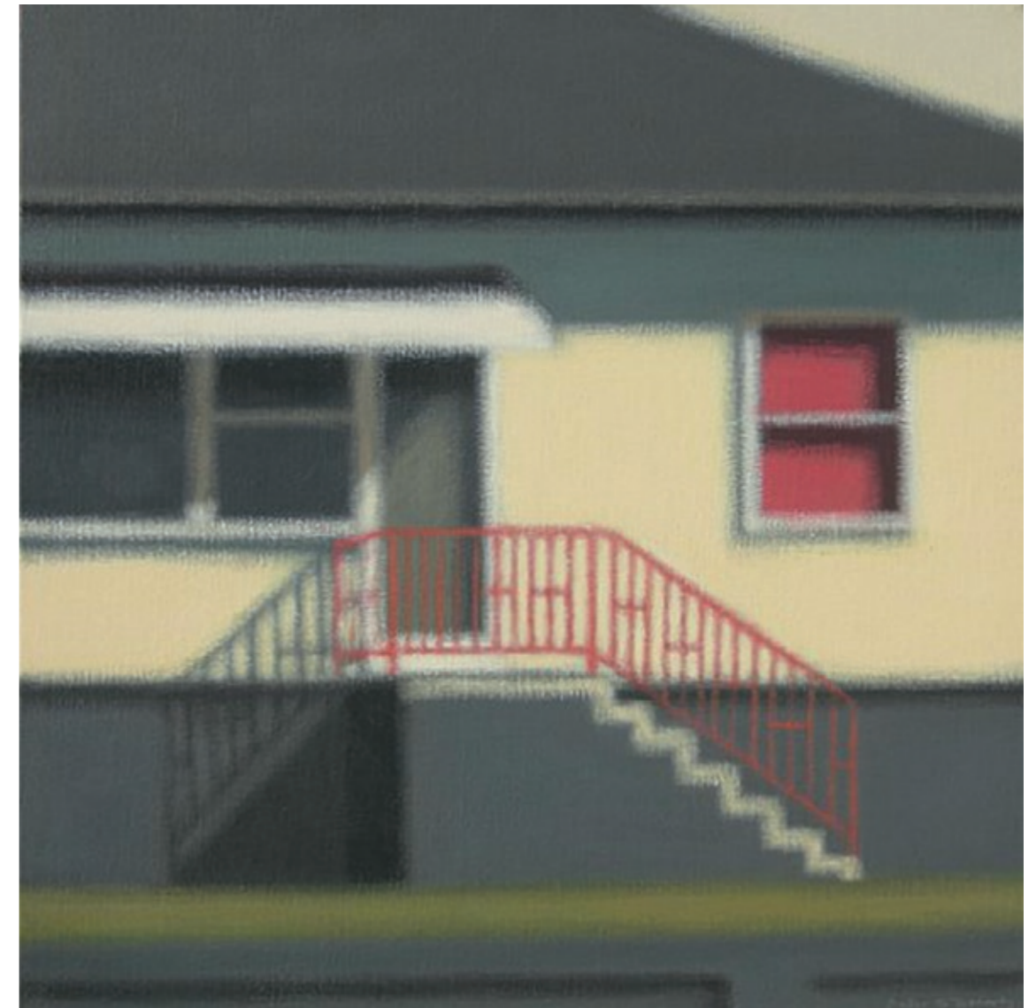
No One Home, Malabar Acrylic on canvas 50 x 50cm 2009