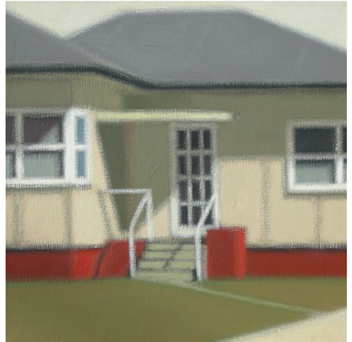
Lithgow Entrance Acrylic on canvas 40 x 40cm 2009