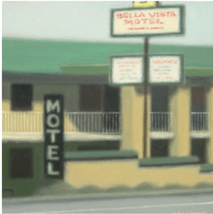
Bella Vista Motel, Central Coast Acrylic on canvas 40 x 40cm 2009