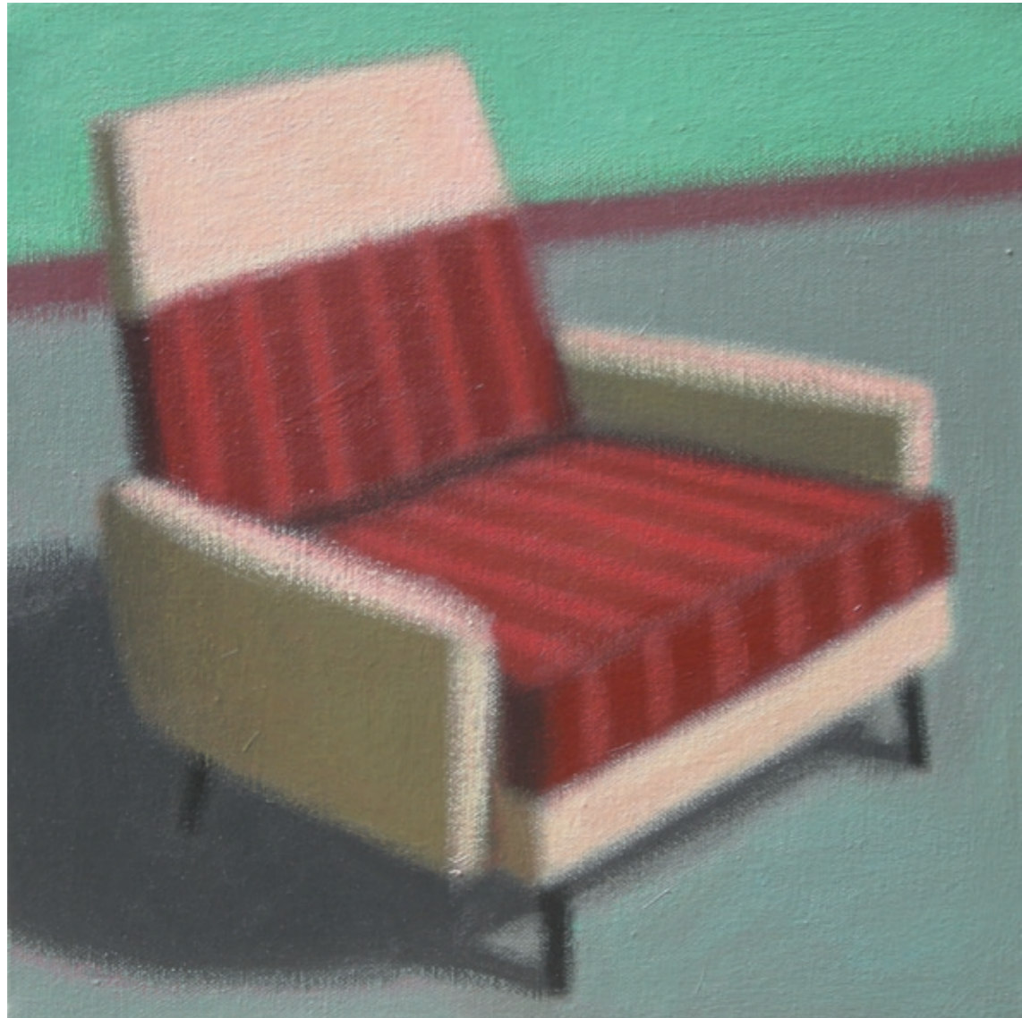
Red Stripes Acrylic on canvas 31 x 31cm 2009