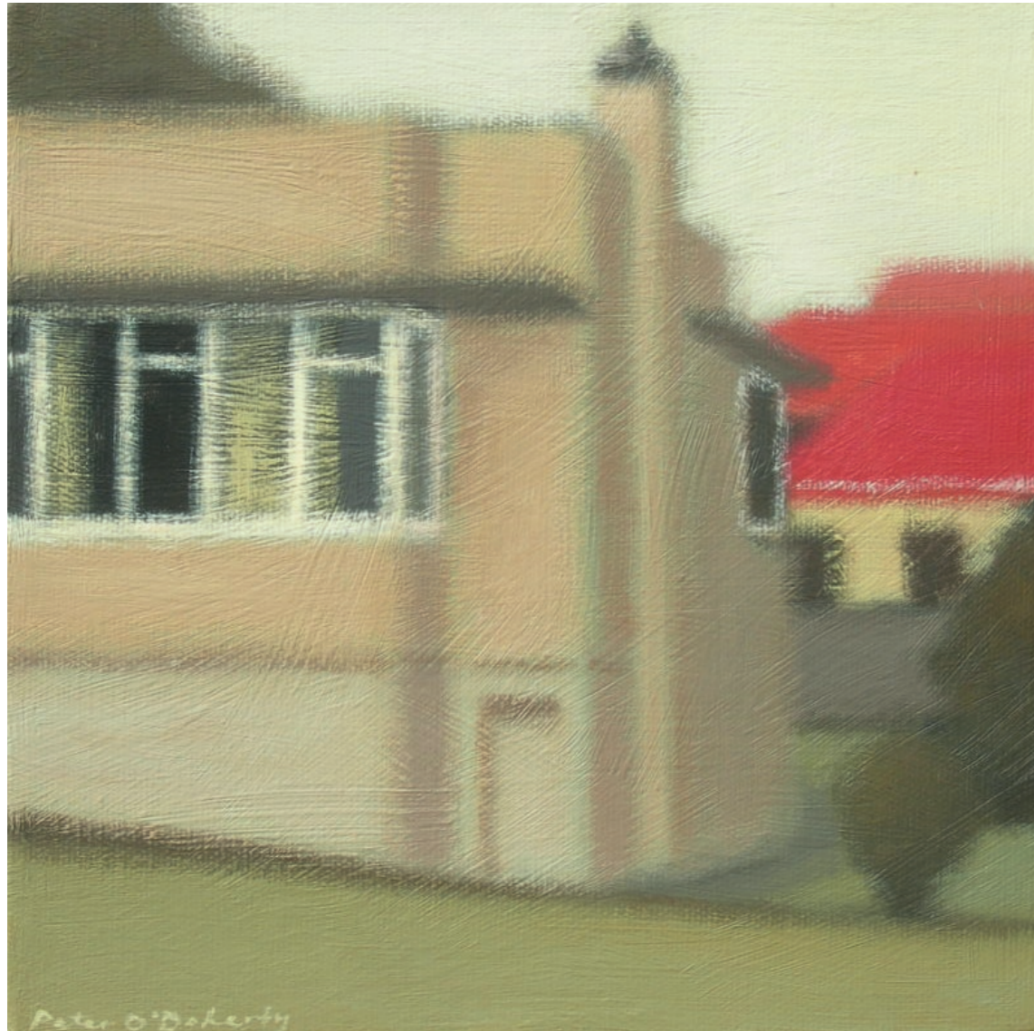
Deco Beach House Acrylic on canvas 20 x 20cm 2009