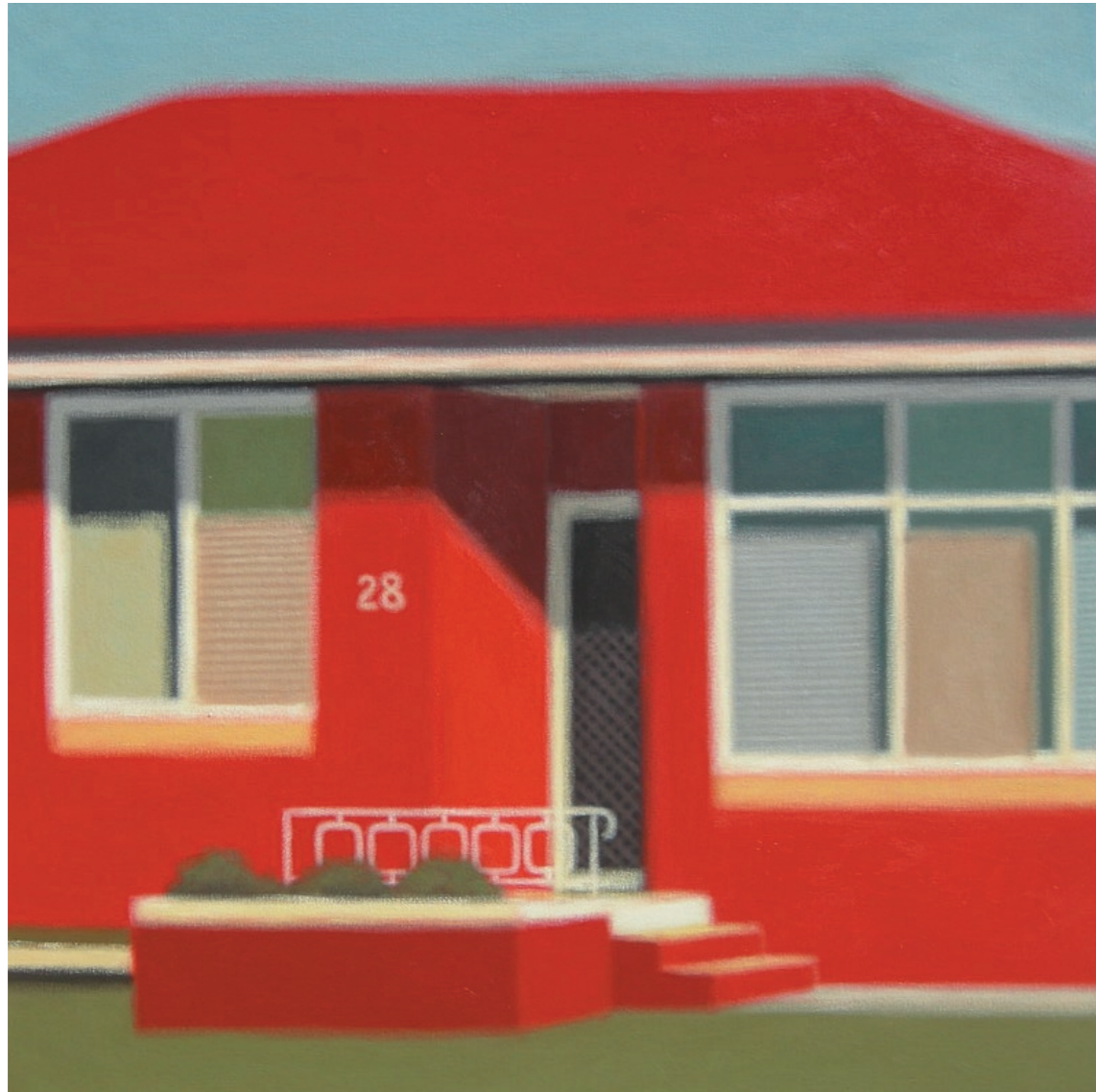
Number 28 Acrylic on canvas 122 x 122cm 2009