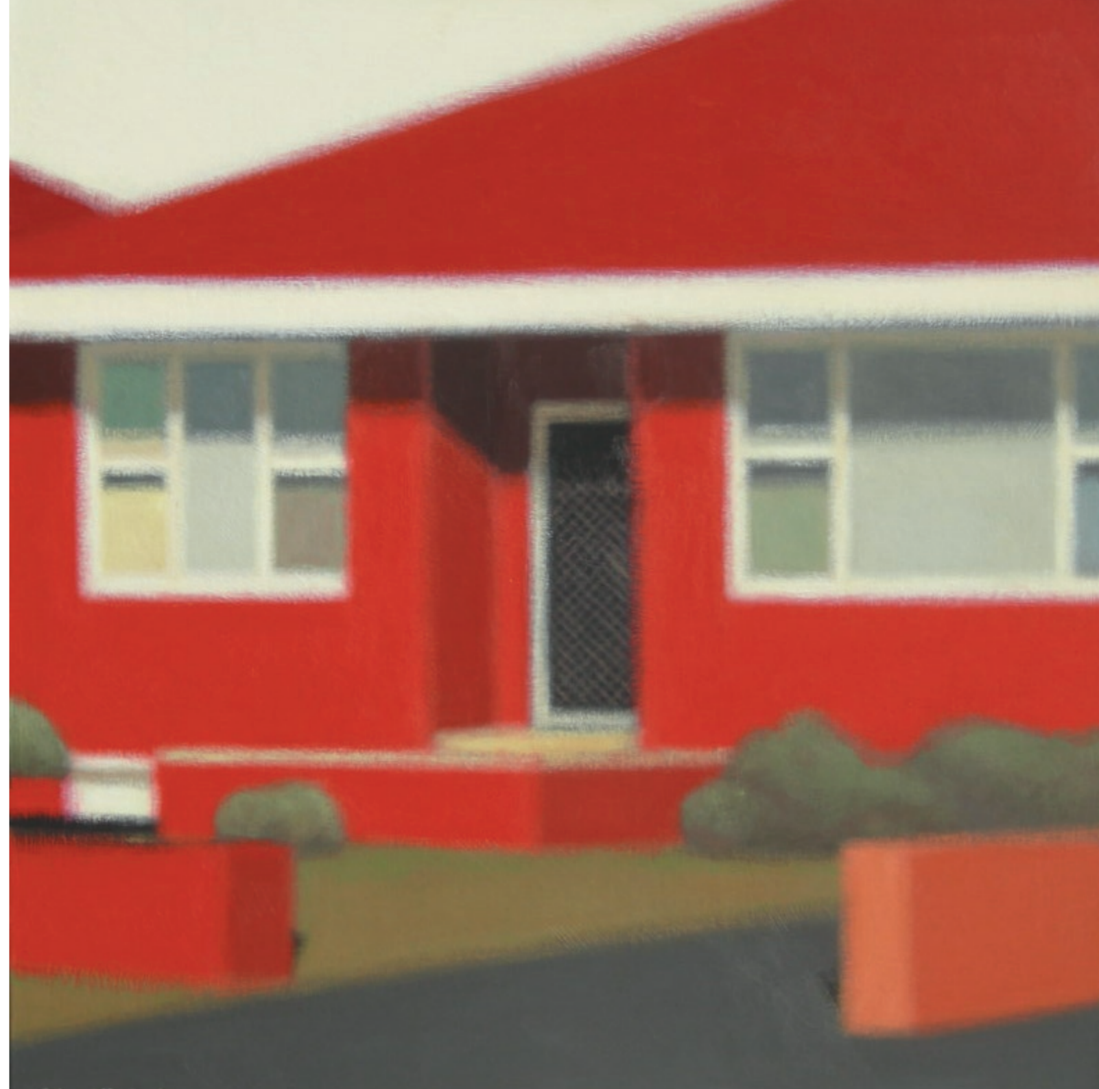
Monterey Driveway Acrylic on canvas 71 x 71cm 2009