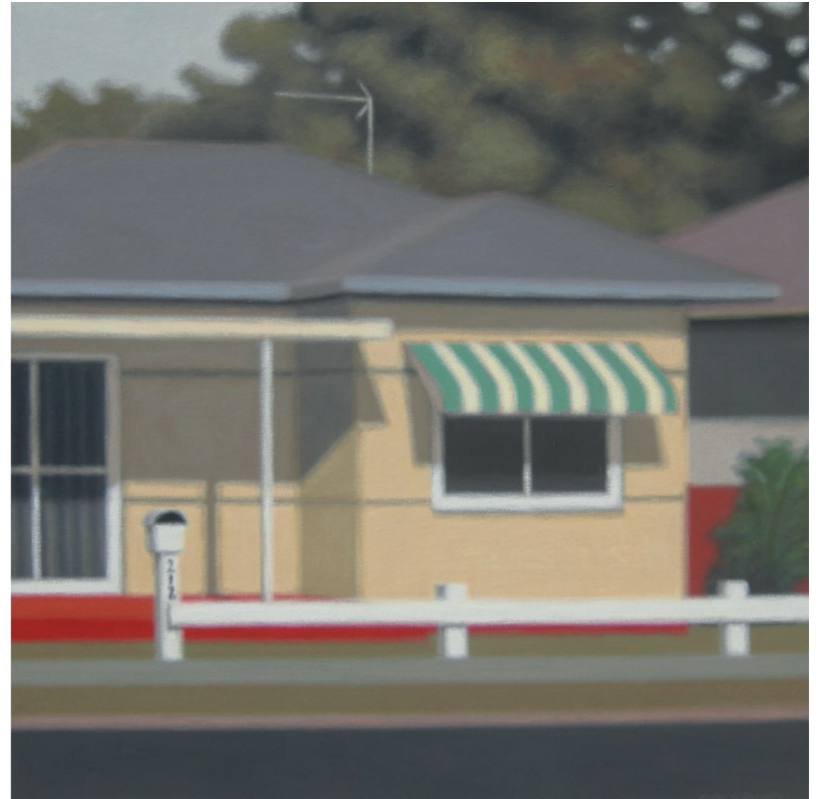
On The Woy Woy Road Acrylic on canvas 122 x 122cm 2009