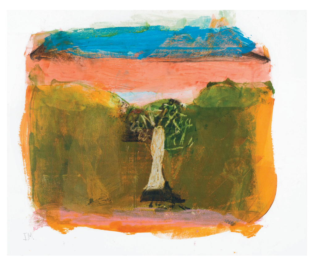
Landscape Flags Kimberley 3 2014 monotype 75 x 92cm framed