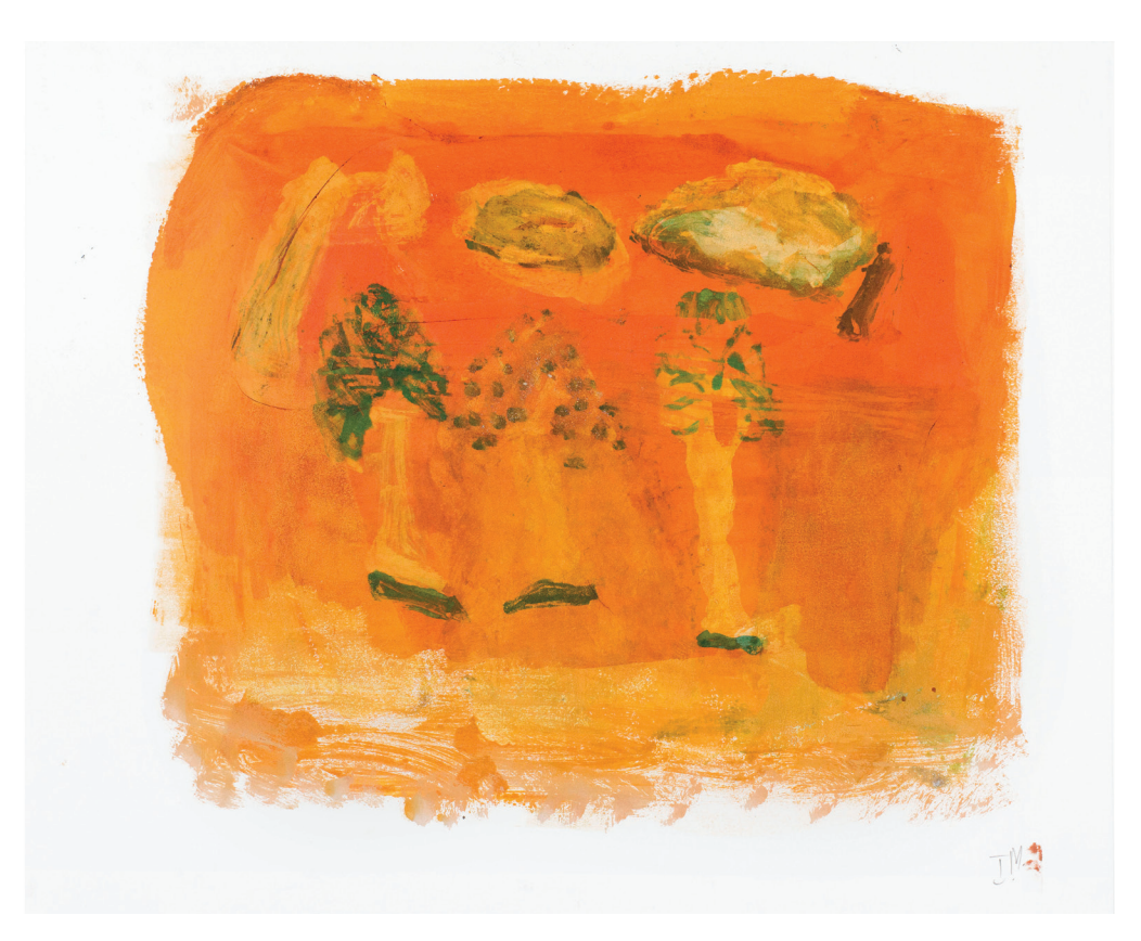
Landscape Flags Kimberley 4 2014 monotype 75 x 92cm framed