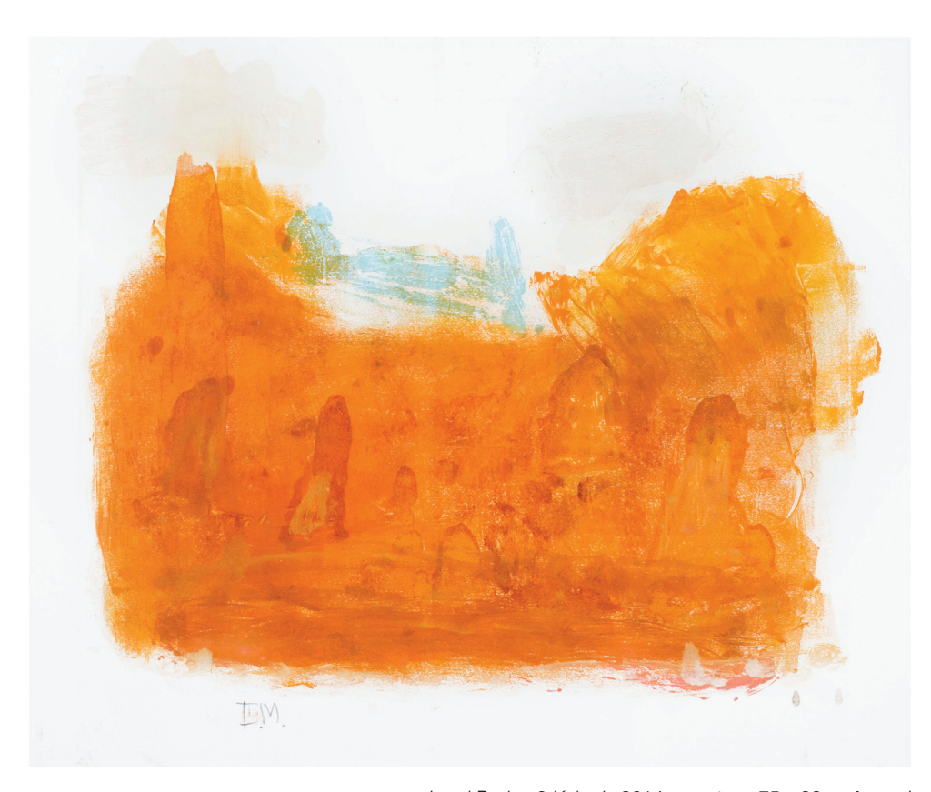
Land Badge 2 Kakadu 2014 monotype 75 x 92cm framed