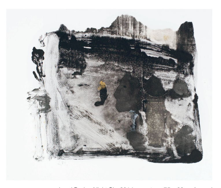
Land Badge Night Sky 2014 monotype 75 x 92cm framed