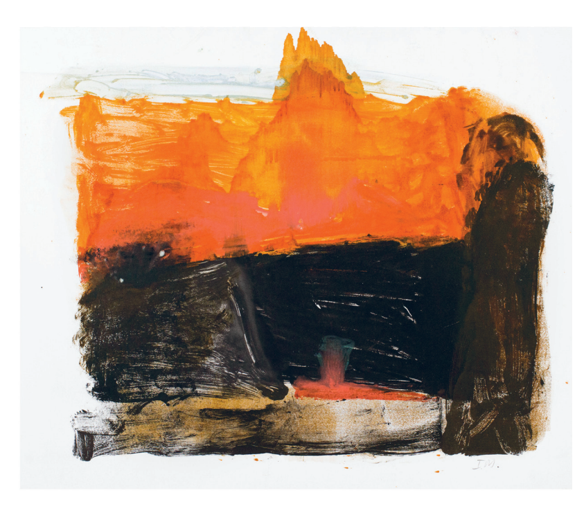
Land Badge Kakadu 2014 monotype 75 x 92cm framed