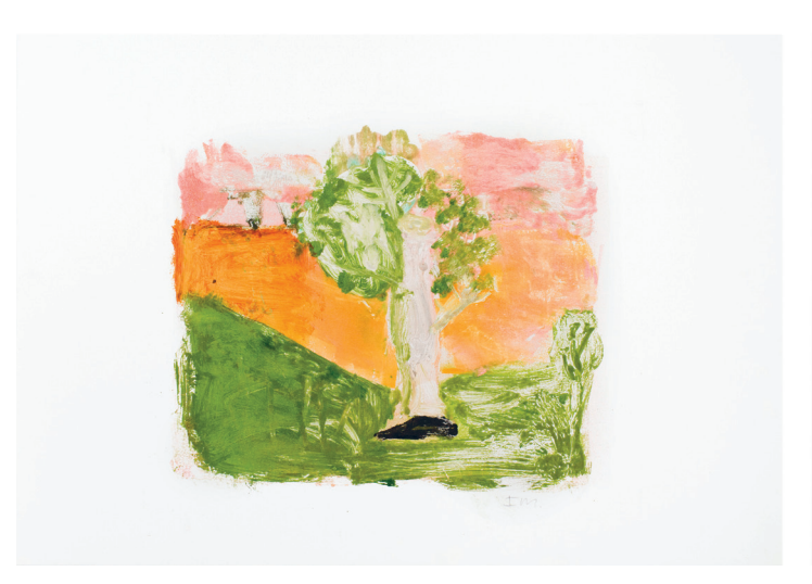
Landscape Flags Kimberley 1 2014 monotype 75 x 92cm framed