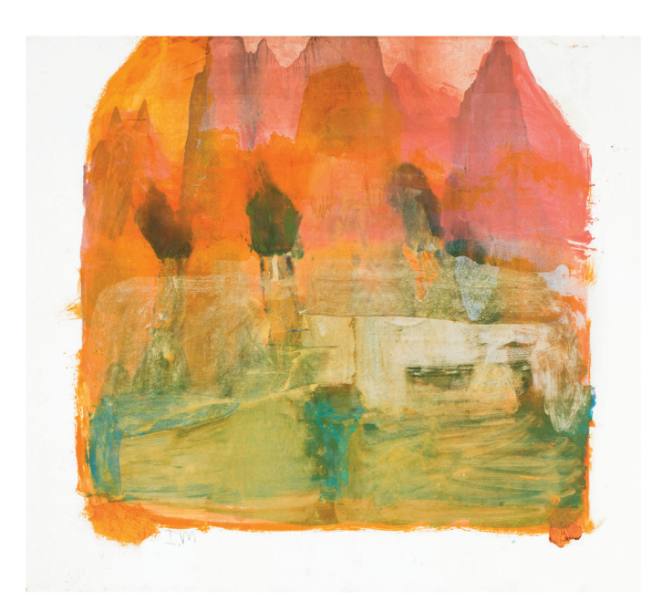
Land Badge 6 Kakadu 2014 monotype 75 x 92cm framed