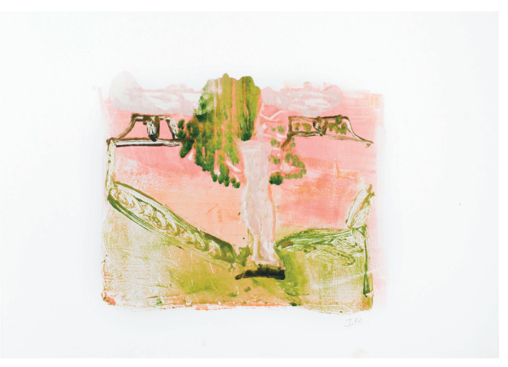
Landscape Flags Kimberley 2 2014 monotype 75 x 92cm framed