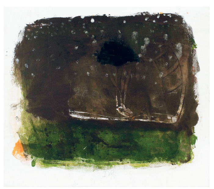
Land Flag Night Sky 2 2014 monotype 75 x 92cm framed