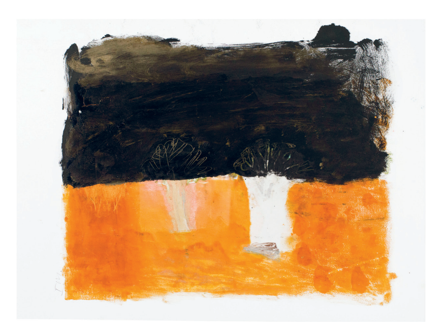
Land Badge Night Sky 3 2014 monotype 75 x 92cm framed