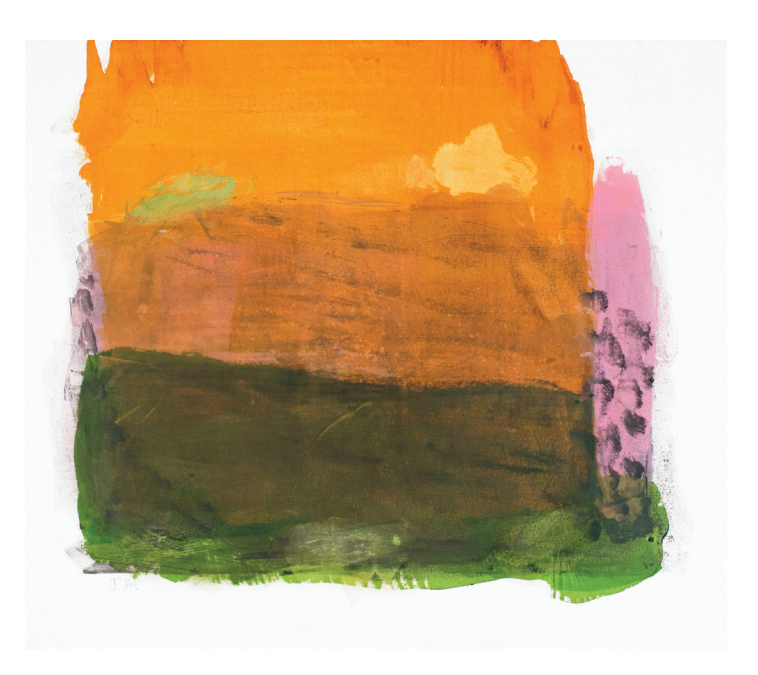
Land Badge 5 Kakadu 2014 monotype 75 x 92cm framed