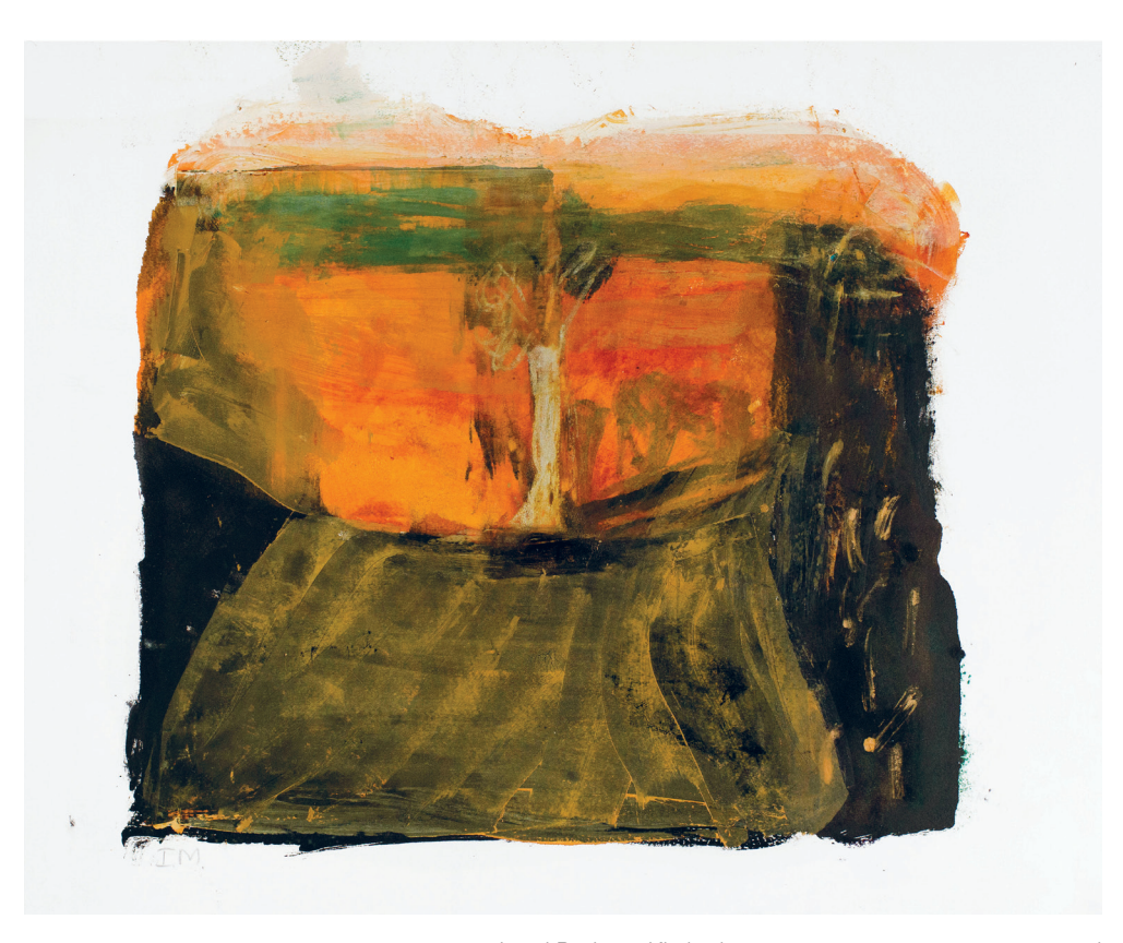
Land Badge 3 Kimberley 2014 monotype 75 x 92cm framed