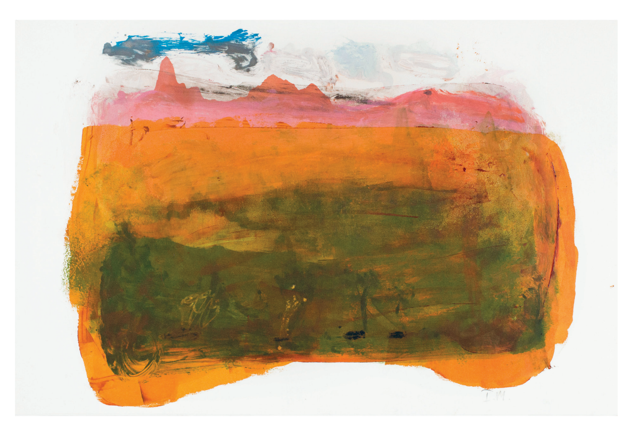
Land Badge 4 Kakadu 2014 monotype 75 x 92cm framed