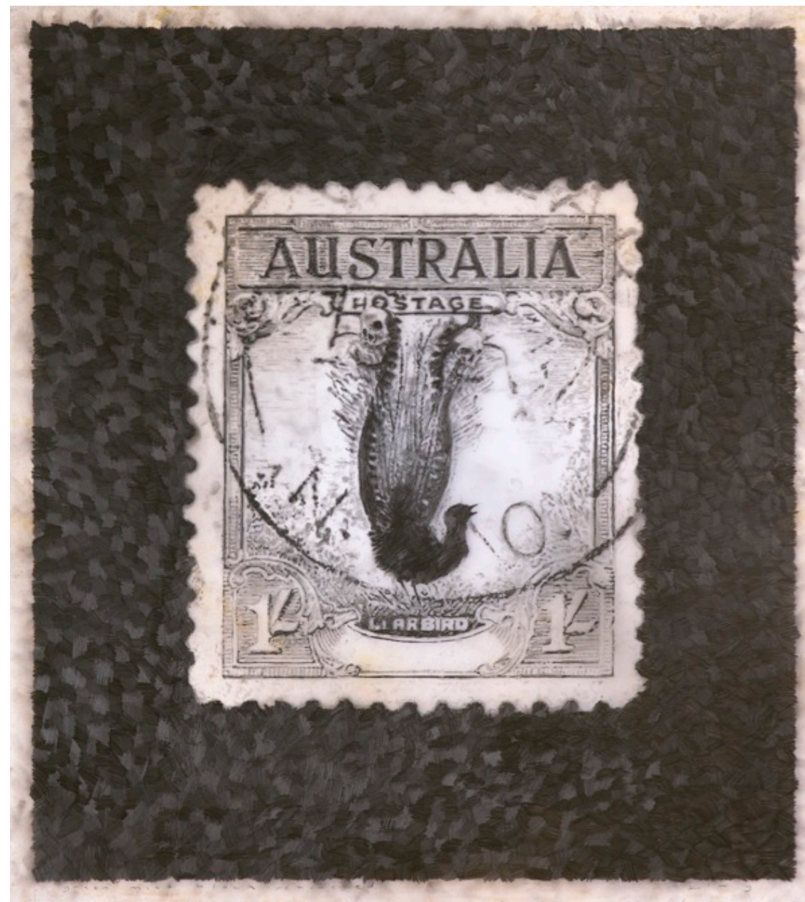
right: Green Mist Black retouched - graphite on drafting film, pigment on paper 103x93cm