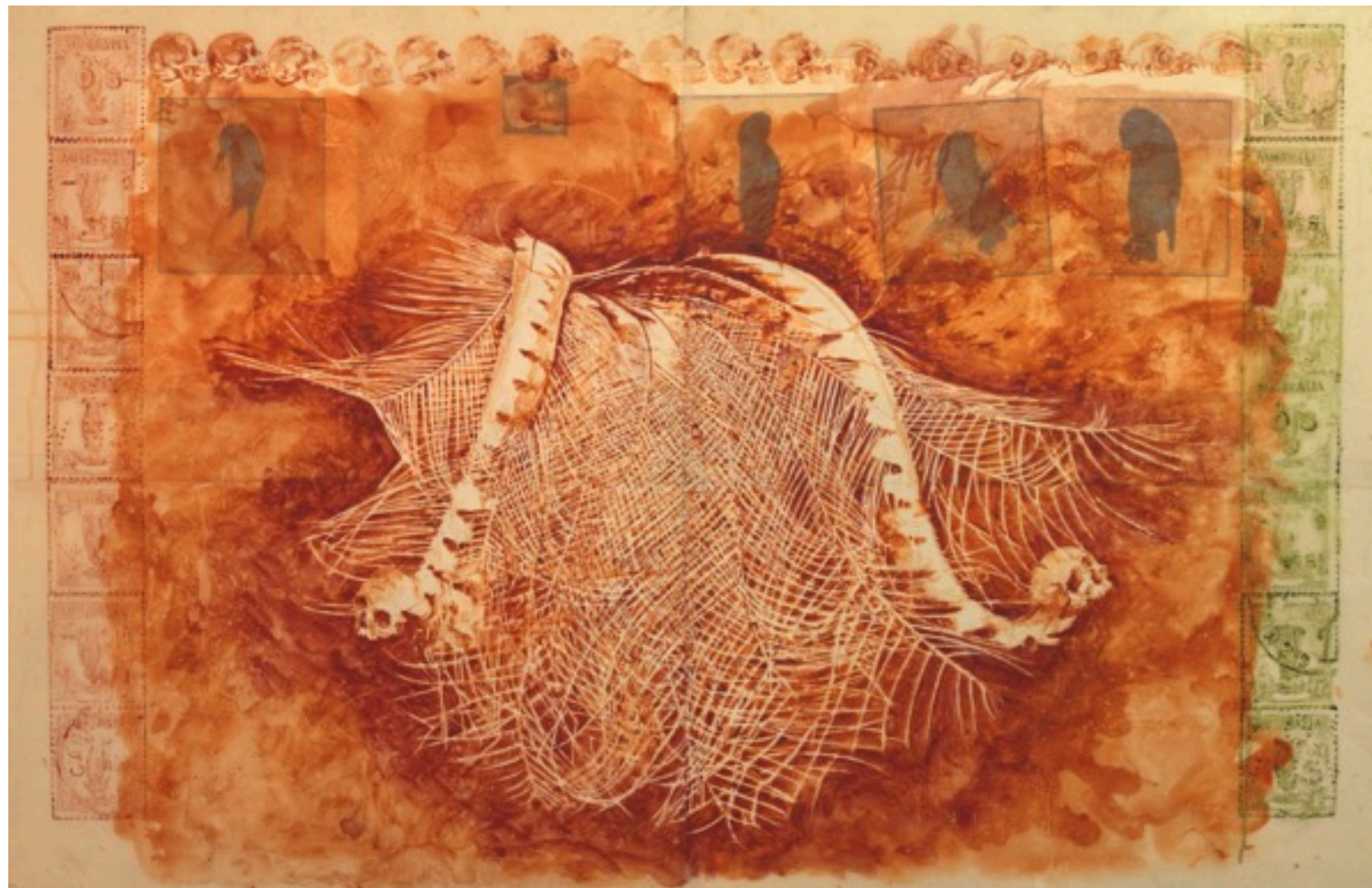
Lyre Lyre, Dawn Survey watercolour & encaustic on drafting film 120x170cm