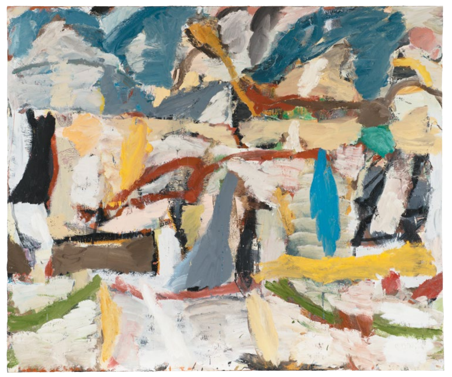
Two Months In The Long Paddock 2014 Oil on canvas 155x185cm