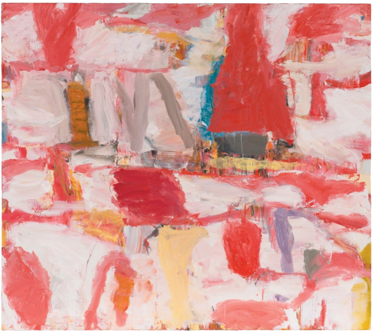
Fog and Dawn 2014 Oil on canvas 122x137cm