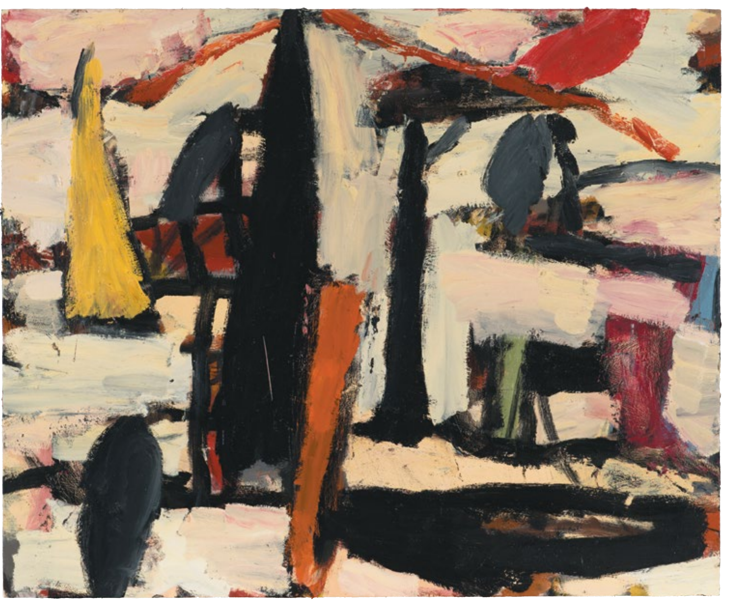
Heat and Shadow 2014 Oil on canvas 112x137cm