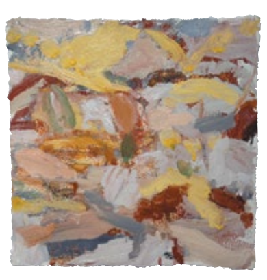
No I Walcha 2014 Oil on paper 50x50cm