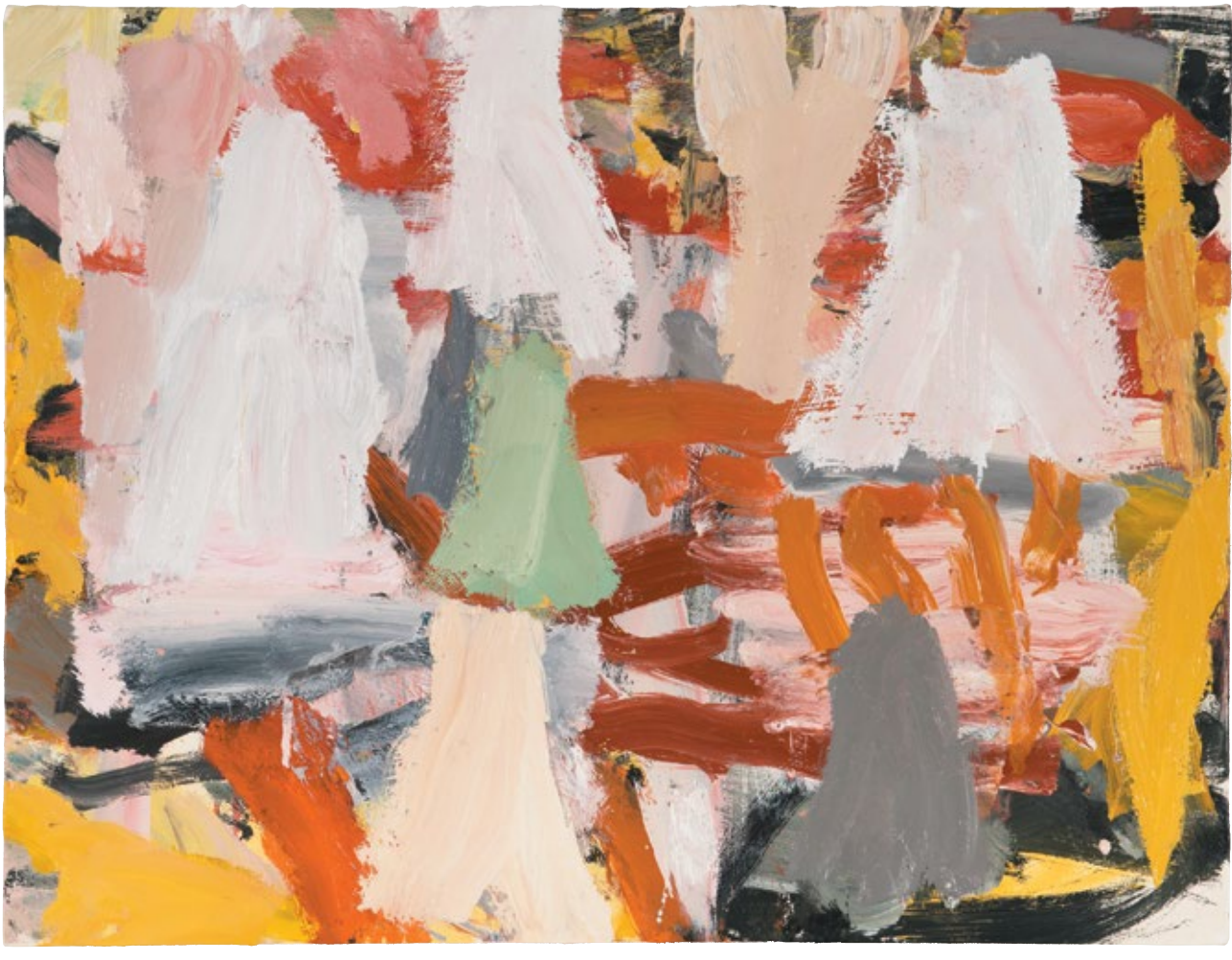
Rams Gully near the Ridge 2014 Oil on canvas 55x72cm