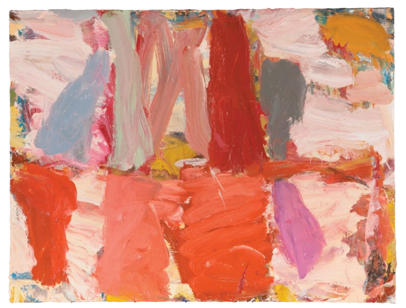
Rams Gully [Bologna] 2014 Oil on canvas 55x72cm