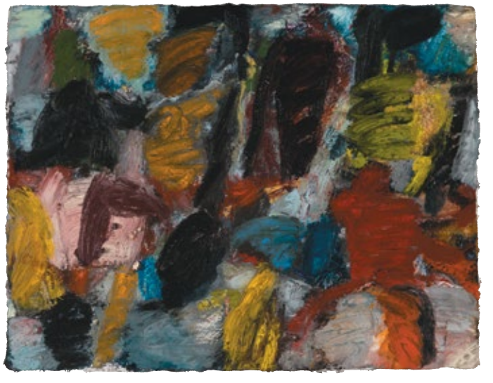
No II 2014 Oil on canvas ???x???cm