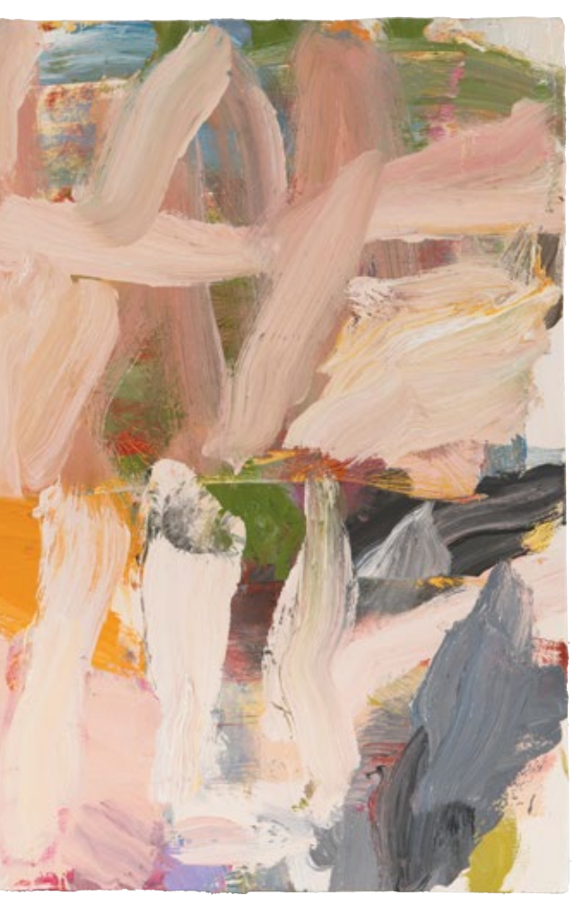
Top Harrys Light 2014 Oil on canvas 55x72cm