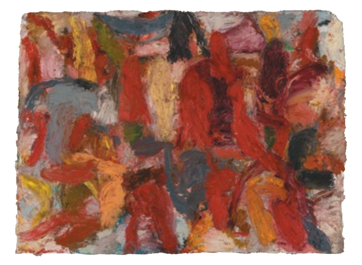
No V 2014 Oil on canvas ???x???cm