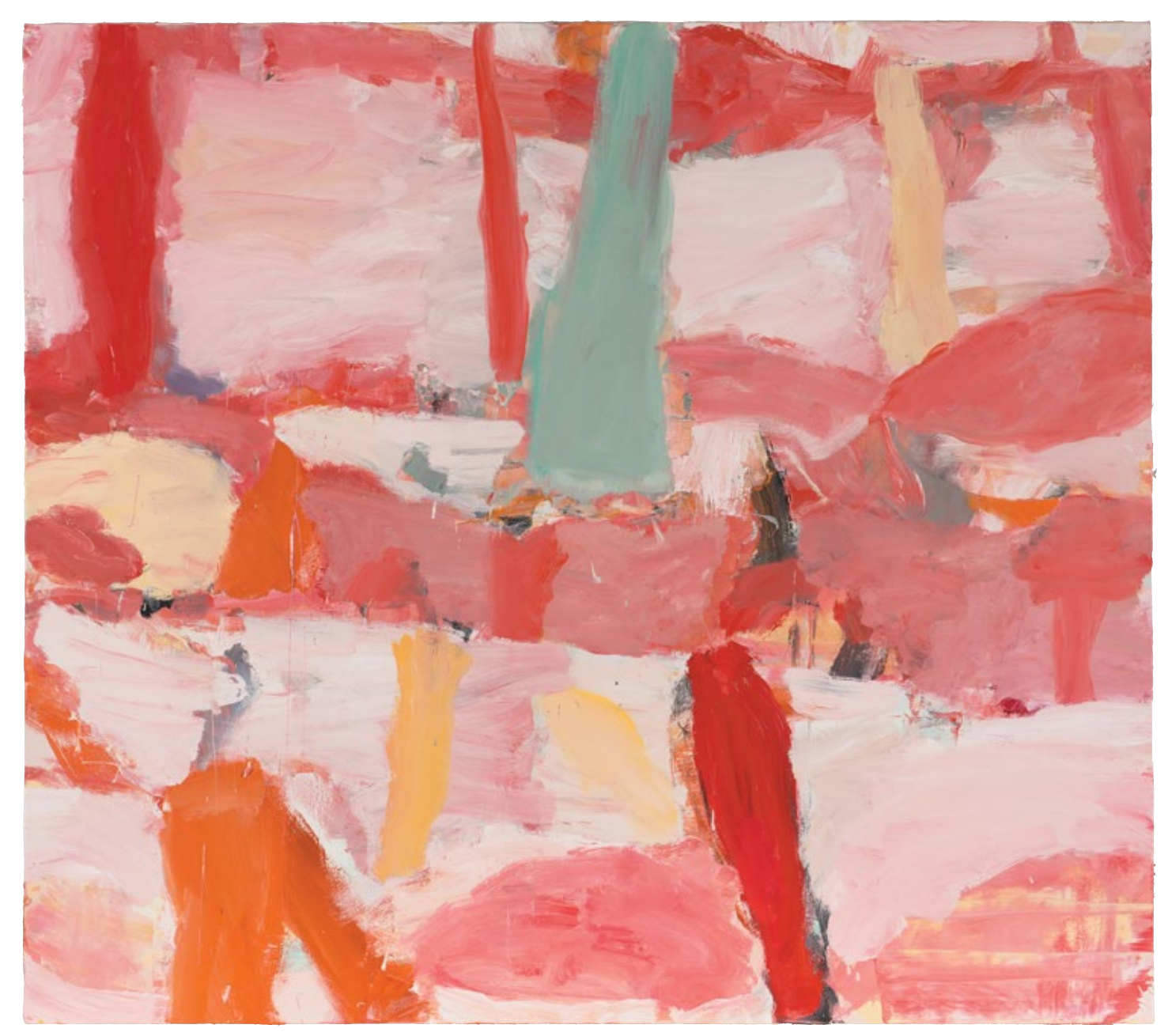
Fog and Dusk 2014 Oil on canvas 122x137cm