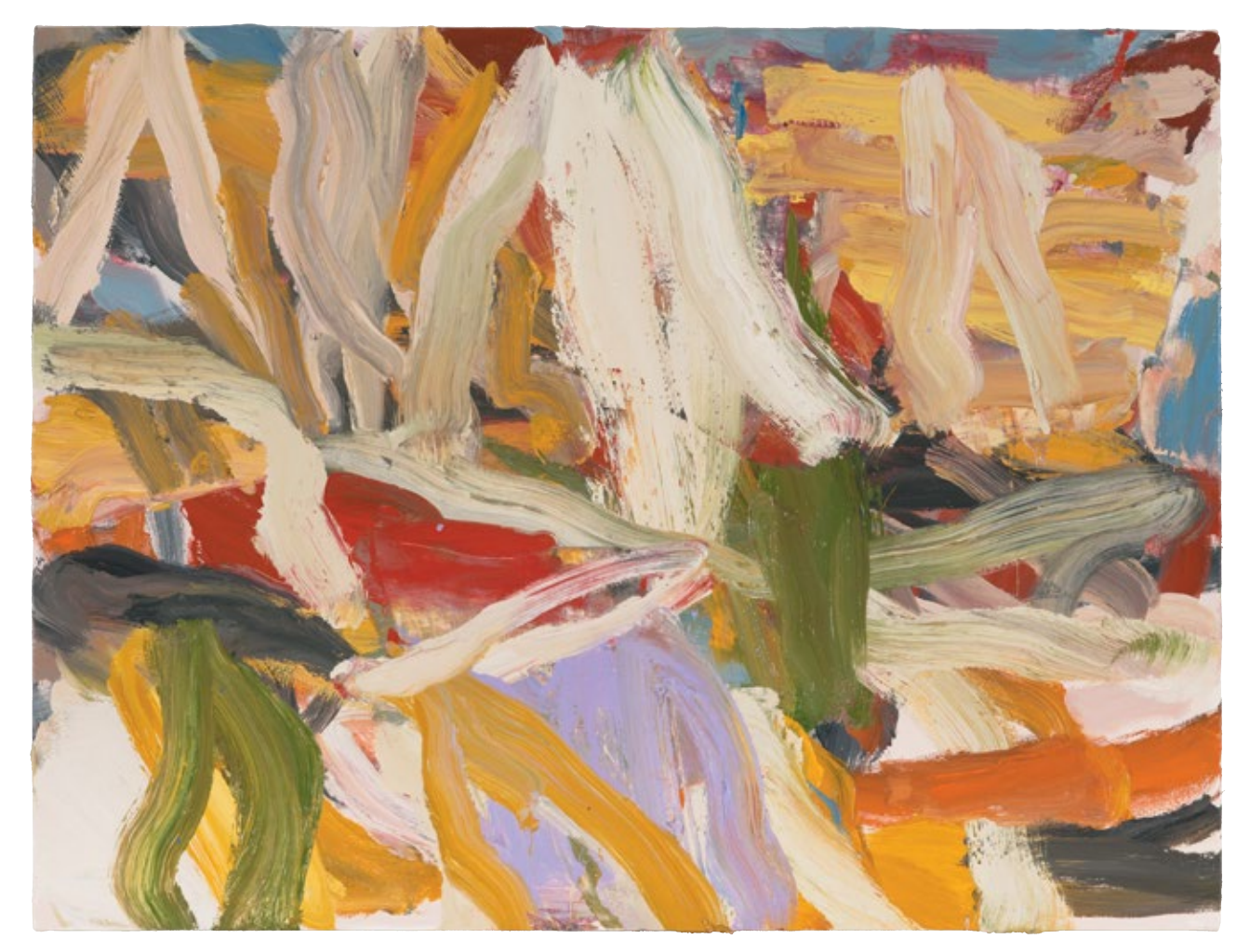
To Scrubby Gully 2014 Oil on canvas 55x72cm