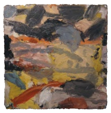
No III Walcha 2014 Oil on paper 50x50cm