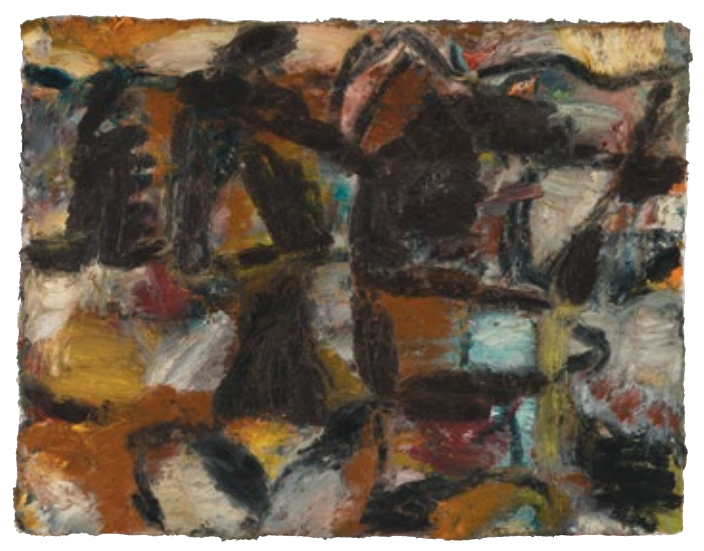
No I 2014 Oil on canvas ???x???cm