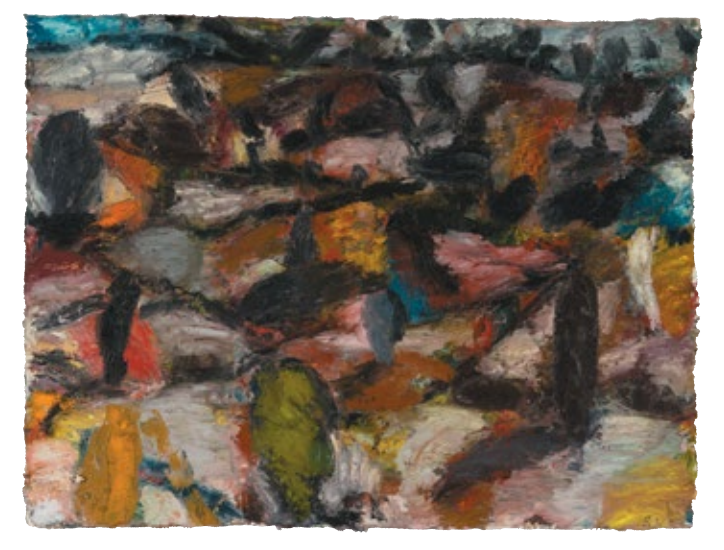
No III 2014 Oil on canvas ???x???cm