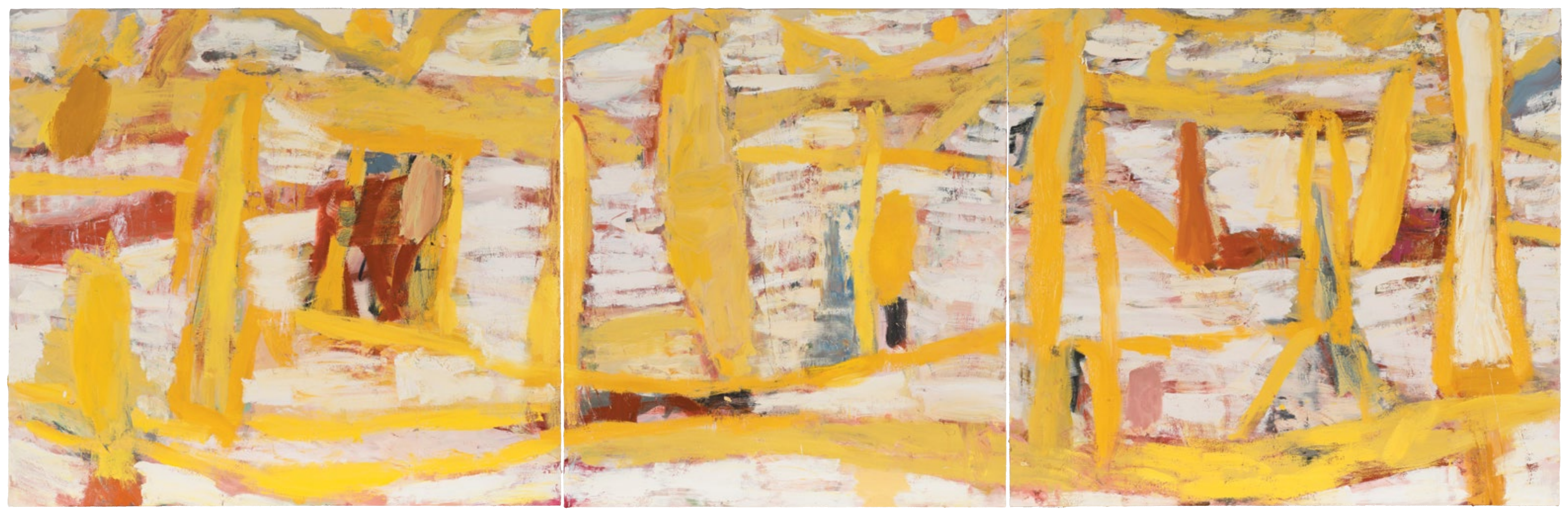
Hurricane Gully Big View 2014 Oil on Canvas 137x440cm