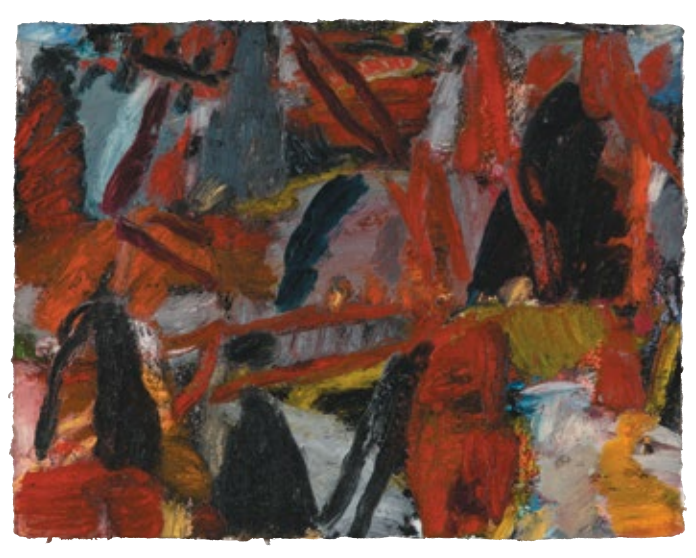
No IV 2014 Oil on canvas ???x???cm