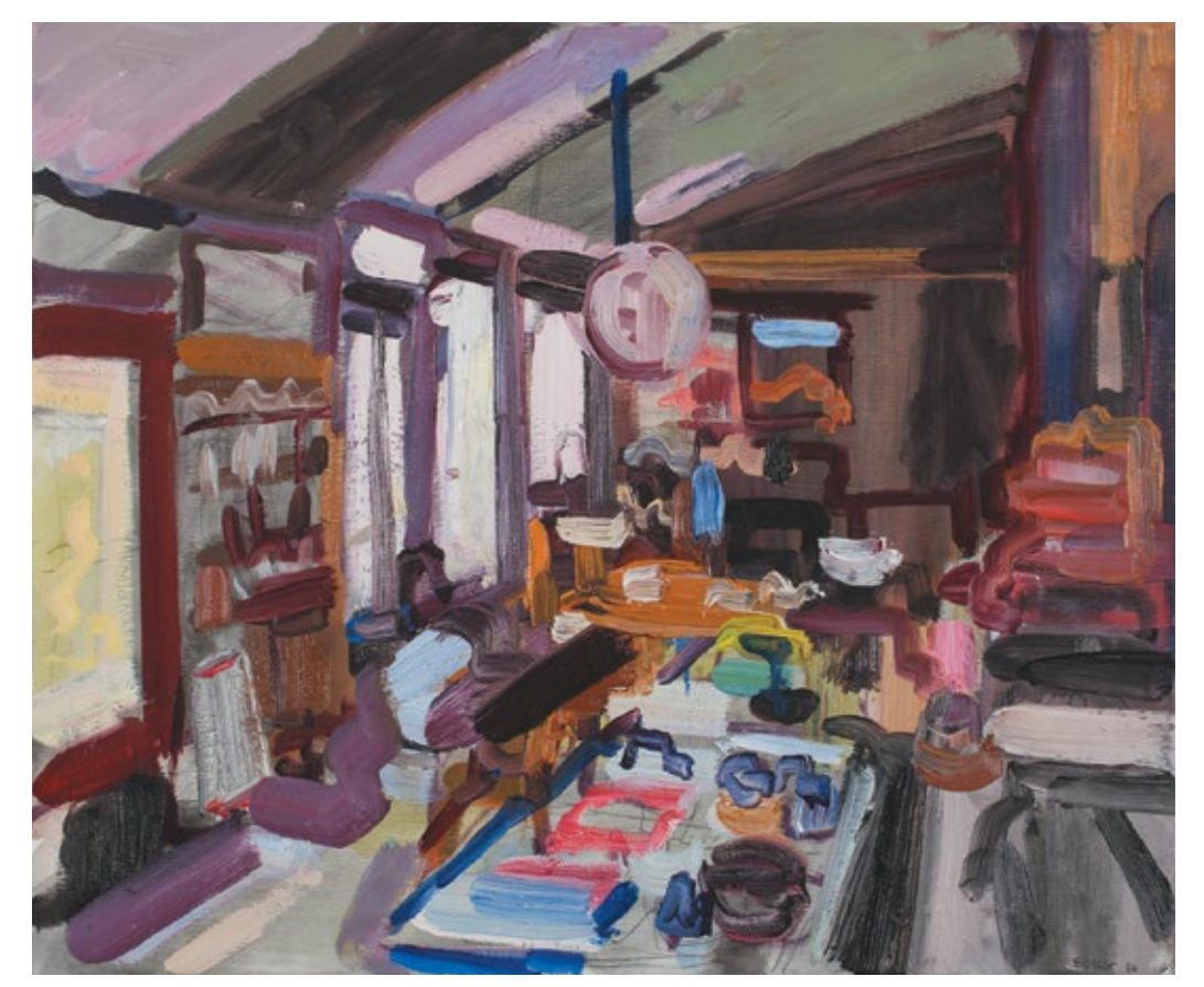
Elisabeth's Dining Table 2014 Oil on canvas 50 x 60cms