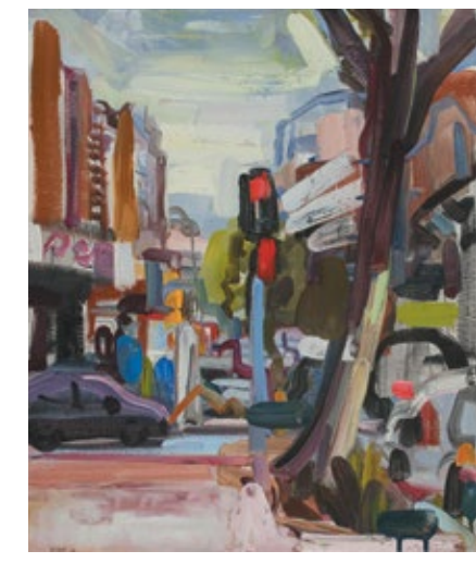
Wollongong C.B.D. Under Construction 2014 Oil on canvas 60 x 50cms