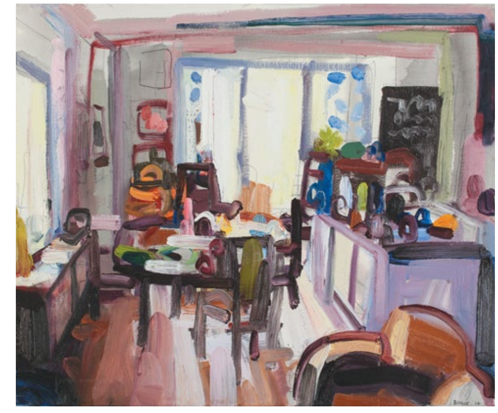
Messy Dining Table 2014 Oil on canvas 50 x 60cms