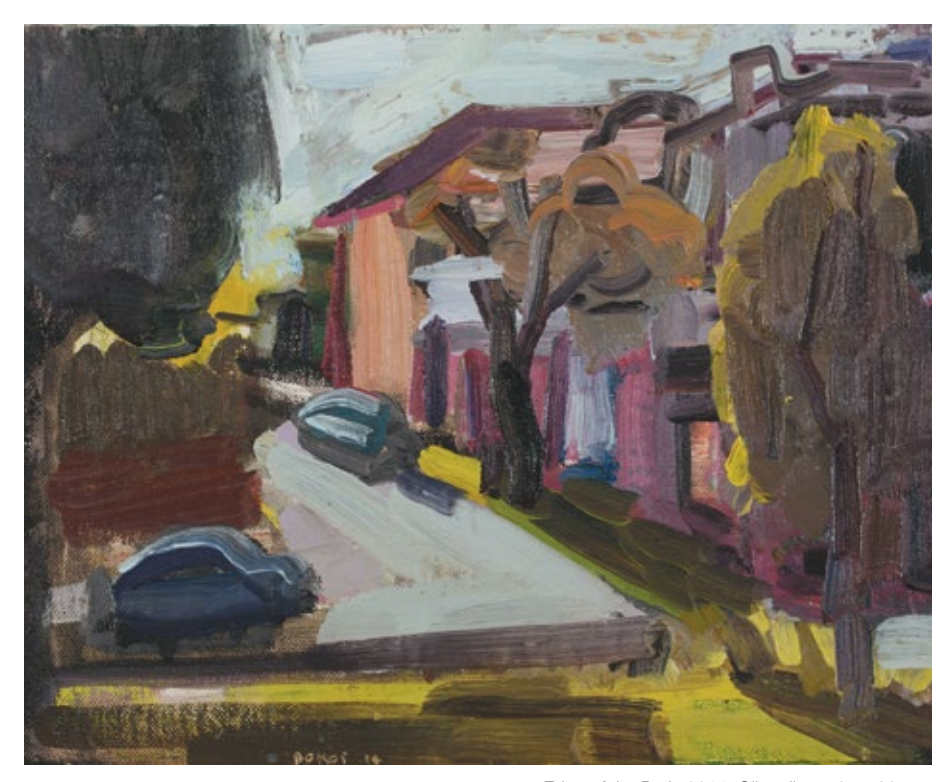
Edge of the Park 2014 Oil on linen 25 x 30cms