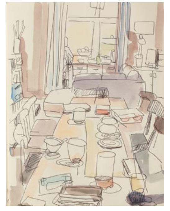
Myer House Interior 2014 Ink and watercolour on paper 35.5 x 28cms