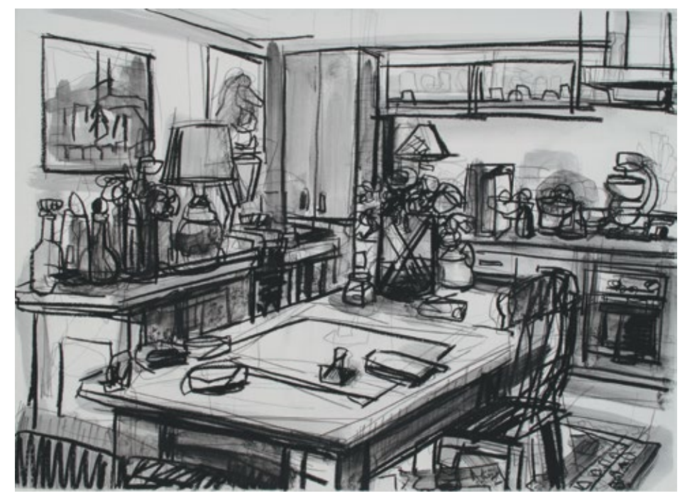
Mother in Law's Kitchen 2014 Charcoal on paper 56 x 76cms