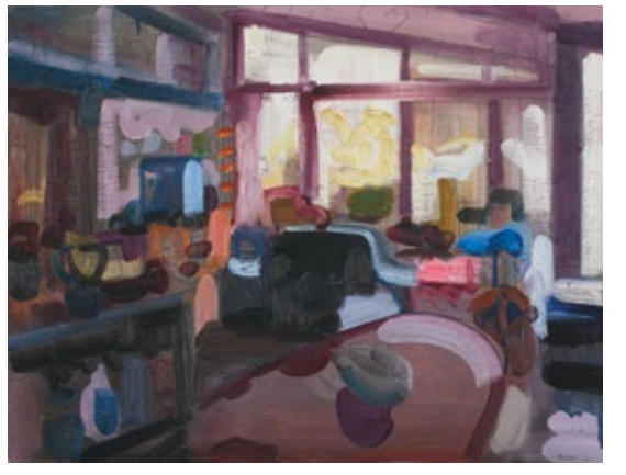
Sallie's Table 2014 Oil on linen 52 x 66cms