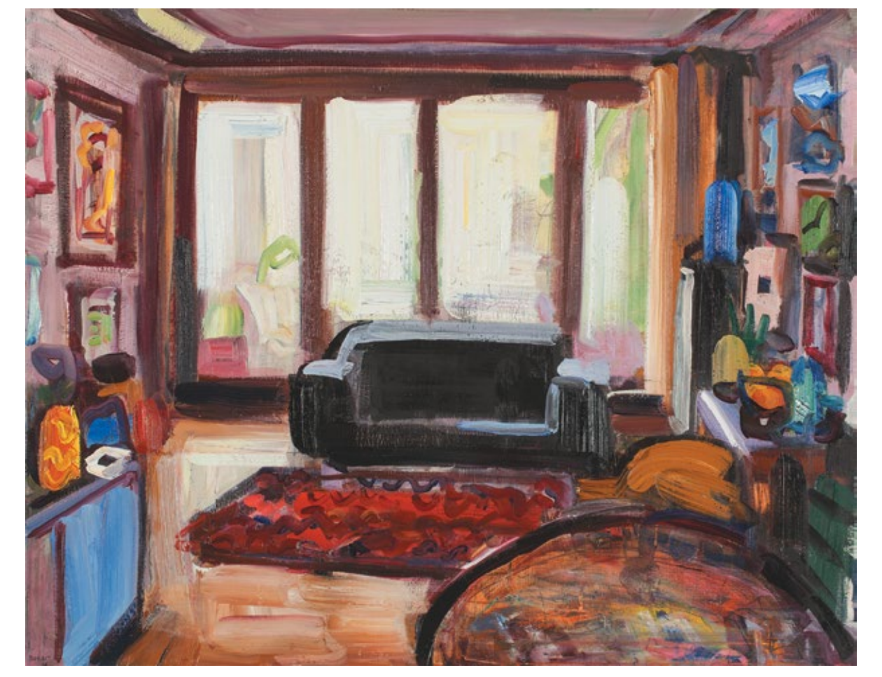
The Cleared Table 2015 Oil on canvas 80 x 105cms