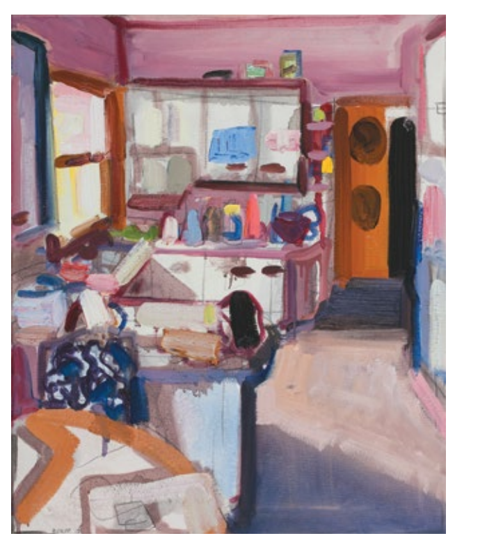
Robbie & Meg's Kitchen Oil on canvas 60 x 50cms