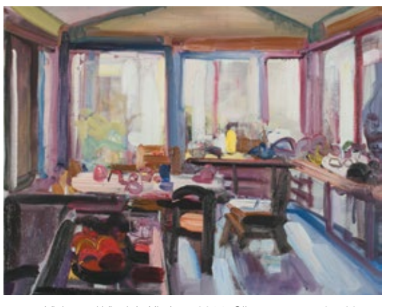
Vicky and Vinnie's Kitchen 2014 Oil on canvas 50 x 60cms