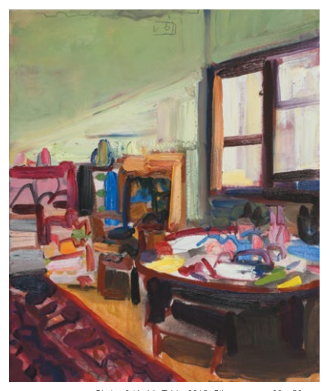
Clarice & Herb's Table 2015 Oil on canvas 60 x 50cms