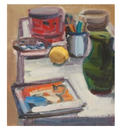
The Green Jug