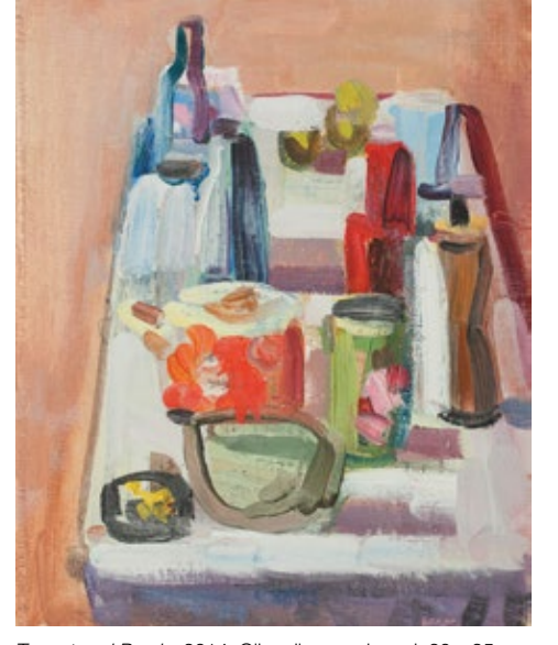
Teapot and Bowls 2014 Oil on linen on board 30 x 25cms