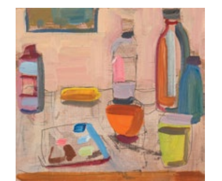
Bottles and Bowls