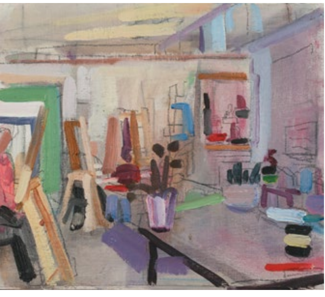
The Classroom 2014 Oil on linen on board 30 x 35cms