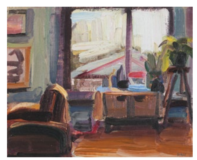
Good Neighbours 2014 Oil on linen 25 x 30cms