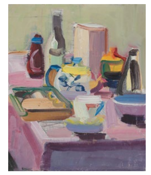
Two Teapots 2014 Oil on linen on board 30 x 25cms