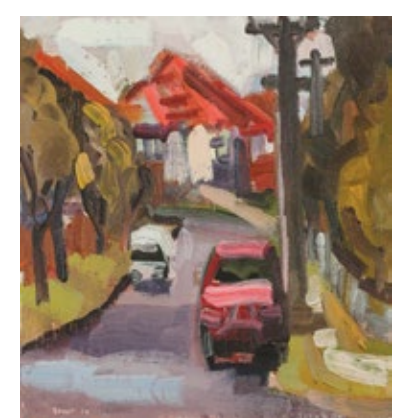
Beside the School