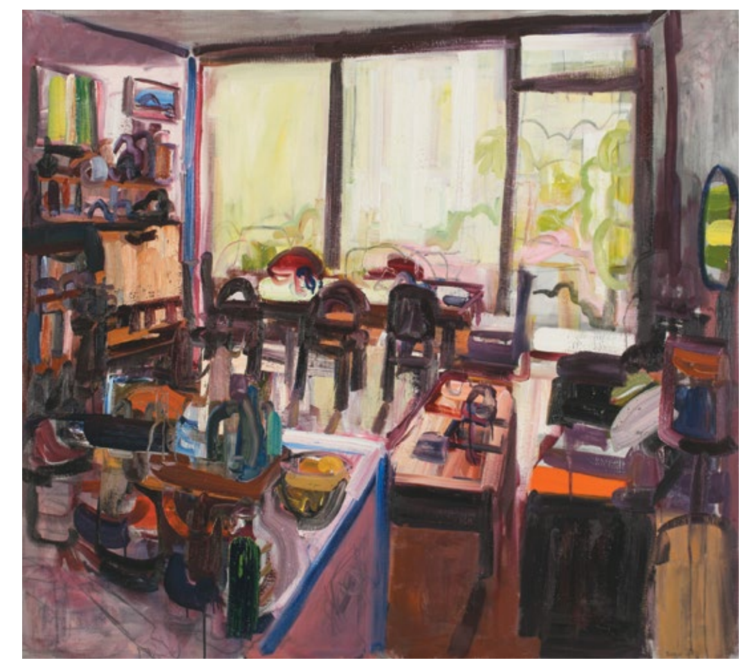
Lizzie & Ness' Lounge Room 2014 Oil on linen 137 x 152cms