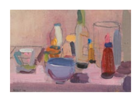
The Red Bottle