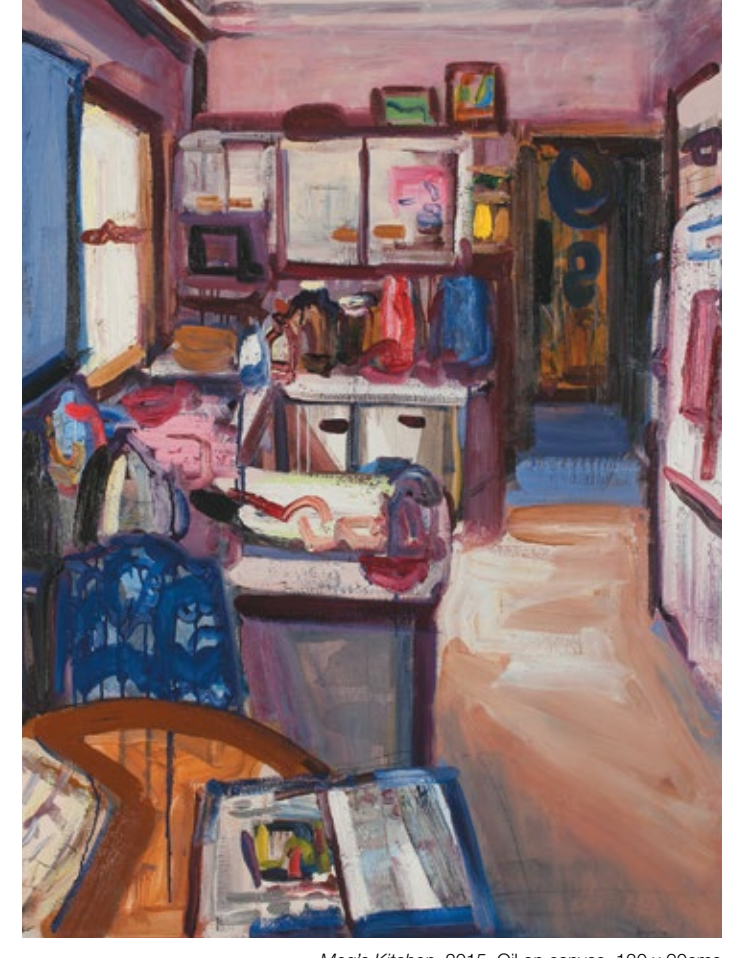
Meg's Kitchen 2015 Oil on canvas 120 x 90cms