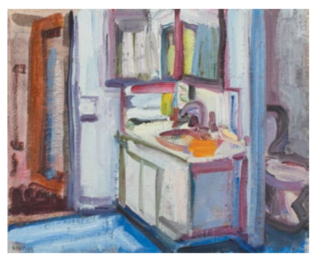
The Bathroom Cabinet 2014 Oil on linen 25 x 30cms