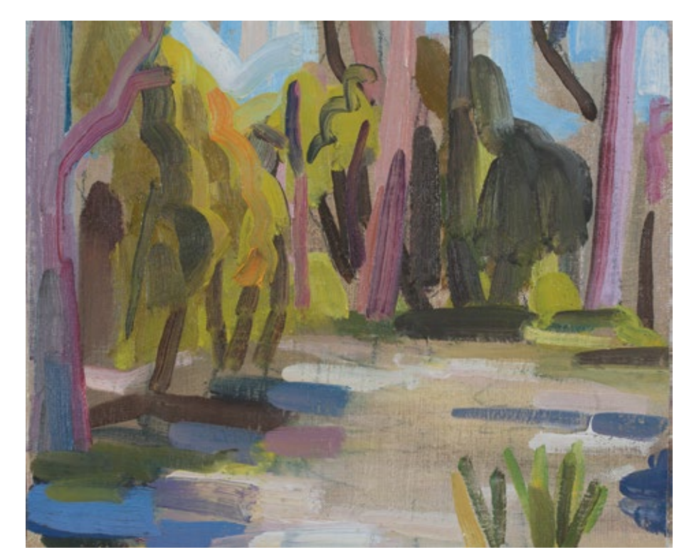
Under The Trees 2014 Oil on linen 25 x 30cms