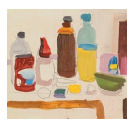
Turpentine and Medium