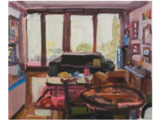
The Dining Table 2014 Oil on canvas 50 x 60cms