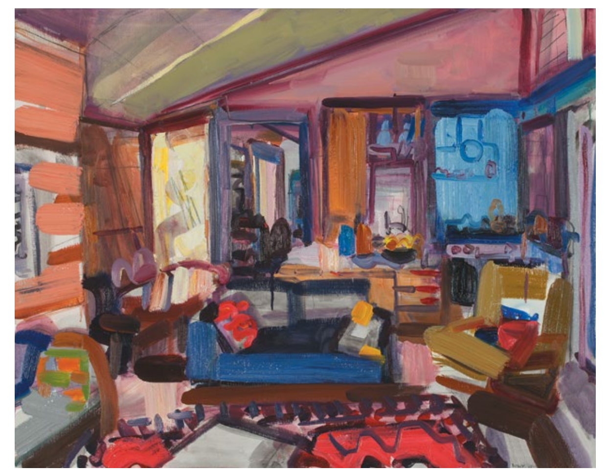
The Red Rug 2015 Oil on canvas 80 x 105cms