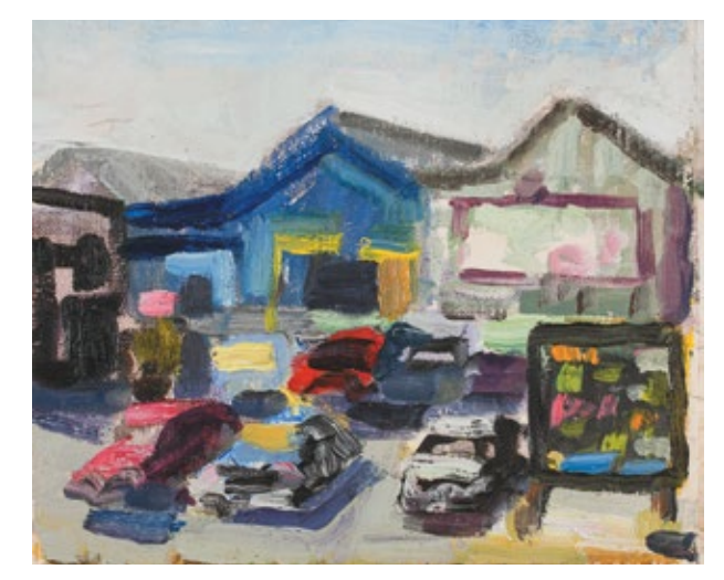
The Fruit Barn 2014 Oil on linen 25 x 30cms