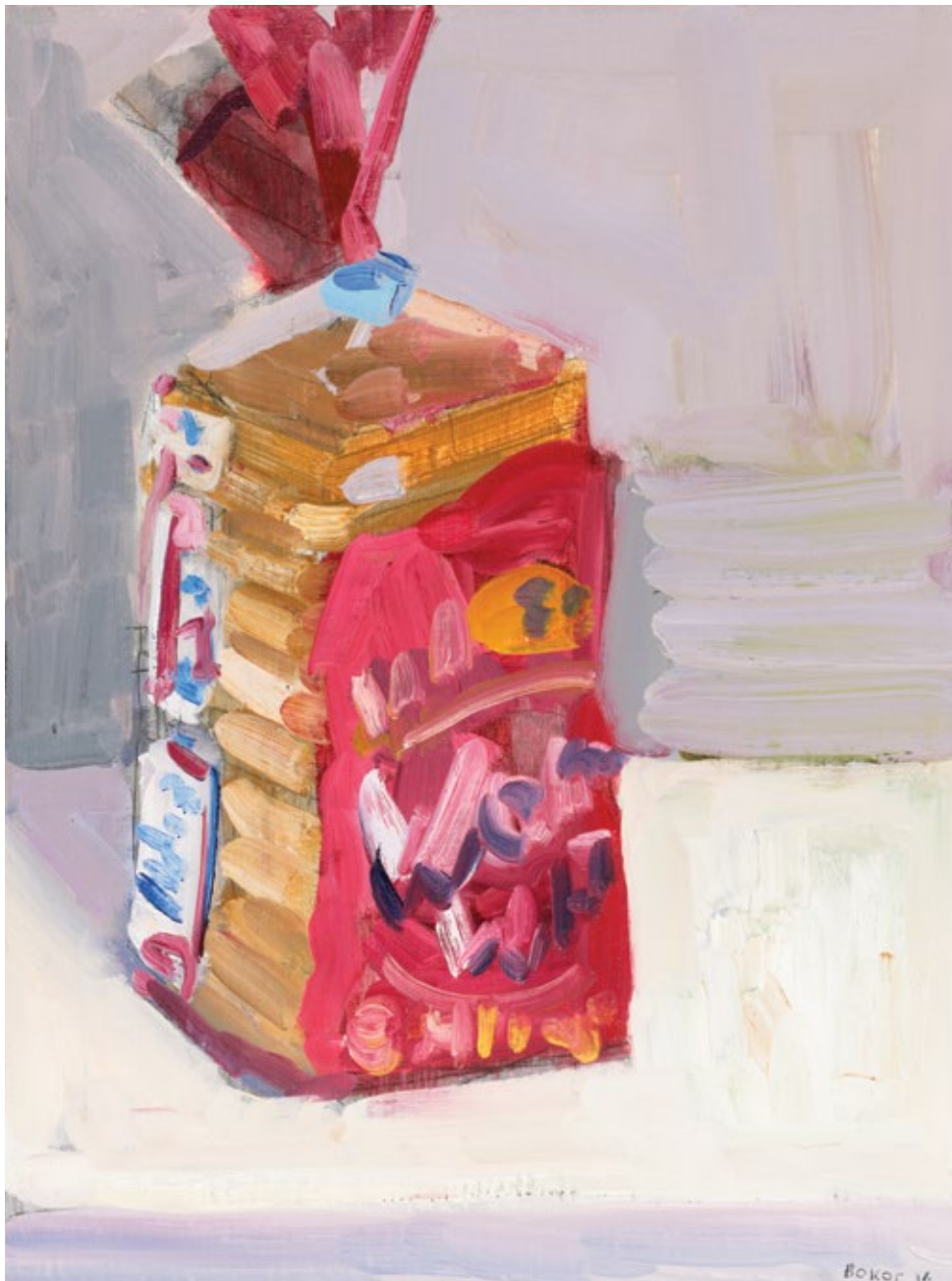
Wonder White 2016 oil on linen on board 61x46cm