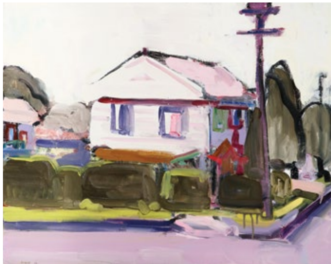
Corner House 2016 oil on canvas 60x76cm