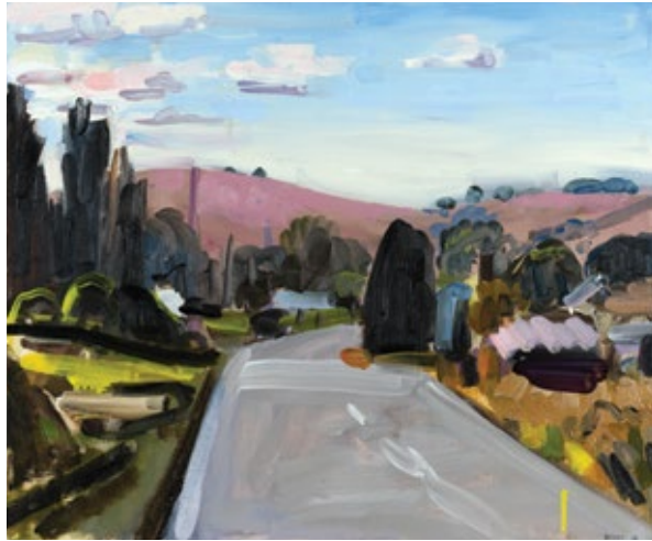
The Back Road to Goulburn 2016 oil on canvas 51x61cm