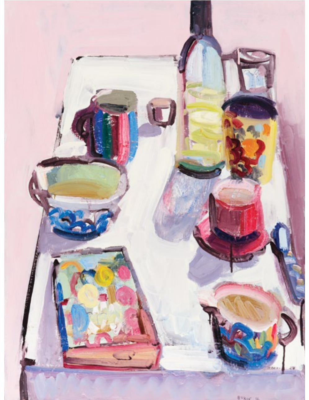
Still life with wine 2016 oil on linen 80x60cm