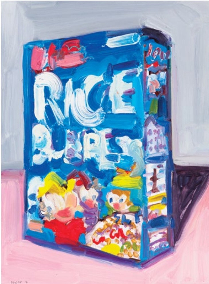
Snap crackle and pop 2016 oil on board 61x47cm