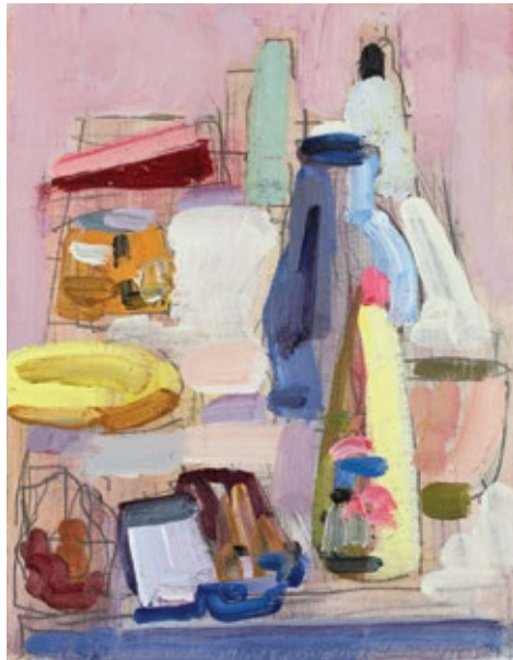
The yellow plate 2016 oil on linen on board 21x27cm