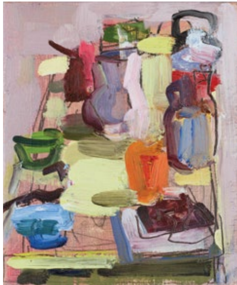
The green tablecloth 2016 oil on board 17x13cm