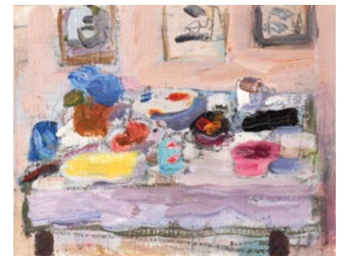
Side table 2016 oil on linen on board 13x17cm