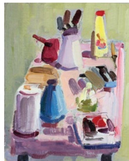
The red oil can 2016 oil on linen & board 25x30cm

Everyday World 8 November – 3 December 2016