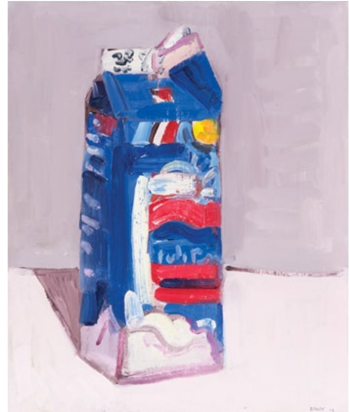
Milk 2016 oil on canvas 61x51cm