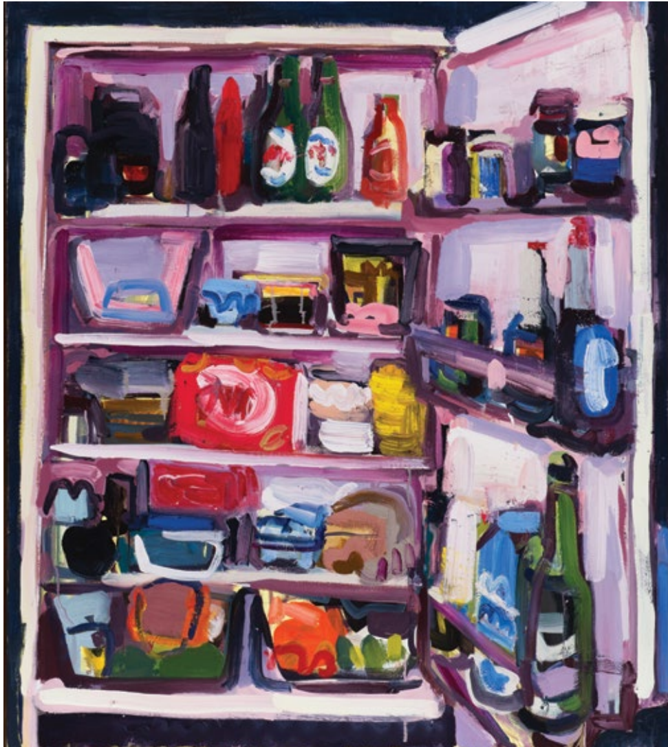
The source 2016 oil on canvas 122x107cm