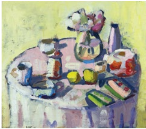
Bouquet and lemons 2016 oil on linen on board 35x40cm