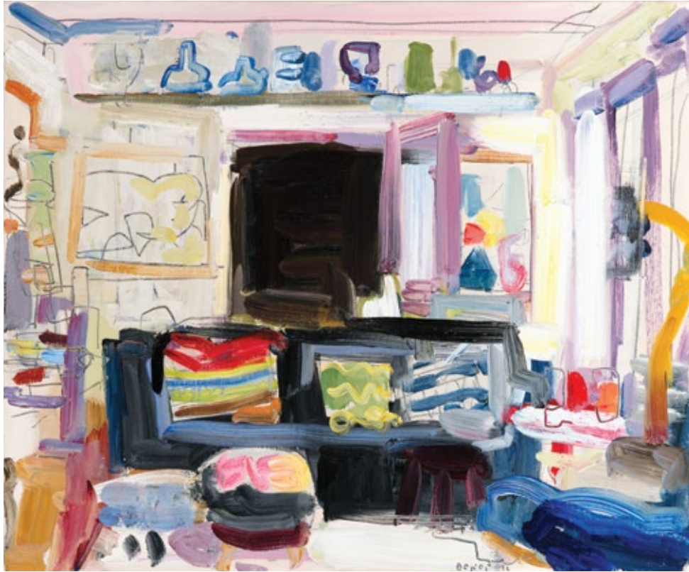
Scandinavia interior 2016 oil on canvas 51x61cm