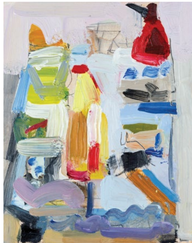
Jiff and oil can 2016 oil on board 26x20cm