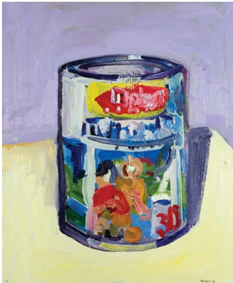
Milk powder 2016 oil on canvas 61x51cm