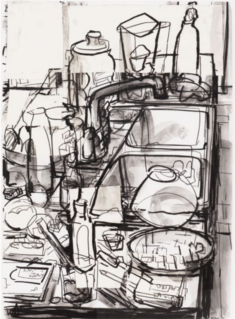
The kitchen sink 2016 charcoal, wash and collage 76x56cm