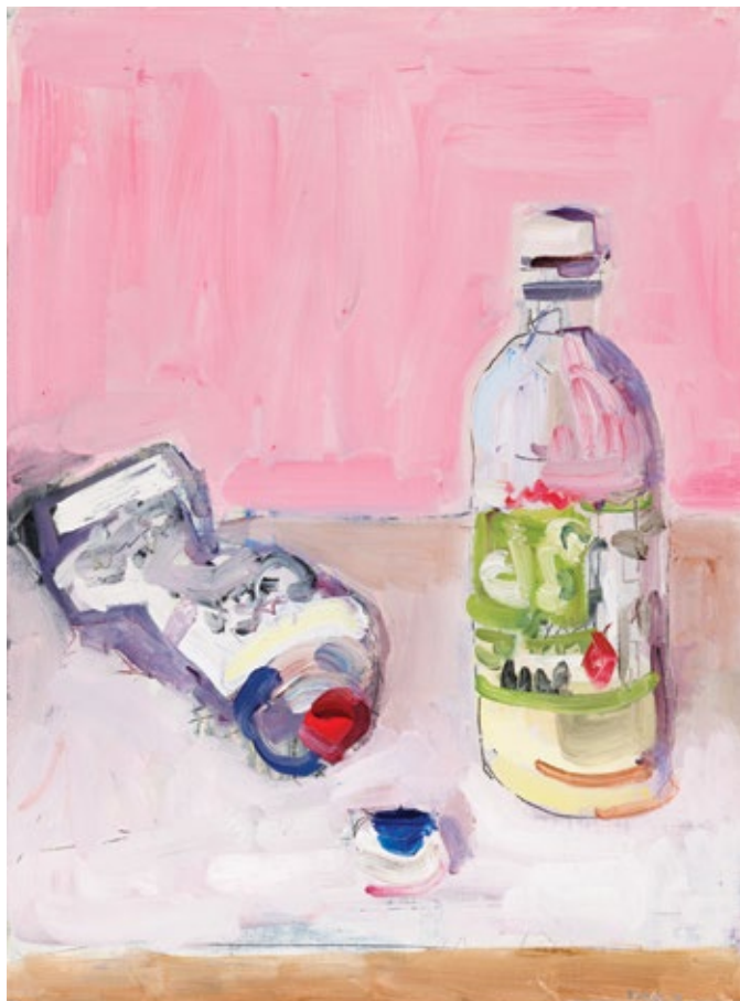
The wrong lid 2016 oil on linen on board 61x46cm