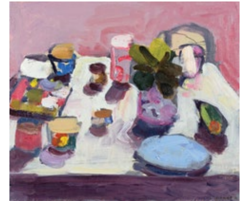
Blue plate still life 2016 oil on linen on board 27x30cm