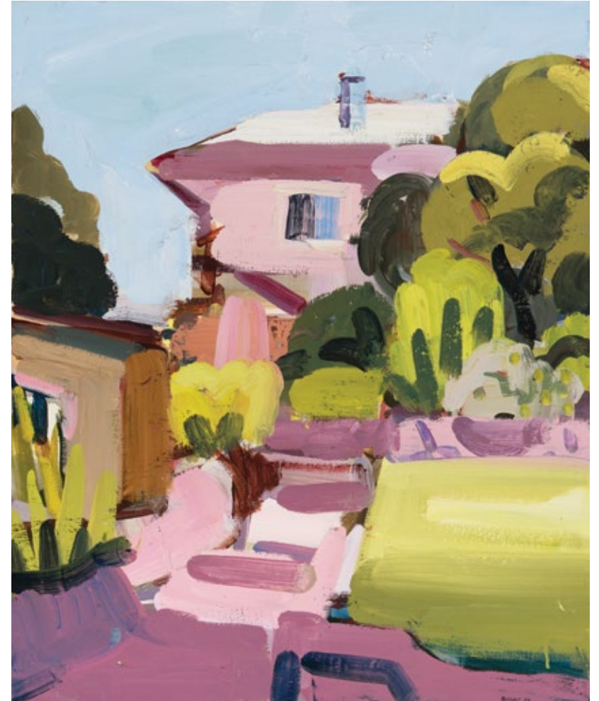
Up the garden path 2016 oil on canvas 61x51cm