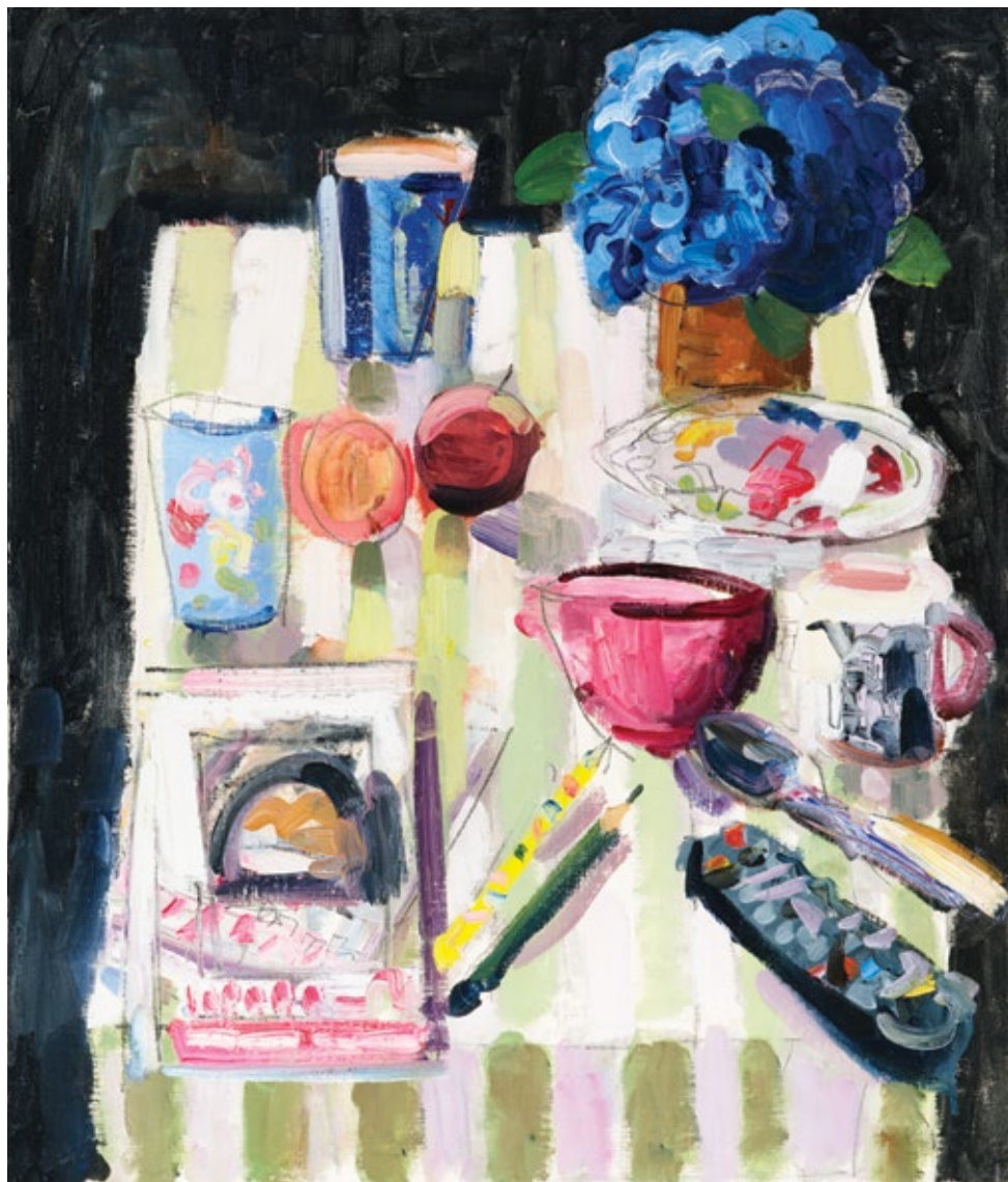
Hydrangeas 2016 oil on linen on board 70x60cm