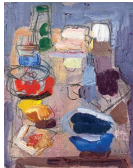
Purple still life 2016 oil on linen on board 17x13cm