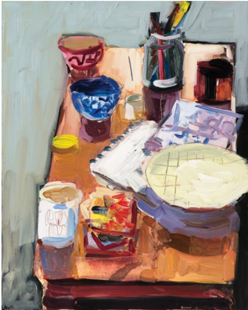
Still life with pen jar 2016 oil on canvas 76x60cm