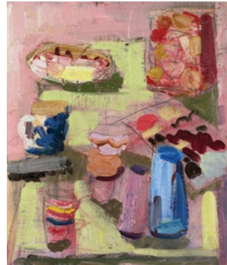
Vase and crackers 2016 oil on linen on board 26x30cm