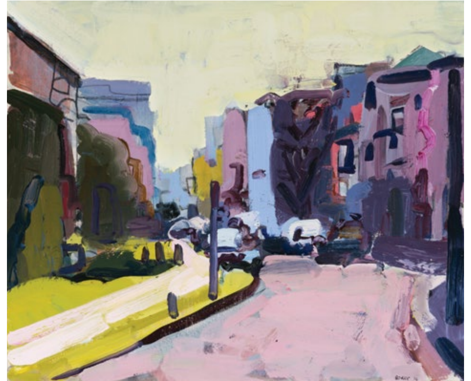
The centre of town 2016 oil on linen 50x60cm