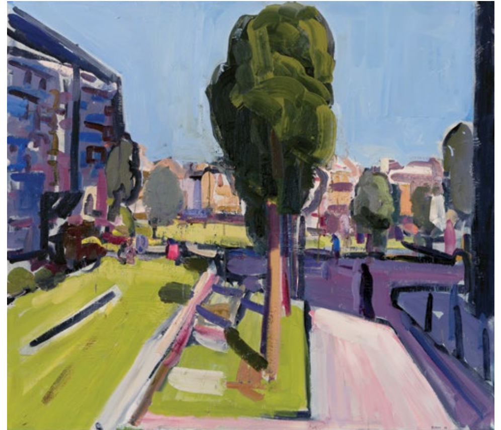
Afternoon Walk 2016 oil on canvas 107x122cm