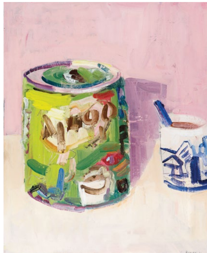
Hot chocolate 2016 oil on canvas 61x51cm