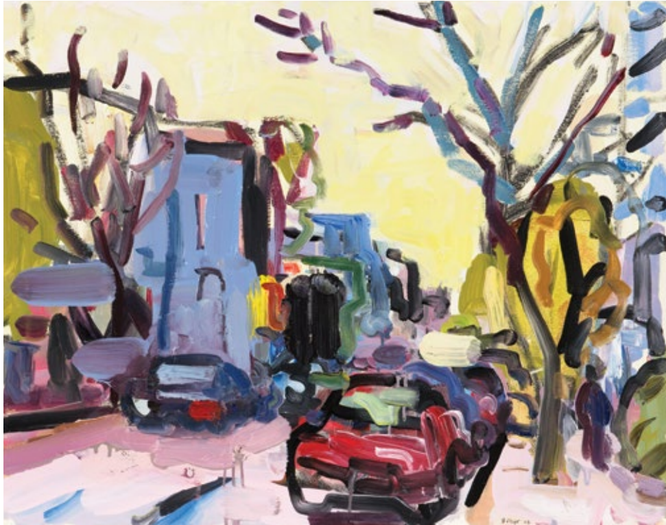
Winter sky 2016 oil on canvas 51x61cm