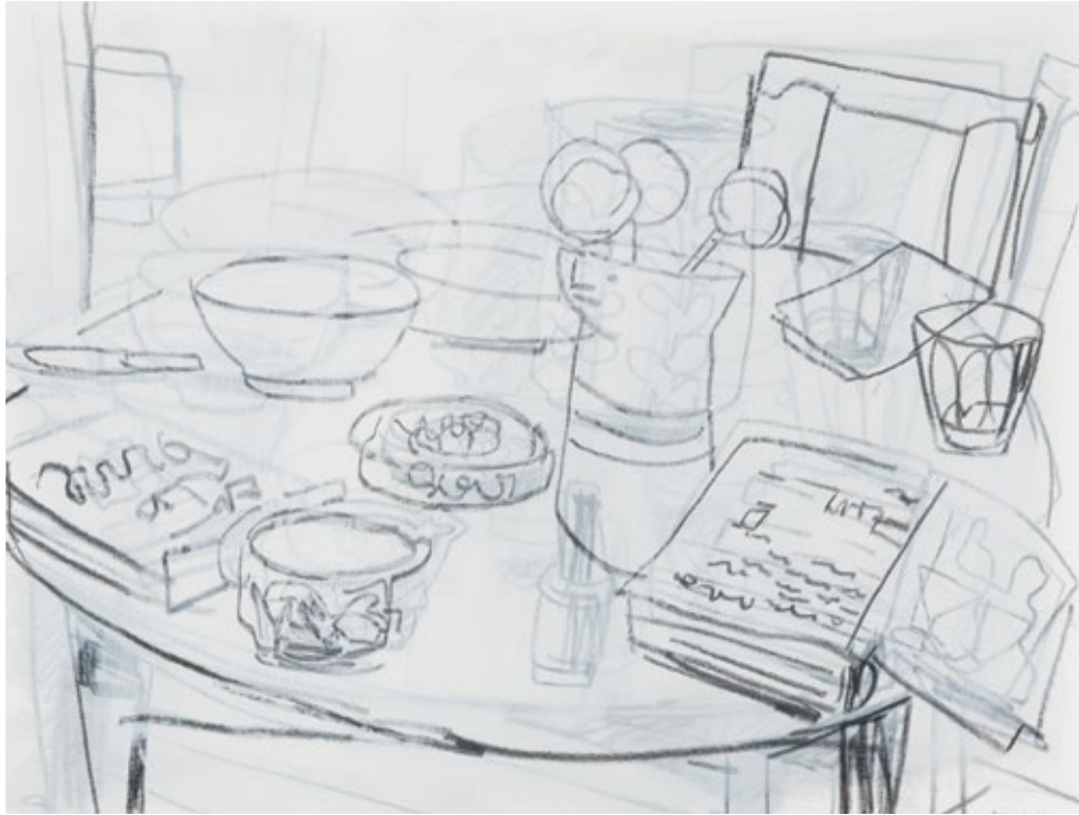
Vanessa's vase 2016 graphite and gesso 50x65cm