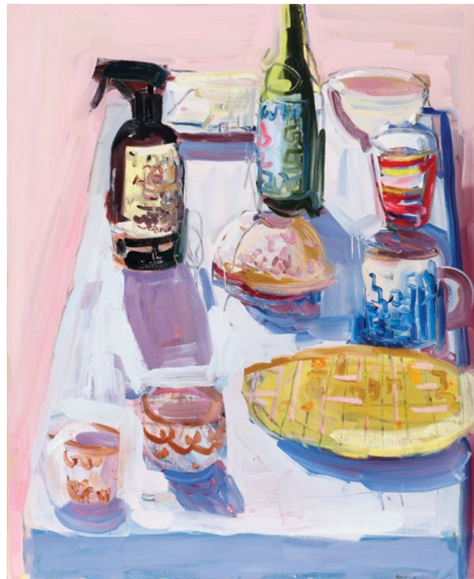
Still life with mineral water 2016 oil on canvas 137x112cm