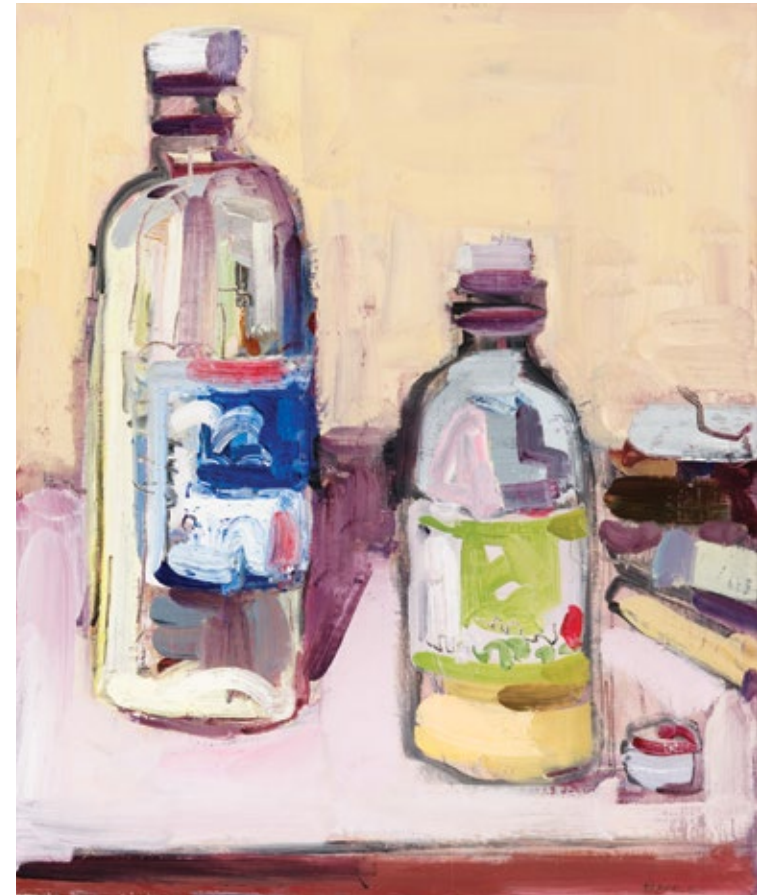
Turpentine and medium 2016 oil on board 61x51cm