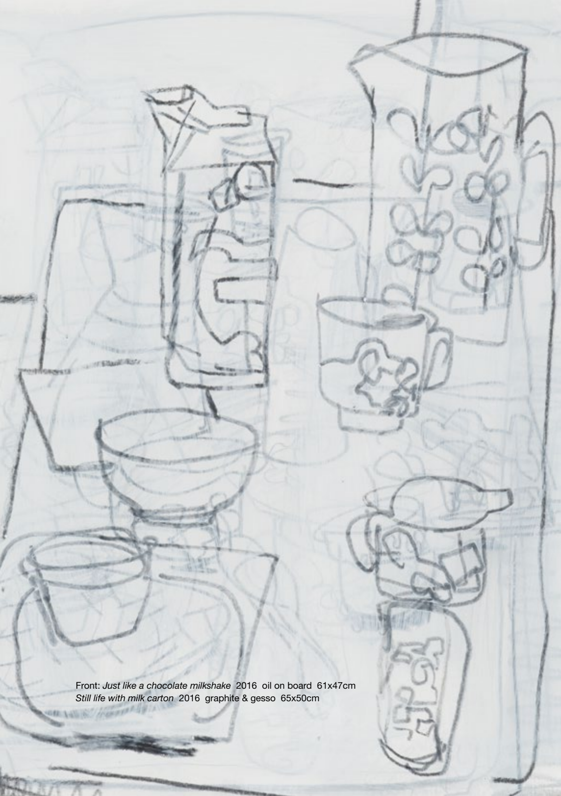
Front: Just like a chocolate milkshake 2016 oil on board 61x47cm Still life with milk carton 2016 graphite & gesso 65x50cm