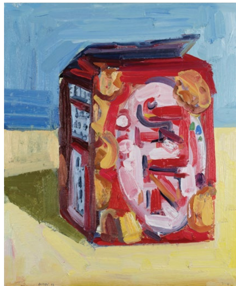
This page: Crackers 2016 oil on canvas 61x51cm Opposite page: Temptation 2016 oil on linen on board 61x46cm