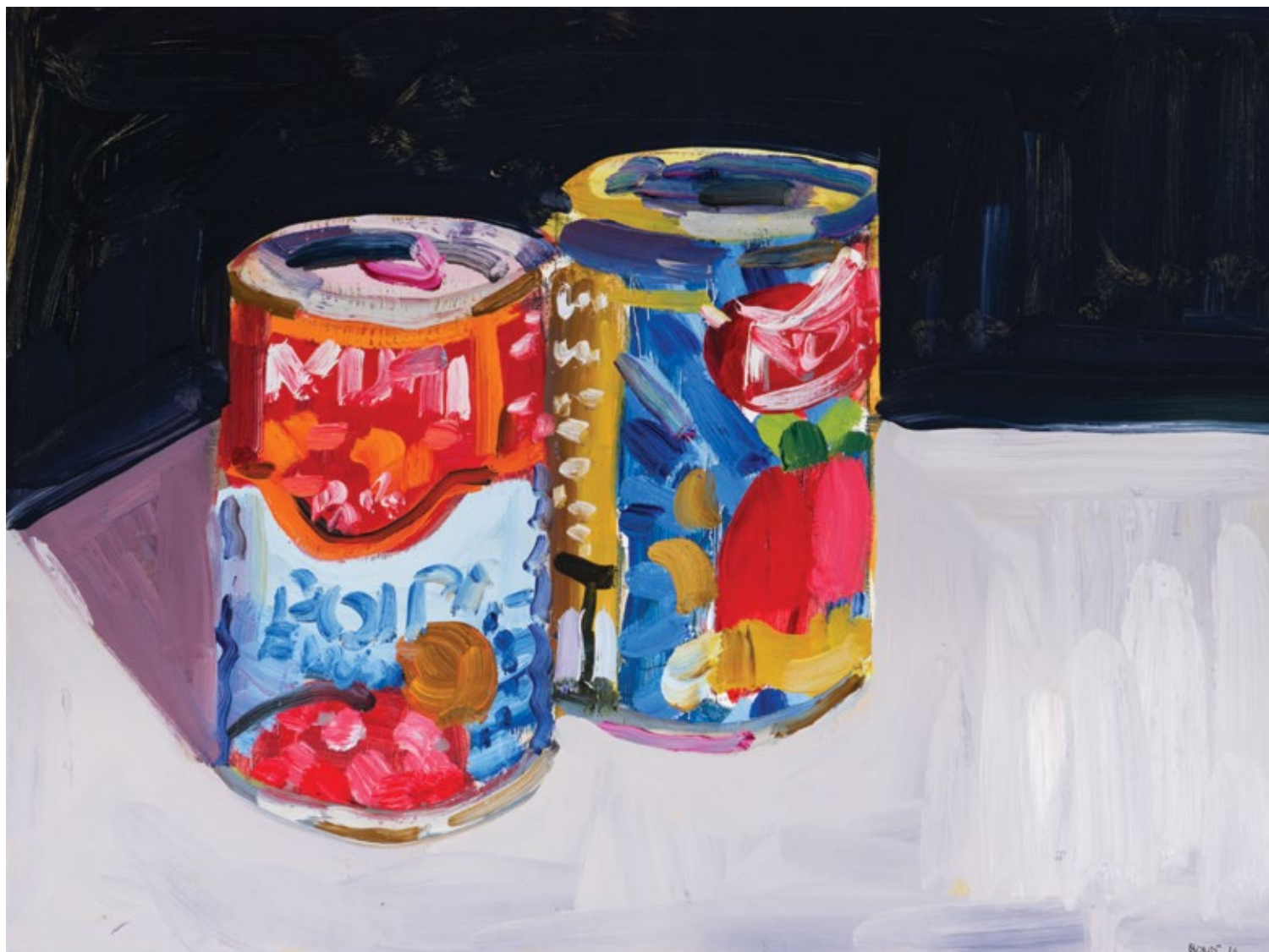
Two cans of tomatoes 2016 oil on board 46x61cm

The more you look at something familiar the stranger it seems.