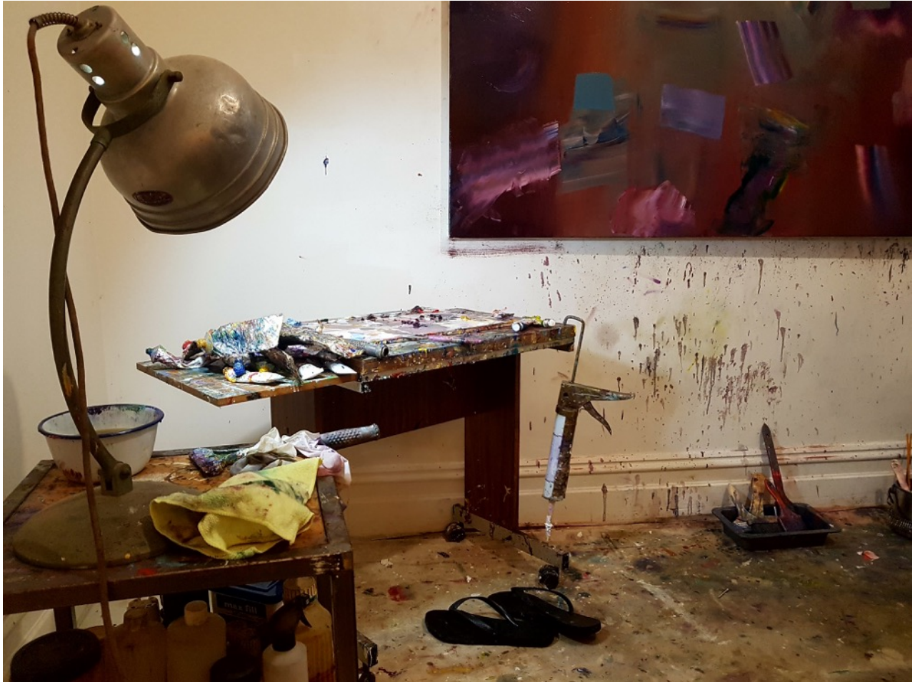
Telly Tu'u Sydney Studio 2017