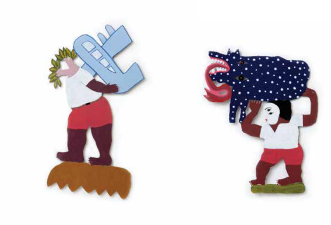
Left: Aeroplane 2017 enamel on aluminium 43 x 25 cm Right: Blue dog 2017 enamel on aluminium 30 x 25 cm