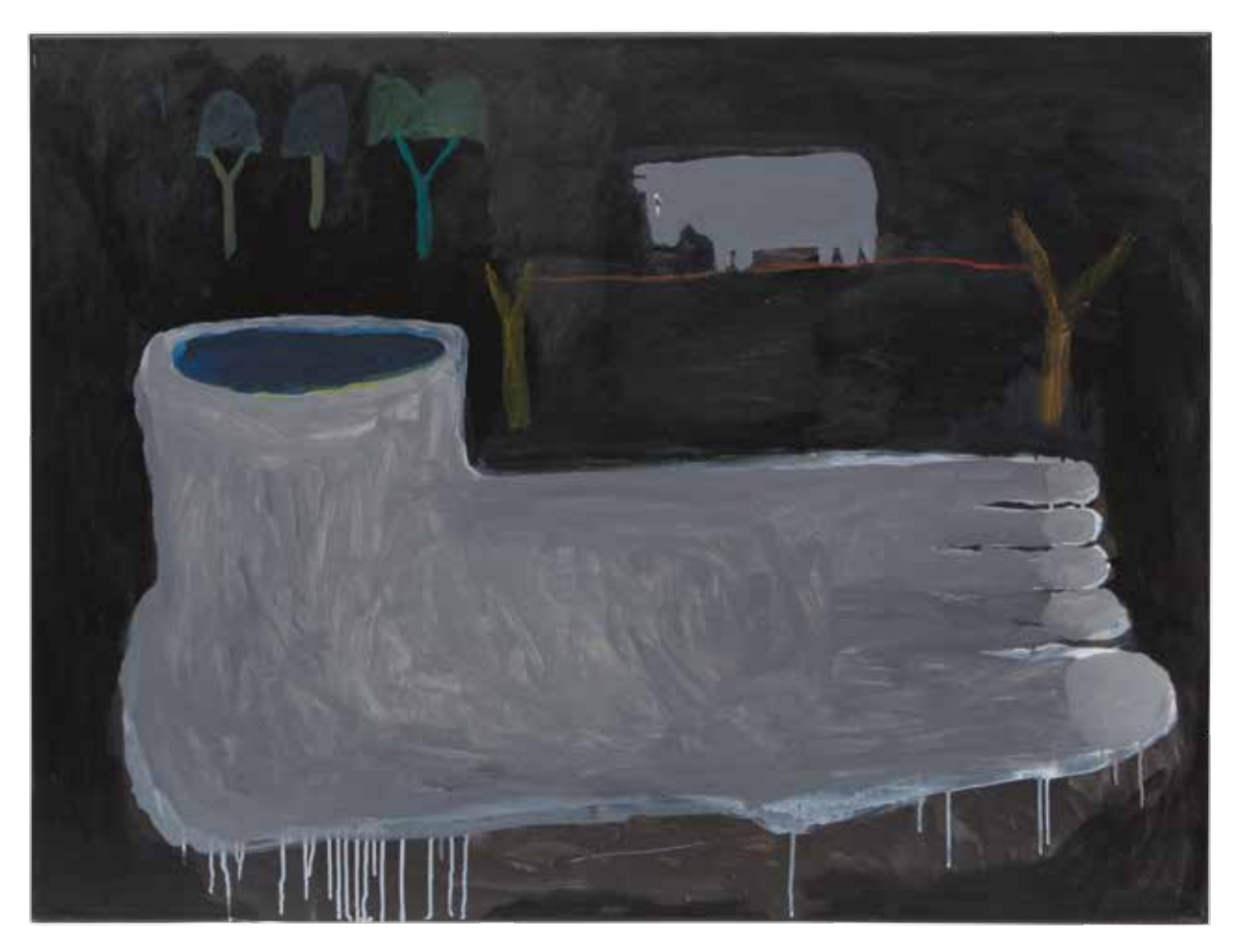
Big feet small animal 2018 acrylic on linen 89.5 x 120 cm