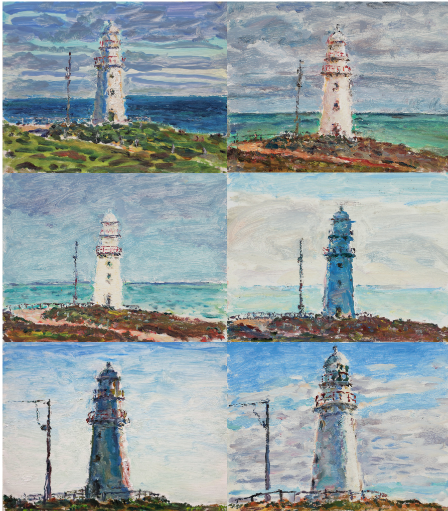
Corny Point Lighthouse Series 2021 oil on marine ply 16 x 21cm (each)