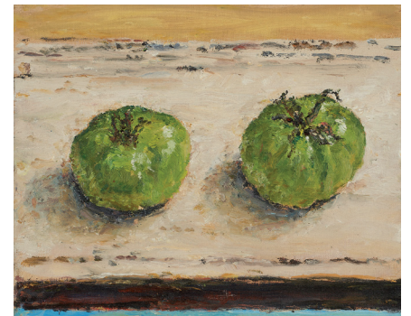
TOP ROW Annaliese Tinned Chick Peas 2020 oil on linen 19 x 24cm Trevally on Zambian Cloth 2020 oil on linen 30.5 x 38cm MIDDLE ROW Sugar Bananas, Coconut Milk and Red Watering Can 2020 oil on linen 25 x 30cm Sugar Bananas 2020 oil on linen 25 x 30cm BOTTOM ROW Late Tomatoes, Murrays Lane 2020 oil on linen 19 x 24cm Green Tomatoes, Murrays Lane 2020 oil on linen 19 x 24cm