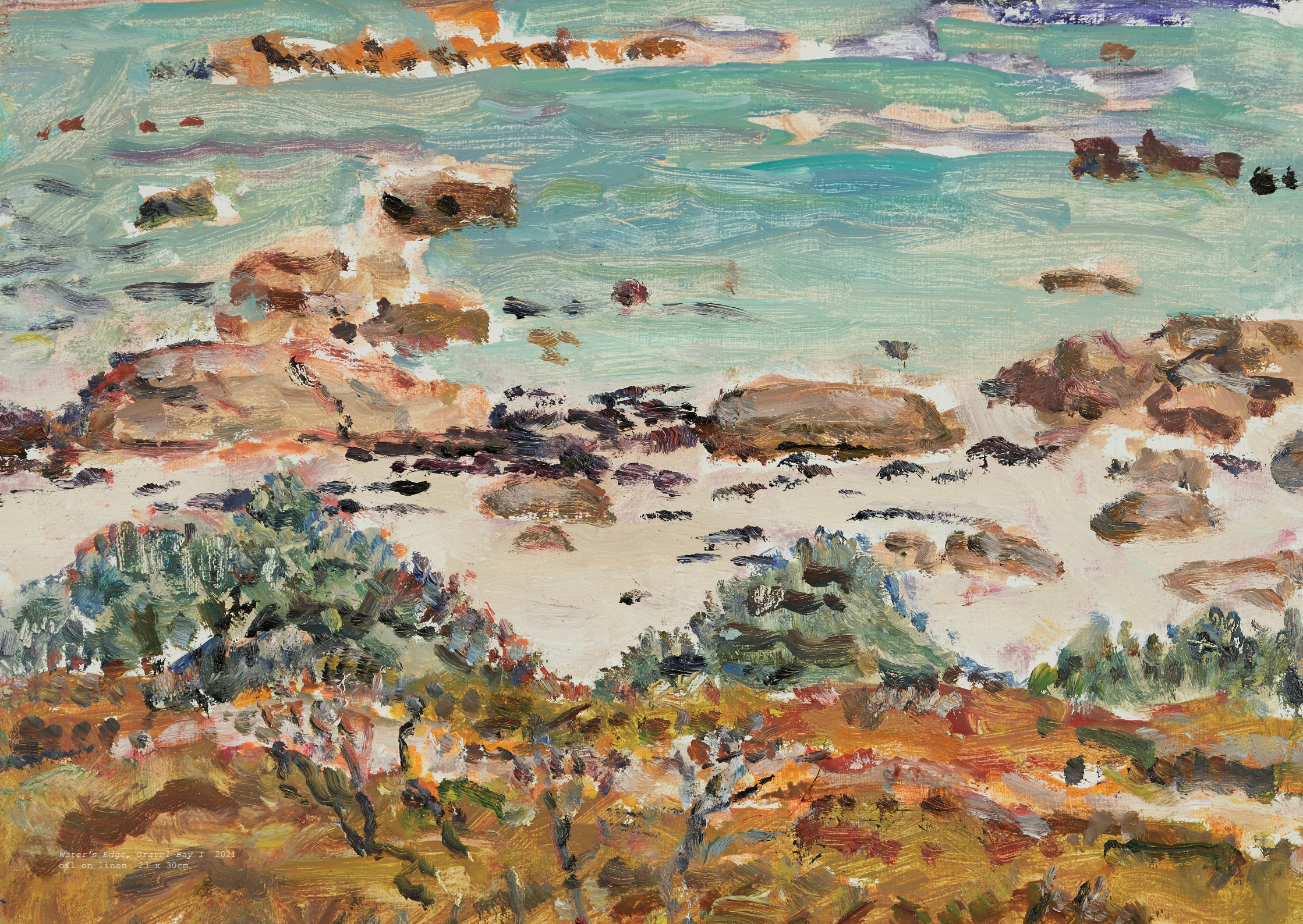
Water's Edge, Gravel Bay I 2021 oil on linen 23 x 30cm