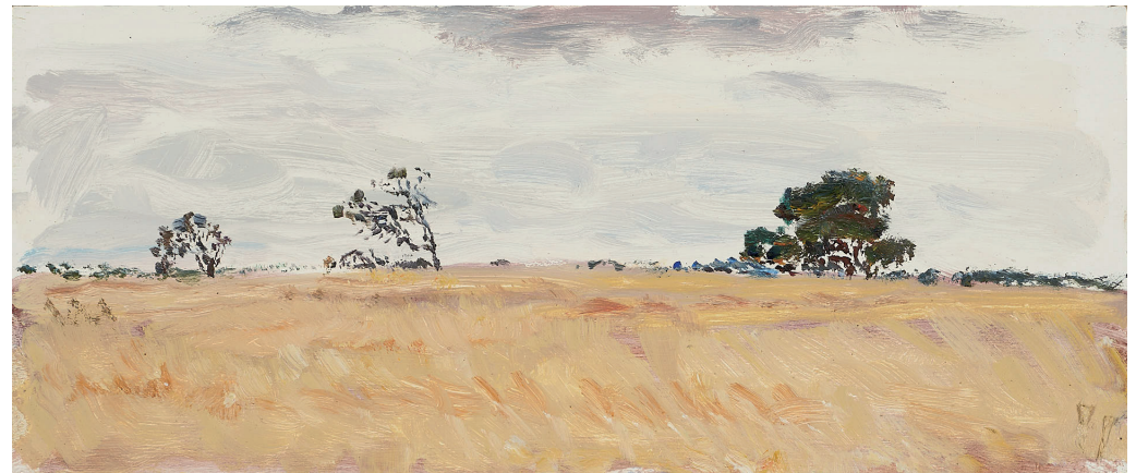
Windy Paddock, near The Pines 2021 oil on marine ply 13 x 30cm