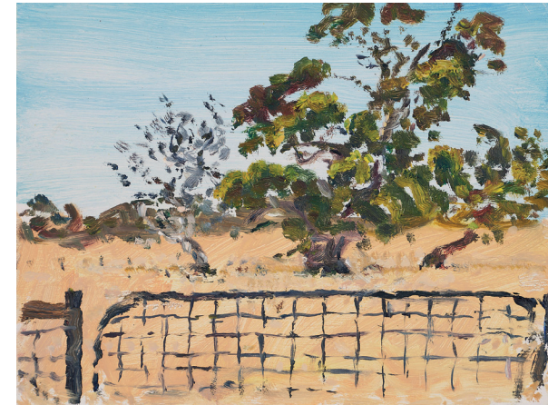
Paddock Gate, Ashbourne 2021 oil on marine ply 16 x 21cm