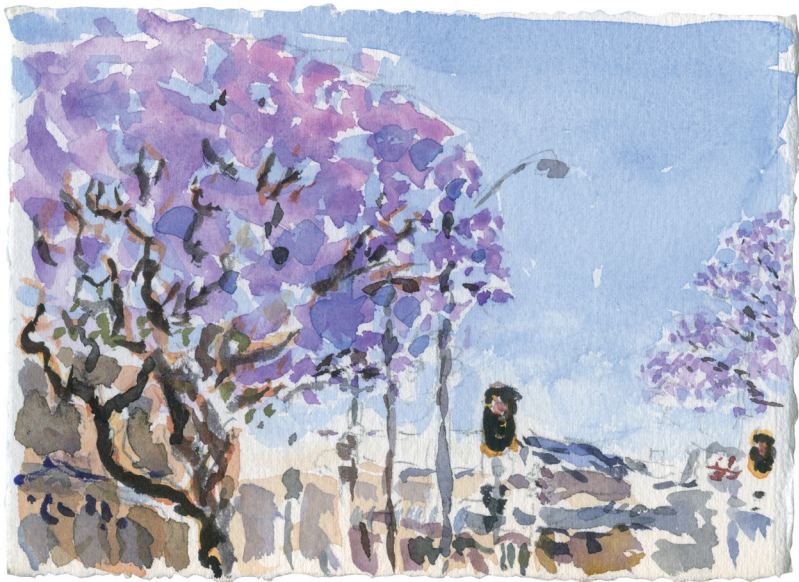
Jacarandas, Morphett Street I 2019 watercolour on paper 11.5 x 16cm