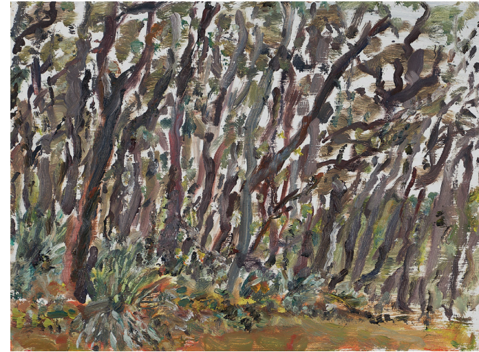
Stringybark Forest, Deep Creek 2021 oil on marine ply 16 x 21cm