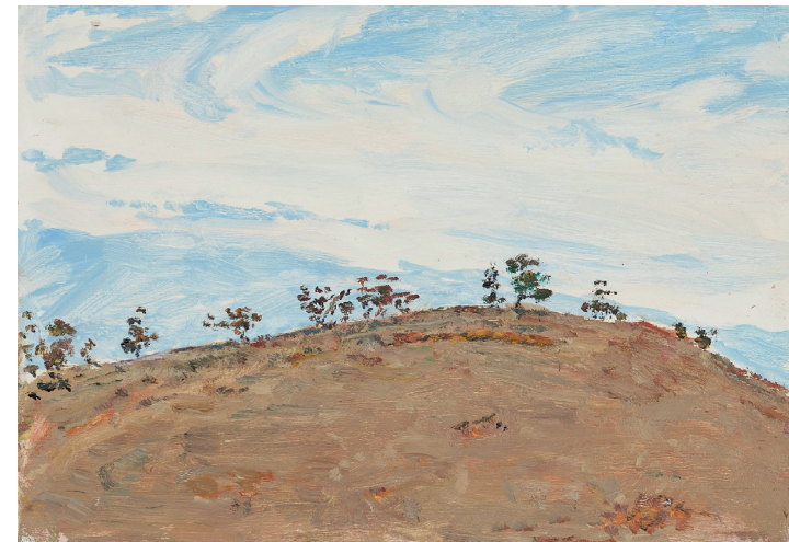
Treeline, Bull Creek Road I 2020 oil on marine ply 21 x 30cm