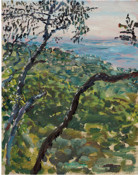
The View out from Cleland 2020 oil on marine ply 24 x 19cm