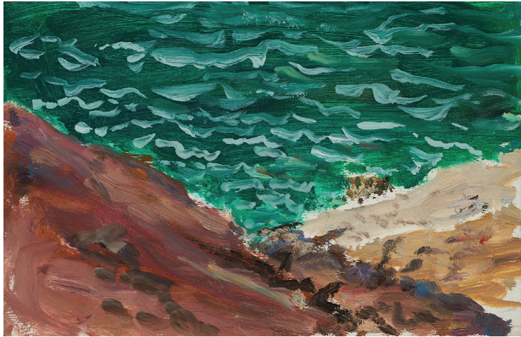
Gully to the Sea, Maslins I 2020 oil on wood panel 13 x 20cm