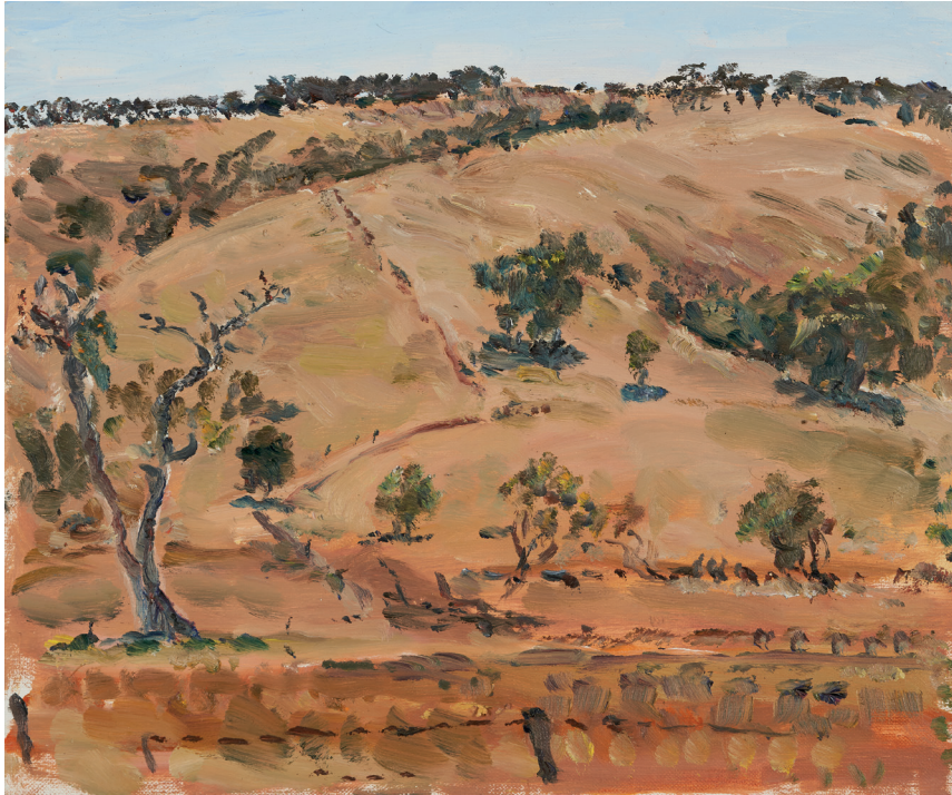
Summer Paddocks, Ashbourne 2021 oil on linen 25 x 30cm