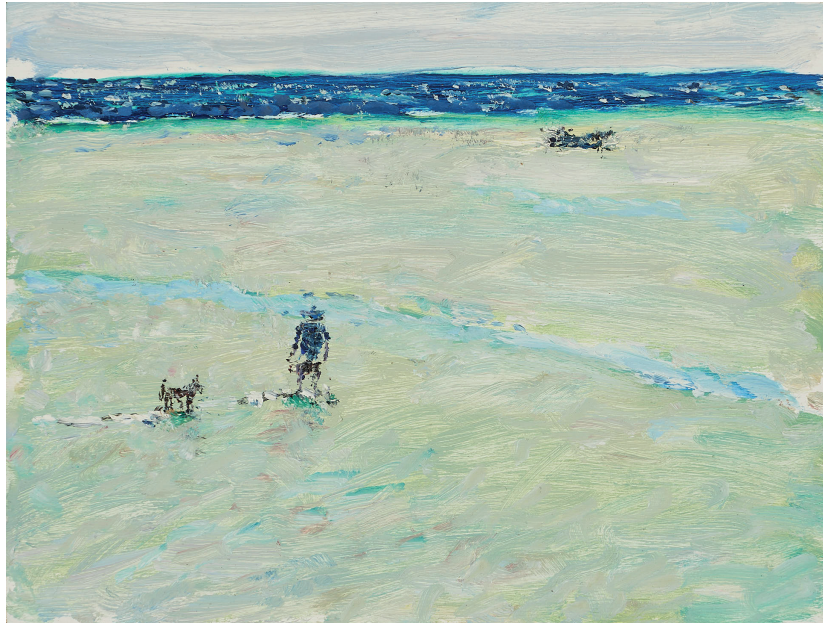
Wading out to the Boat, The Pines 2021 oil on marine ply 16 x 21cm