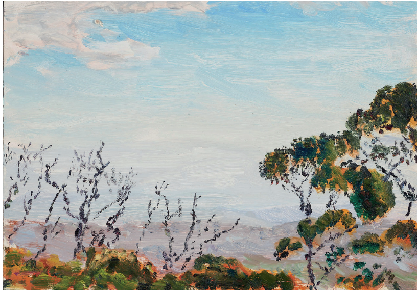
Treetops, Mount Lofty VI 2020 oil on marine ply 21 x 30cm