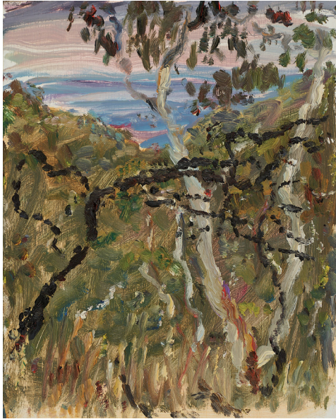
Forked Tree, Cleland 2020 oil on marine ply 21.5 x 17cm