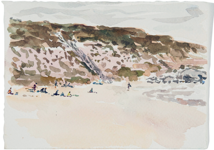
Berry Bay, Looking East 2021 watercolour on paper 11.5 x 16cm