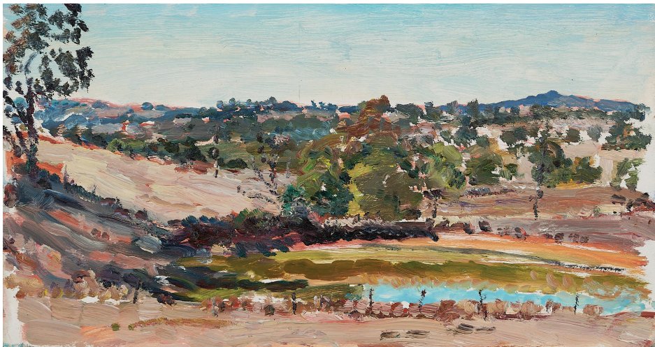
TOP Afternoon Paddocks near Laura 2021 oil on marine ply 13 x 30cm BOTTOM Dam near Echunga, Afternoon Light 2019 oil on wood panel 17 x 32cm RIGHT Gums and Wheat Paddock, Cattle Track Road 2021 oil on linen 23 x 30cm