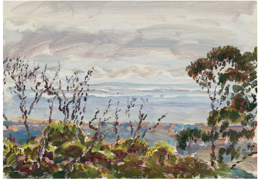
Treetops, Mount Lofty VIII 2020 oil on marine ply 21 x 30cm