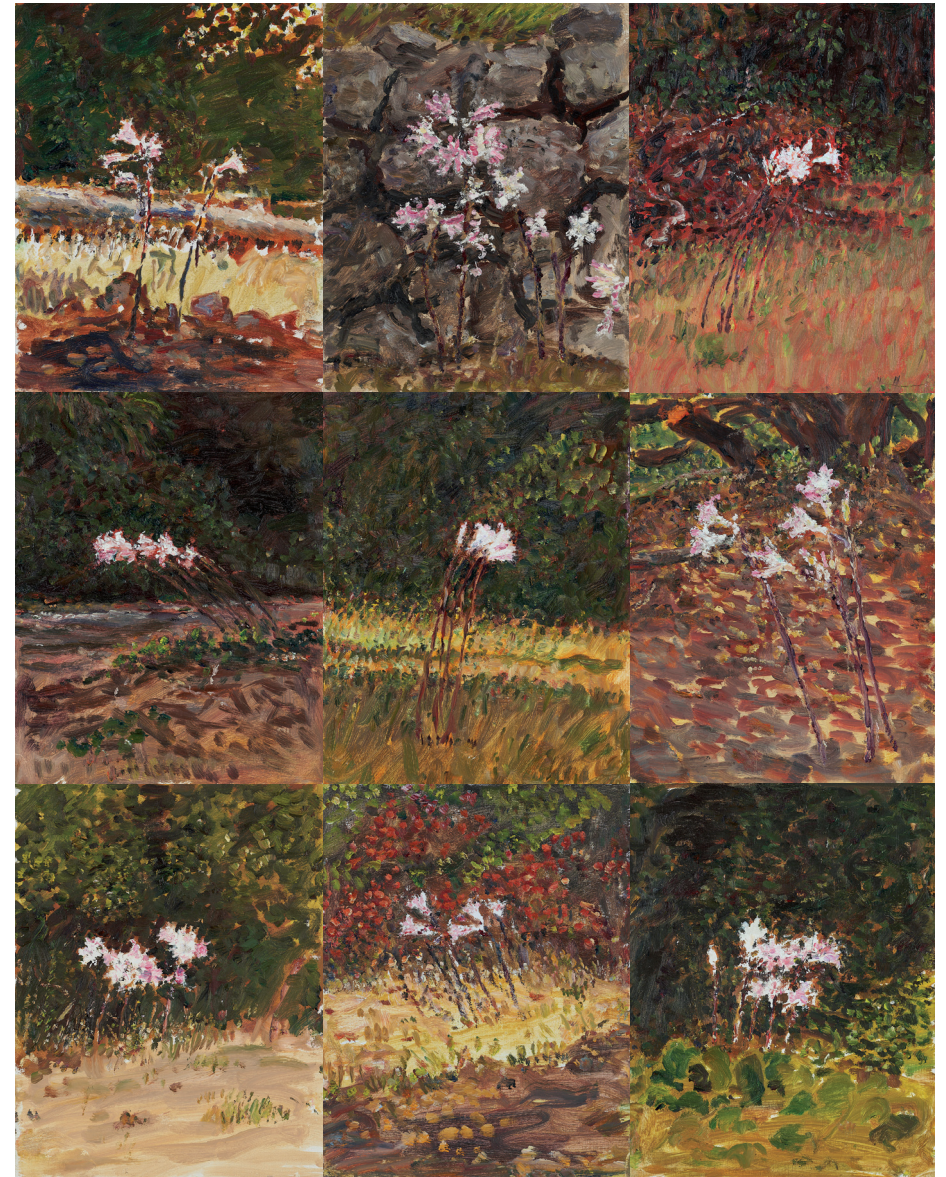
Easter Lily Series (Mount Lofty) 2020 oil on marine ply 24 x 19cm (each)

In late summer 2020, while my friends Sassy and Karl were stuck in Sydney, I went up to their garden at Mount Lofty every couple of days to water a dozen young fruit trees they'd planted in November. There's no mains water there and the flow from a vine-covered concrete rainwater tank near the house is slow. I found various old lengths of garden hose in the shed and joined them together until they reached the furthest peach sapling at the bottom of the sloping orchard. I gave each tree half an hour of trickle while I got on with some painting, or while I wrote in my journal under an old pine tree nearby. When I became too involved in my painting, certain trees got more than their share of trickled tank water. The rest of the large garden made me think of 'The Lost Domain' by Alain-Fournier, one of my favourite novels. It was once a neat and European space, with winding stone paths and beds of flowers, planted and tended by Karl's German and Latvian parents, but since their deaths it had become wild and overgrown. Fragments of its past still poked through. By April I felt the young fruit trees had survived the worst of the summer heat with only one fatality, the quince. From the parched soil, pink Easter Lilies started emerging, as though by some miracle, their colour so luminescent among shadowy pines, bleached grass and autumn leaves.