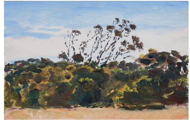
Windblown Eucalypt, Inneston 2021 oil on marine ply 13 x 20cm