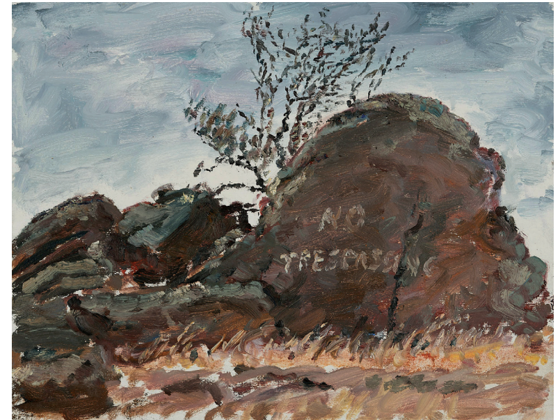
LEFT Looking West from Mannum Falls 2021 oil on marine ply 16 x 21cm RIGHT No Trespassing Rock, Mannum 2021 oil on linen 25 x 30cm