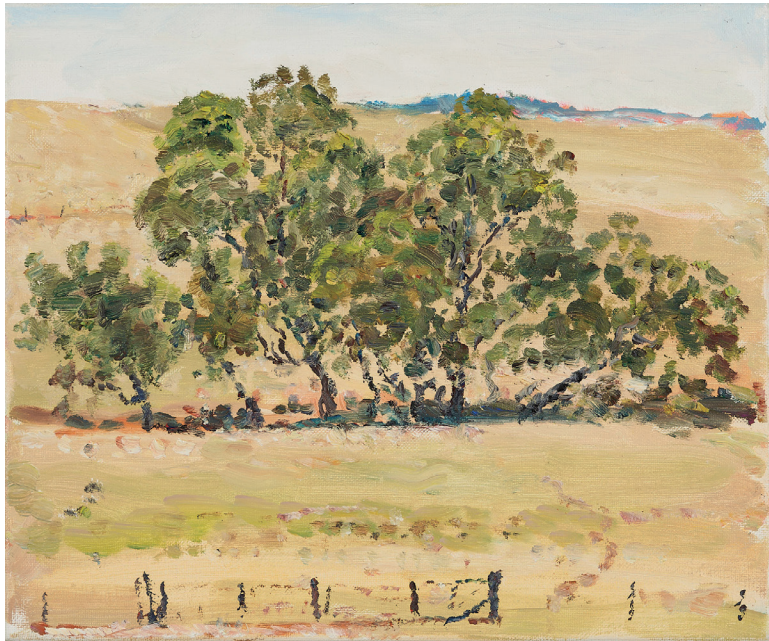
Gums in a Creek Bed, Echunga I 2020 oil on linen 25 x 30cm