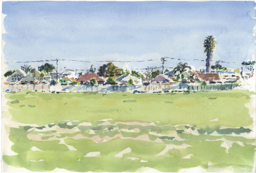
Afternoon Fenceline near Adelaide Airport 2020 watercolour on paper 19.5 x 29cm