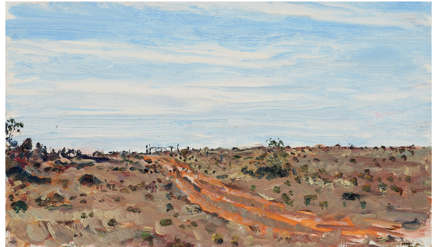
Paddock Track, Mannum 2021 oil on marine ply 18.5 x 32cm