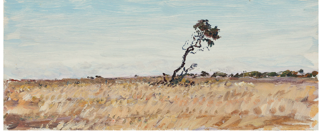
Wind-bent Tree, The Pines 2021 oil on marine ply 13 x 30cm