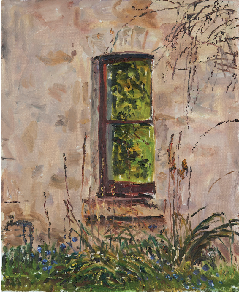
Kitchen Window, Mount Lofty 2019 oil on linen 56 x 46cm