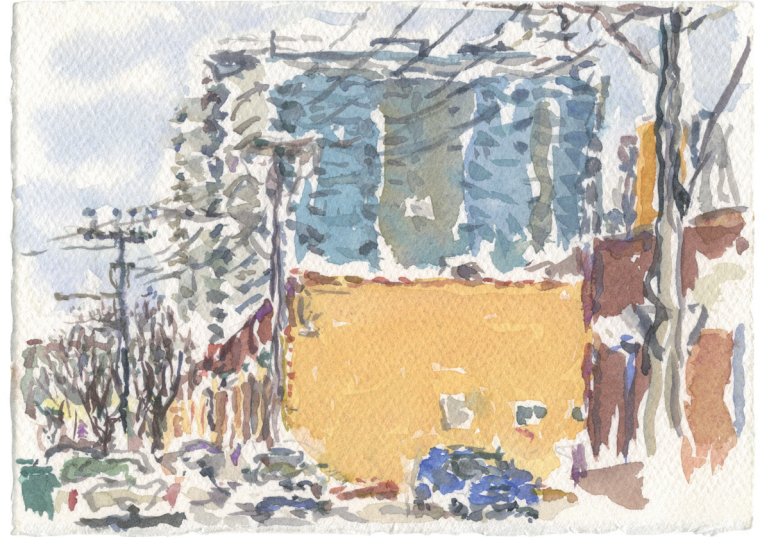
Yellow Brick Wall, Blenheim St 2020 watercolour on paper 11.5 x 16cm