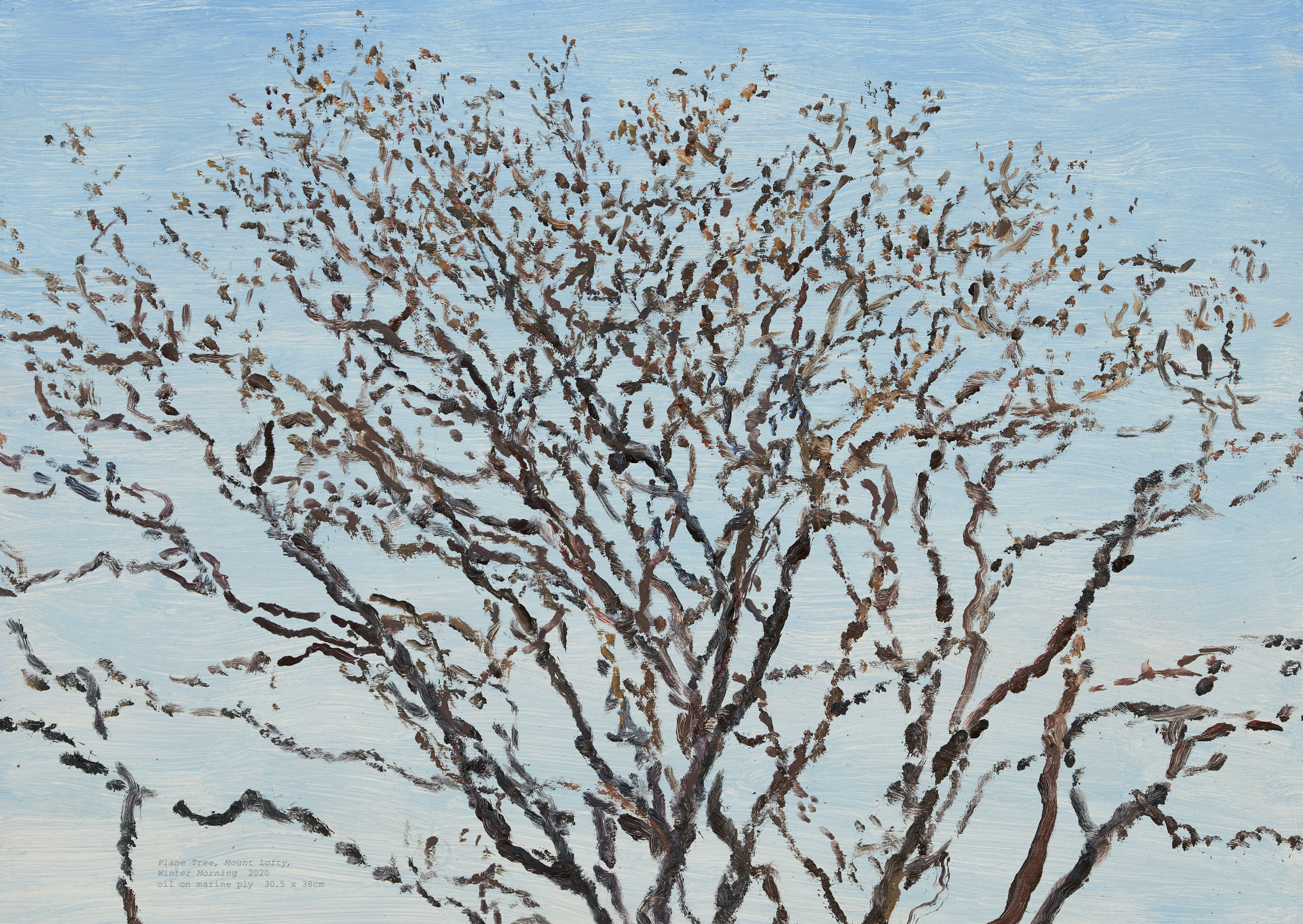
Plane Tree, Mount Lofty, Winter Morning 2020 oil on marine ply 30.5 x 38cm