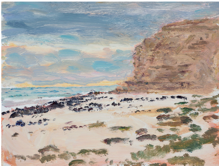
Blanche Point IV 2021 oil on marine ply 16 x 21cm