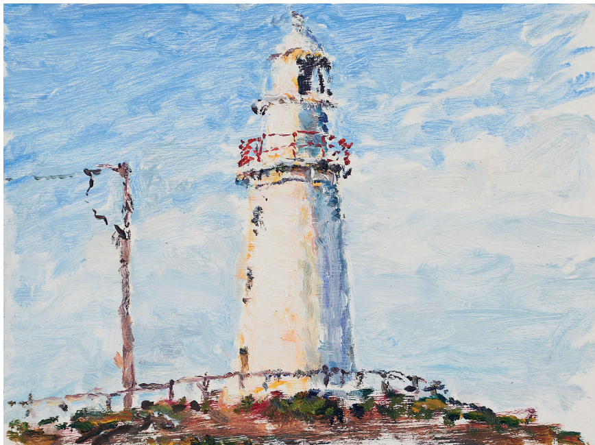
ABOVE Corny Point Lighthouse II 2021 oil on marine ply 16 x 21cm