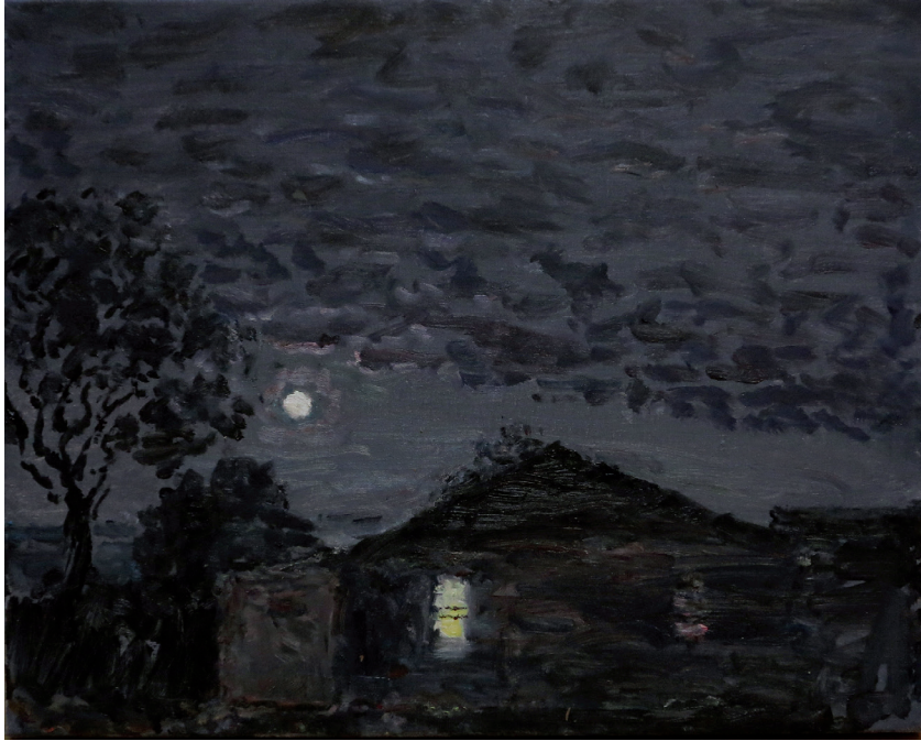
Moonrise, Koroop 2020 oil on linen 45 x 55cm