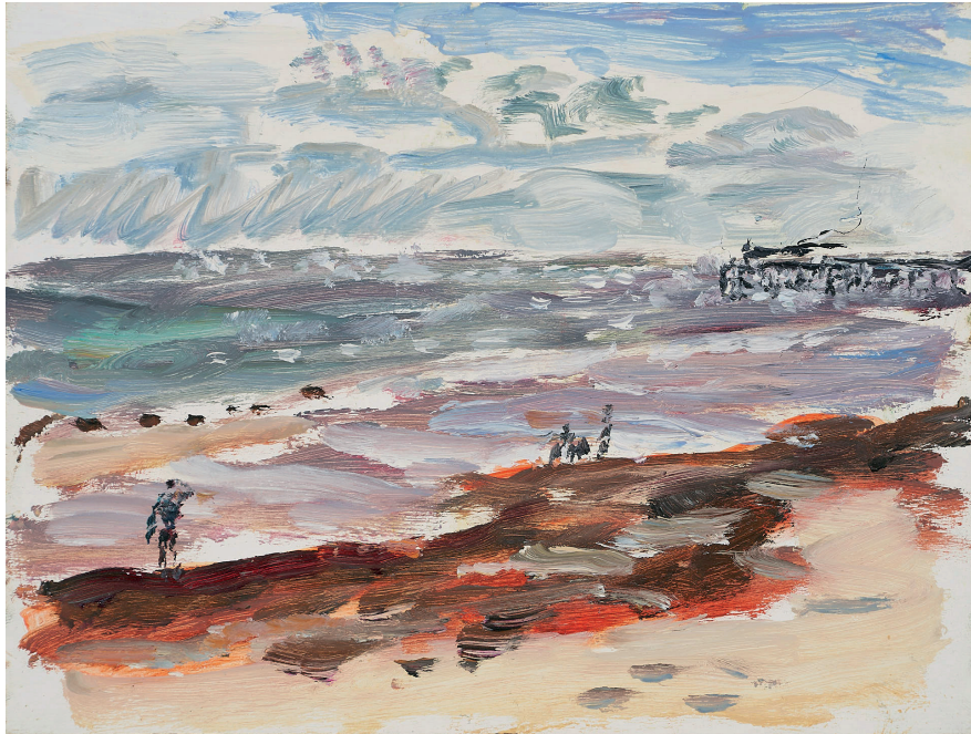
Windy Afternoon, Henley 2021 oil on marine ply 16 x 21cm