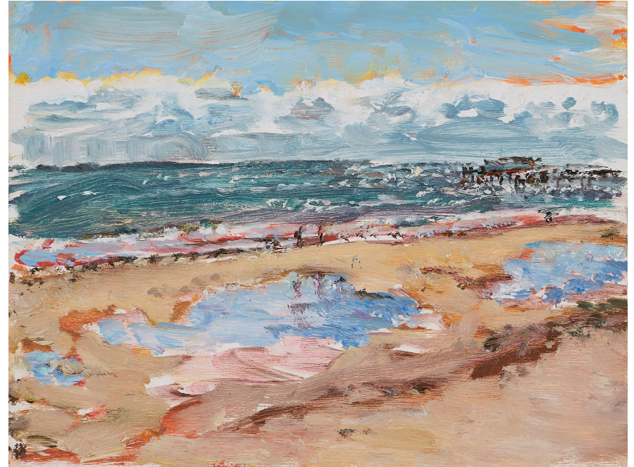
Tidal Pools, Henley I 2021 oil on marine ply 16 x 21cm