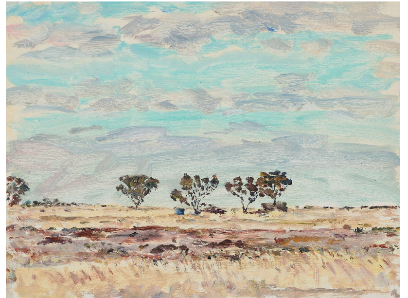
Afternoon Salt Marsh, The Pines 2021 oil on marine ply 16 x 21cm