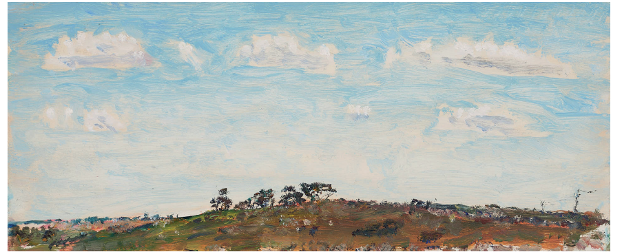
Afternoon Ridge and Clouds, Portee 2020 oil on wood panel 14 x 33cm