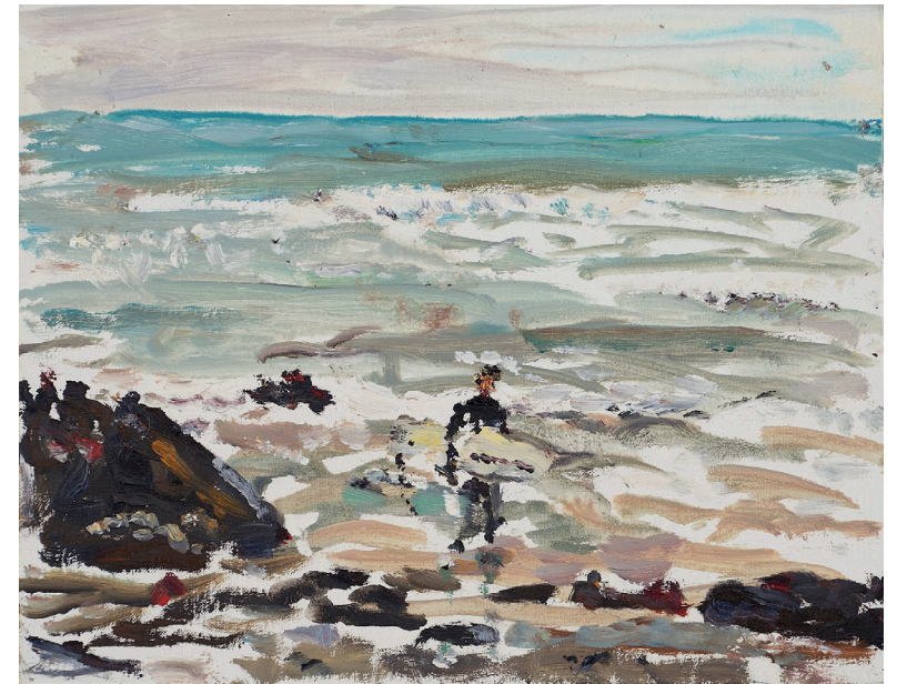
Leaving the Surf, Middleton 2020 oil on marine ply 19 x 24cm