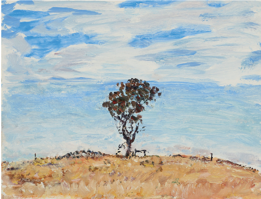
Edge of the Paddock, Corny Point I 2021 oil on marine ply 16 x 21cm