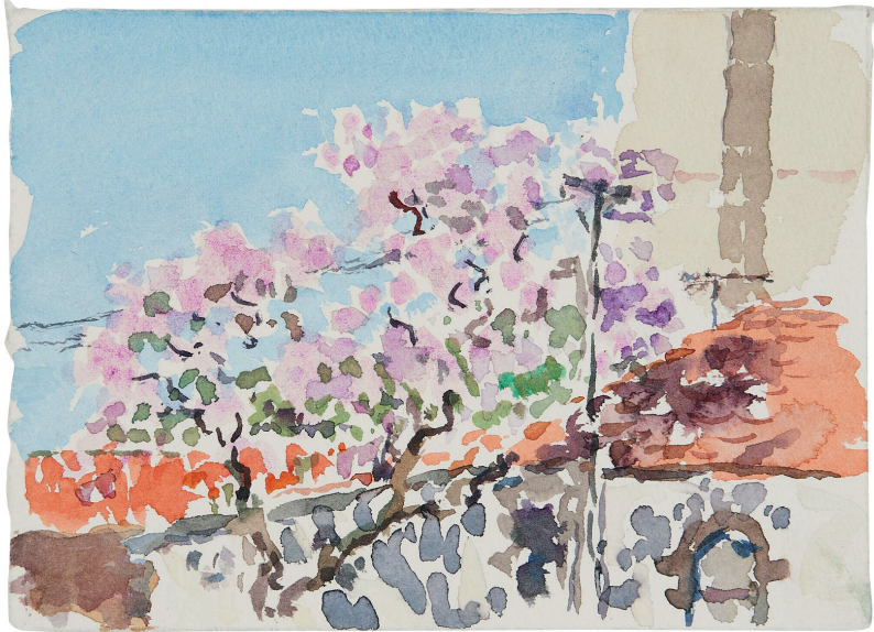
Jacaranda Shadow, Morphett Street 2020 watercolour on paper 11.5 x 16cm