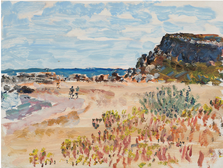
Shell Beach, Yorke Peninsula 2021 oil on marine ply 16 x 21cm