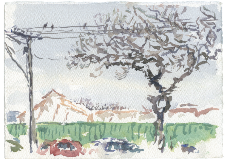
Birds on the Wire, Gouger Street 2020 watercolour on paper 11.5 x 16cm