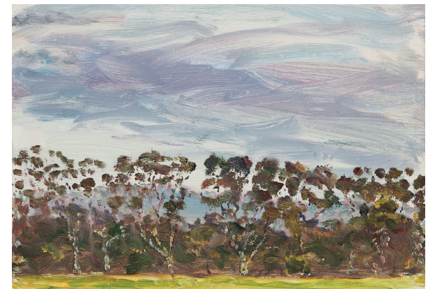
TOP Two Sugar Gums, Adelaide Parklands 2021 oil on marine ply 21 x 30cm