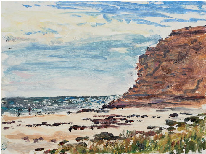
Blanche Point I 2021 oil on marine ply 16 x 21cm