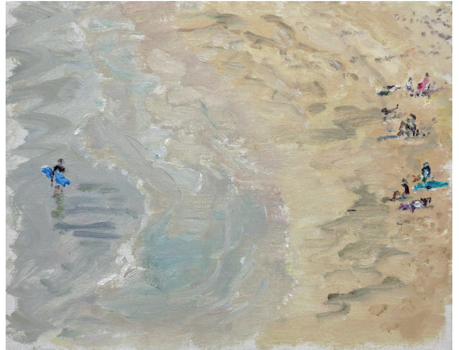
Returning Surfer, Berry Bay 2021 oil on linen 25 x 30cm