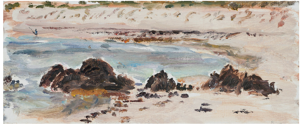
Balsalt Extrusion, Lighthouse Beach II 2021 oil on marine ply 13 x 30cm