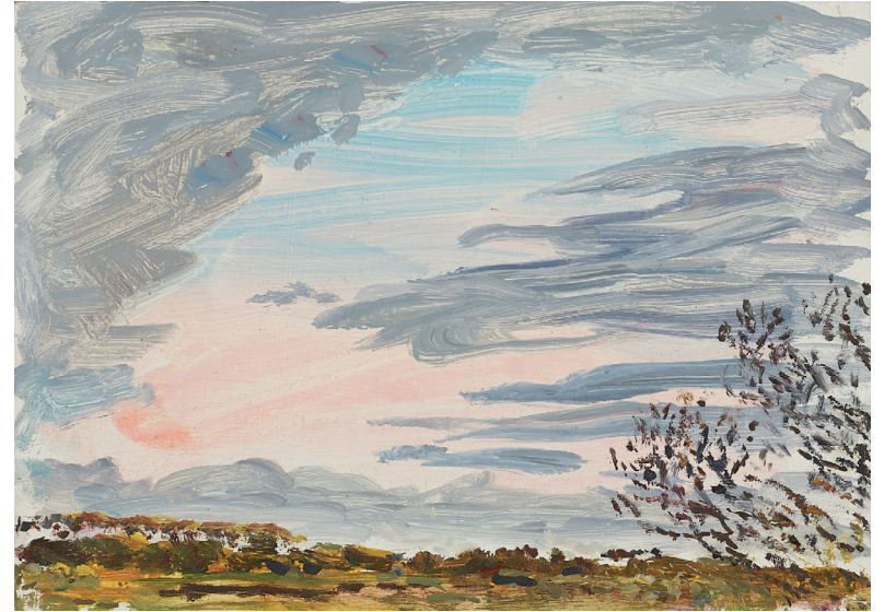
Dawn Clouds, The Coorong 2020 oil on wood panel 15 x 20cm