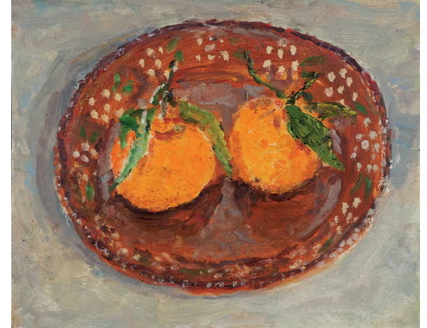
Viv's Mandarins on a Portugese Plate 2021 oil on linen 19 x 24cm

This catalogue is a selection of paintings from the exhibition 'Two Years in South Australia' at King Street Gallery on William, 2022.