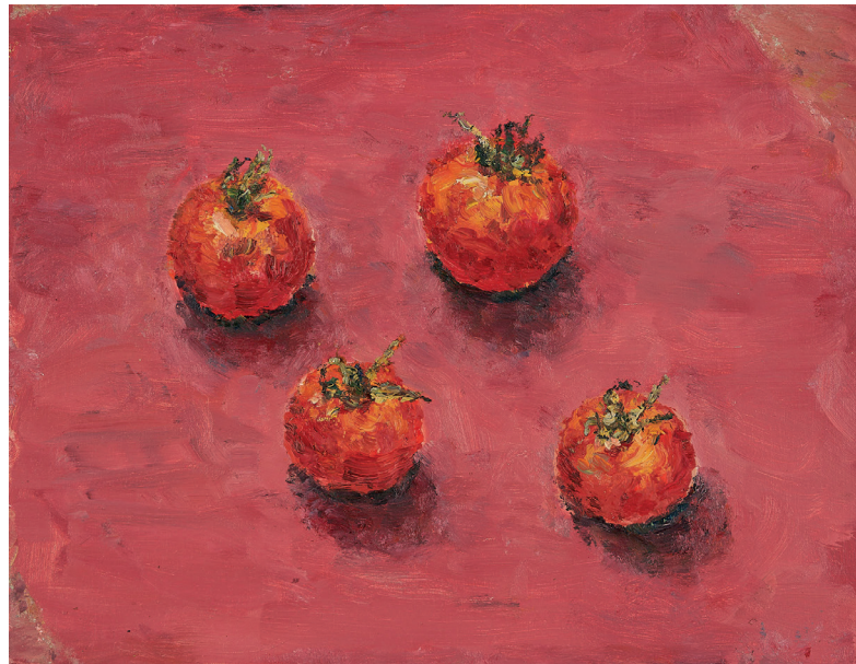
The Last of our Homegrown Tomatoes 2021 oil on linen 23 x 30cm