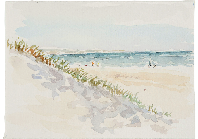
Edge of the Dune, West Beach 2021 watercolour on paper 11.5 x 16cm