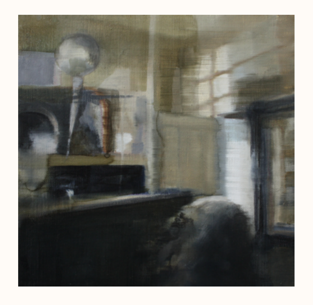
Ladder Study 2021 oil on linen on board 20x20cm