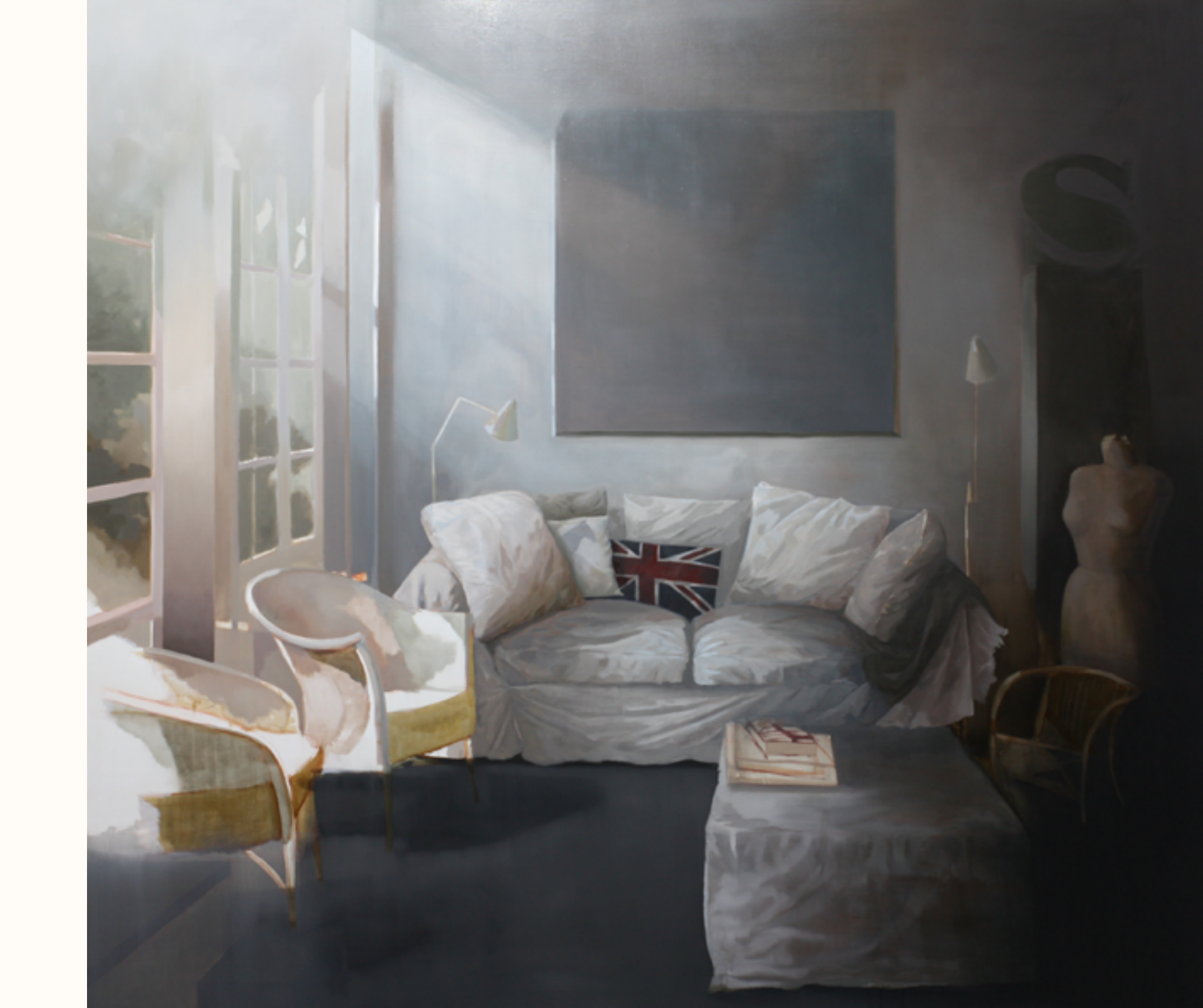
Reading Emin 2022 oil on linen 167x183cm