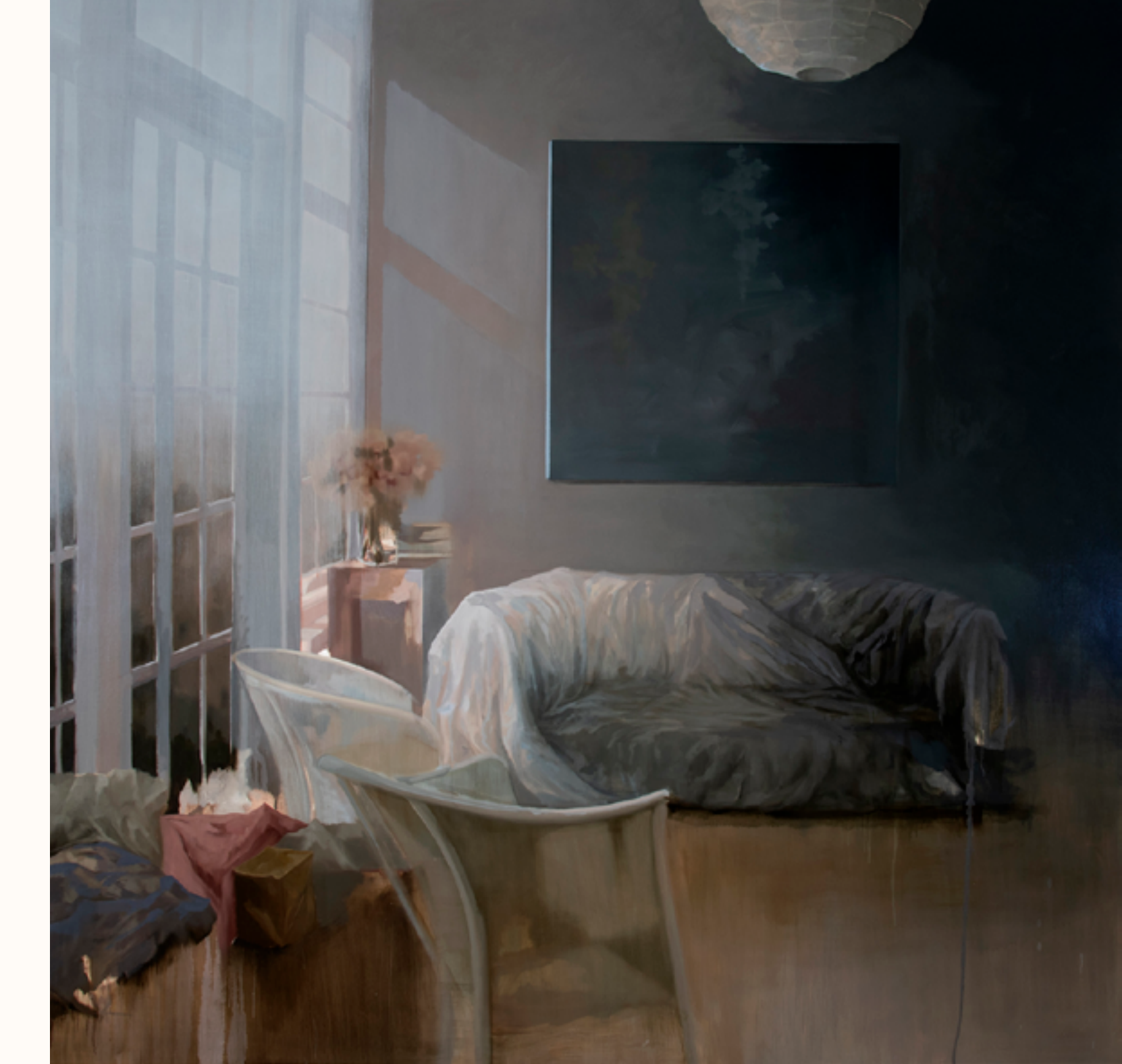
The Wait 2022 oil and wax on linen 152x152cm