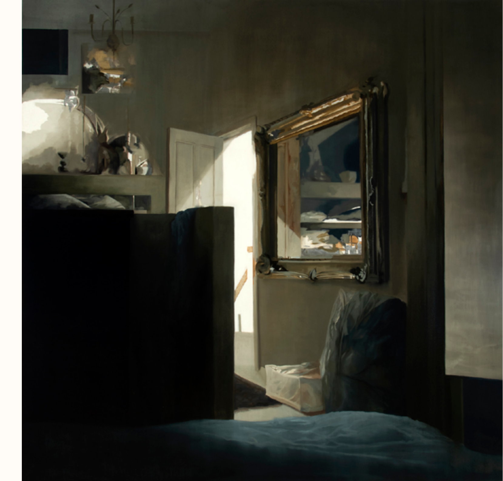
Lucy's Light 2022 oil on linen 153x153cm