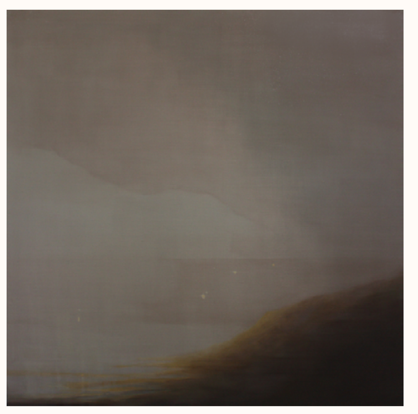
Golden Hour 2022 oil on linen 120.5x120.5cm