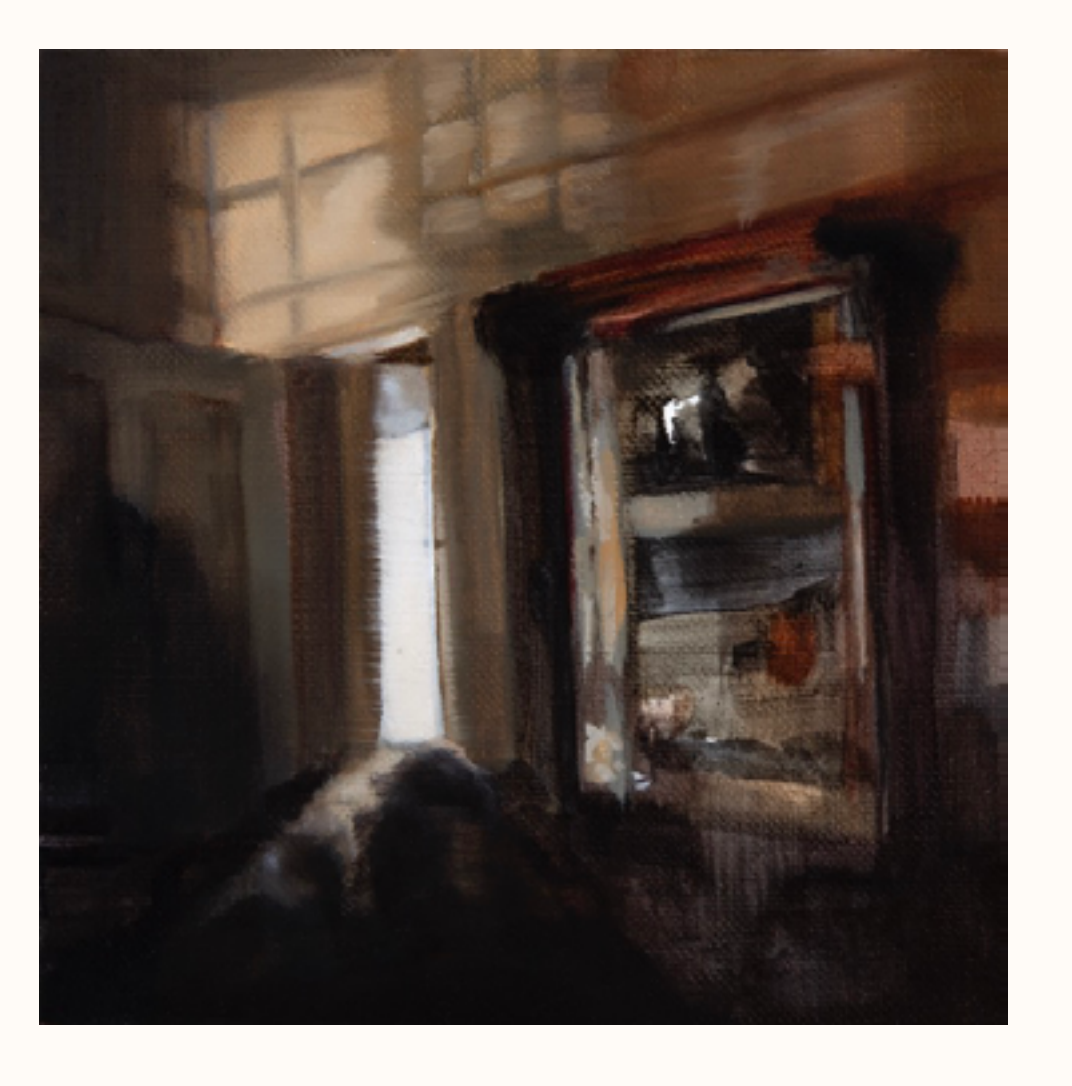
Night Stillness 2021 oil on linen on board 20x20cm