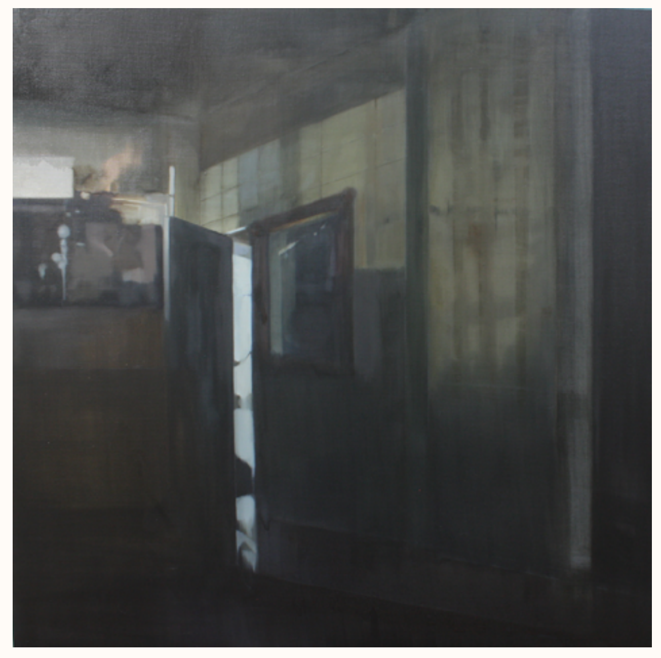
Woken 2022 oil on linen 120x120cm