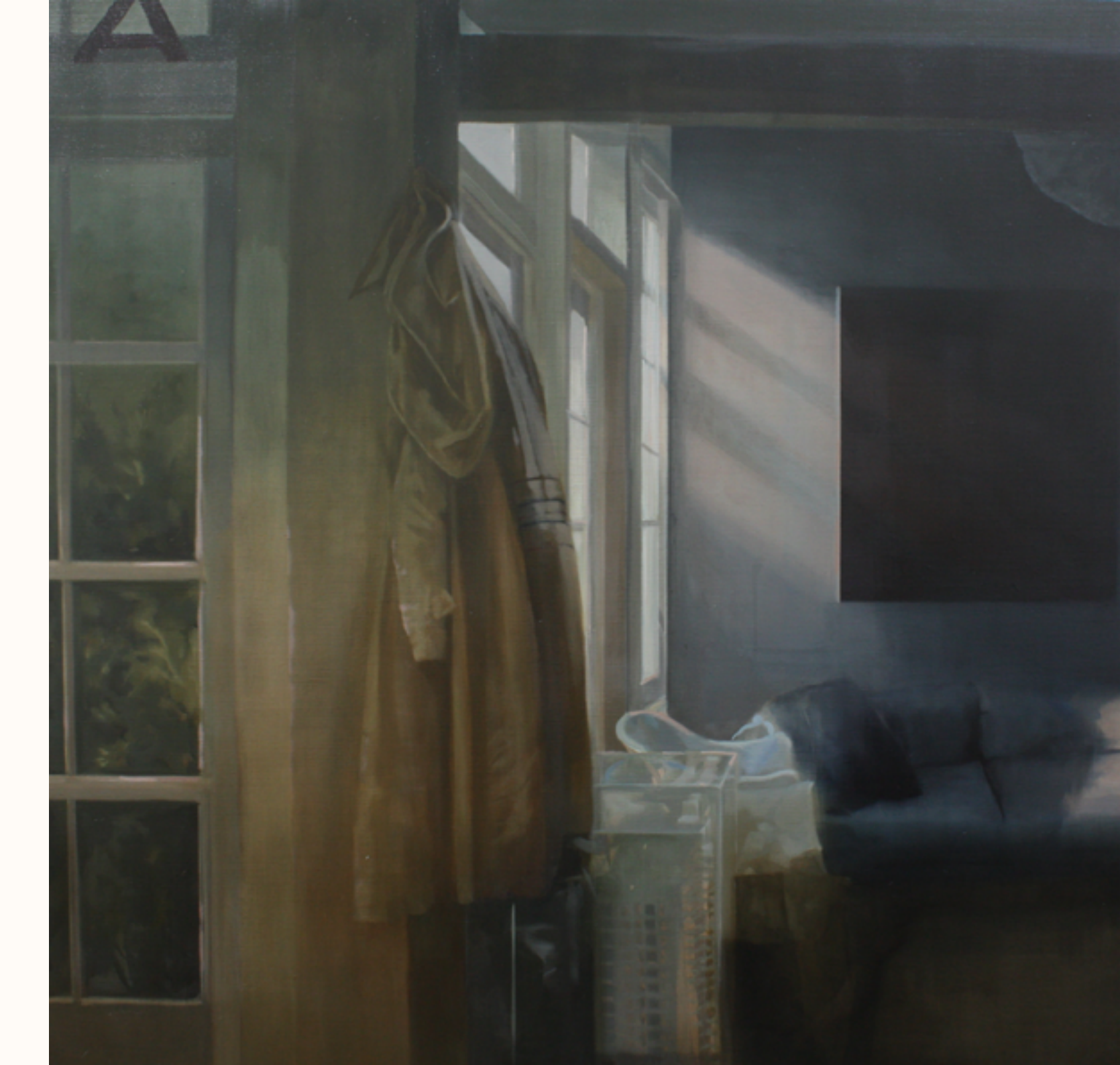
Rain Jacket 2022 oil on linen 120x120cm