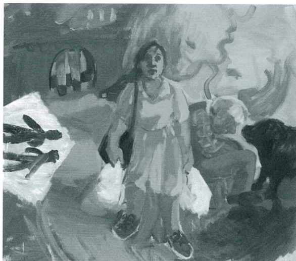
Wendy Sharpe KING STREET ON BURTON Sydney April 6 – May 1. www.kingstreetgallery.com.au