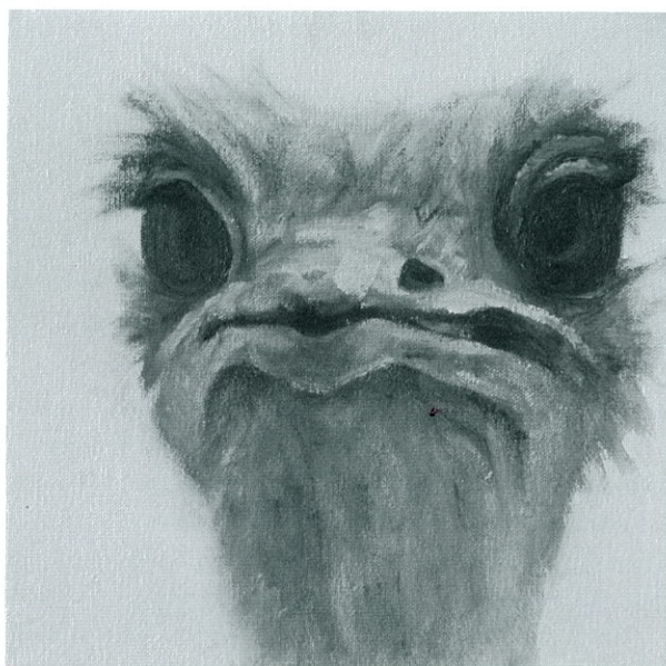
Kay Wood Diamond Joe No 1 Oil on Canvas 23 x 23 cm ARTPLACE Perth May 8 to May 30 www.artplace.com.au