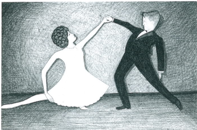
AUSTRALIAN PAINTINGS SUMMER 2004 John Brack (1920–1999) sketch for Junior Latin America 1969 conte 44 x 67 cm signed and dated lower right. Provenance: Acquired from the artist in 1969; Private collection. SAVILL GALLERIES Sydney March 2 – April 3 www.savill.com.au