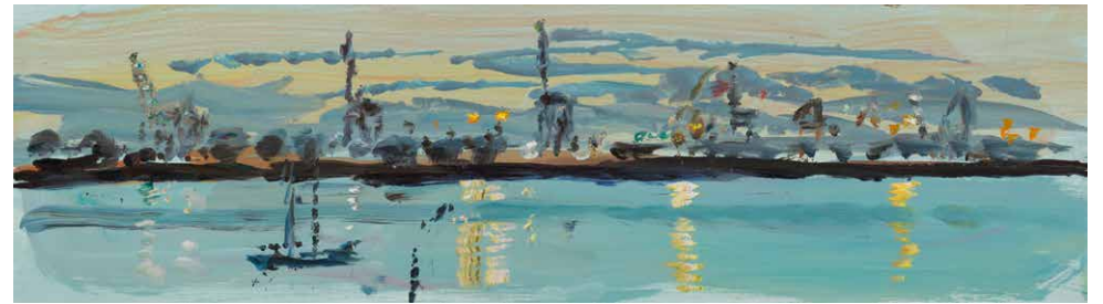
Evening, Port Botany 2013 oil on wood panel 15 x 42 cms