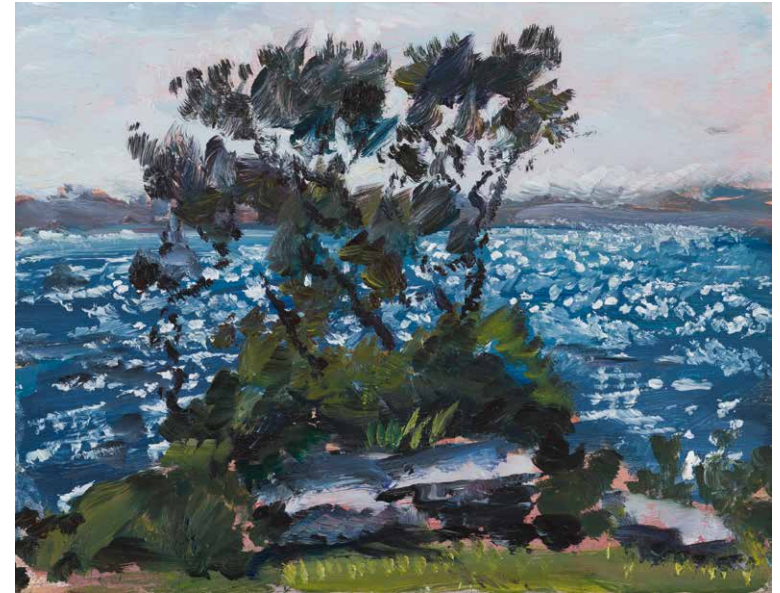
Morning light, Nielsen Park 2012 oil on wood panel 14 x 17 cms