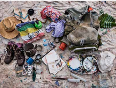
Tom's walking kit