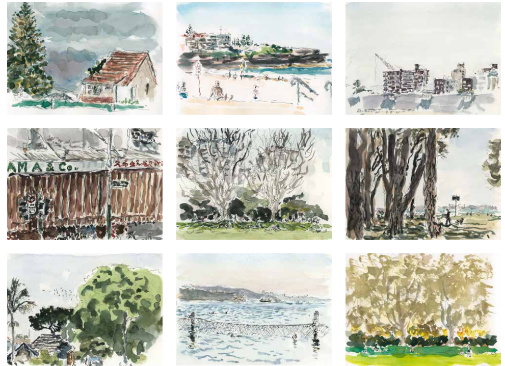
Scenes of Sydney 2014 watercolour & pigment ink on paper set of nine 11.5 x 16 cms each