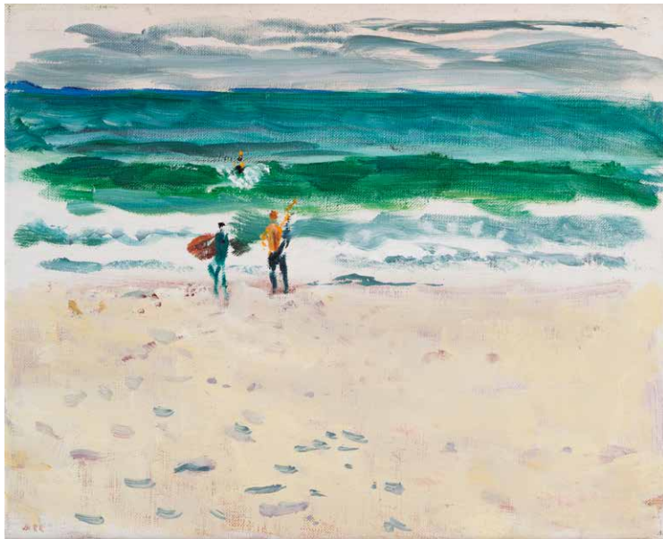
Surfers, Maroubra II 2014 oil on linen 20.5 x 25 cms