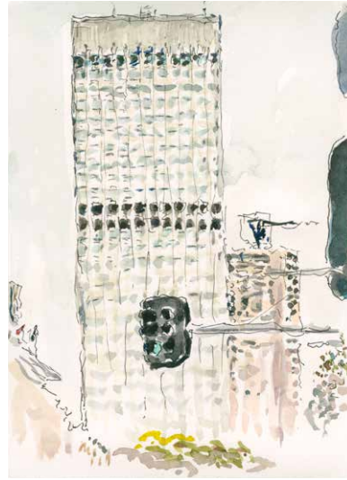
Looking down William Street 2014 watercolour & pigment ink on paper diptych 11.5 x 16 cms each

My painting subjects vary: the urban ones being things I notice on my daily rounds; cycling and walking to the city and shops, places near where I've worked as a housepainter, areas alongside sports fields where my children have played soccer and hockey. I return with my art materials to spots where I have picnicked or swum with family and friends - Maroubra, Redleaf Pool, Wattamolla - to sights there that have captured my attention. I like to paint certain city buildings and houses, not for their architectural merit, but for some other quirkiness - the way shadows fall across them, or the way they look after dark, disembodied into patterns of light. Quite often, I have gone back to find one of my urban painting subjects altered - a building demolished, an aberrant tree cut down - until I have paused to wonder whether my choice of motif might have some destructive effect. As a joke, a friend once asked me to paint his stomach,