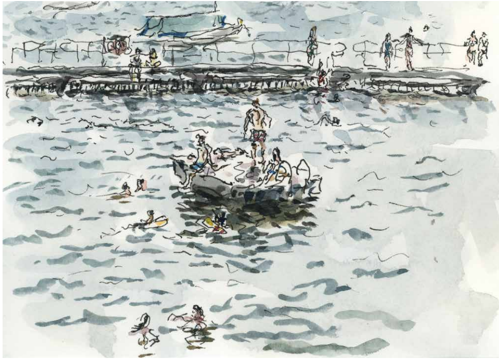
Pontoon, Redleaf Pool 2014 watercolour & pigment ink on paper 11.5 x 16 cms