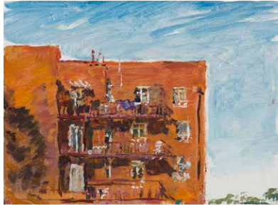
Red brick flats, Maroubra 2014 oil on linen 15 x 18 cms