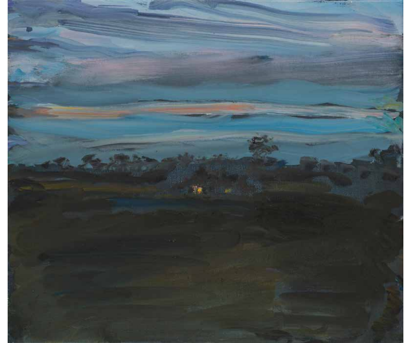
Evening houselights, Goolma 2014 oil on linen 33 x 36 cms