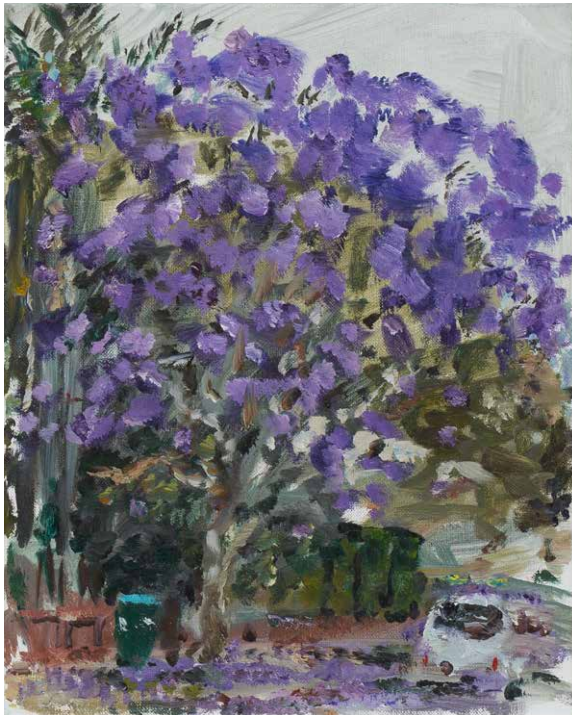
Jacaranda 2012 oil on linen 20.5 x 25 cms (one panel of triptych)

carrying my supplies, a bottle of water, a sandwich and my backpack of watercolours. On other days I head out on my bicycle to Chinatown, Central Station or Clovelly.