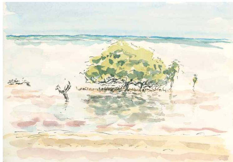
Low Tide, Broome, Town and Crab Beach 2014 watercolour & pigment ink on paper diptych 15 x 21 cms each