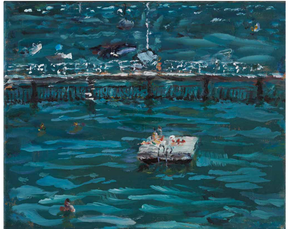
Pontoon, Redleaf Pool 2013 oil on linen 20.5 x 25 cms