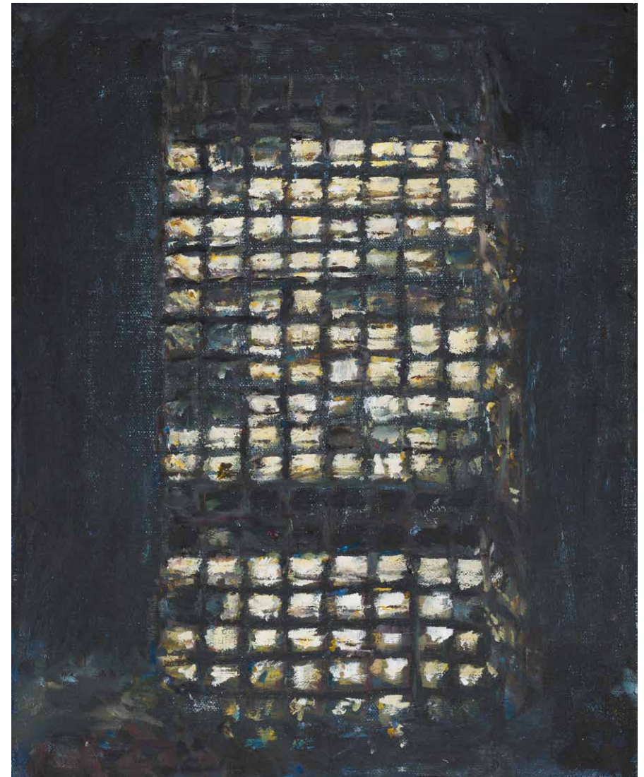
Office block, Elizabeth Street 2014 oil on linen 30 x 26 cms

There are days when I get away completely from the bustle, and, alone, take the train from Kings Cross to Otford on the border of the Royal National Park. I walk north-east through the angophoras and the palm forest, down to Burning Palms,