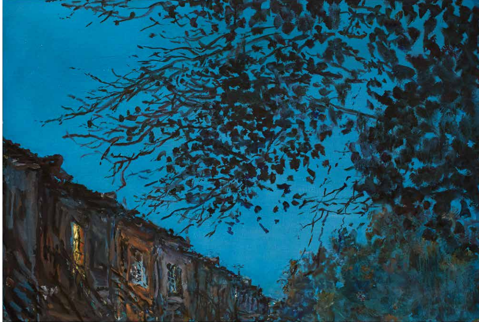
Womerah Lane 2014 oil on linen 42 x 63 cms