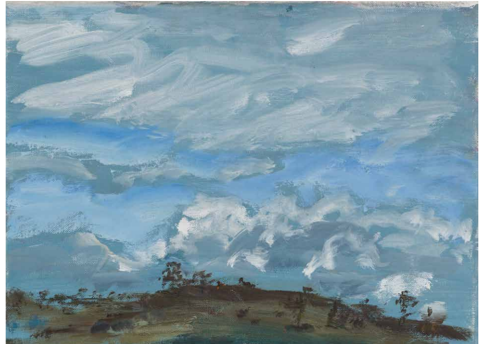
Hilltop, Cambalong 2014 oil on linen 20.5 x 25 cms