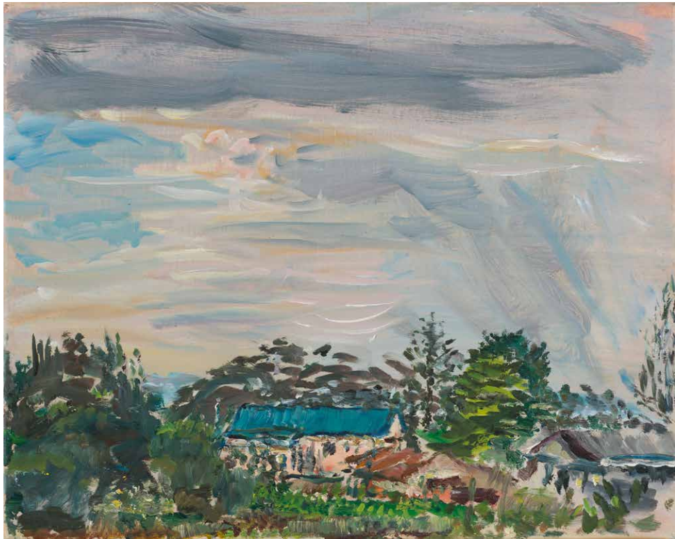
House with blue roof, Currarong 2012 oil on linen 30 x 38 cms