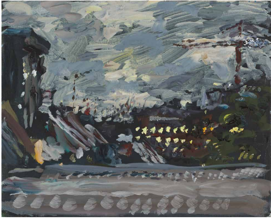
View from my roof, Darlinghurst 2012 oil on linen 34 x 40 cms