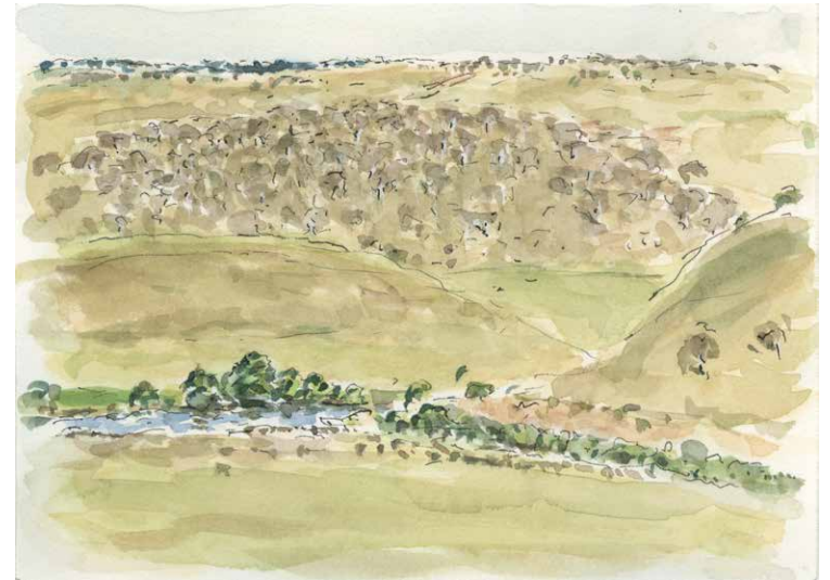
Bombala 2014 watercolour & pigment ink on paper diptych 11.5 x 16 cms each