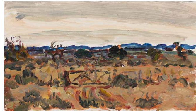
Paddock gate, Middleback Station SA 2011 oil on wood panel 11 x 19 cms