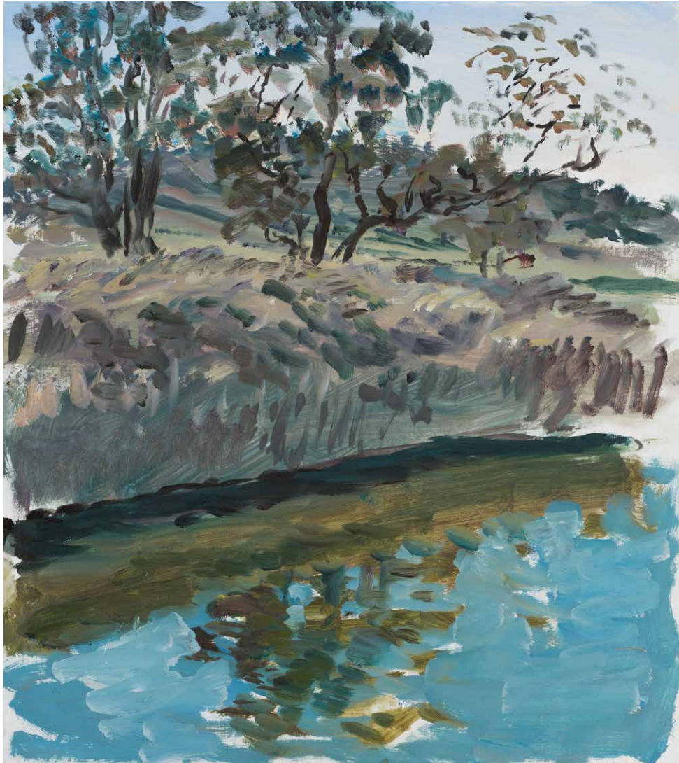
Goolma Creek 2012 oil on linen 49 x 44 cms