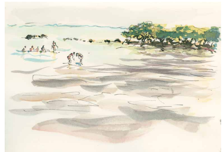
Bathers at Town Beach, Broome 2014 watercolour & pigment ink on paper diptych 15 x 21 cms each