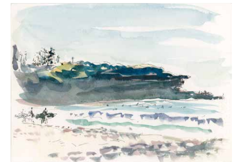
Headland, North Maroubra 2104 watercolour & pigment ink on paper triptych 11.5 x 16 cms each