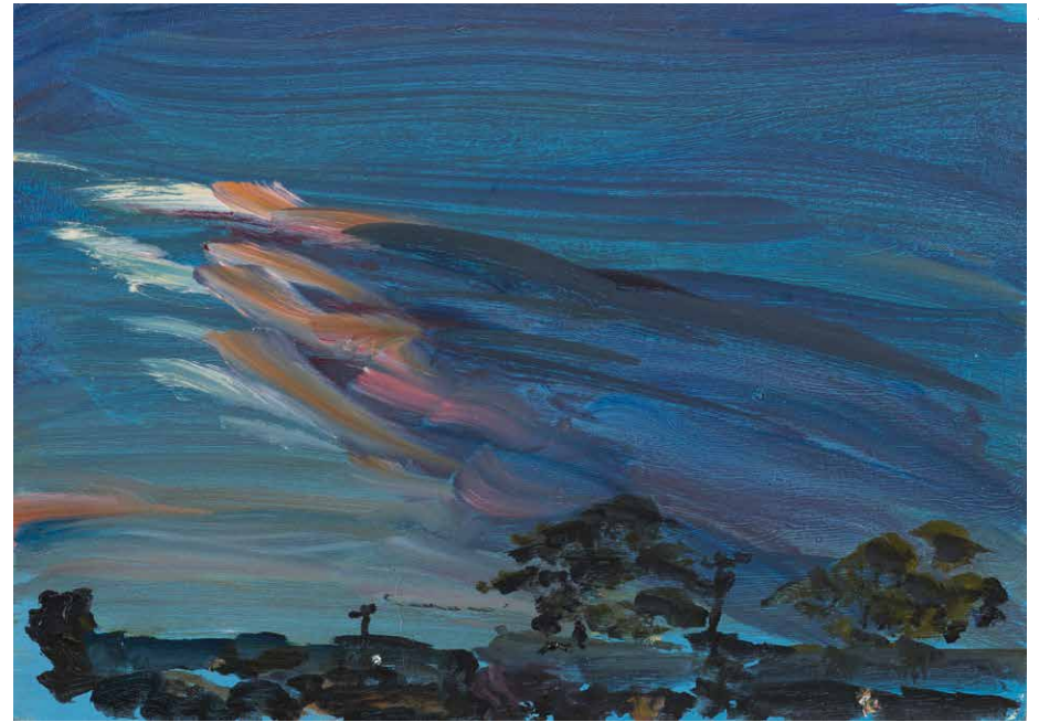
Sunset, Currarong 2014 oil on wood panel 15 x 21 cms