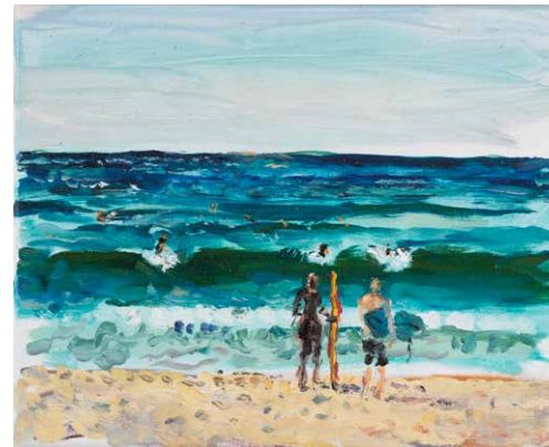
Surfers, Maroubra I 2014 oil on linen 20.5 x 25 cms