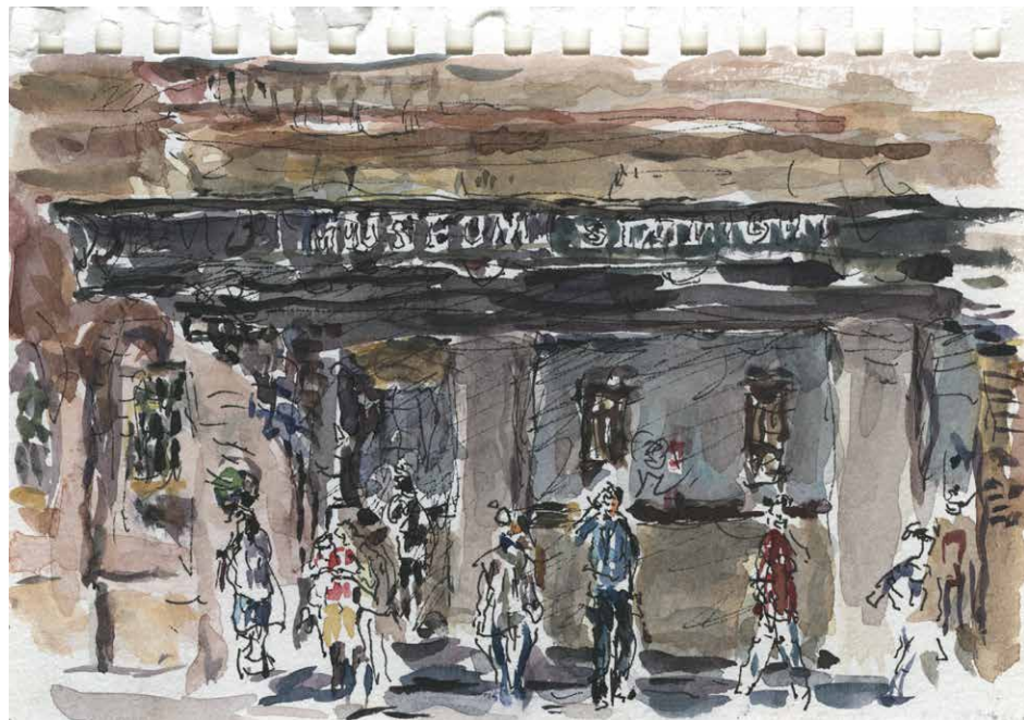
Museum Station 2014 watercolour & pigment ink on paper 10.5 x 15 cms