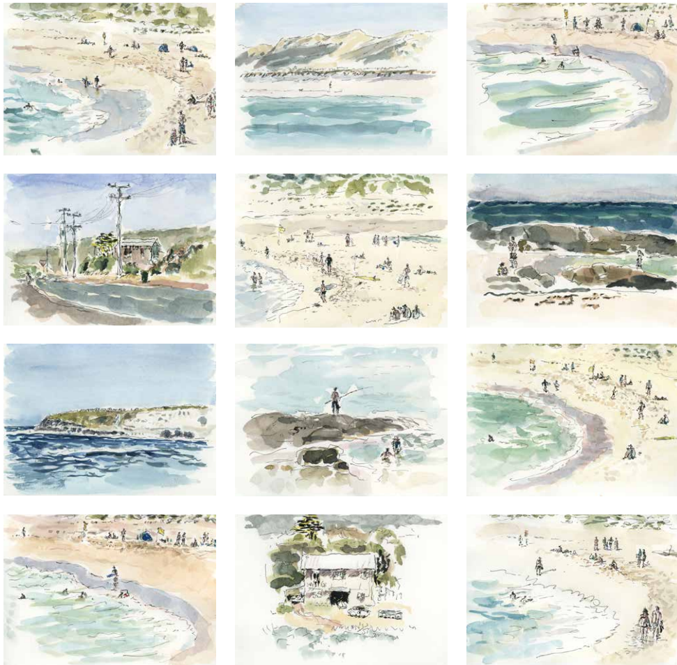
Summer at Prevelly, WA 2014 watercolour & pigment ink on paper set of twelve 11.5 x 16 cms each

Published by Tom Carment and the King Street Studios P/L on the occasion of the exhibition Tom Carment, paintings and drawings 2011 - 2014