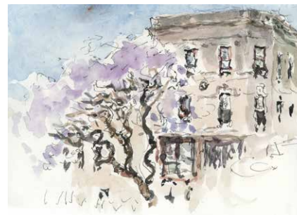
Jacarandas 2013 watercolour & pigment ink on paper 11.5 x 16 cms each