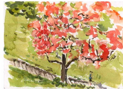
Illawarra Flame Tree, Cooper Park 2012 watercolour on paper 10.5 x 15 cms

AS I GET OLDER I BECOME MORE interested in the passing of the seasons. The blue of an autumn evening sky above rooftops, the long, sharp shadows of afternoons in late summer: these things have a heightened resonance for me now, a certain melancholy perhaps. Here in Australia, especially in its cities, the seasons are marked as much by the flowerings of trees, mostly non-native, as by the falling of leaves. My late mother always asked me to paint her a picture of flowering jacaranda trees, which, sadly, I never did in her lifetime. As a younger man, I eschewed such subjects, dismissing anything floral as pretty or sentimental. Over the past six years, however, I have started to paint coral trees, jacarandas, bougainvilleas