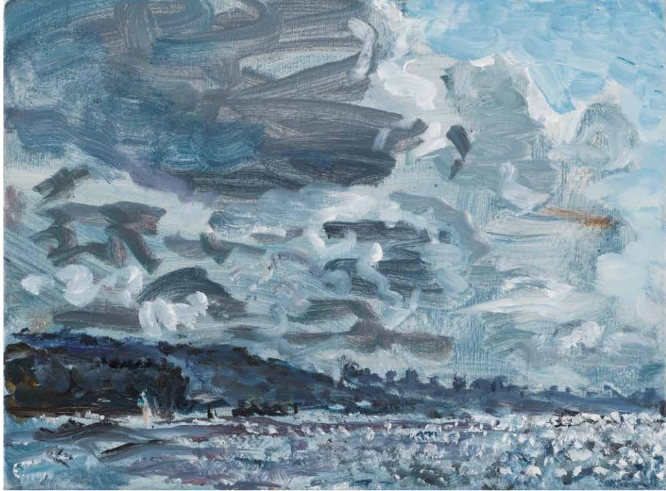
Before the storm, Middle Head 2012 oil on linen 22 x 27 cms