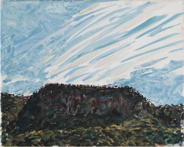
Cirrus, Wattamolla 2012 oil on linen 20.5 x 25 cms