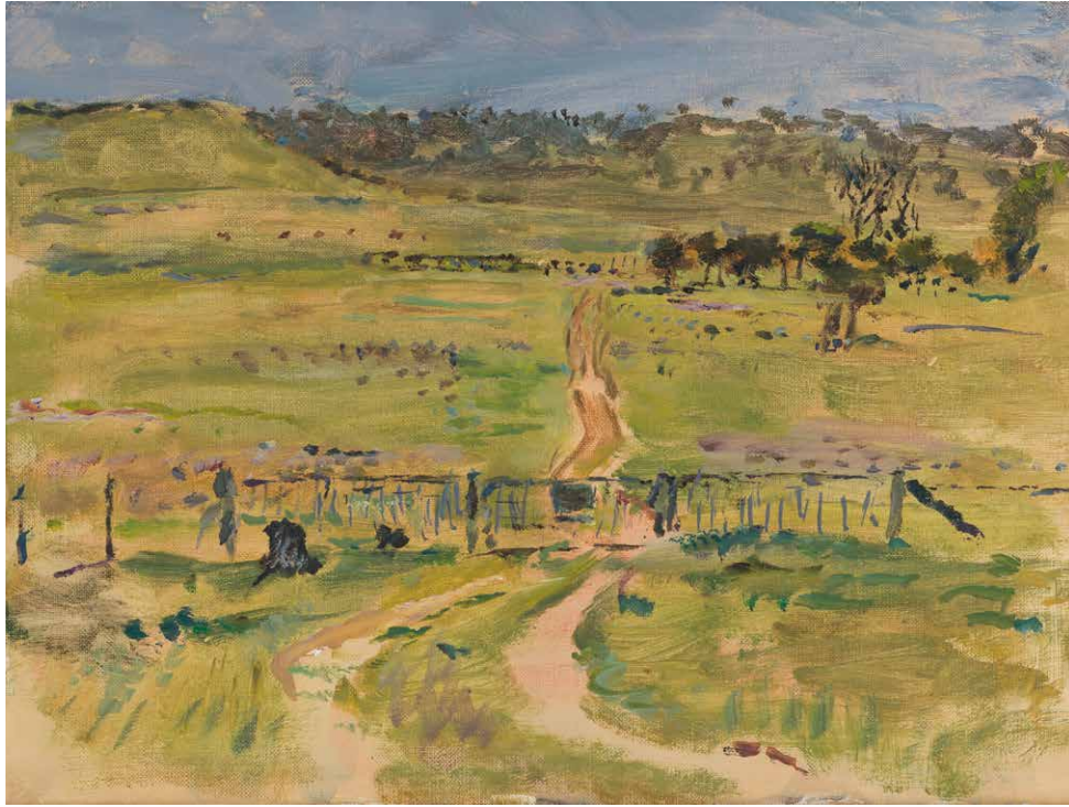
Road to Cambalong 2014 oil on linen 22 x 27 cms