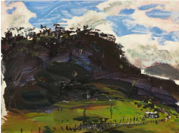
Fenceline, St Albans 2013 oil on wood panel 9 x 12 cms