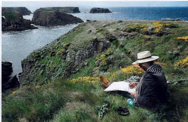
Artist Luke Sciberras on Belle Ile in France in the documentary.

The film starts with the dramatic scenery, waves