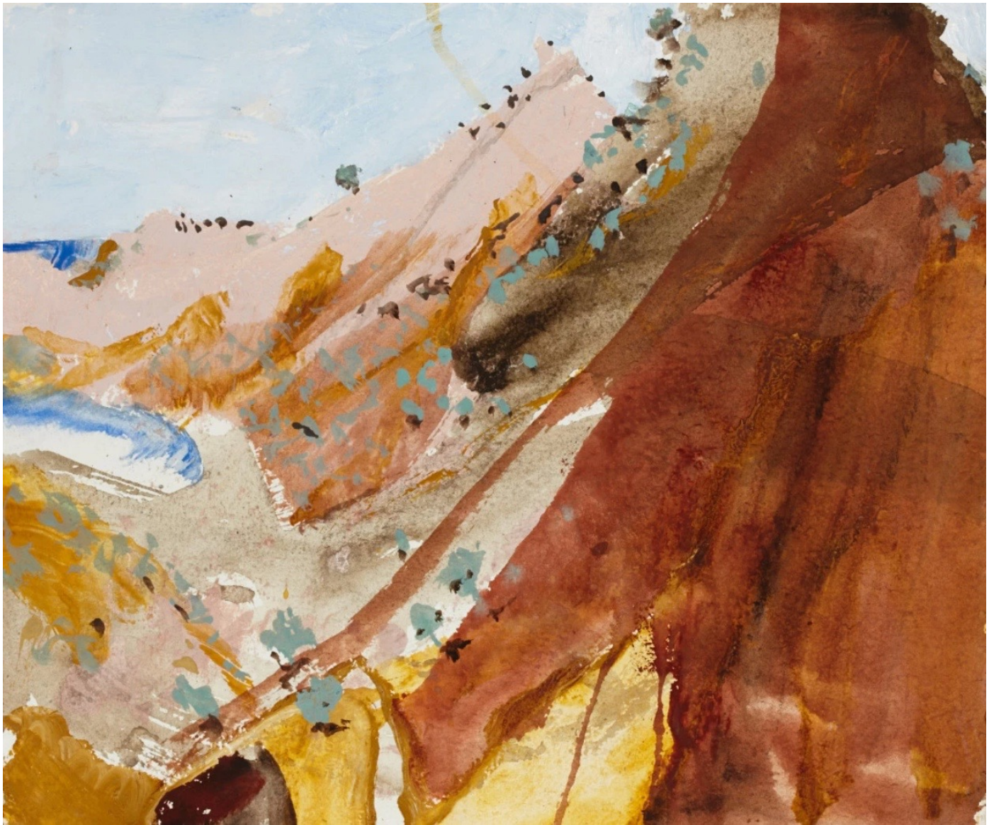
'Gallipoli Study 6, 2014, gouache and pastel on paper,