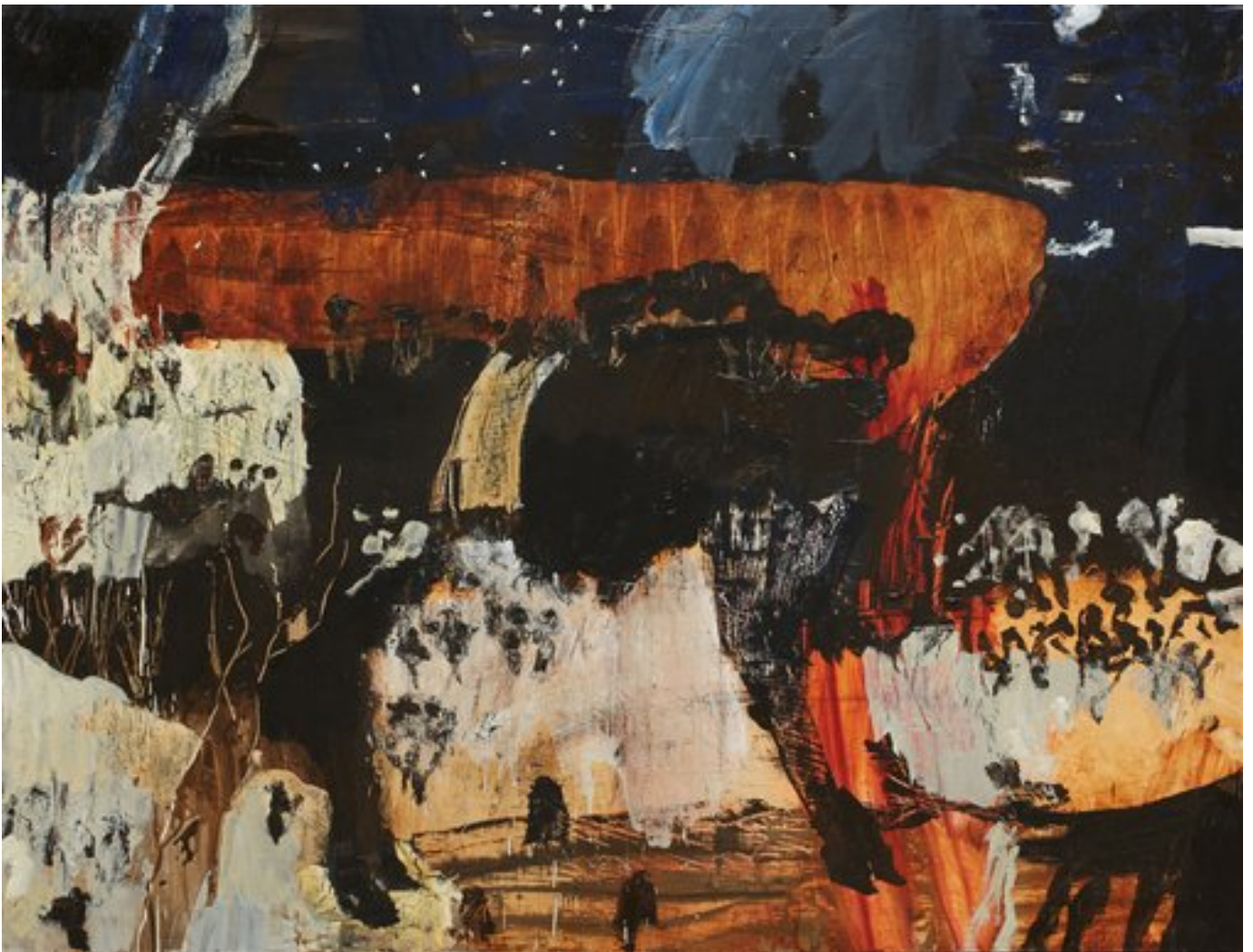
'Buffalo country, Katherine, NT', 2016, oil on board, 124.5 x 162.5cm, finalist Wynne prize 2016

_(/#facebook) _(/#twitter) _(/#google_plus)