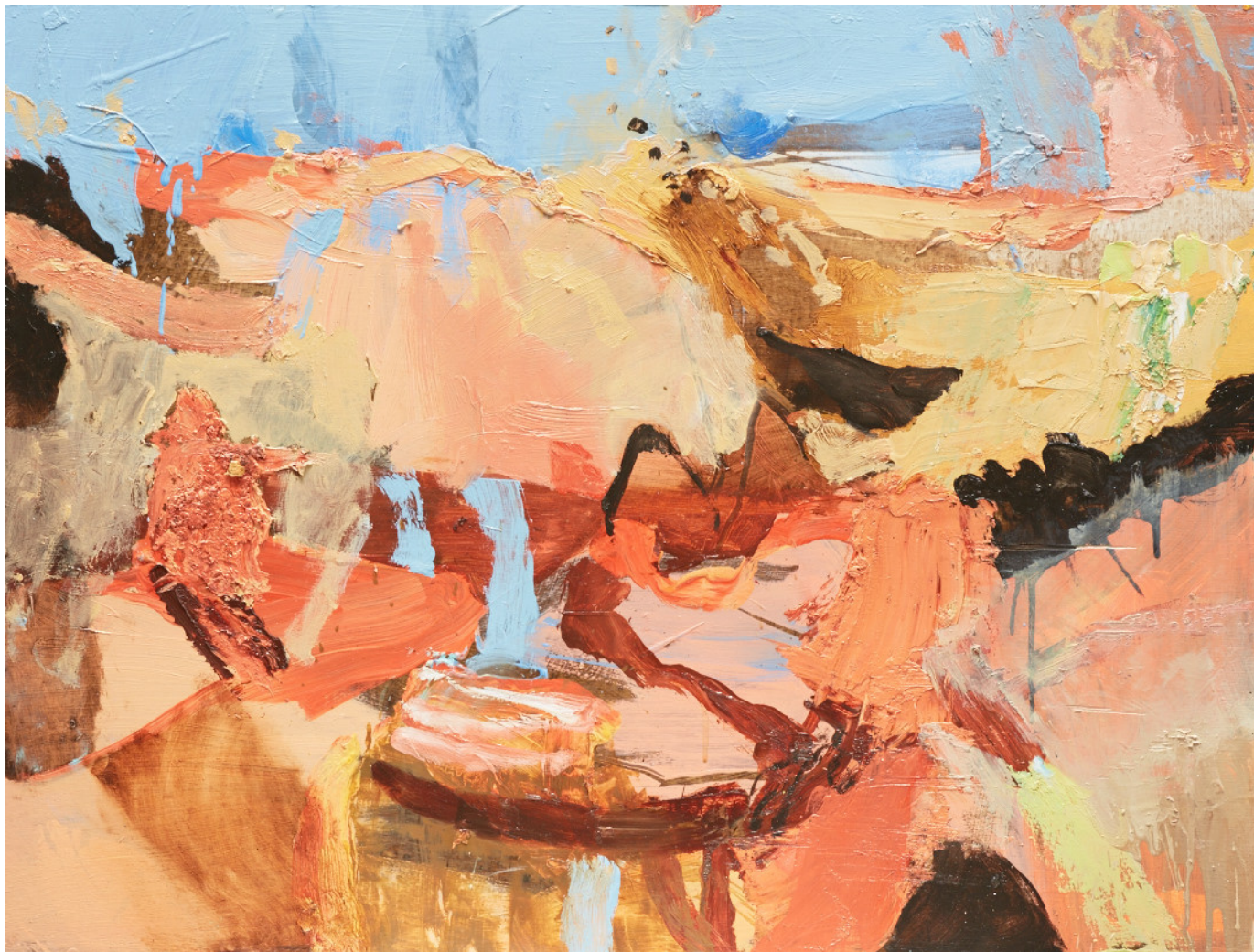
'Spring Sun – Hill End', oil on board, 2016, 60 x 85cm