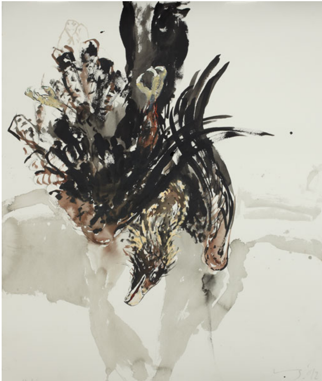
'Wedgie' 2012, mixed media on paper, 76 x 56cm