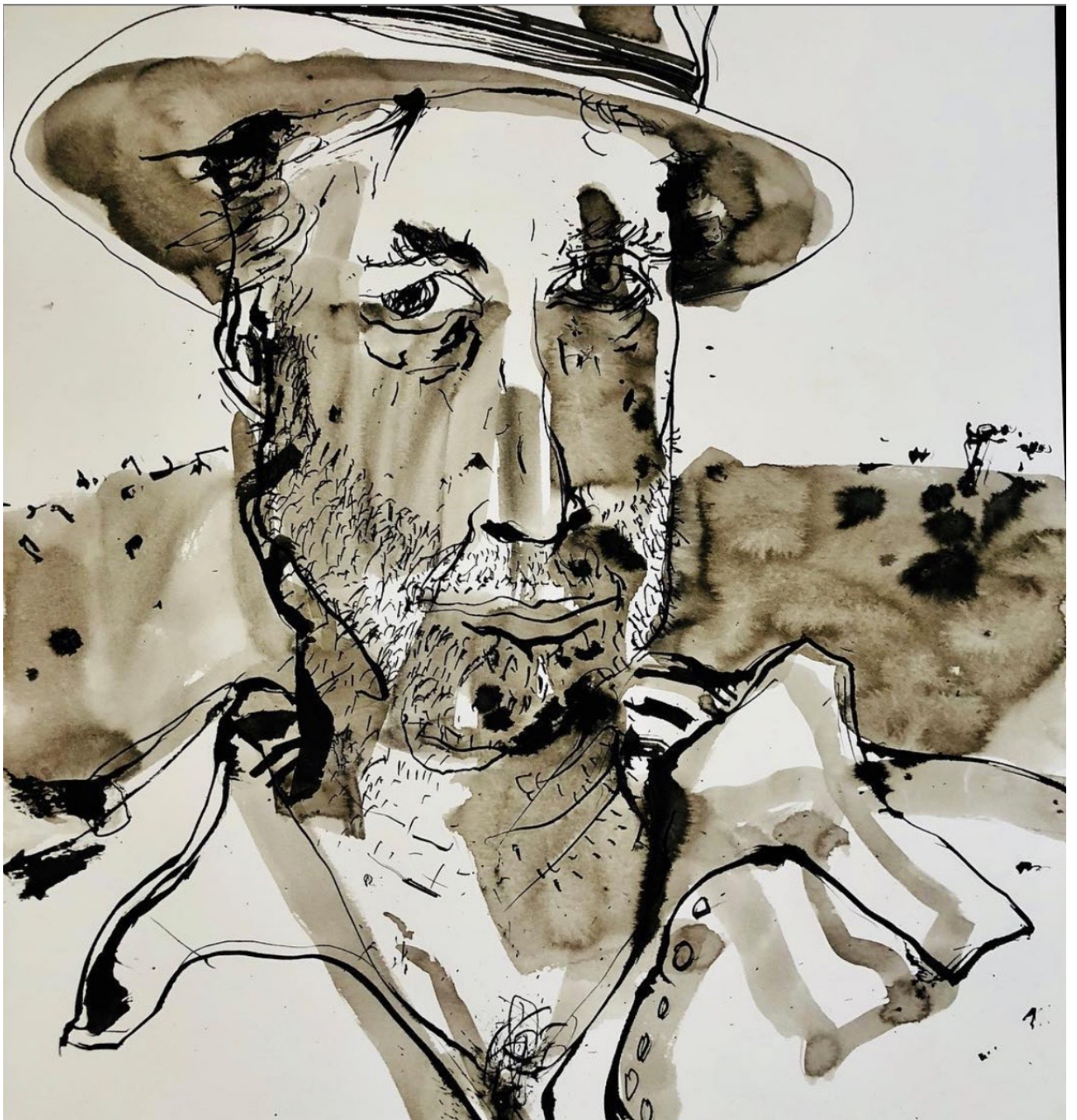
Ink on paper, Instagram, @luke_sciberras