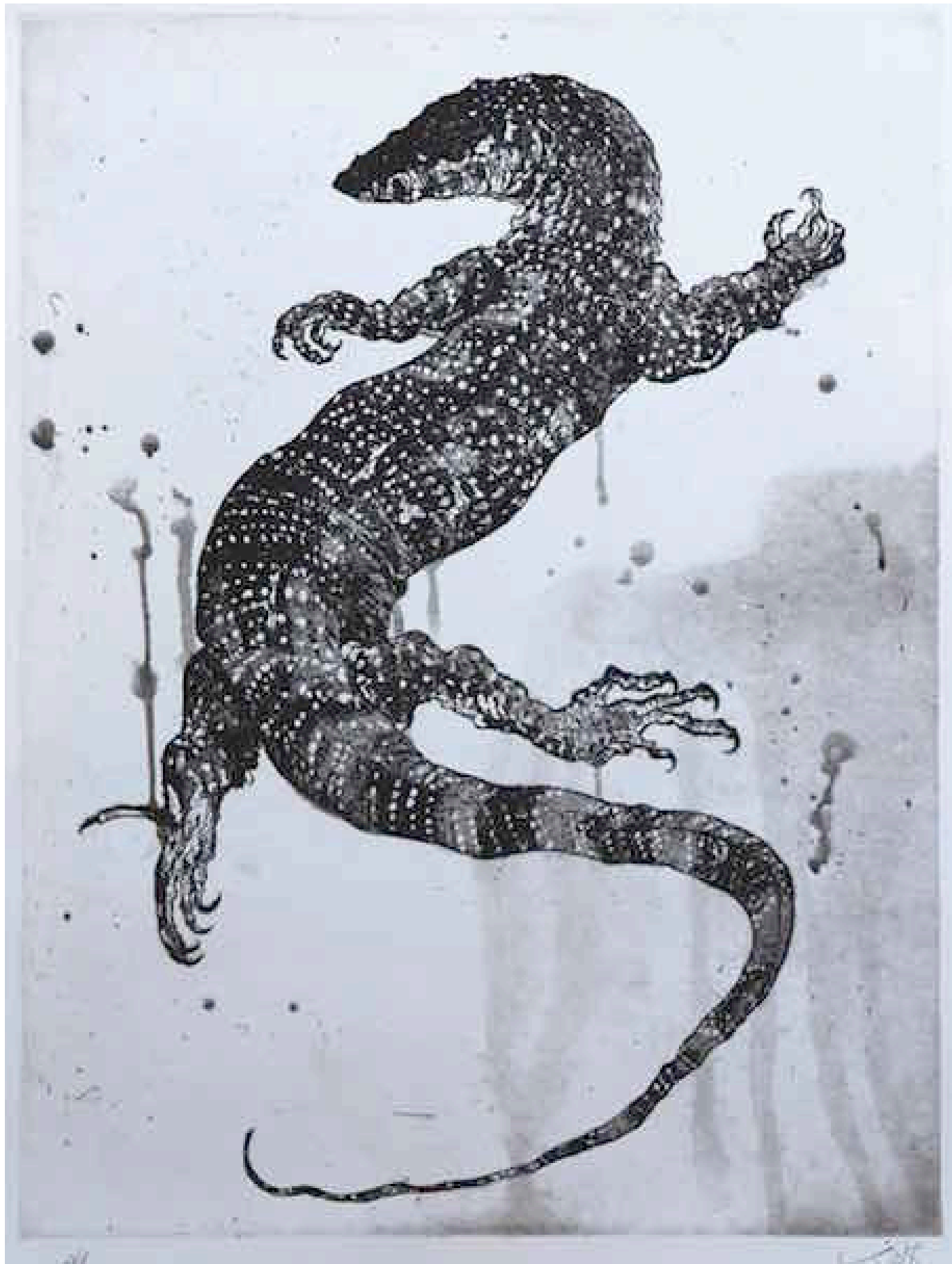
'Goanna', 2018, etching, 71 x 53cm