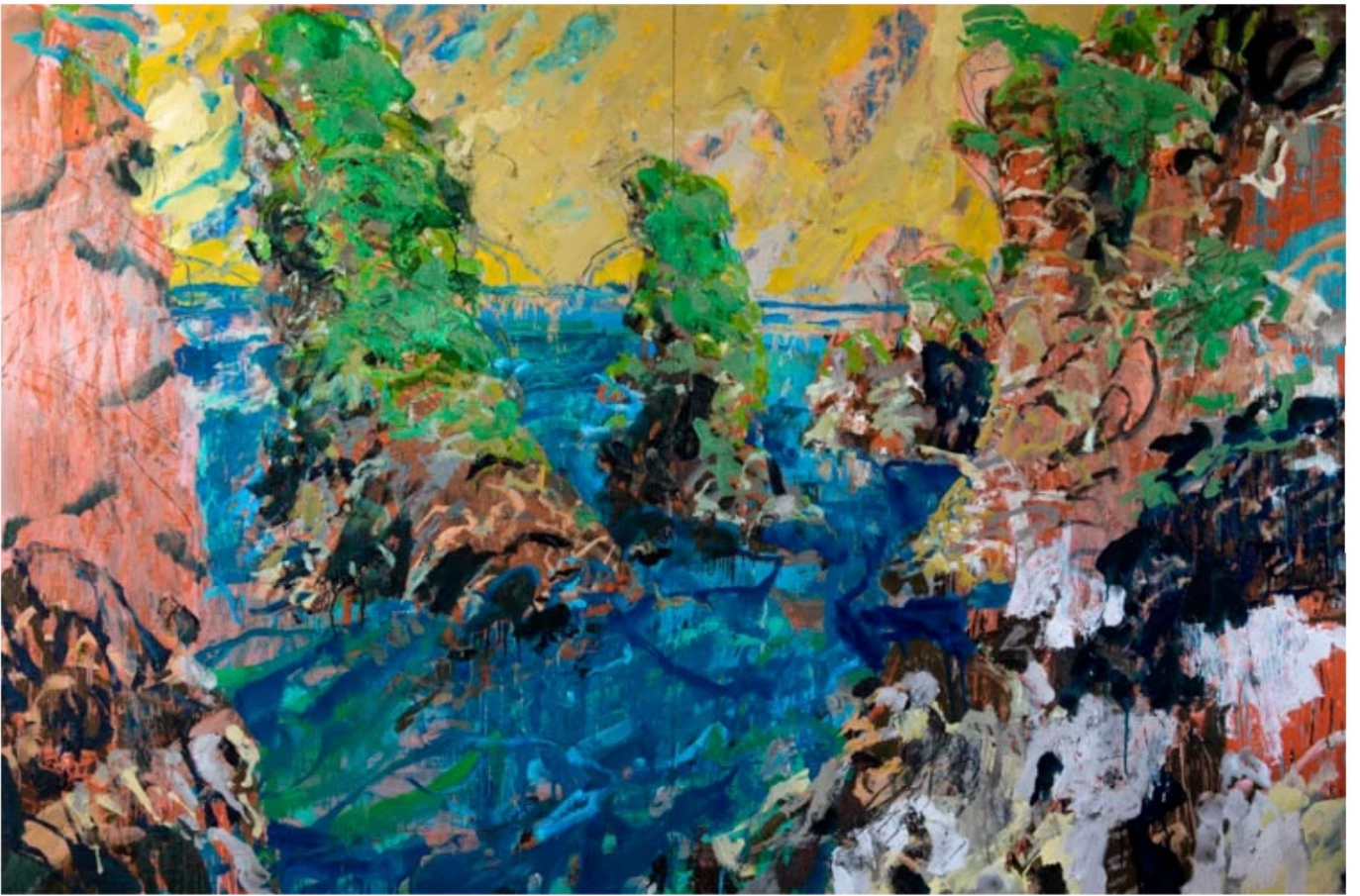
'Pinnacles Between, Belle Île', 2018, oil on board, 160 x 240cm