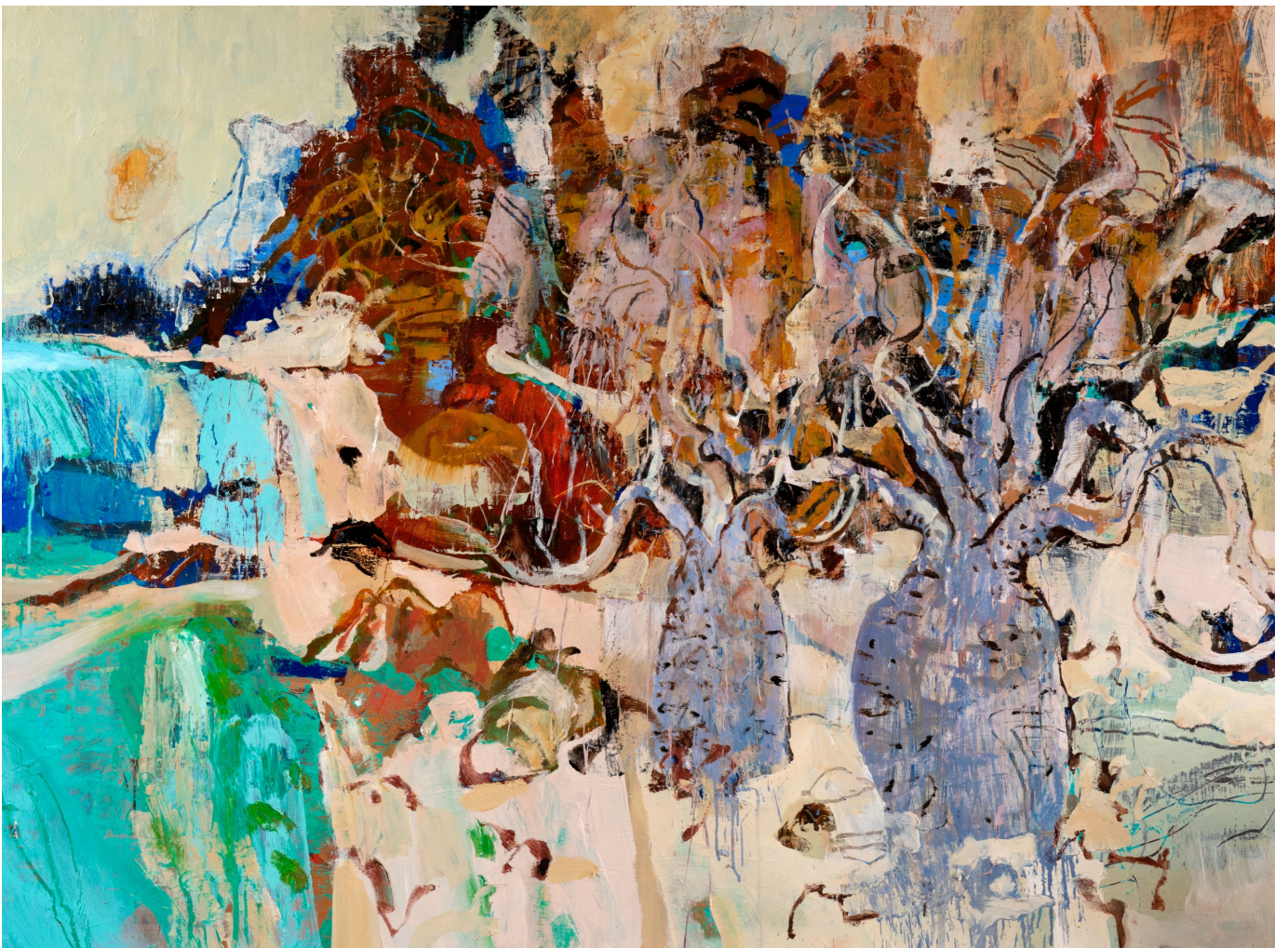
Sun up, WA, 2018, oil on board, 120 x 160cm