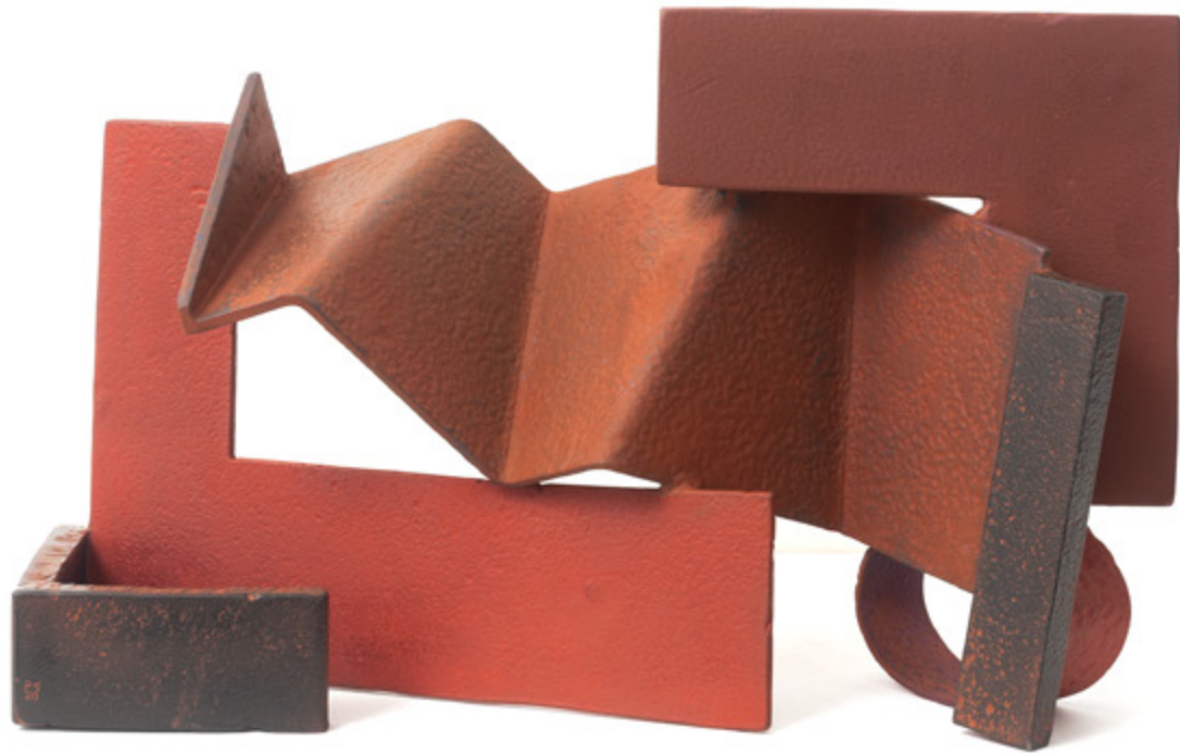
Sextet 2020 painted steel 28x46x19cm