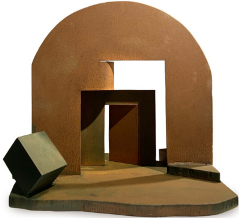
The Red Door 2021 painted steel 49.5x53.5x40cm