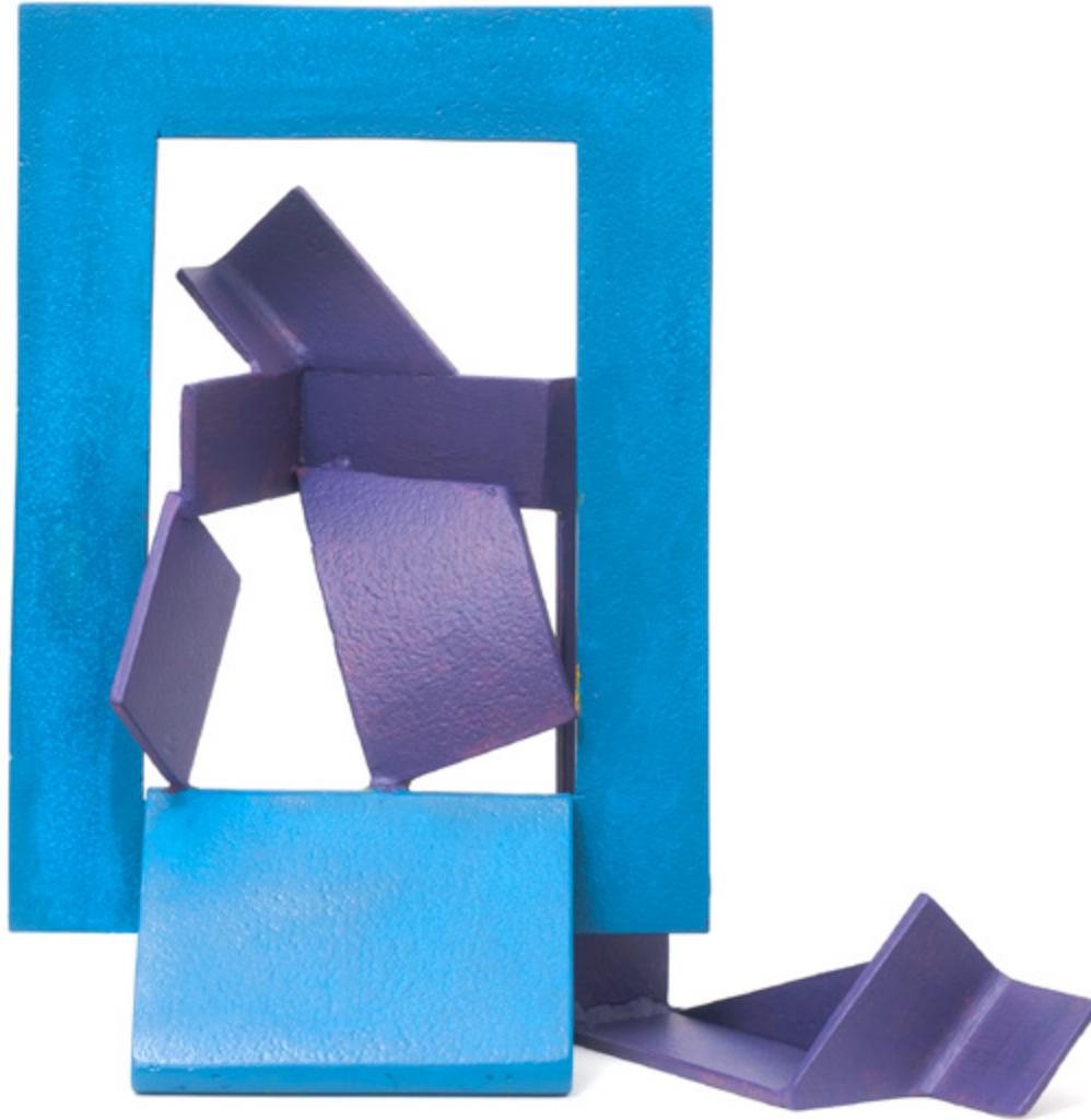
Offering 2020 painted steel 40x41x19.5cm