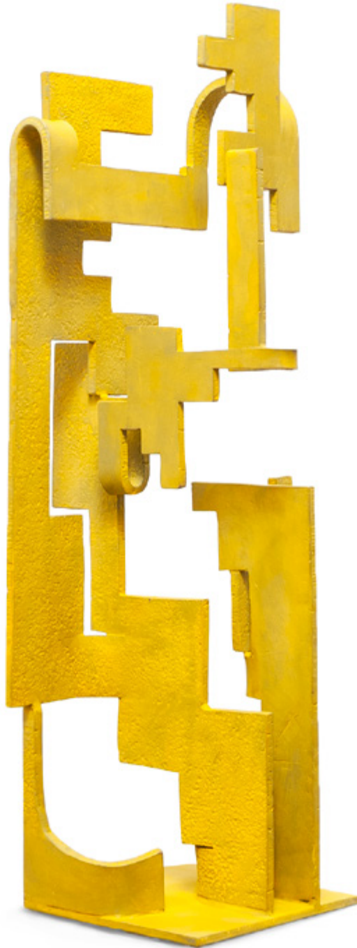
Byzantine 2020 painted steel 126x45x42cm