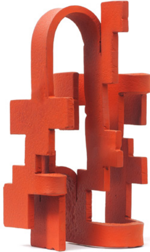
Red Ruin 2019 painted steel 39.5x25.5x21.5cm