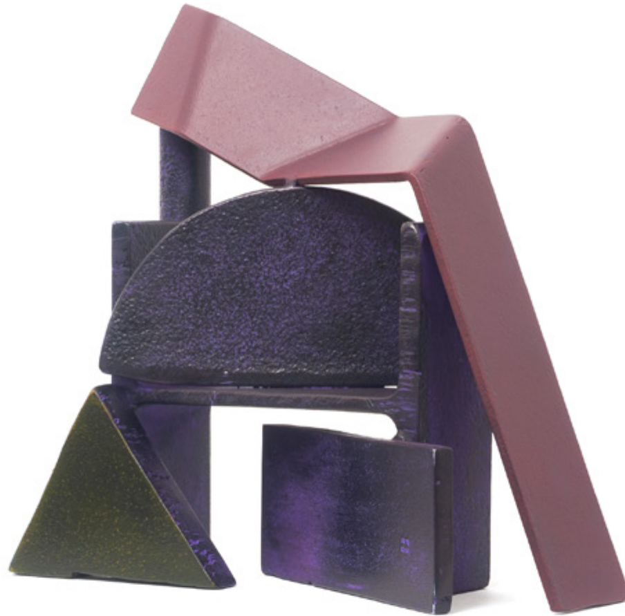
Green Triangle 2020 painted steel 34x35.5x14.5cm