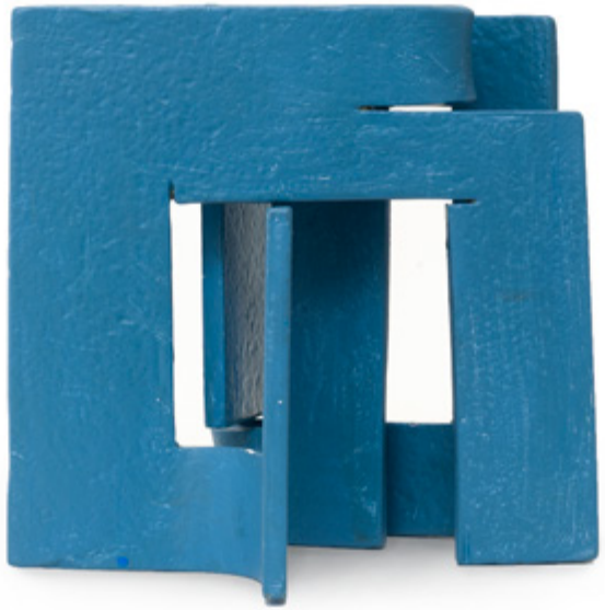
Blue Verve 2021 painted steel 14x14x15cm