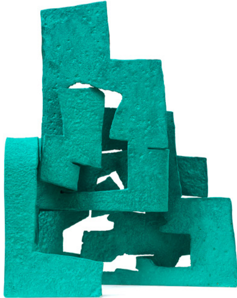
Yengo Caves 2016 painted steel 47.5x37.5x20cm