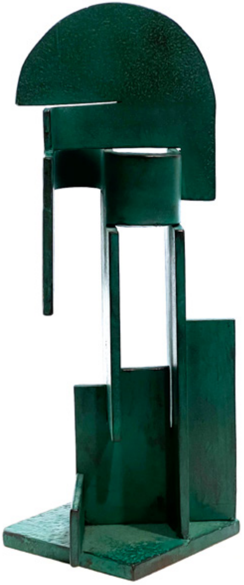
Kronos 2021 painted steel 36x20x18cm