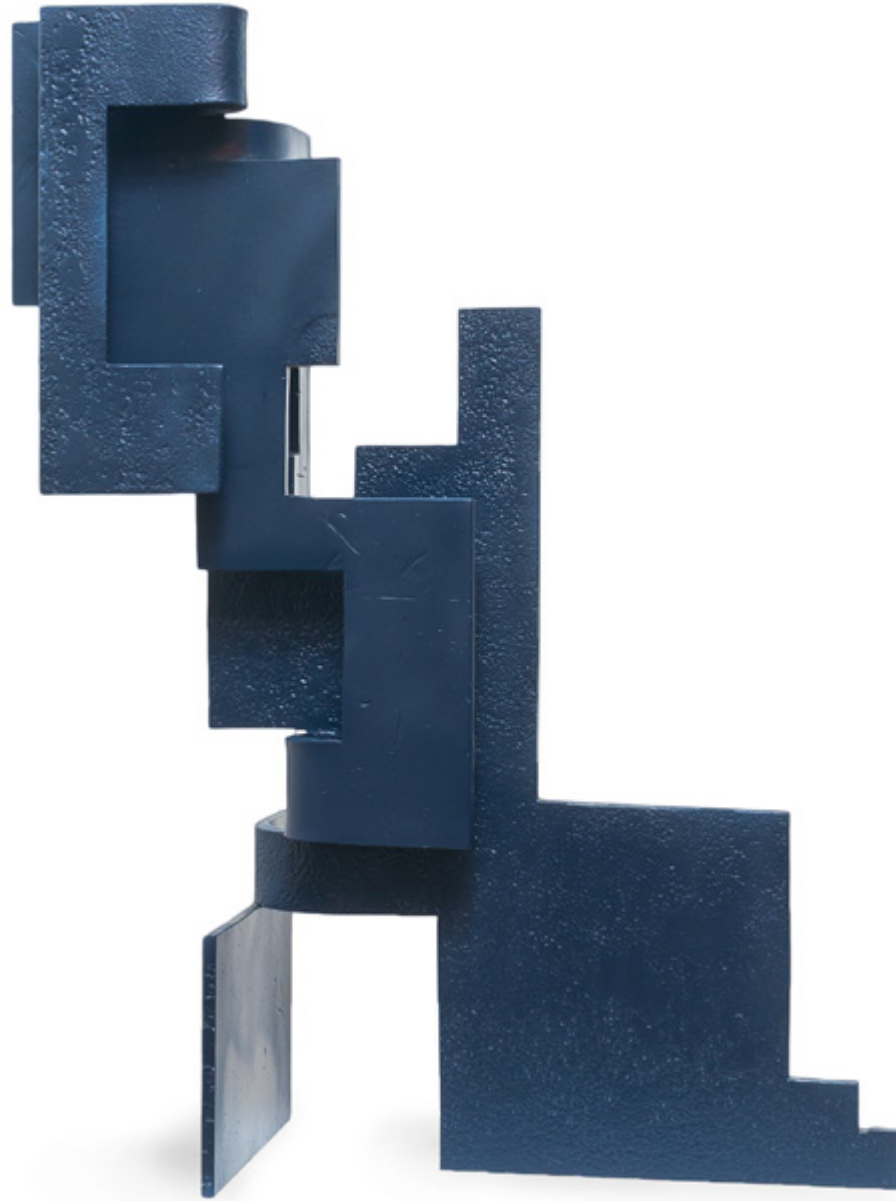
Anchorage 2020 painted steel 131x100x41.5cm