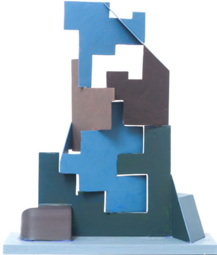
Small Tower 2021 painted steel 45.5x36x12.5cm