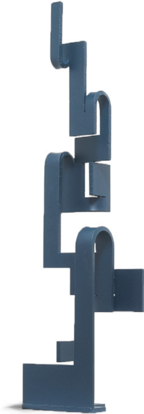
Melodic Interval 2021 painted steel 163.5x45x25cm