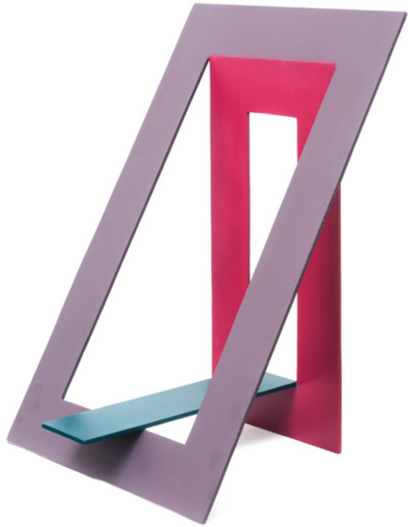
Logos 2020 painted steel 58x40x40cm