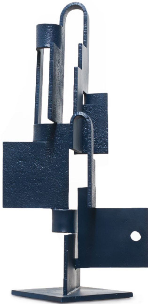
Blue Note 2021 painted steel 119x59x50cm