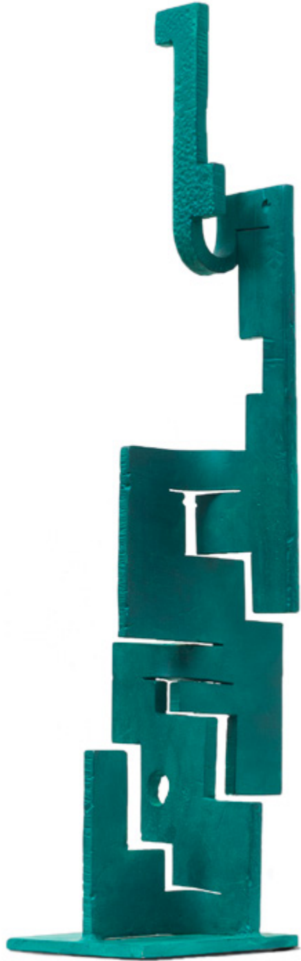
Green Reach 2020 painted steel 89x28x21cm