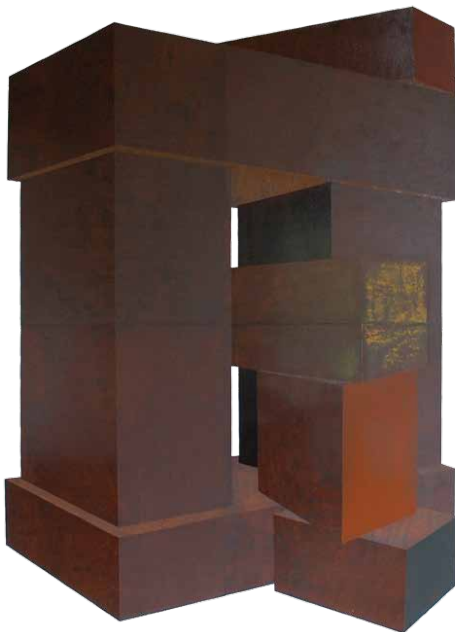
PAUL SELWOOD : A story and its telling , 2010, steel, rust and varnish, 190 x 110 cm