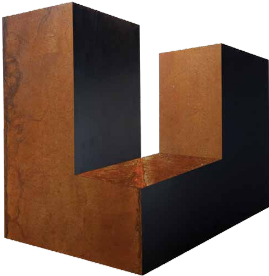
PAUL SELWOOD : A complex silence 2009, steel, varnish, 242.5 x 245cm