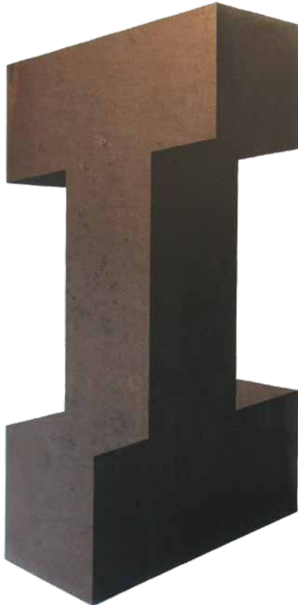
PAUL SELWOOD : Crux 2009, steel, varnish, 197.5 x 100cm