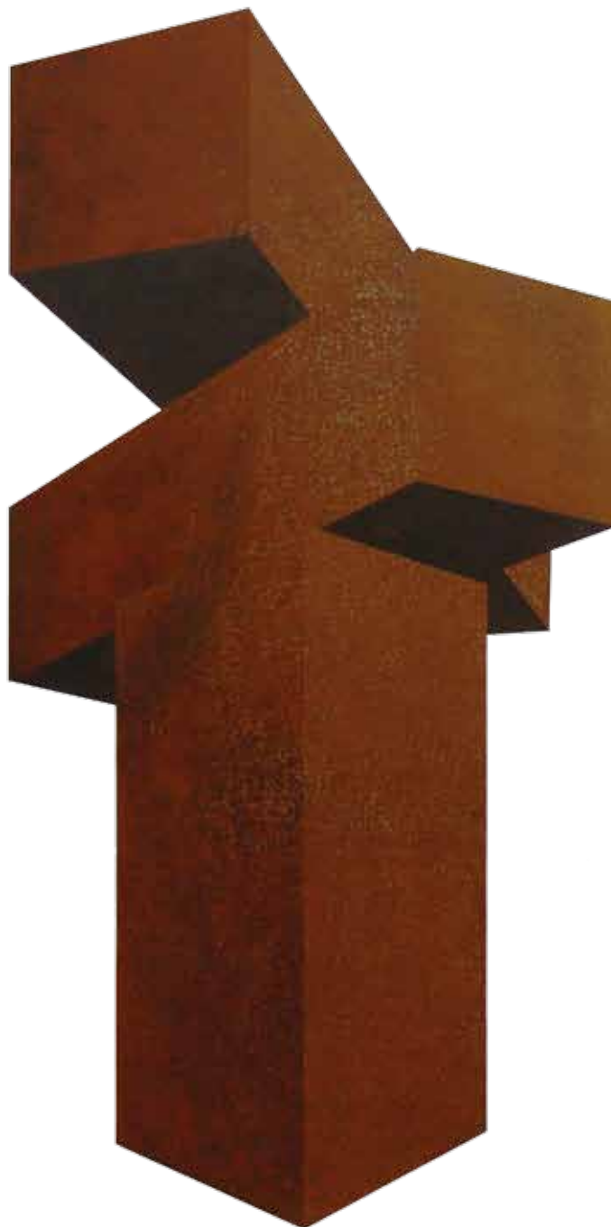
PAUL SELWOOD : Mainstay 2008, steel, varnish, 242.5 x 122.5cm