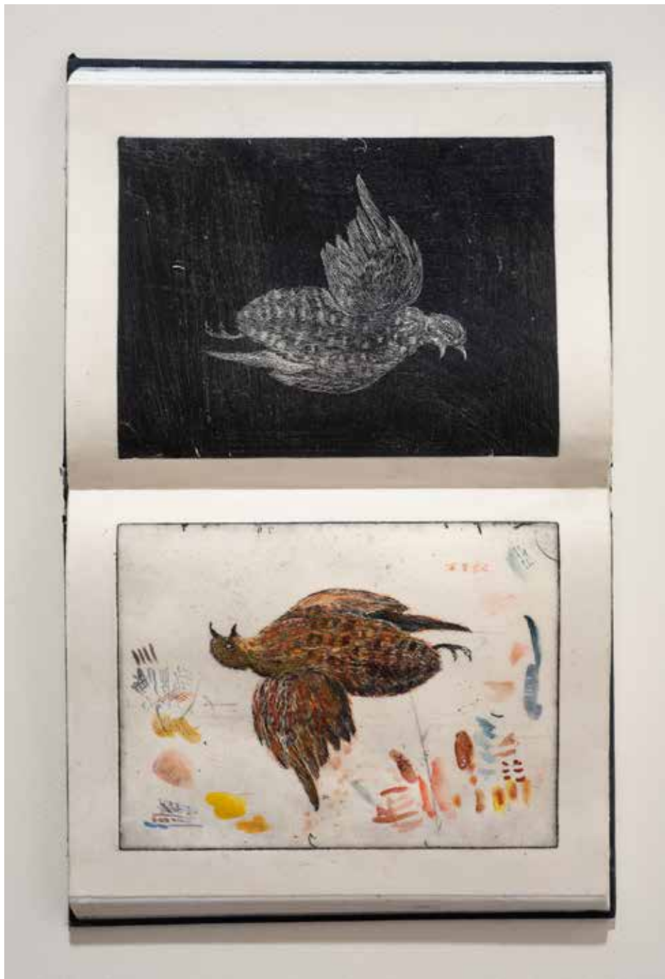
Black Thursday diaries VIII 2018 etching, relief etching, egg tempera, wax, hard cover book, ribbon 40 x 25 cm