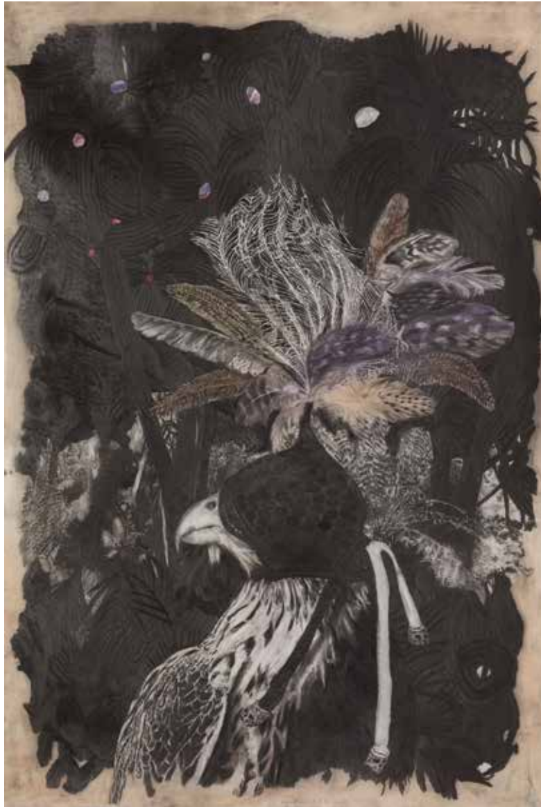
Silent witness V 2018 graphite and pigment on drafting film 125 x 95 cm