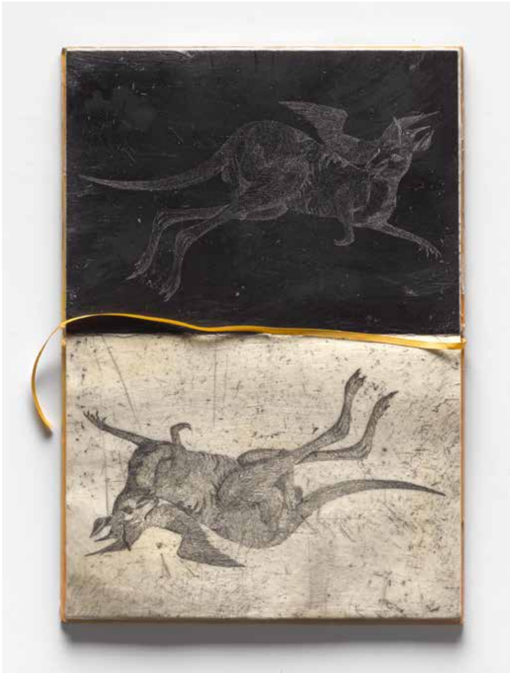
Black Thursday diaries XV 2018 etching, relief etching, egg tempura, wax, hard cover book, ribbon 52 x 30 cm