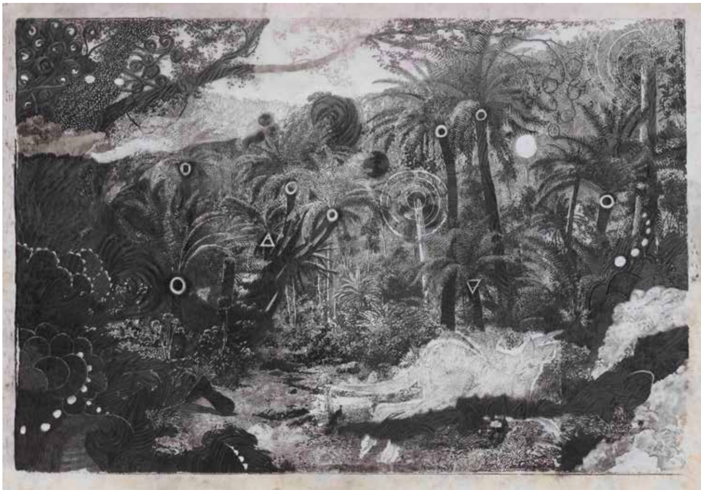
Recess II 2018 watercolour, oilstick on drafting film and paper 125 x 185 cm