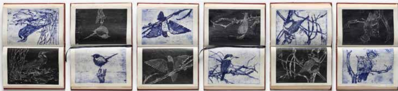
False ornithology indigo diaries 2018 etching, hard cover books, wax, ribbon 33 x 125 cm