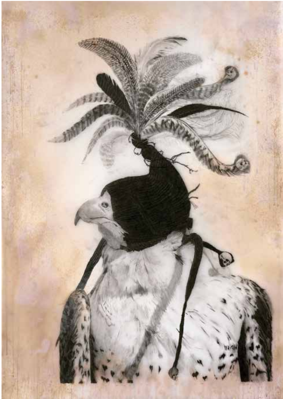
Imperfectly known 2018 graphite on drafting film, pigment on paper 159 x 110 cm