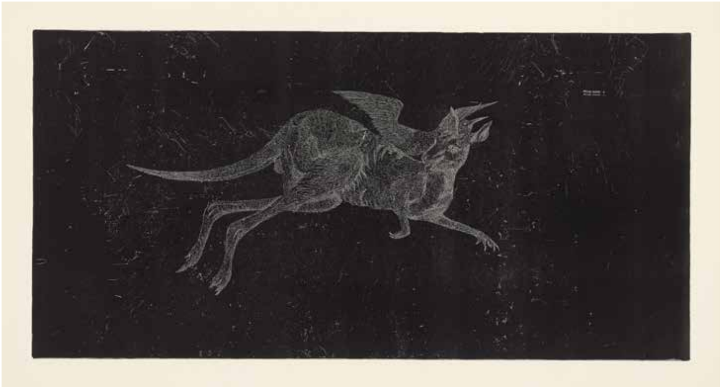
Night study for black Thursday 2018 etching 30 x 60 cm