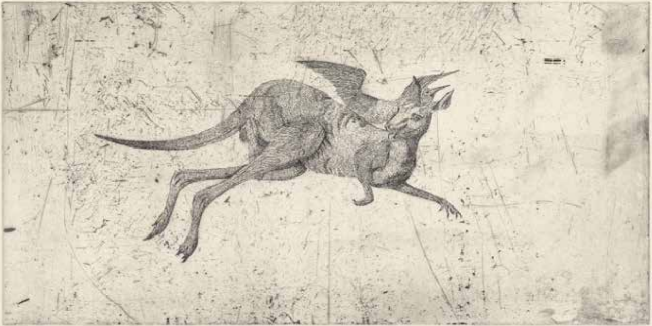
Study for black Thursday 2018 etching 30 x 60 cm