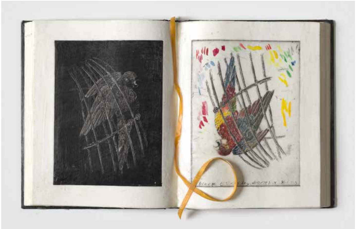
Black Thursday V 2018 etching, relief etching, egg tempura, wax, hard cover book, ribbon 25 x 40 cm