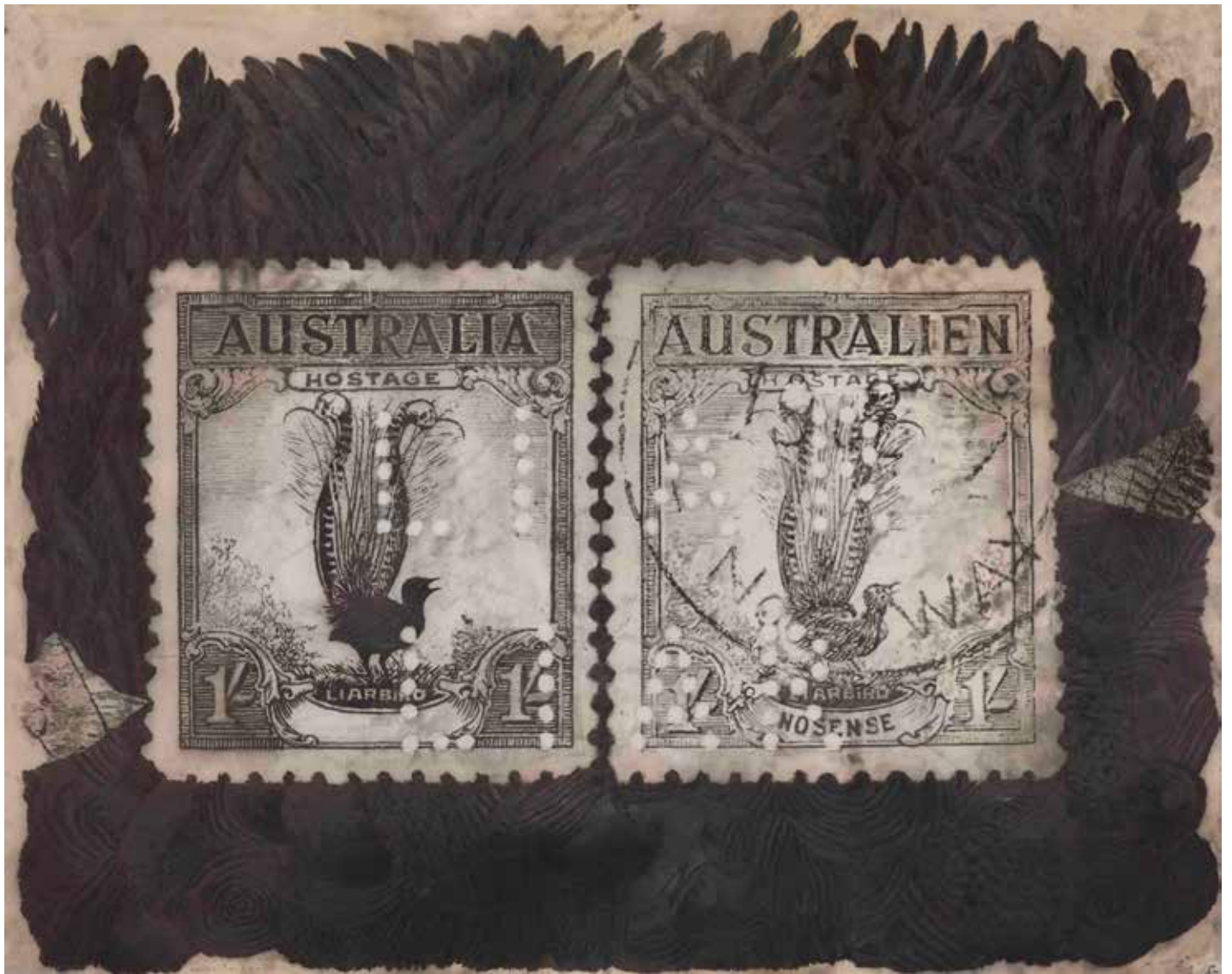
Recess, green mist black: double vision 2018 graphite on drafting film, watercolour and pigment on paper 95 x 125 cm