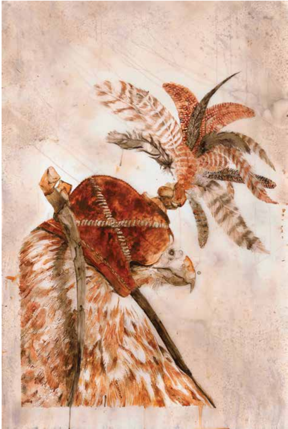
Blind faith II 2018 graphite on drafting film, pigment on paper 159 x 109.5 cm