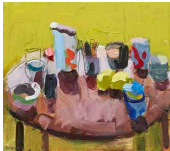
Water jug and pencils 2020 oil on board 25 x 28 cm