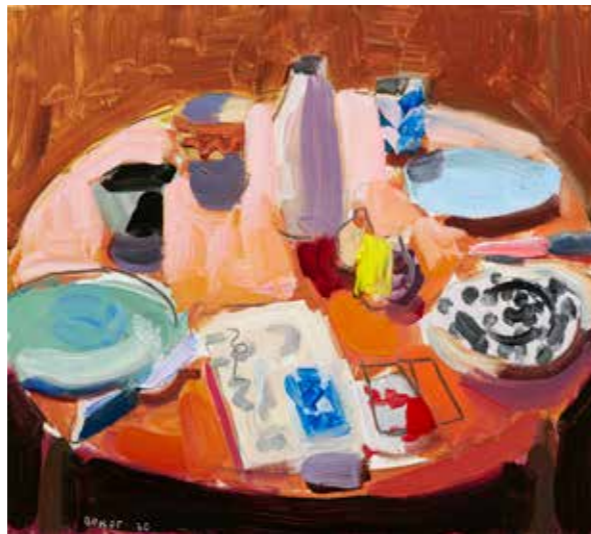
Two blue plates 2020 oil on board 27 x 30 cm