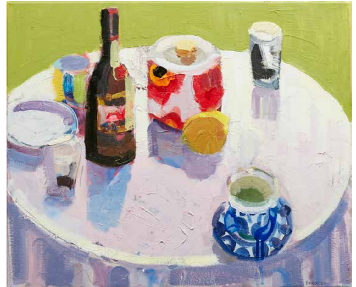
Brandy and tea 2020 oil on canvas 50 x 60 cm