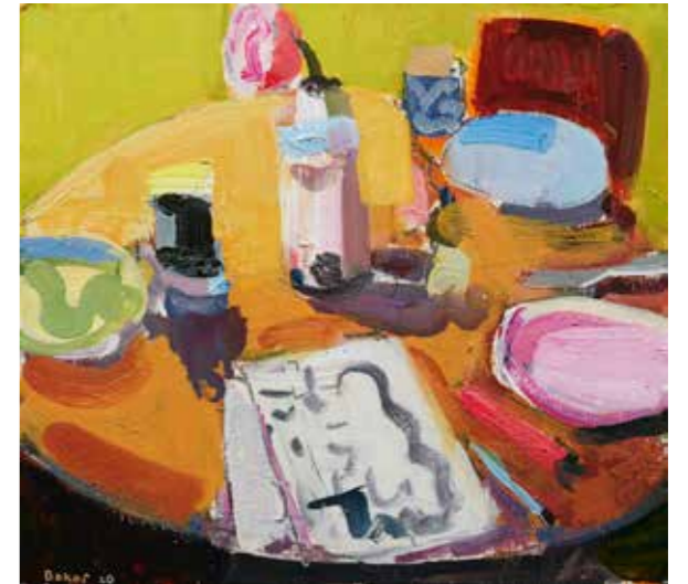
Afternoon rose study 2020 oil on board 25 x 28 cm