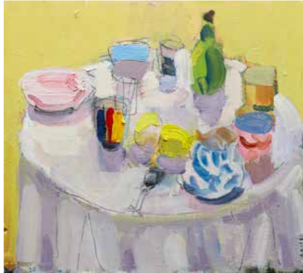
Spoonful of sugar 2020 oil on board 27 x 30 cm