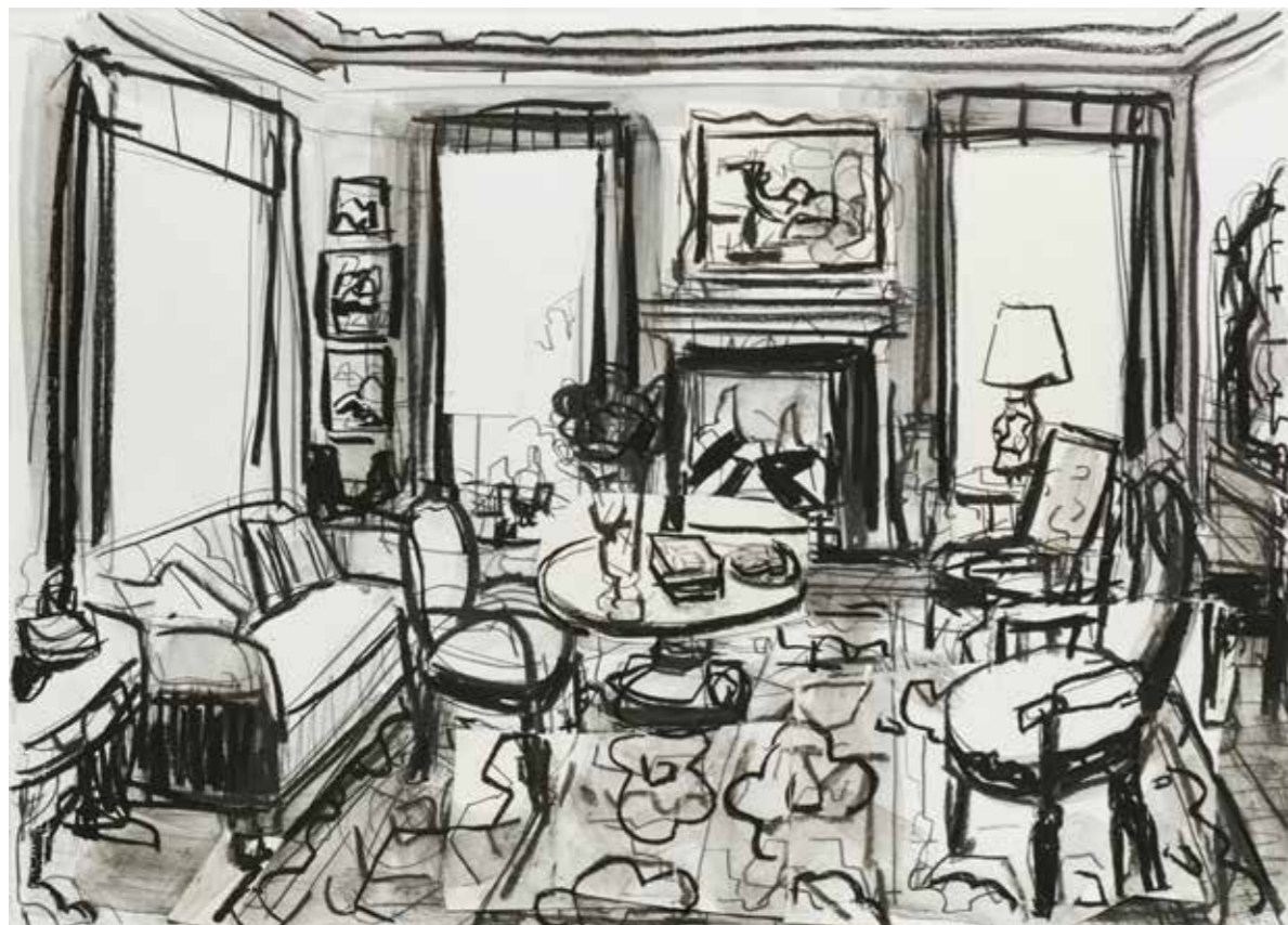
Autumn interior 2020 charcoal, wash and collage on paper 56 x 76 cm