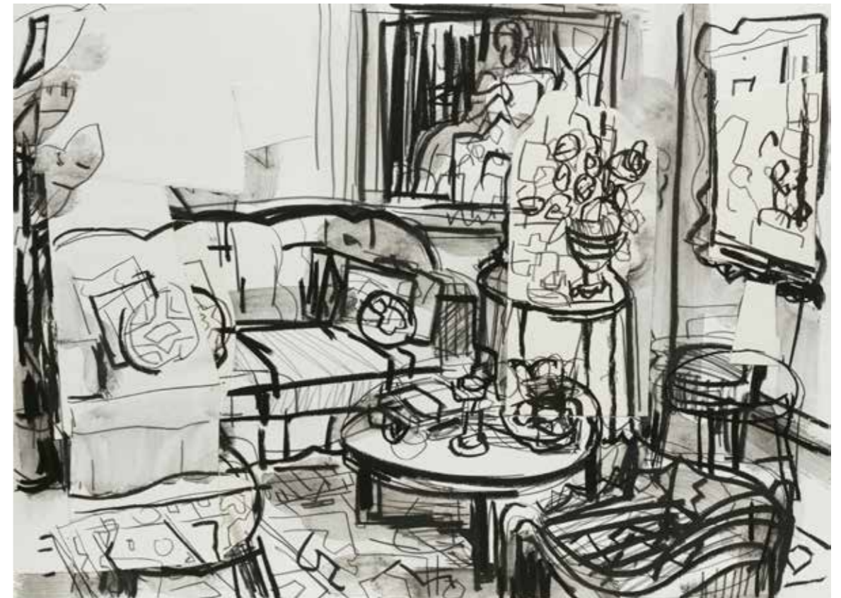
The sitting room 2020 charcoal, wash and collage on paper 56 x 76 cm