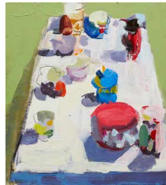
Afternoon tea study 2020 oil on board 28 x 25 cm