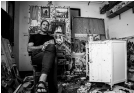
Studio, 2020