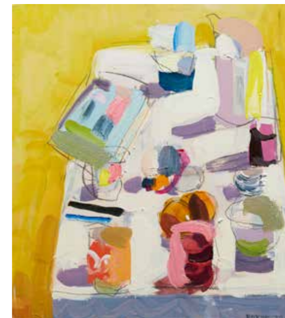
Yellow still life 2020 oil on board 28 x 25 cm