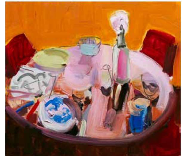
Drawing at the table 2020 oil on board 25 x 28 cm