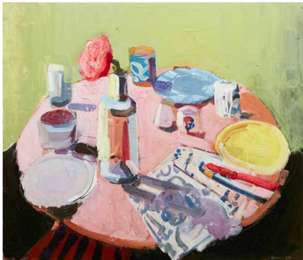
Afternoon rose 2020 oil on board 60 x 70 cm