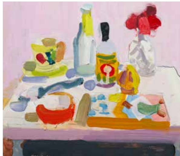
Gypsy plate 2020 oil on board 27 x 30 cm