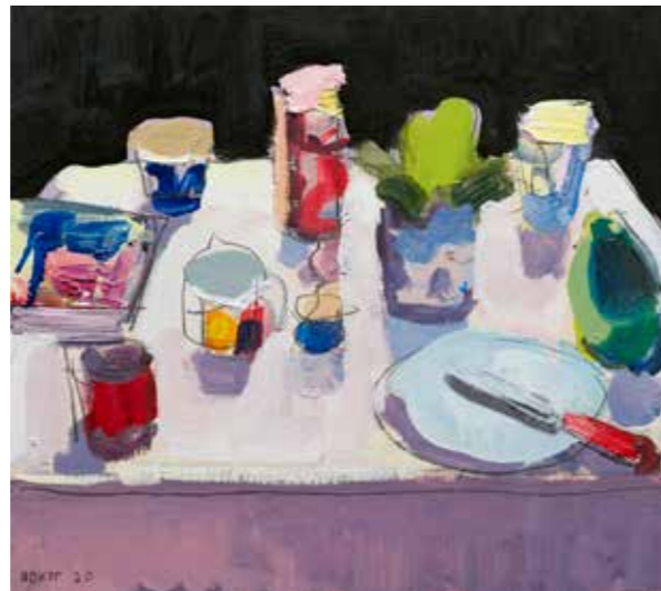
Knife and blue plate 2020 oil on board 25 x 28 cm