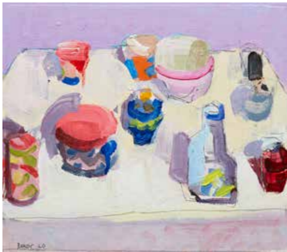
Biscuit tin study 2020 oil on linen on board 27 x 30 cm