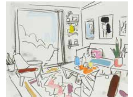
Colour study, after the rain

2020 carbon pencil, wash and oil on paper 21 x 27 cm