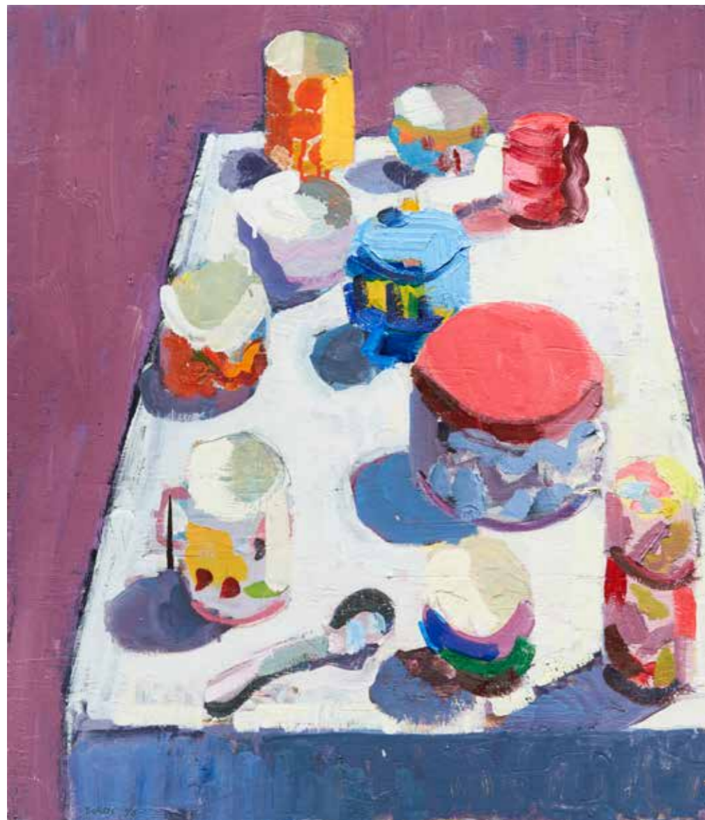
Afternoon tea 2020 oil on board 70 x 60 cm