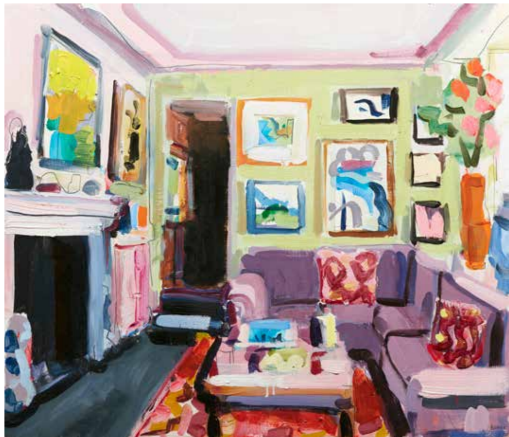
Gin and tonic 2020 oil on board 60 x 70 cm