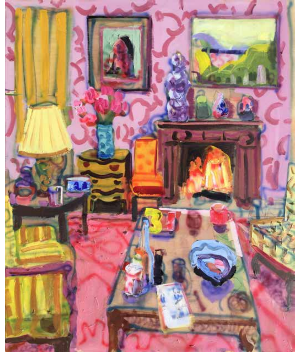
Fireplace 1965 2020 oil on board 120 x 100 cm