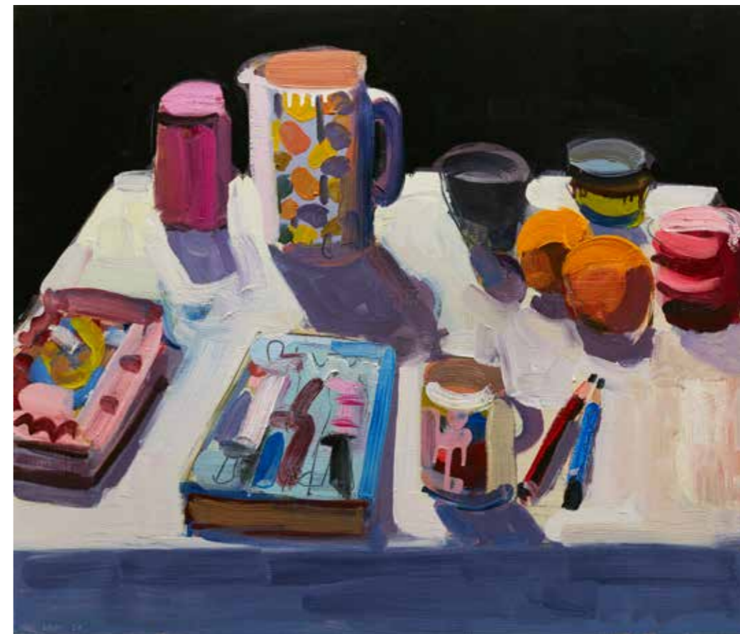
Pencils and oranges 2020 oil on board 60 x 70 cm