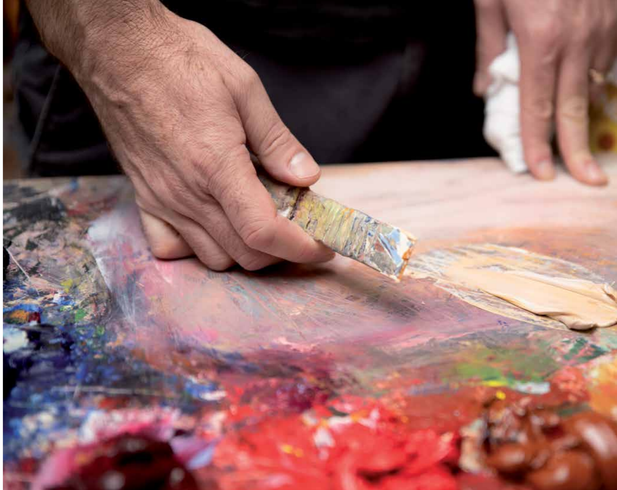
Studio, 2020