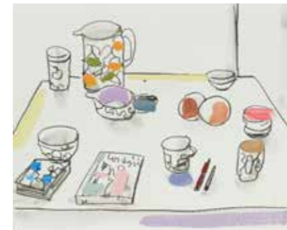
Colour study with water jug