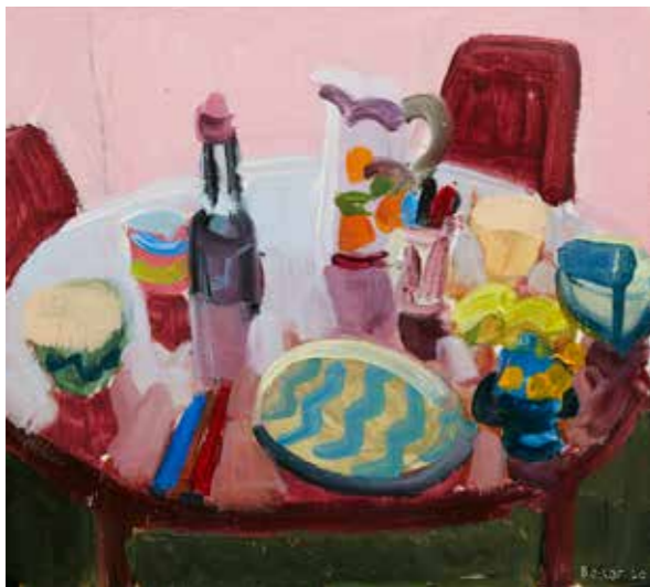
Patterned plate 2020 oil on board 25 x 28 cm