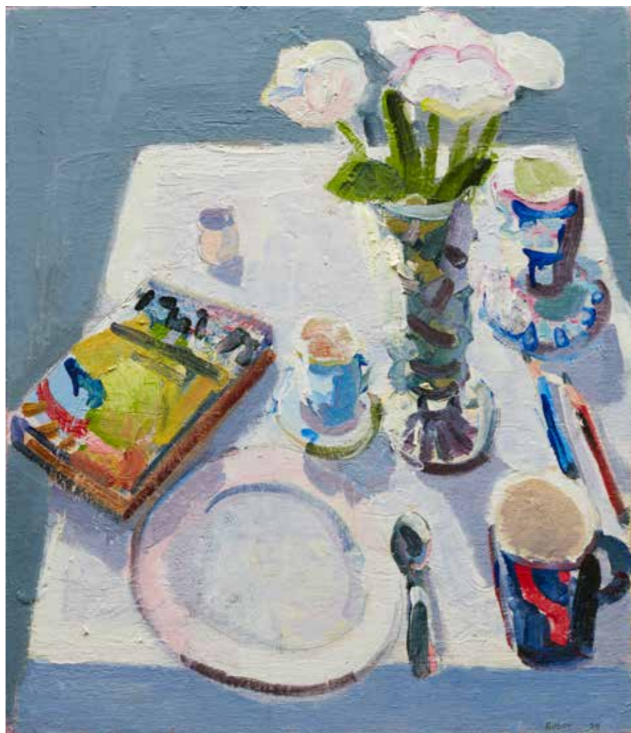
White flowers 2020 oil on board 70 x 60 cm