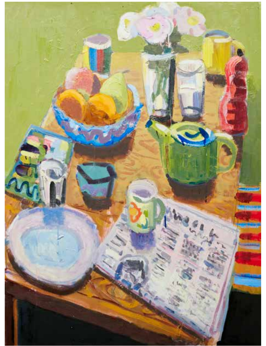
The newspaper 2020 oil on canvas 122 x 100 cm