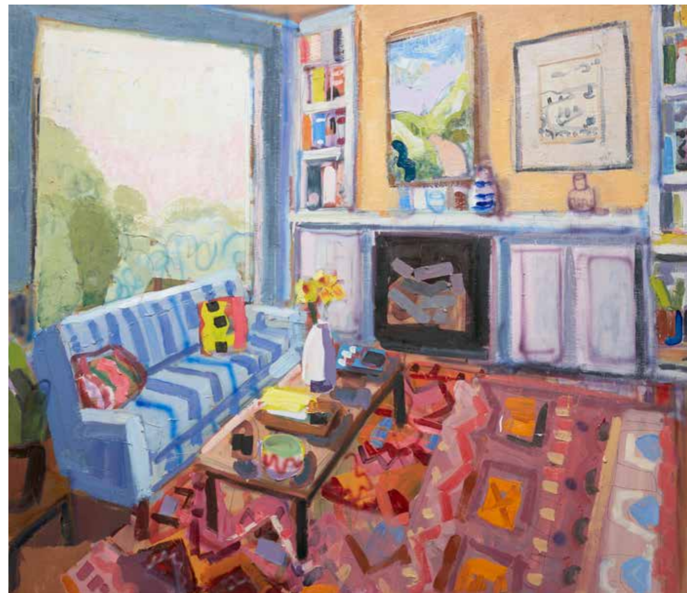
Country escape 2020 oil on board 120 x 140 cm