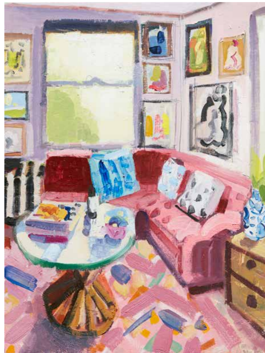
Glass table top 2020 oil on board 80 x 60 cm