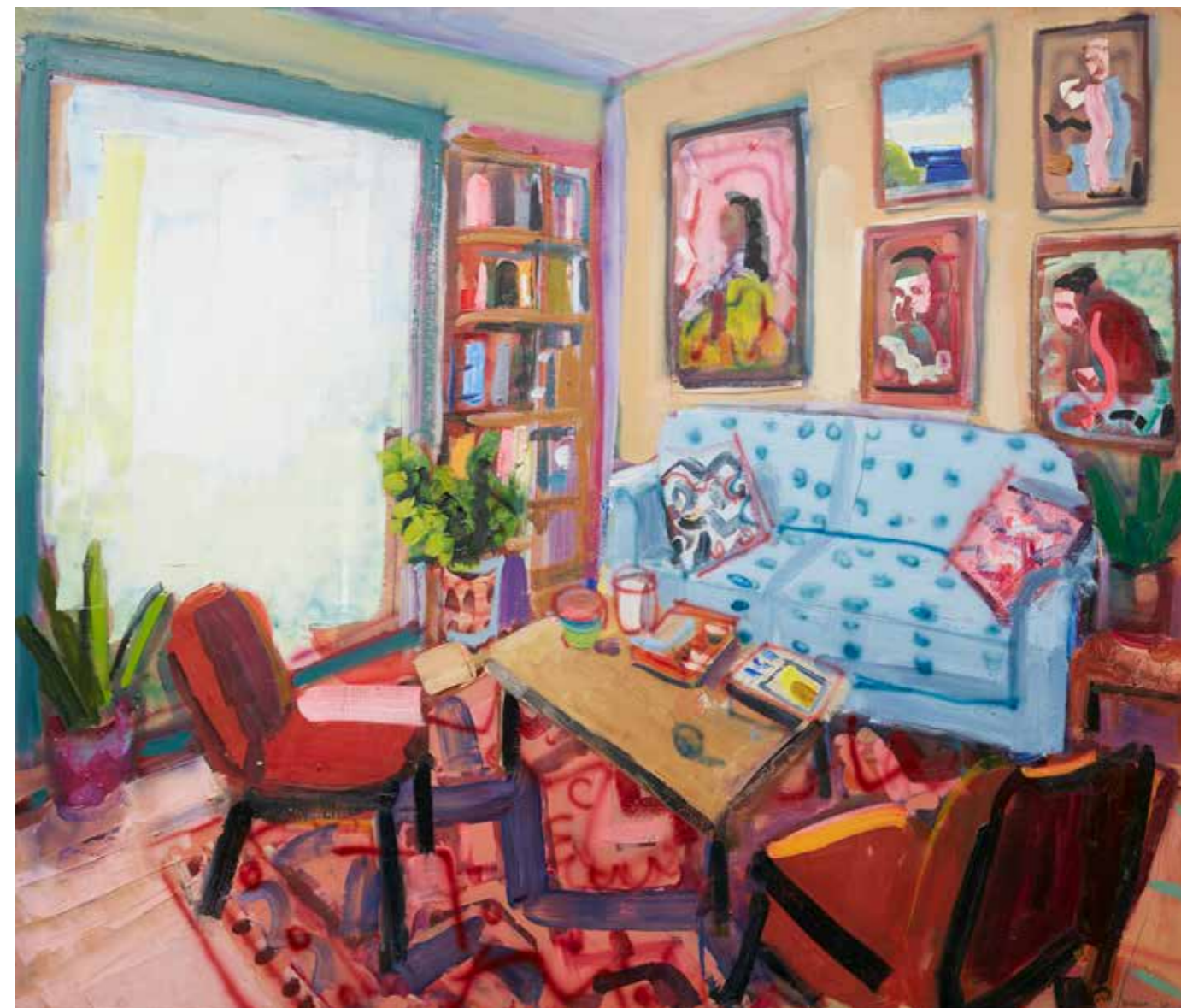
Memories of Spain 2020 oil on board 120 x 140 cm