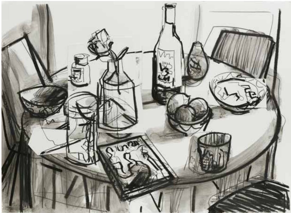
A single rose 2020 charcoal, wash and collage on paper 56 x 76cm