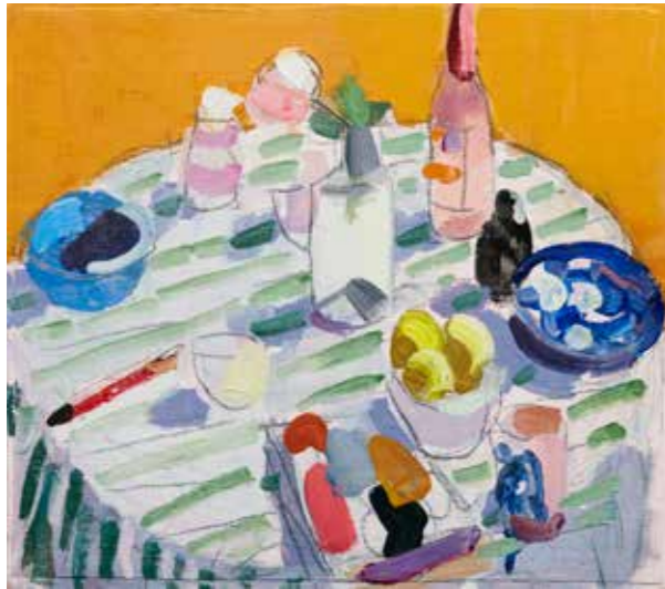
Rose and lemons 2020 oil on linen on board 27 x 30 cm