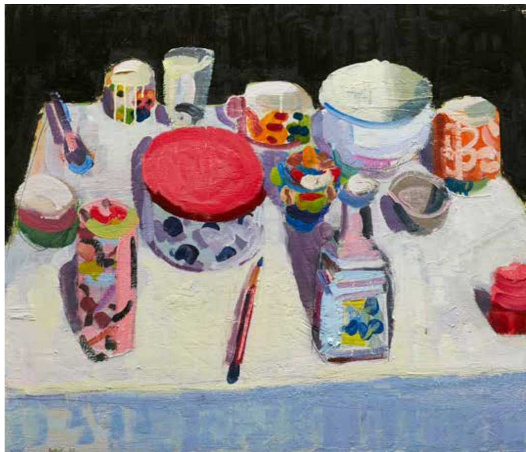
Biscuit tin 2020 oil on board 60 x 70 cm