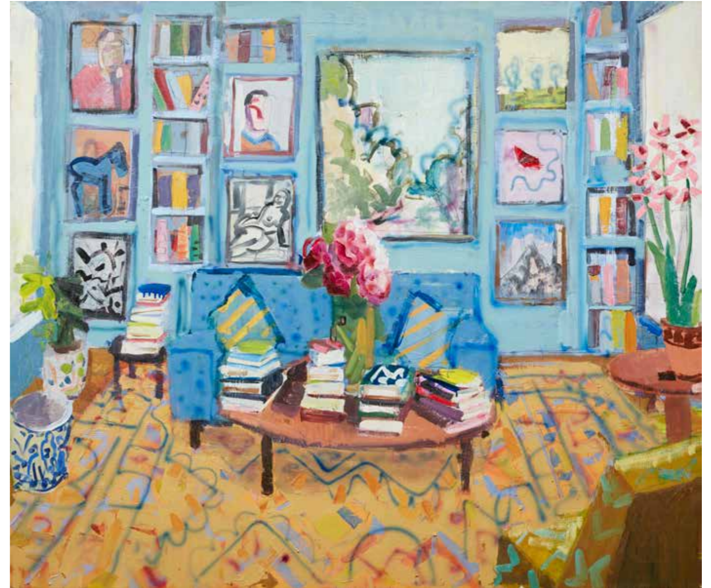
Blue interior 2020 oil on board 120 x 140 cm