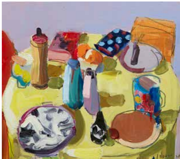
Spotted napkin 2020 oil on board 27 x 30 cm