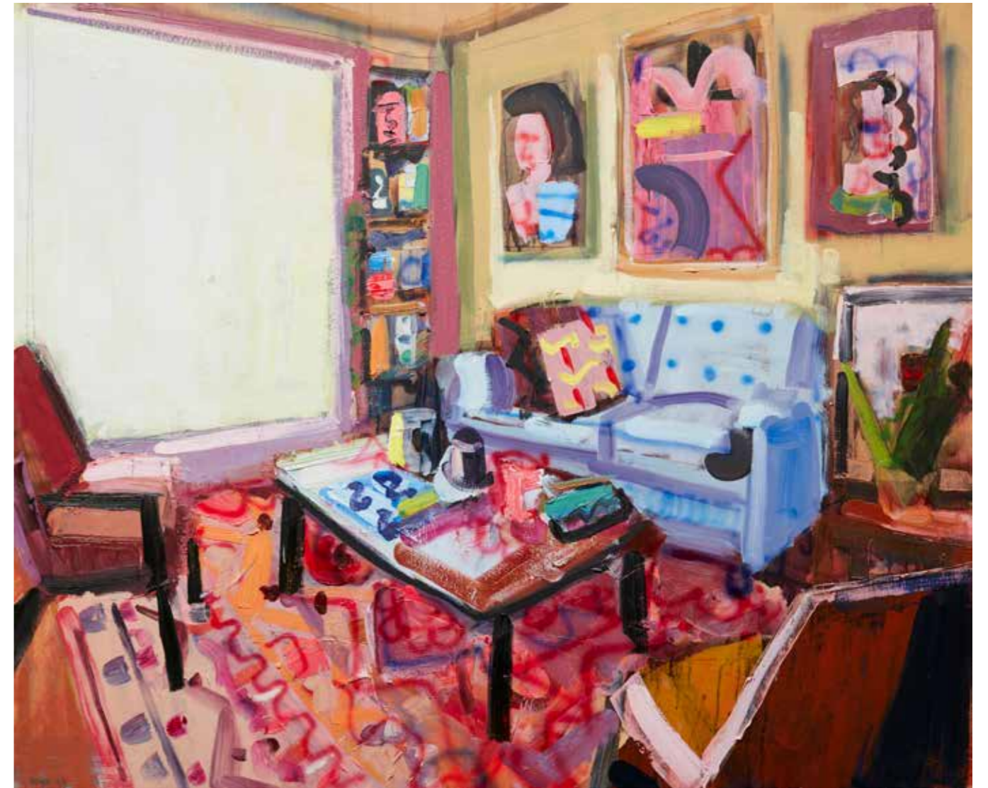
After the rain 2020 oil on board 100 x 120 cm