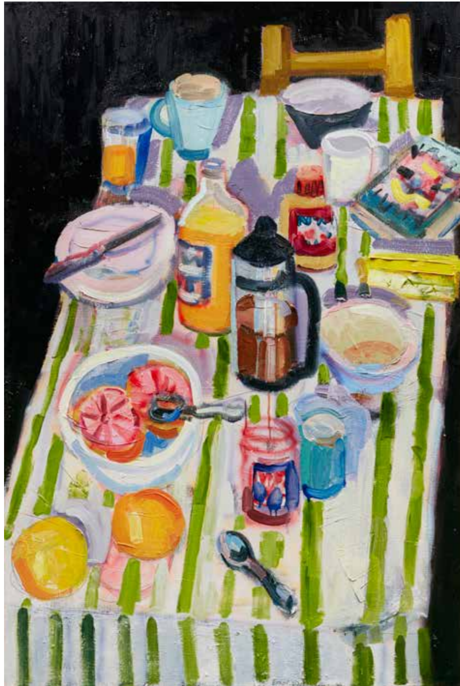
Breakfast table 2020 oil on linen 137 x 92 cm