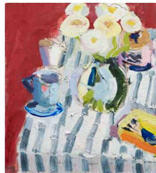
Poppies 2020 oil on board 28 x 25 cm