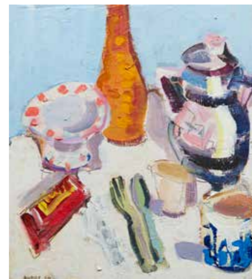
Chocolate bar and silver pot 2020 oil on board 28 x 25 cm