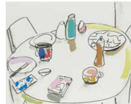
Colour study with pepper mill