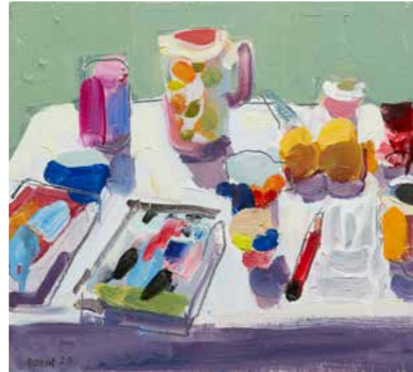
Water jug and books 2020 oil on board 25 x 28 cm