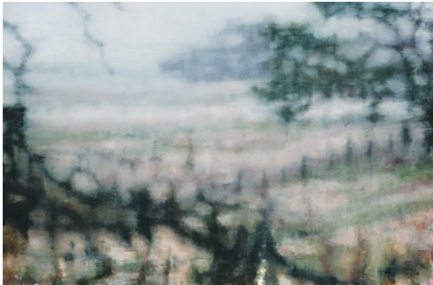
Essington - Field I 2010 Oil on linen 122 x 183cm