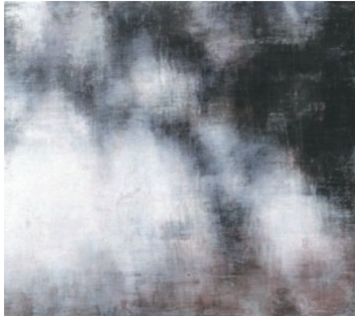
Winter Gums (Diptych) 2010 Oil on board 40 x 90cm