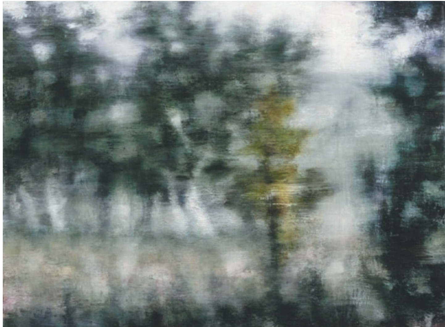
Essington - Paddock I 2010 Oil on linen 61 x 81cm