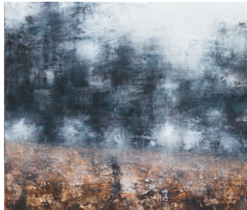
Tree Line Study 2010 Oil on canvas 30x35cm