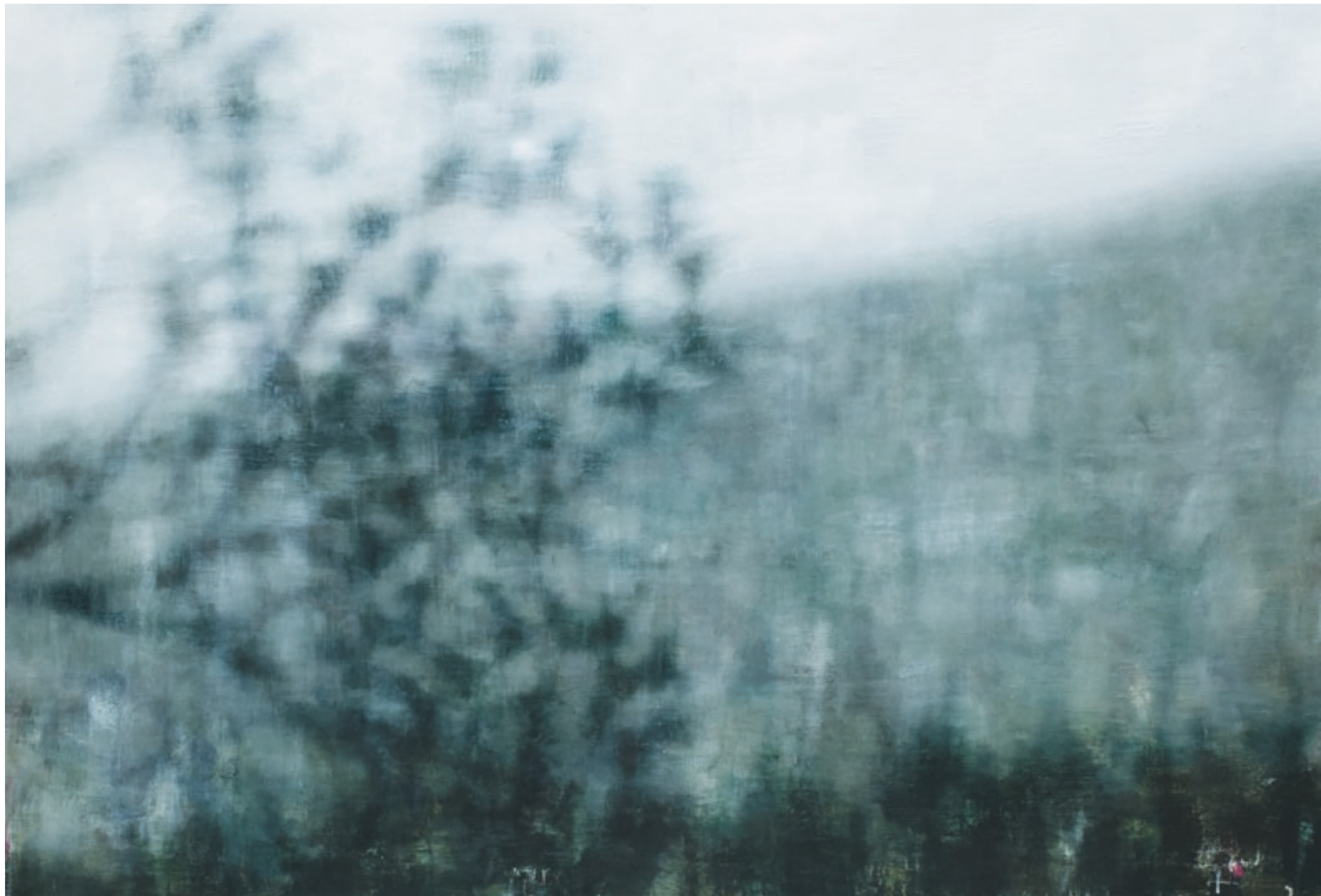
Window-I 2010 Oil on Linen 137 x 198cm