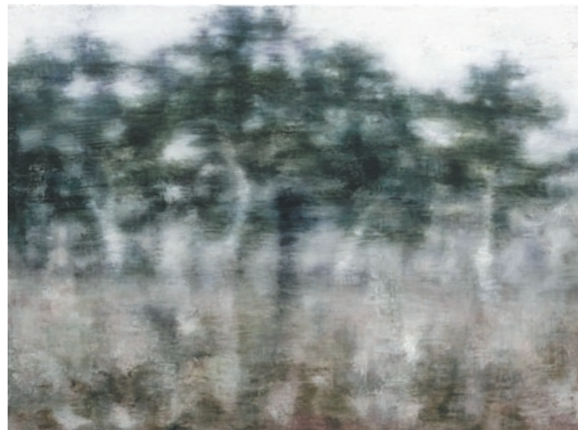
Essington - Paddock II 2010 Oil on linen 61 x 81cm