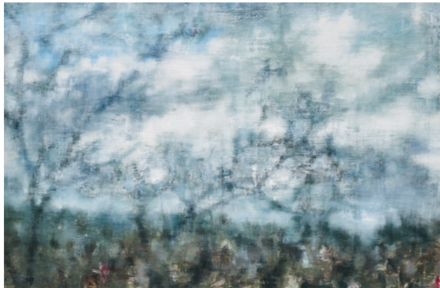
Window-IV 2010 Oil on Linen 122 x 183cm