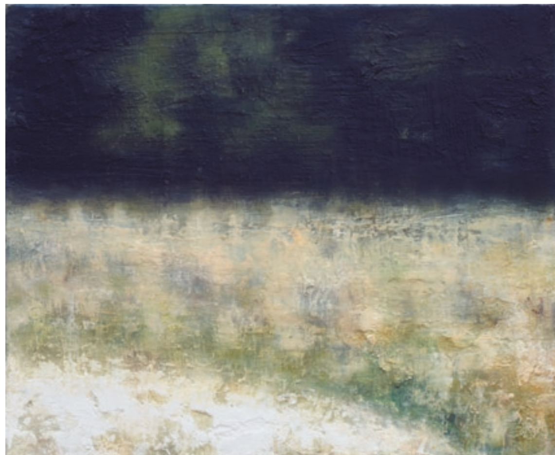
Forest – Track 2010 Oil on canvas 45 x 55cm