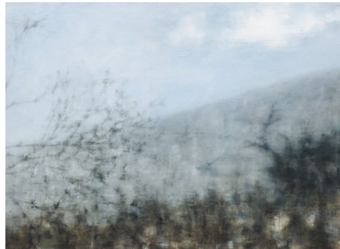
Essington Window VII 2010 Oil on linen 122 x 183cm