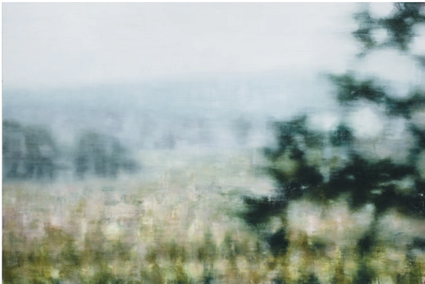
Essington - Field III 2010 Oil on linen 122 x 183cm