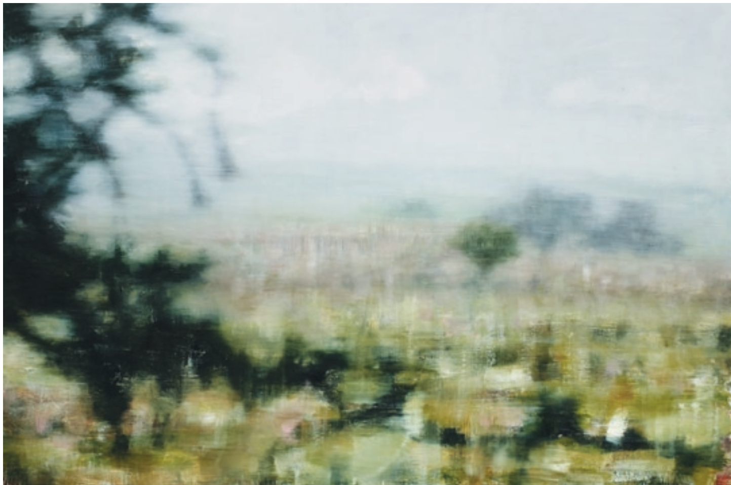
Essington – Field II 2010 Oil on linen 122 x 183cm