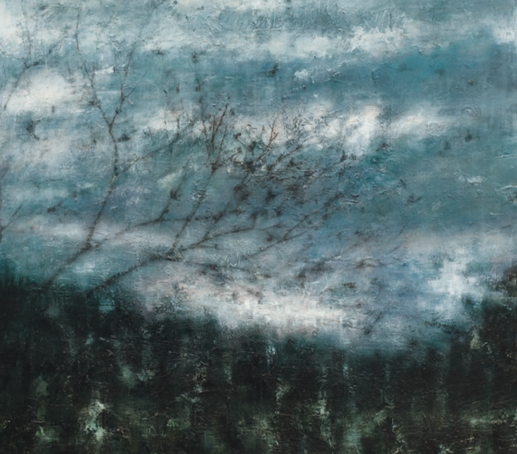
Window-III 2010 Oil on Board 120 x 120cm