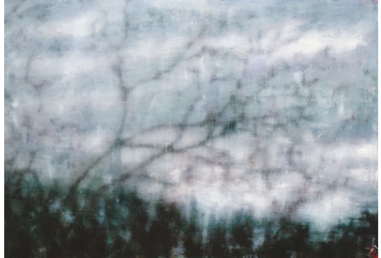
Essington - Window II 2010 Oil on linen 137 x 198cm