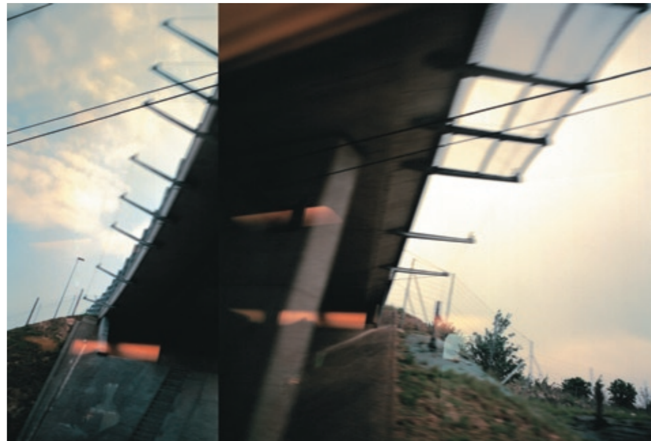
Shelter 338 Lamda print 100 x 145cm Edition of 7 2008