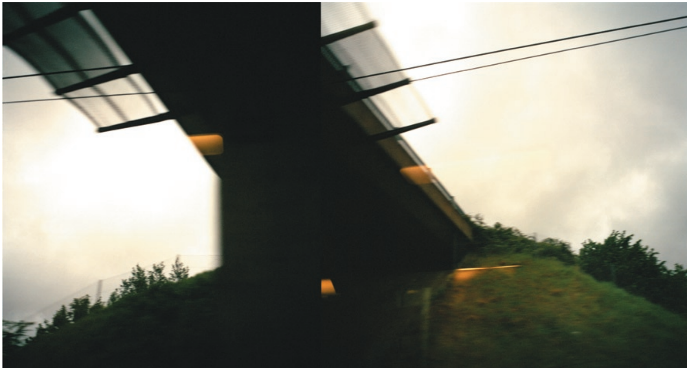
Shelter 336 Lamda print 100 x 180cm Edition of 7 2008