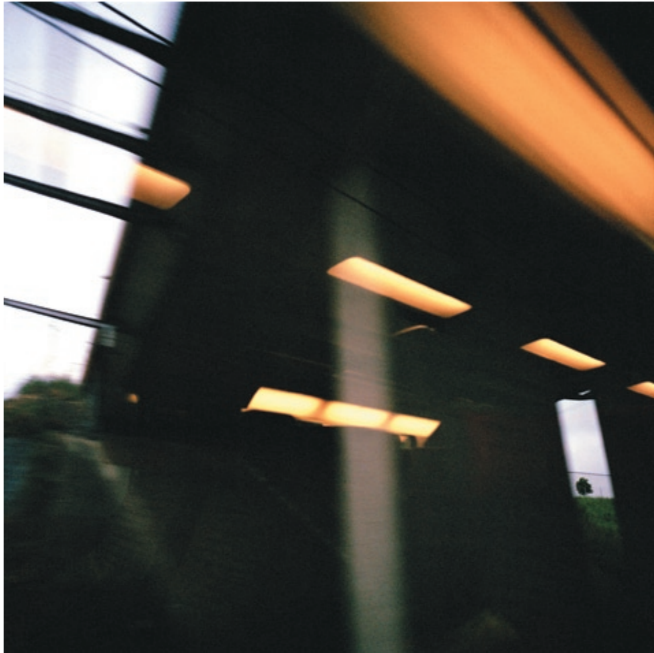
Shelter 339 Lamda print 100 x 100cm Edition of 7 2008