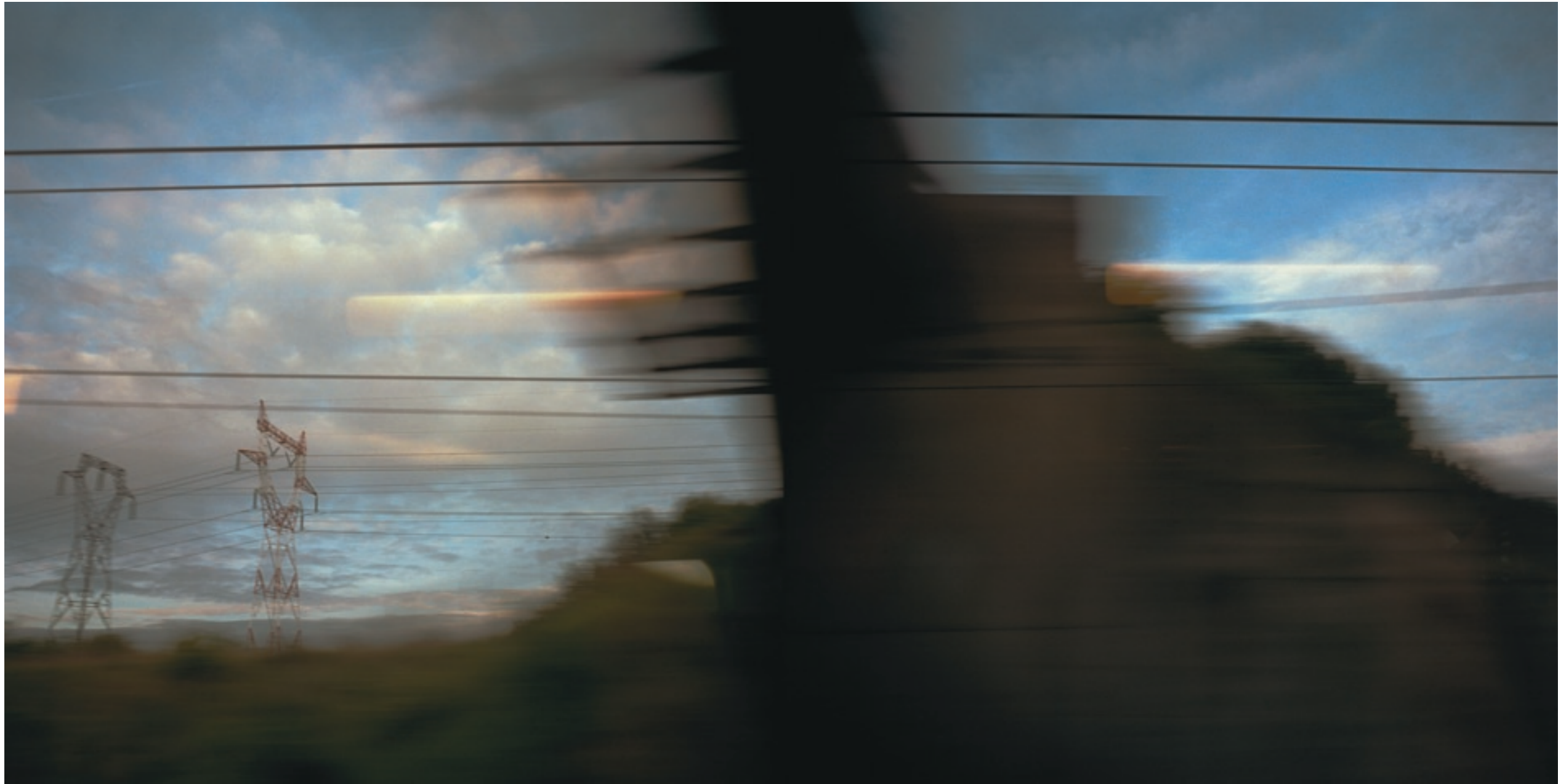
Shelter 331 Lamda print 100 x 200cm Edition of 7 2008