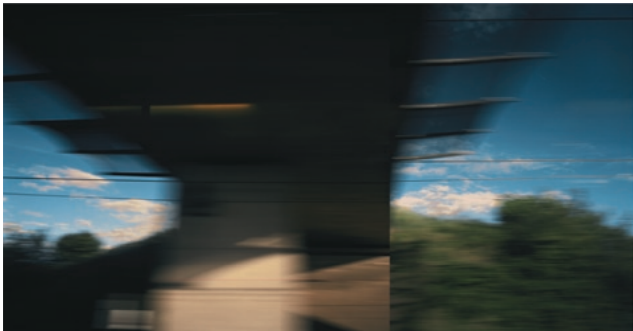
Shelter 333 Lamda print 100 x 160cm Edition of 7 2008