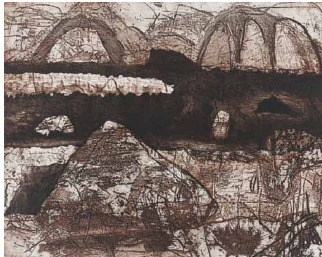
Near Halls Creek Edition of 20 2007 Etching 30 x 35cm