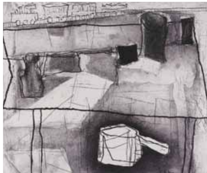
Saucepan Edition of 15 2001 Etching 21 x 24.5cm