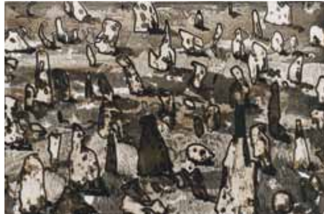
Termite Mounds Edition of 25 2009 Etching 33 x 49.5cm