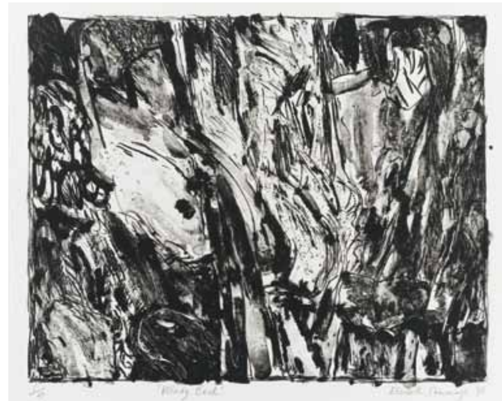
Windy Bush Edition of 10 1995 Lithograph 45 x 58cm