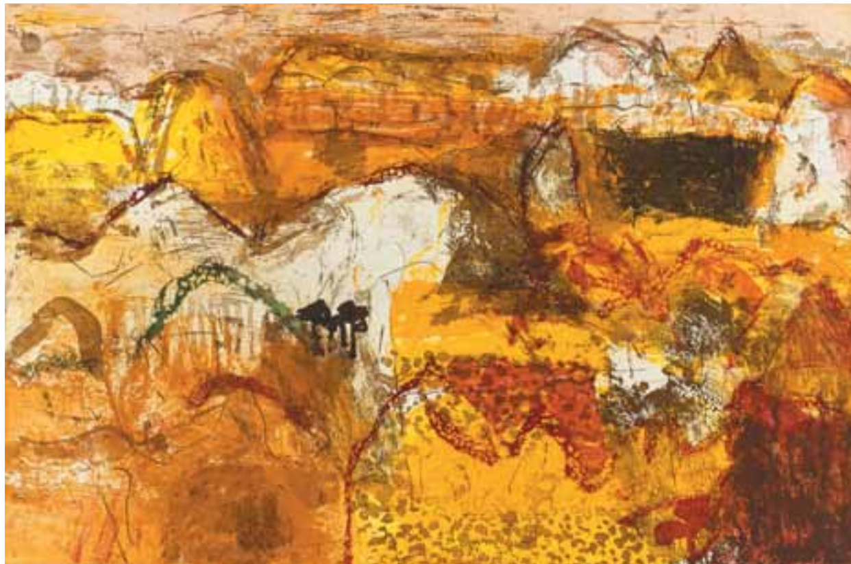
Simpson Desert Edition of 25 2007 Etching 34 x 50cm