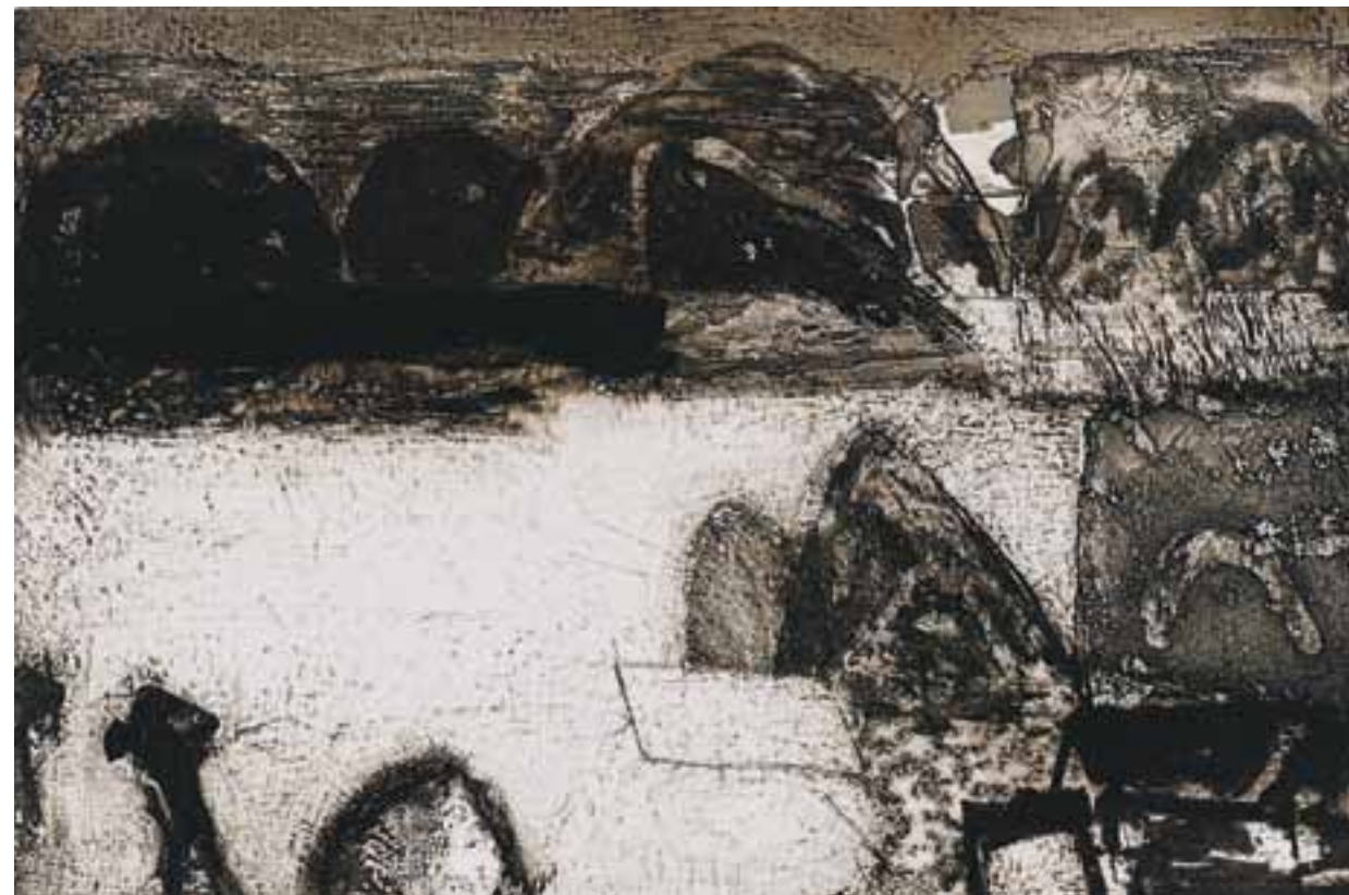
Mountain Property Edition of 25 2009 Etching 33.5 x 50cm