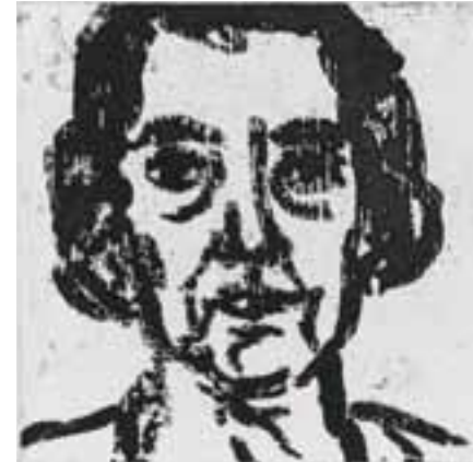
Self Portrait Edition of 10 2005 Etching 5 x 5cm