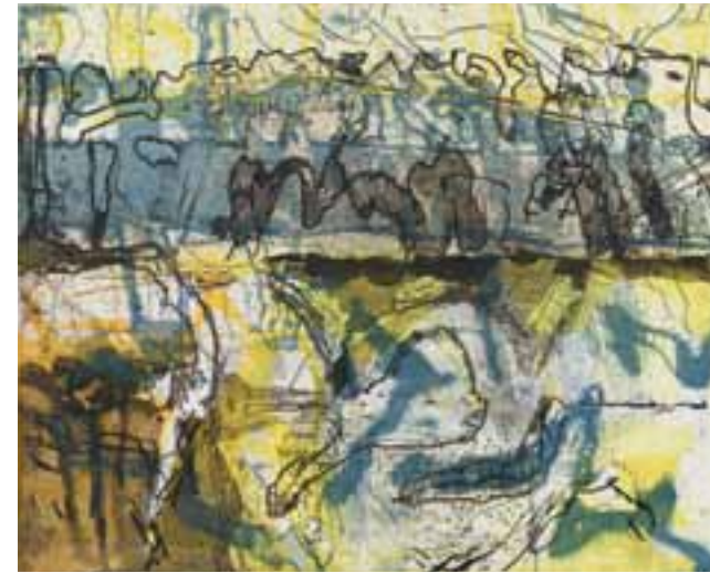
Bone Country Edition of 25 2006 Etching 25 x 29cm