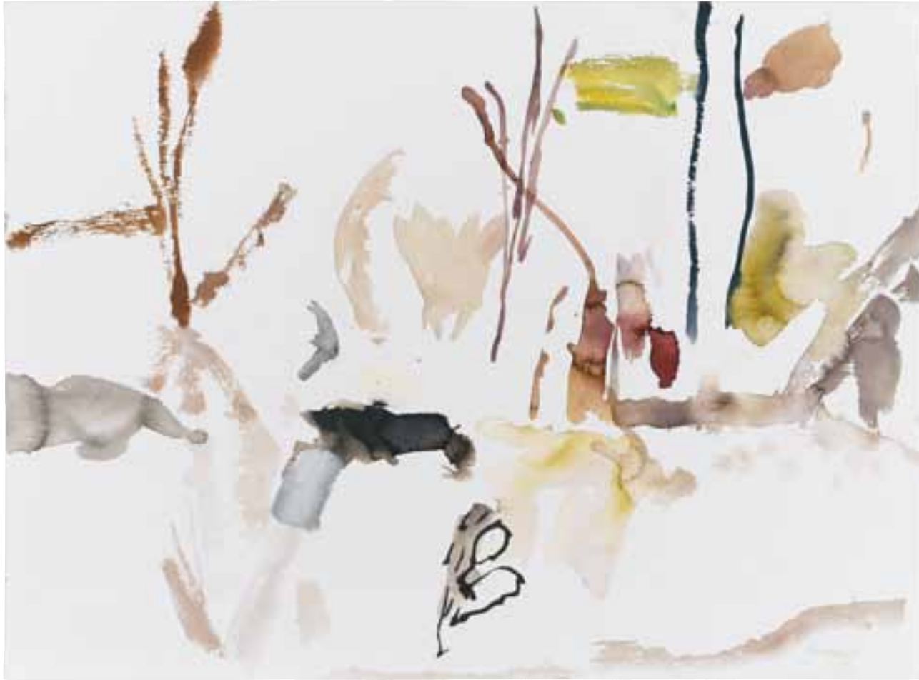
Spring II 2009 Gouache on paper 56 x 76cm