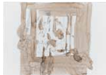
Window 2009 Watercolour and pencil on paper 35 x 50cm