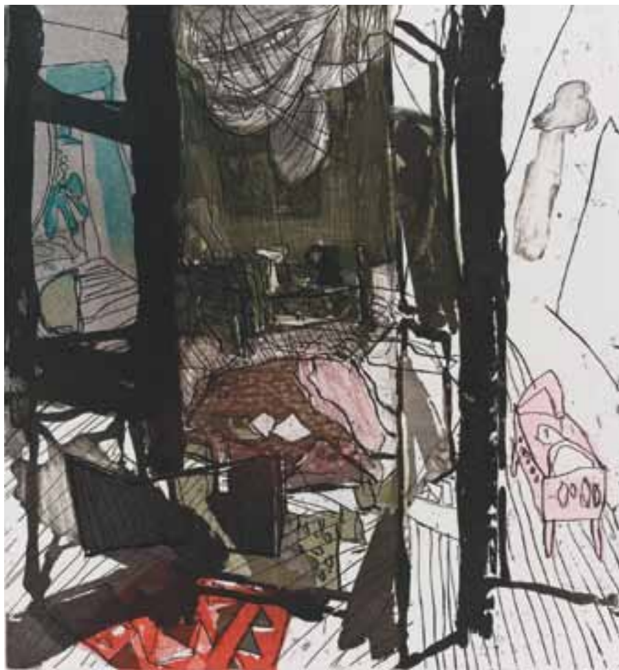
The Green Mango B&B Edition of 25 2005 Etching 35 x 32cm