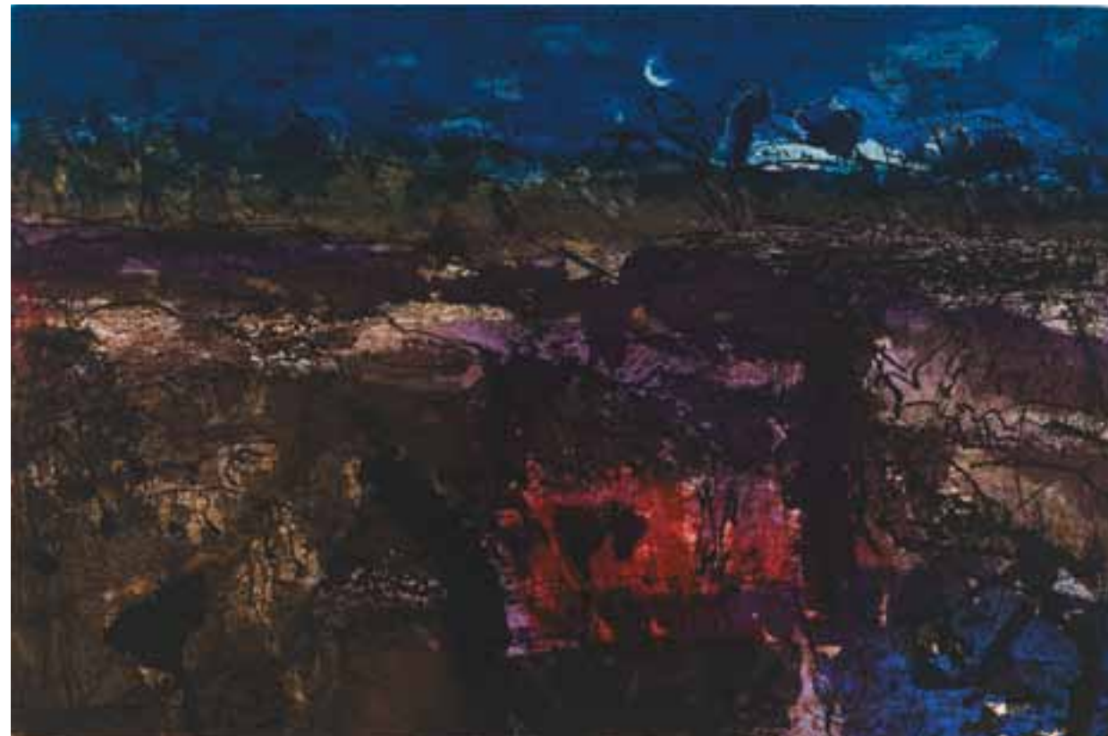
New Moon at the Warburton River Edition of 25 2008 Etching 34 x 50cm