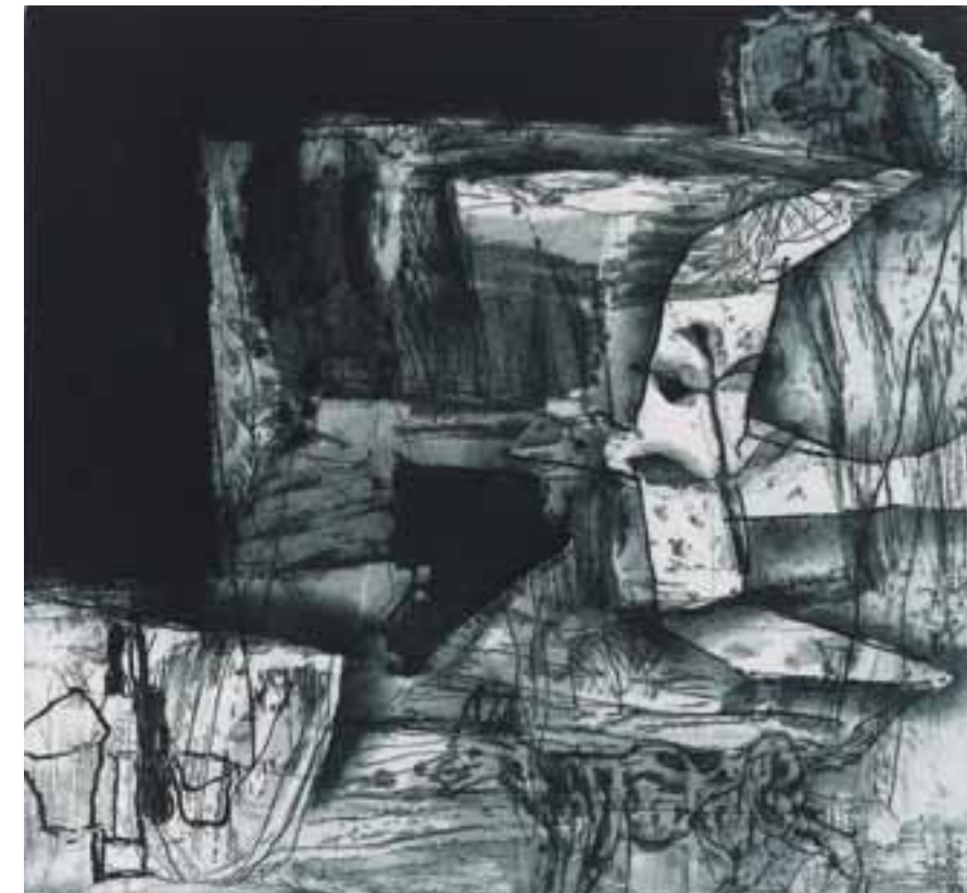
Night Bird Edition of 15 2001 Etching 33 x 35cm