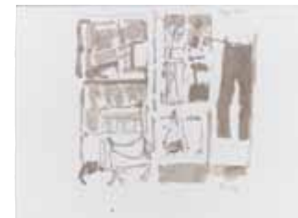
Clothesline 2009 Ink on paper 40 x 52cm