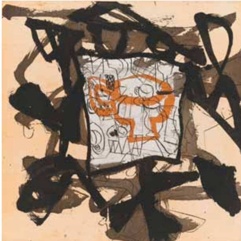
Mad Hatter's Tea Party Edition of 25 2005 Etching 50 x 50cm