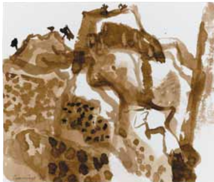
Flinders 3 2008 Ink on paper 28 x 33cm