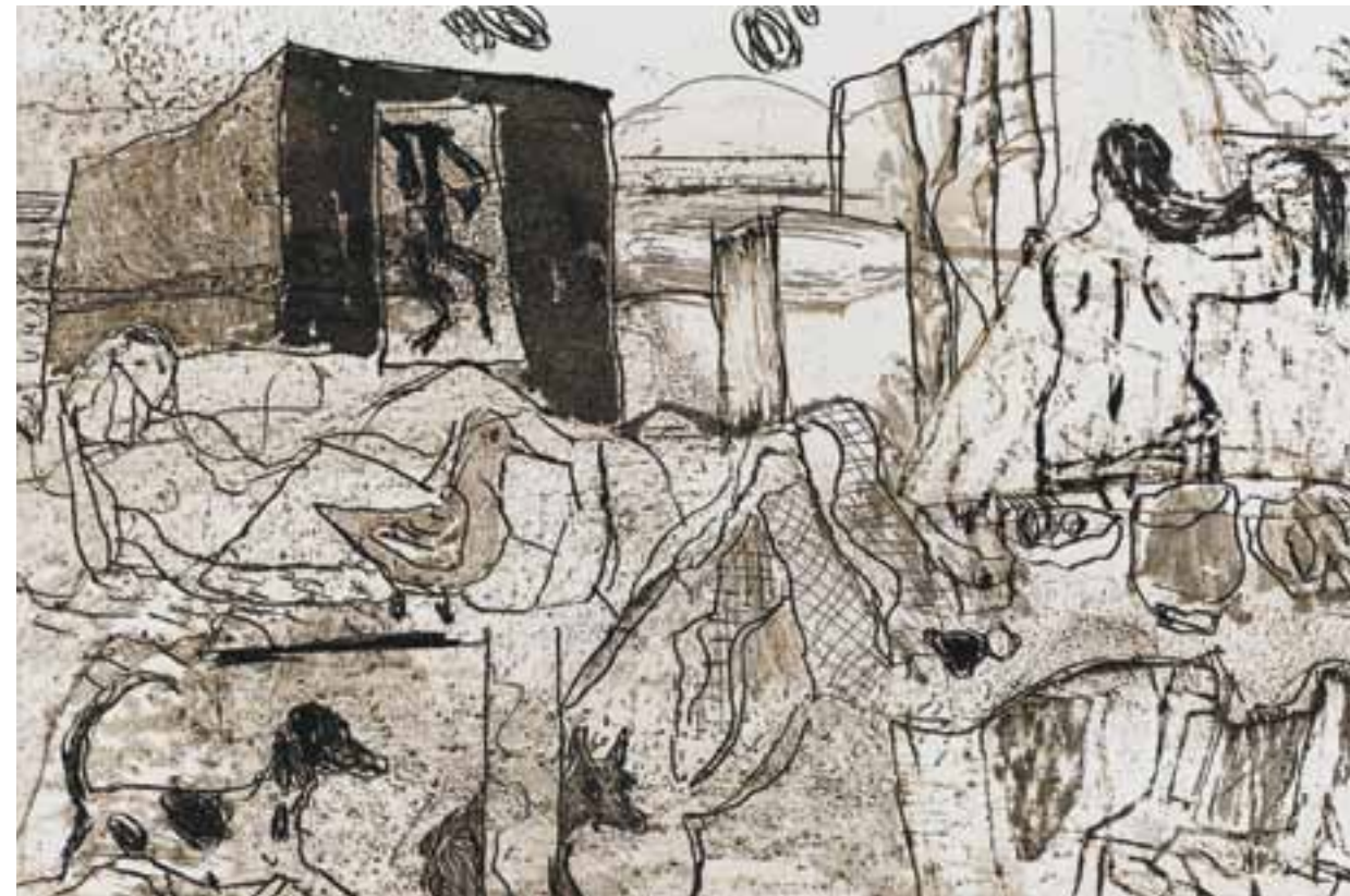
Hill End Glimpses Edition of 25 2009 Etching 33.5 x 50cm