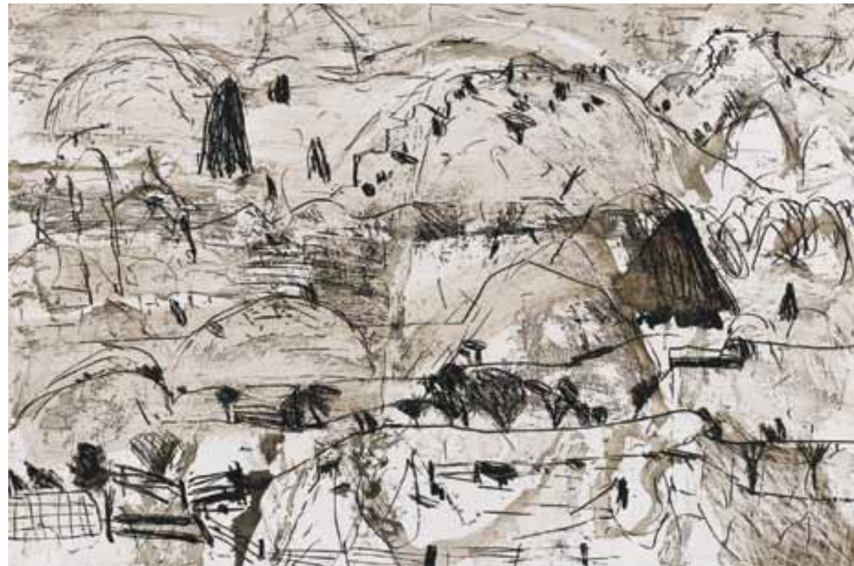
Back Paddock Edition of 25 2008 Etching 33 x 50cm