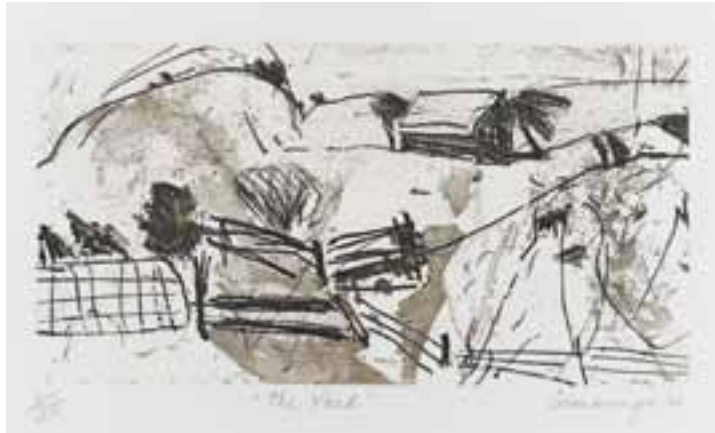
The Yard Edition of 25 2010 Etching 13 x 25cm