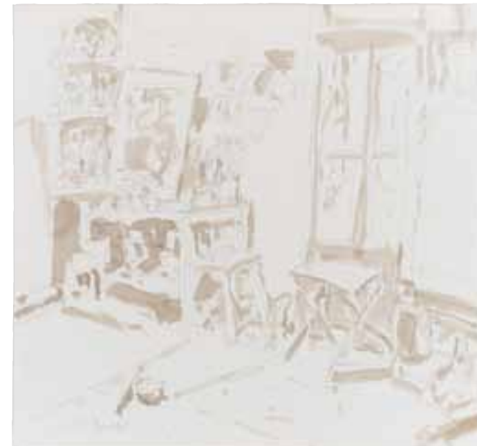
Studio 2009 Graphite and ink on paper 50 x 53.5cm