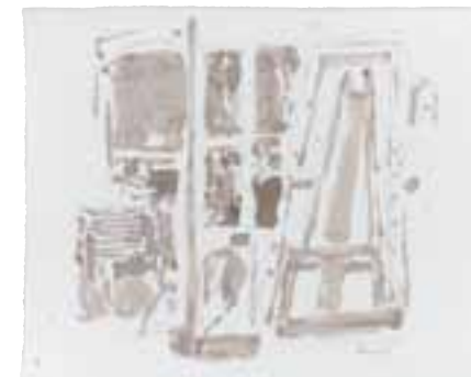
Easel 2009 Ink and pencil on paper 42 x 52.5cm