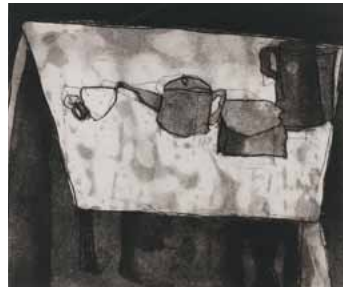
Teapot 2 Edition of 15 2001 Etching 21 x 25cm