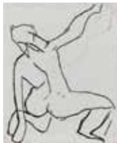
Kneeling Nude From Back Edition of 14 2005 Etching 3.5 x 3cm