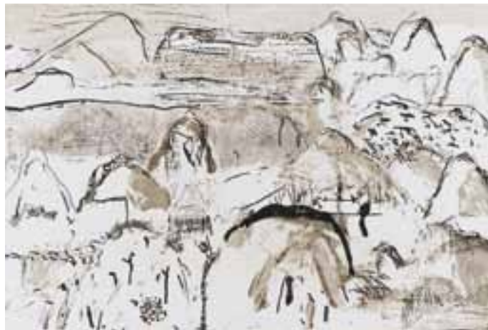
Northern Flinders Edition of 25 2009 Etching 33 x 49.5cm