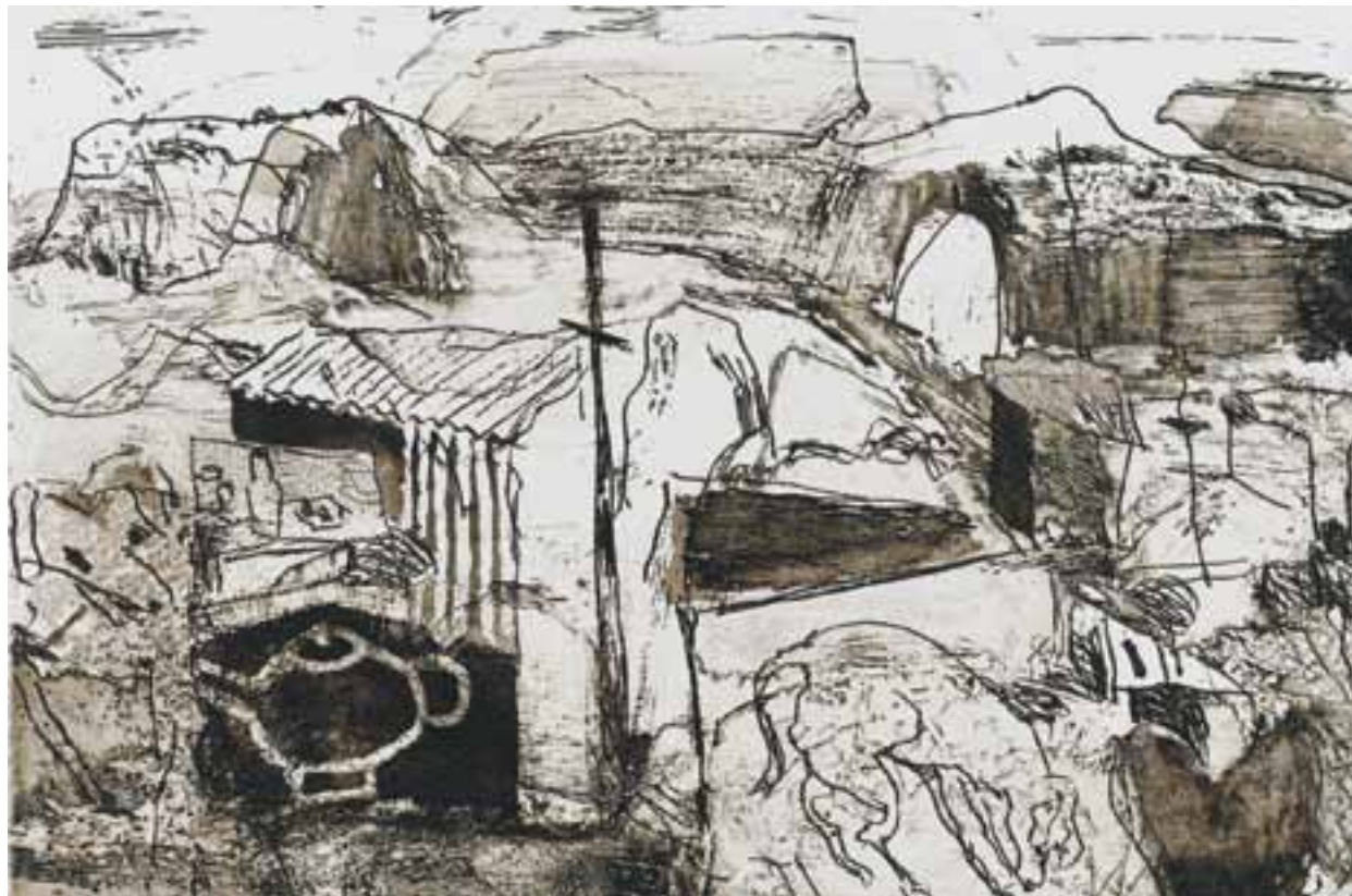
Smoko Edition of 25 2008 Etching 33.5 x 50cm