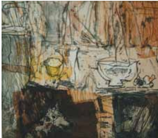
Dogs Under The Table Edition of 30 2001 Etching 14 x 16cm