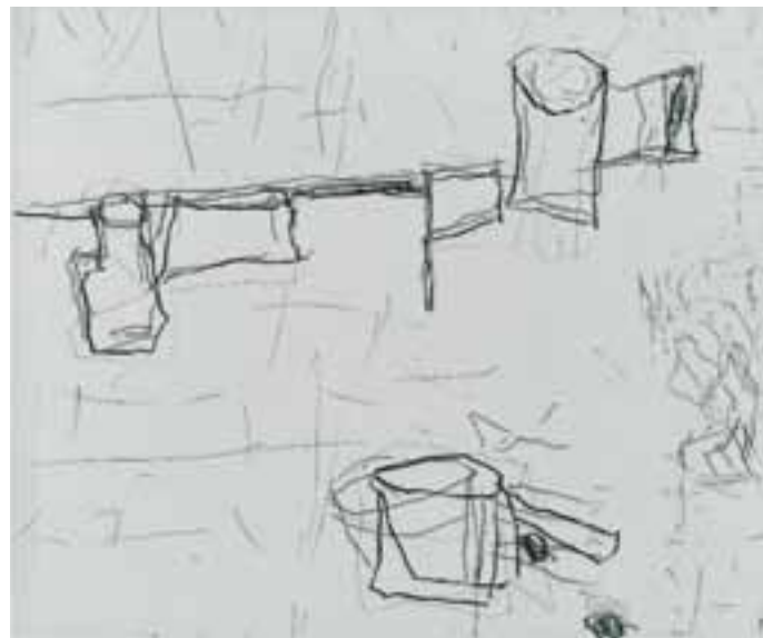
Table Top I Edition of 12 2001 Etching 21 x 24.5cm