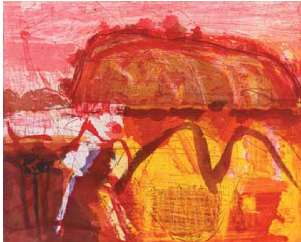
Pilbara Landscape Edition of 25 2005 Etching 23 x 29cm