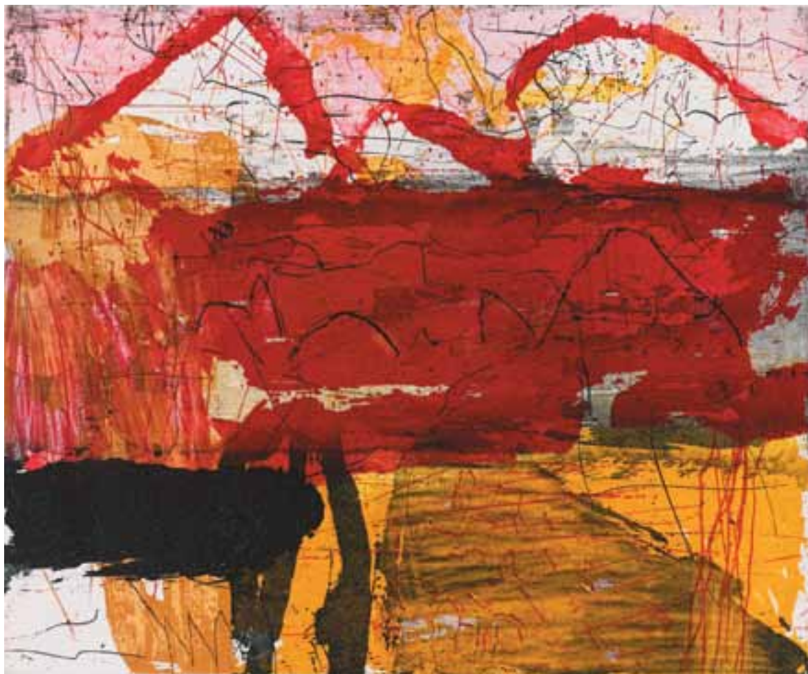
Near Arkaroola Edition of 35 2005 Etching 20.5 x 24.5cm