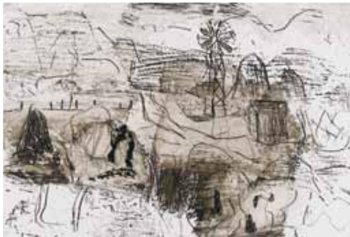
Flinders Windmill Edition of 25 2009 Etching 33 x 49.5cm