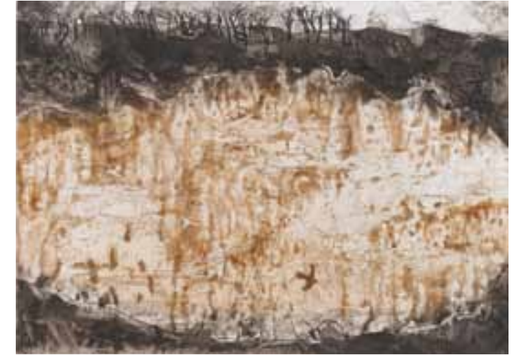
Menindee Lake Edition of 20 2007 Etching 49 x 68cm