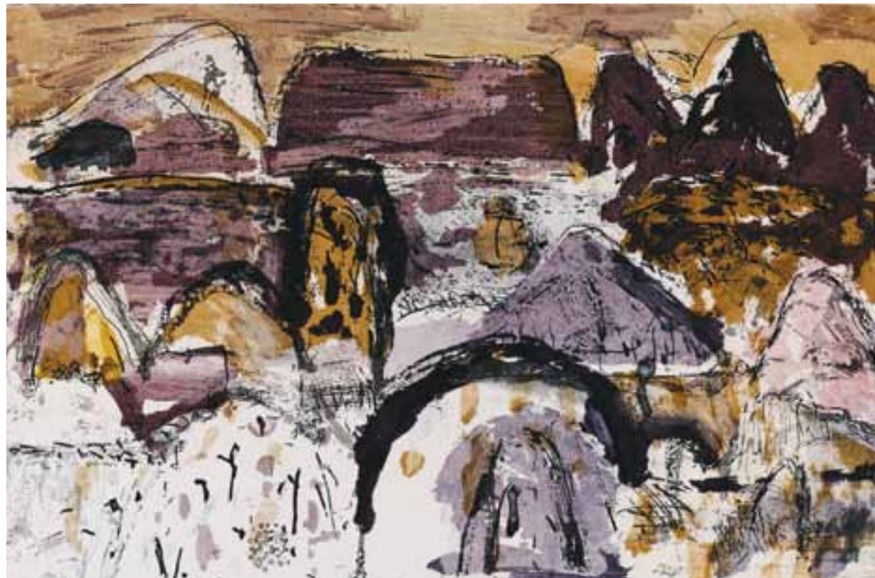
Arkaroola Morning Edition 25 2009 Etching 33 x 49.5cm