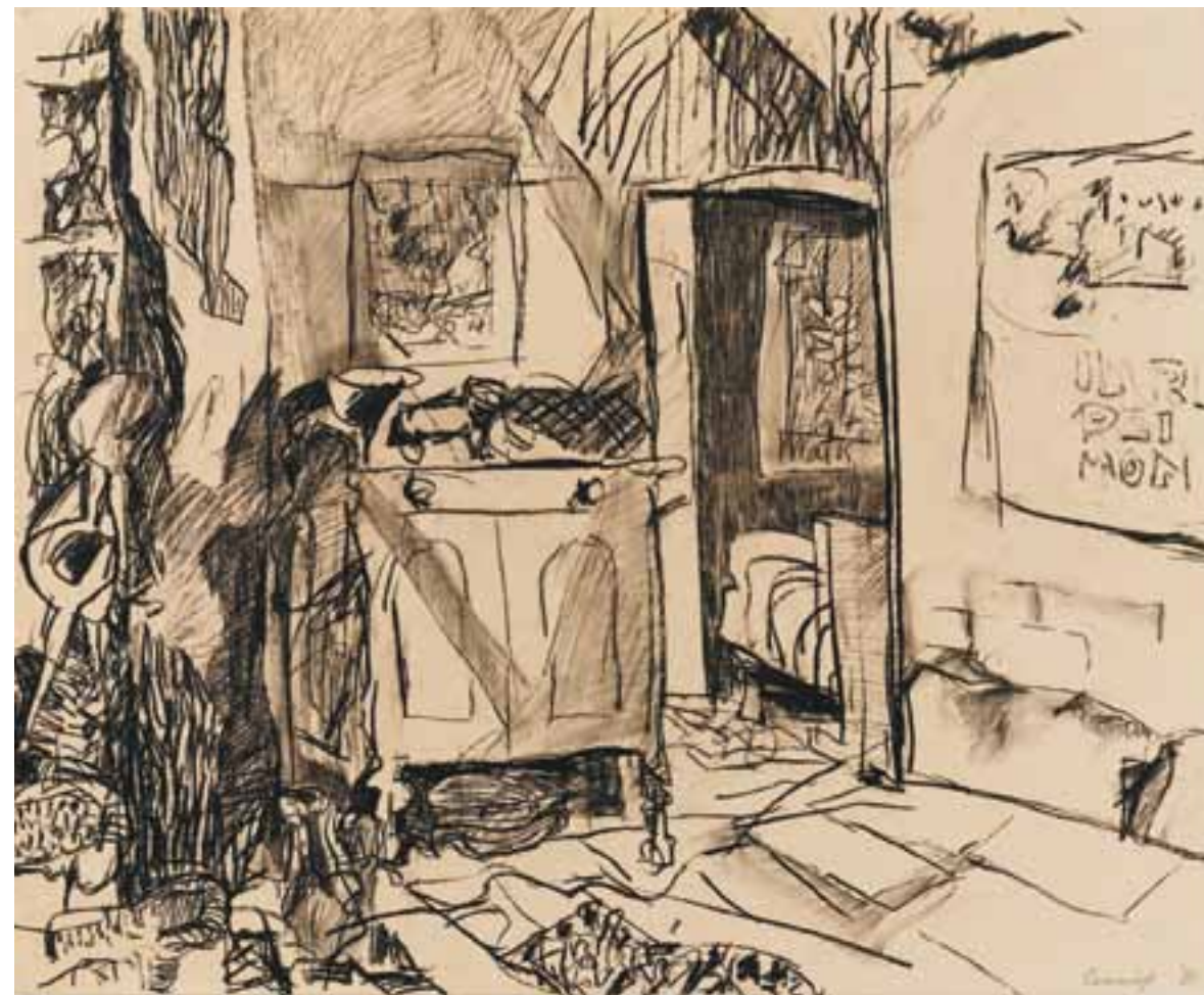
Interior 1980 Charcoal on paper 50 x 60cm