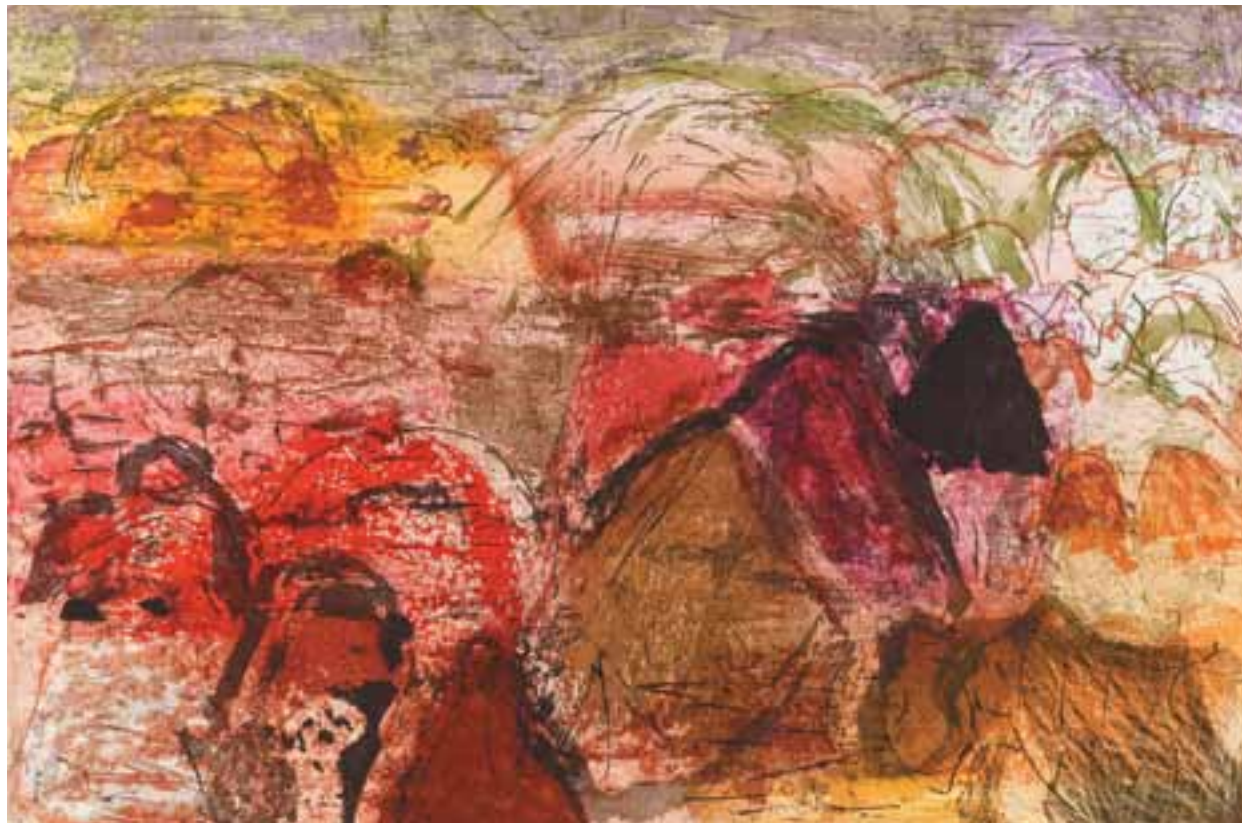
Flinders Journey Edition of 25 2007 Etching 34 x 50cm