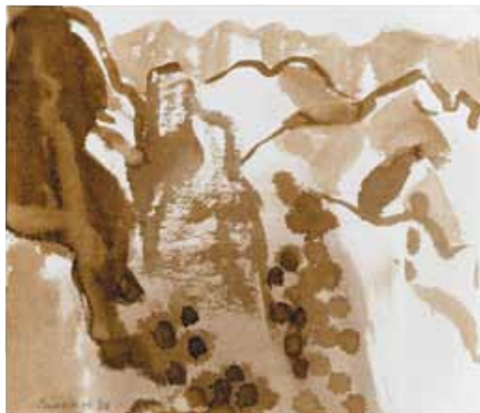
Flinders 2 2008 Ink on paper 28 x 33cm