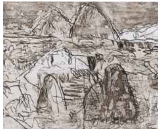
Flinders Outcrop Edition of 25 2005 Etching 23 x 29cm