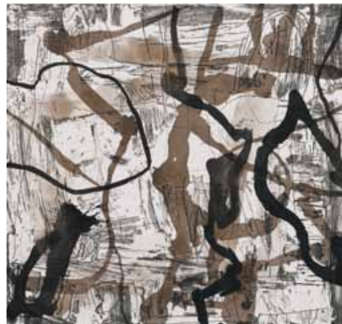
Untitled 2007/2009 Unique etching and ink 38 x 48cm