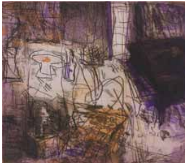
The Piano Room Edition of 30 2001 Etching 15 x 16.5cm