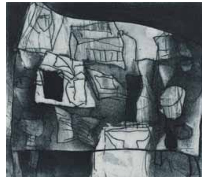
Studio Table Edition of 15 2001 Etching 14 x 16cm