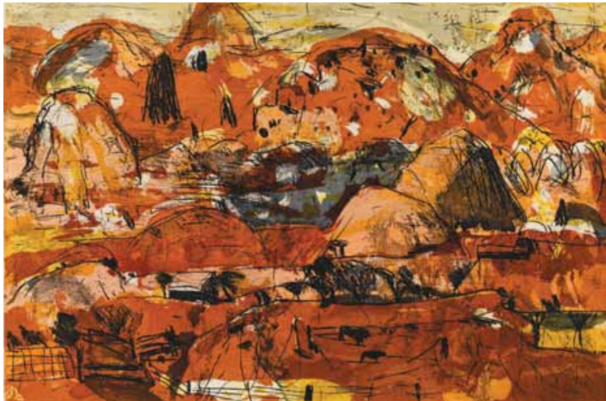
Flinders Farm Edition of 25 2009 Etching 34 x 49.5cm