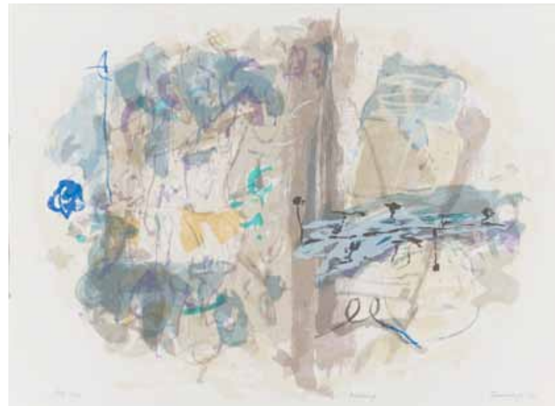
Billabong 1999 Silk screen 56 x 76cm