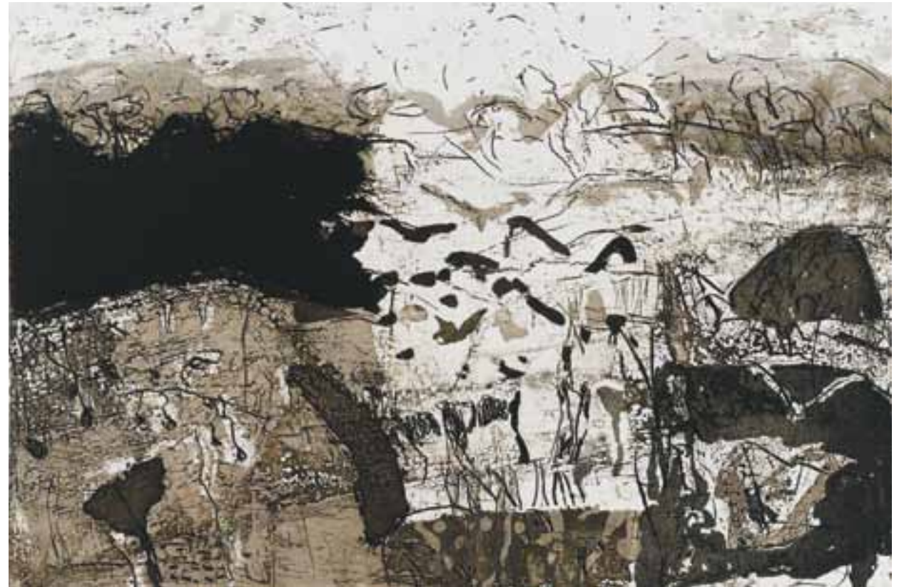
Warburton Morning Edition of 25 2009 Etching 33 x 49.5cm