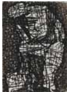
Nude With Lifted Knee Edition of 14 2005 Etching 3.5 x 3cm