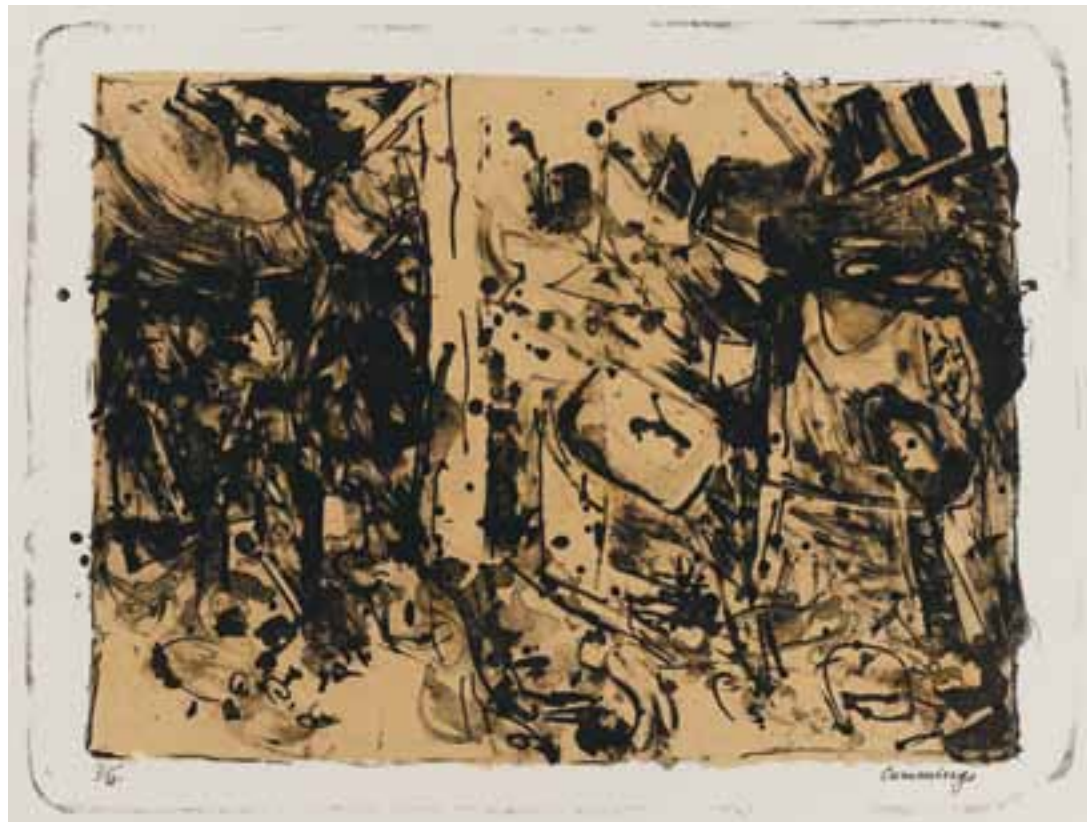
Untitled Edition of 4 1986 Chine Colle 39 x 52cm