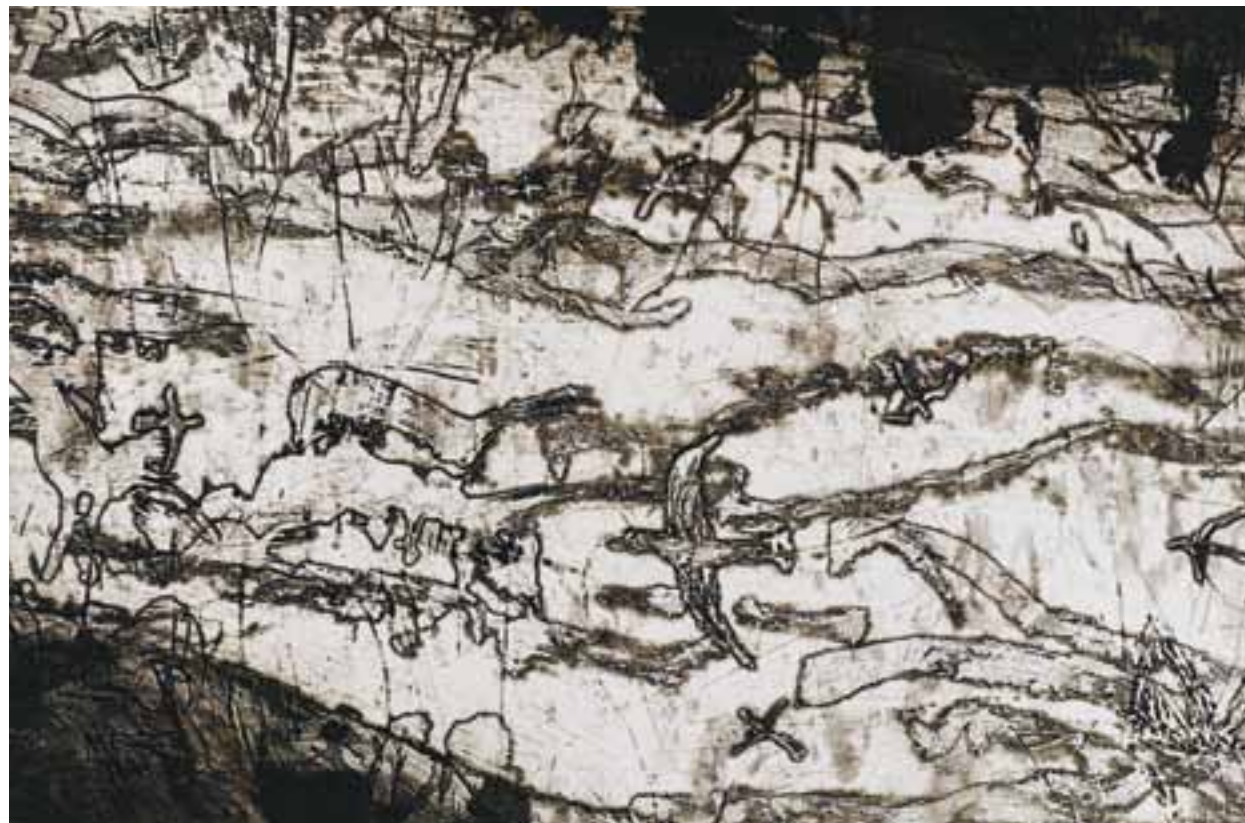
Birds Over The River Edition 25 2009 Etching 34 x 49.5cm