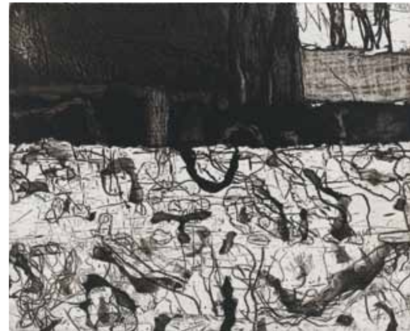
Riverbed Edition of 20 2007 Etching 20 x 24cm