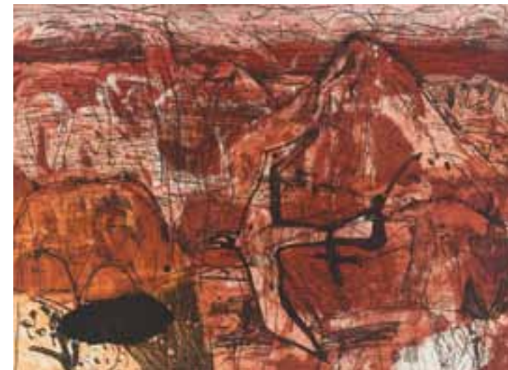
Arkaroola Landscape Edition of 25 2005 Etching 50 x 68cm