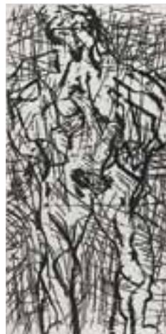
Standing Nude Edition of 14 2005 Etching 3.5 x 3cm