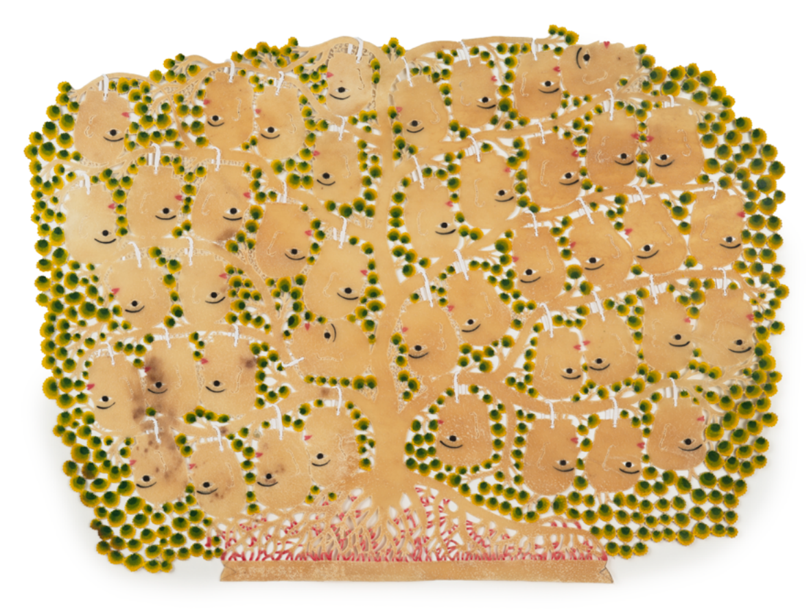
Tree of Heads 2021-22 acrylic on buffalo hide 75x120cm