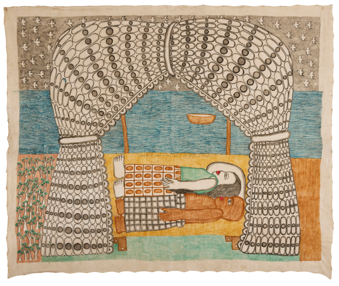
Sea View 2018 acrylic on calico 157x187cm