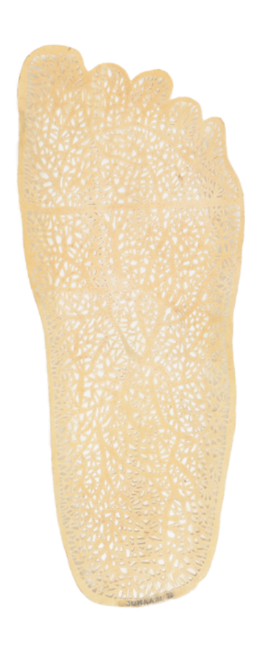
Sole 2021-22 acrylic on buffalo hide 85x39cm