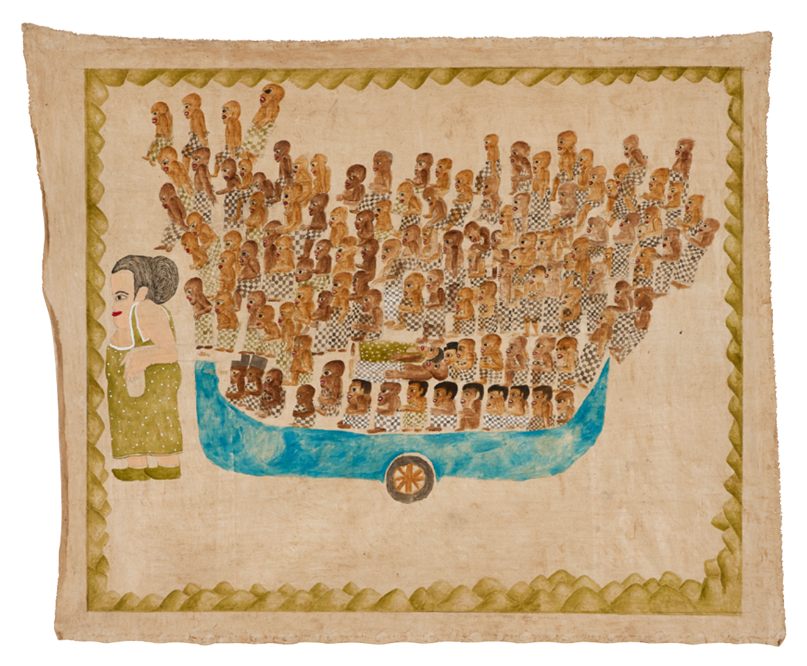
Banyak Anak, Banyak Rejeki 2022 acrylic on calico 157x187cm