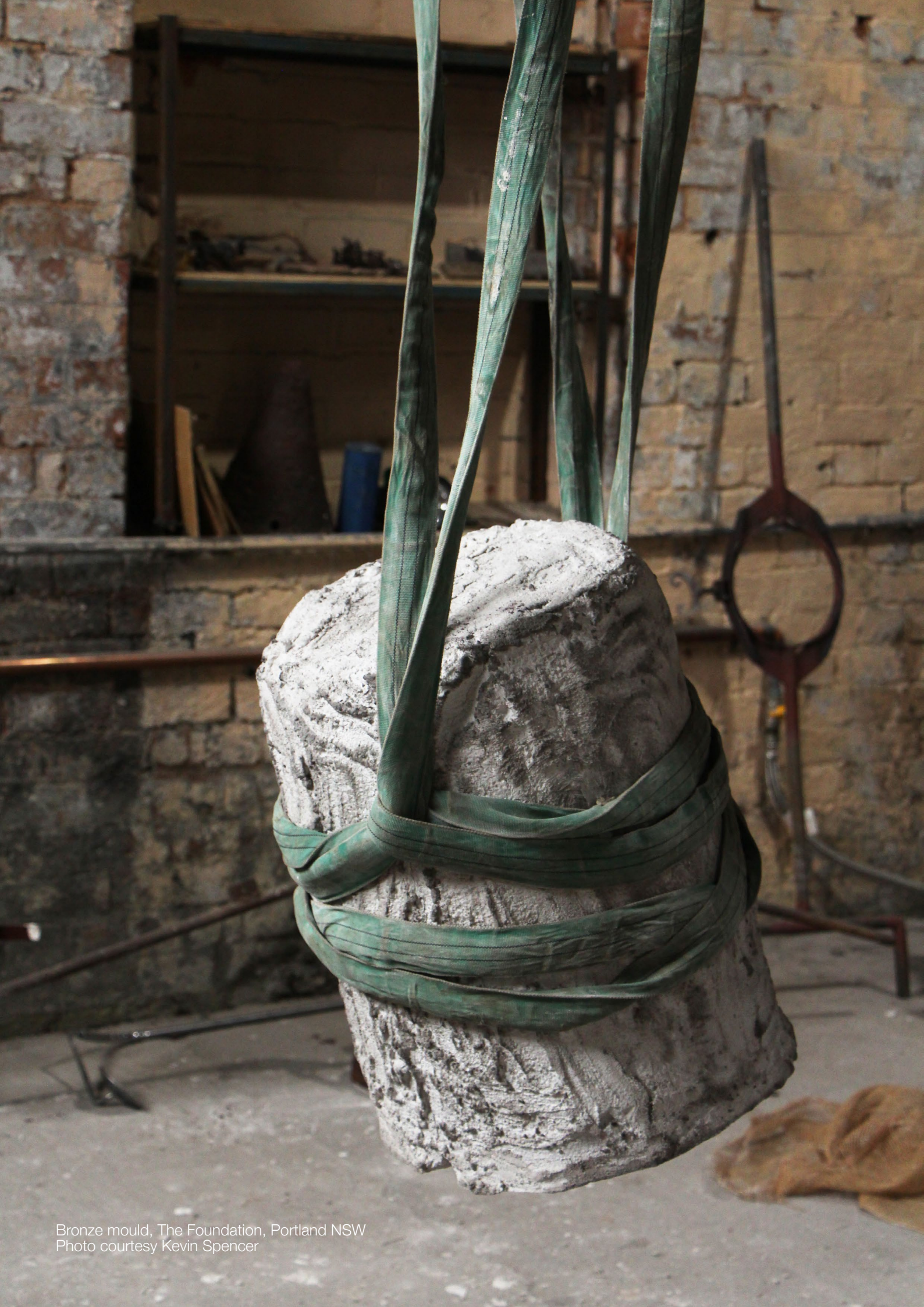
Bronze mould, The Foundation, Portland NSW