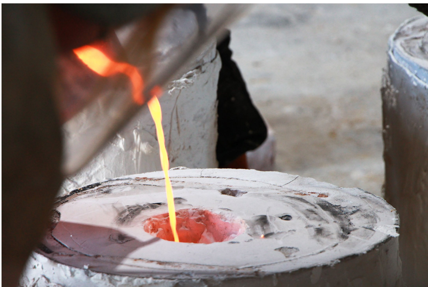
Bronze pour, The Foundation, Portland NSW.