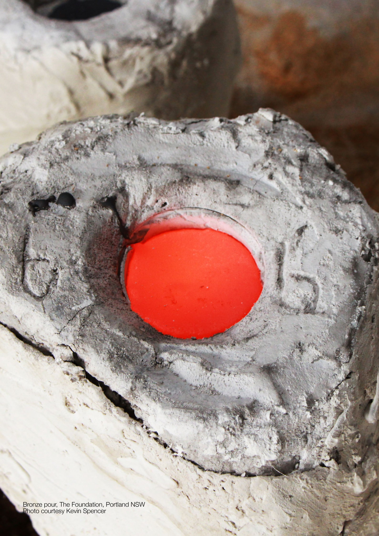
Bronze pour, The Foundation, Portland NSW