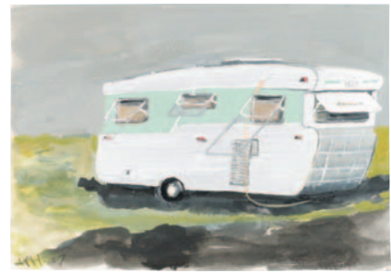
caravan series 2007 gouache on paper all 15x21cm