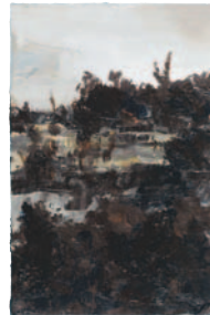
small works 2007 oil on canvas various sizes