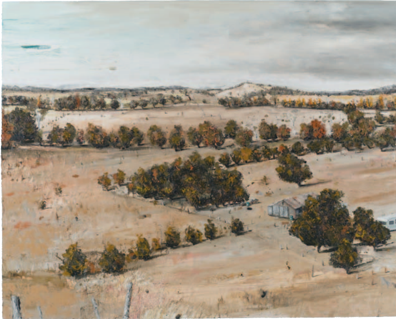
drive home wattle flat 2007 oil on canvas 122x152cm