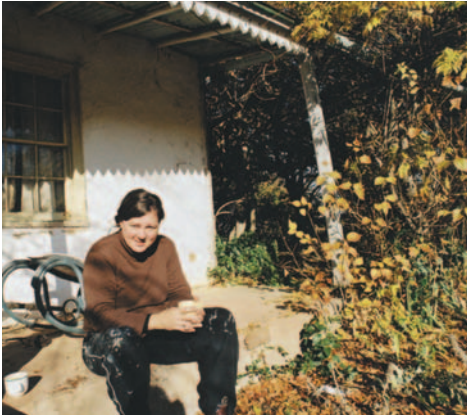
hill end 2006

opposite: bridal track hill end 2007 oil on canvas 122x152cm