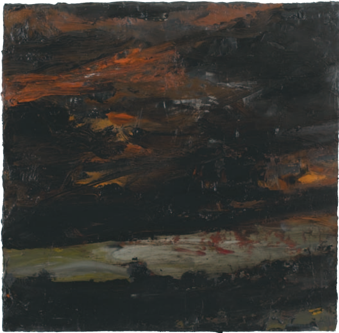
big sky 2007 oil on board 25x25cm