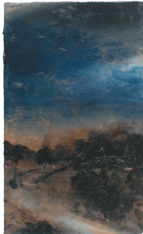
small works hill end 2007 oil on board various sizes