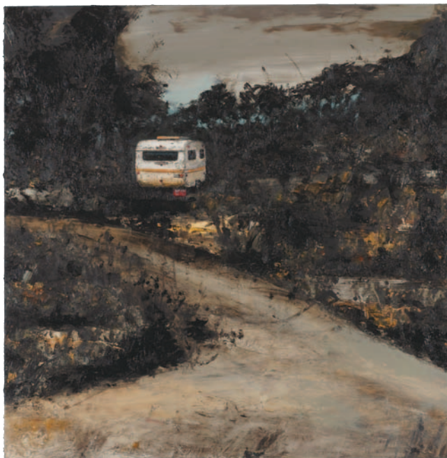
for sale call jim 2007 oil on canvas 76x76cm