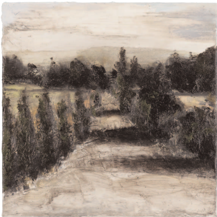
big sky 2007 oil on board 25x25cm