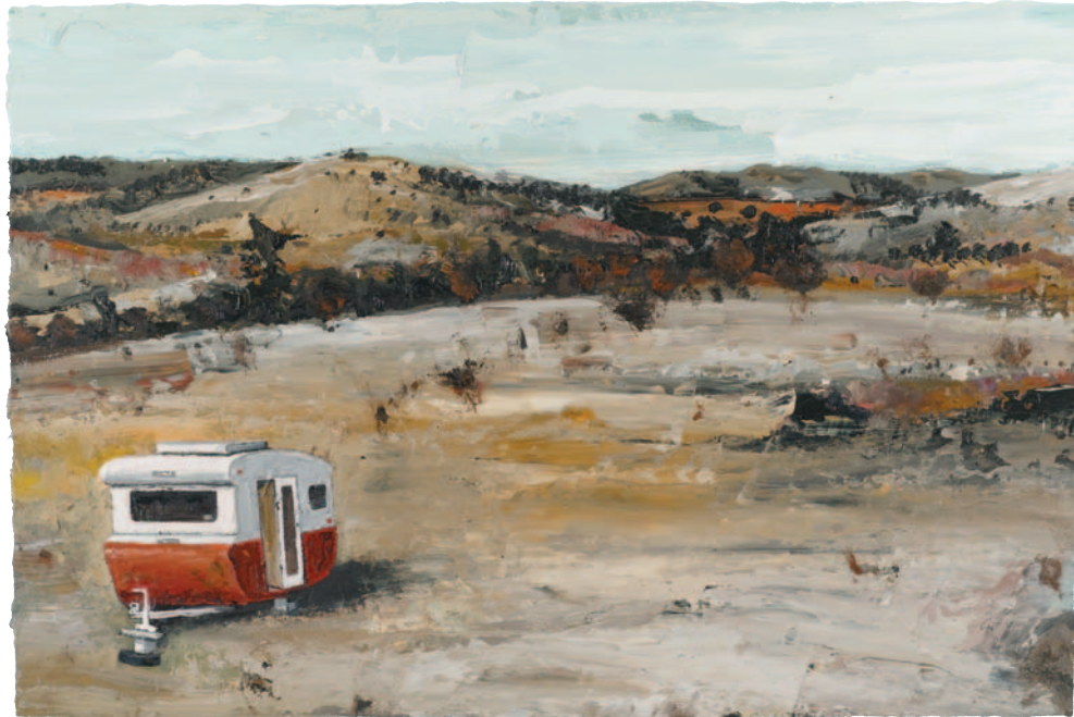
humpty doo van site 2007 oil on canvas 49x72cm