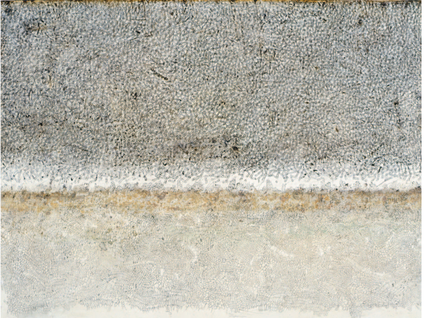
Eddy's Creek 2007 Encaustic and pigment on board 75 x 100cm