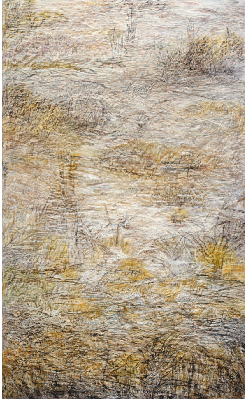
Lost Ladies Gorge 2007 Encaustic and pigment on board 200 x 122cm