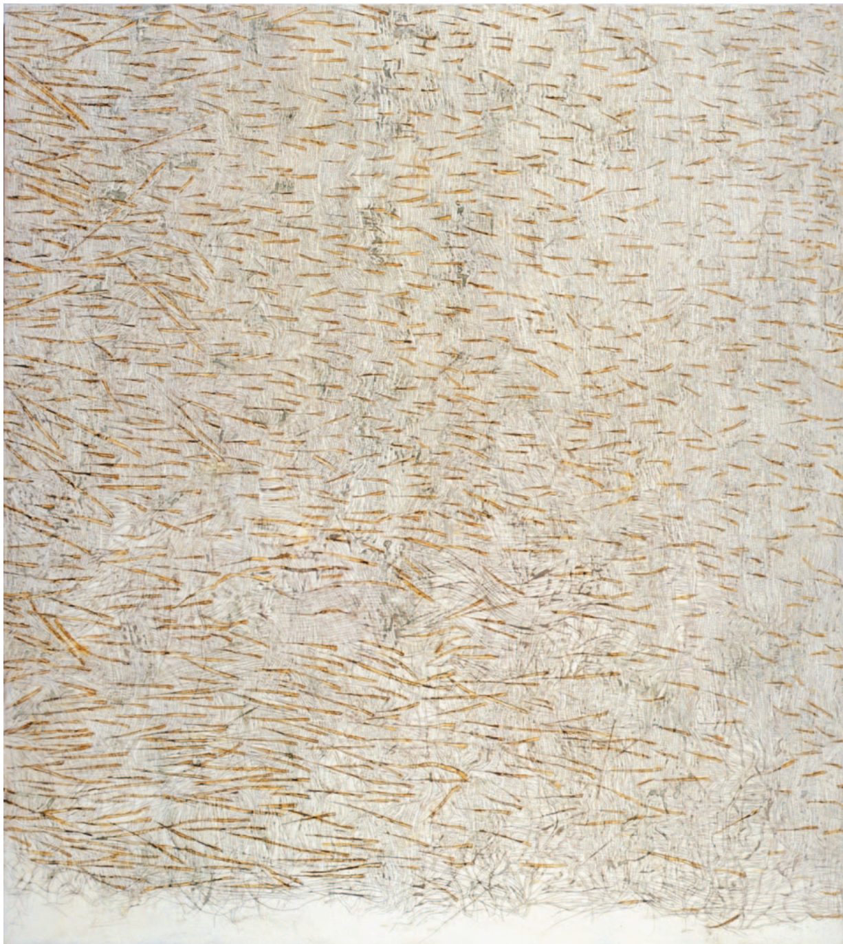
Elemental Components 2007 Encaustic and pigment on board 136 x 121.5cm