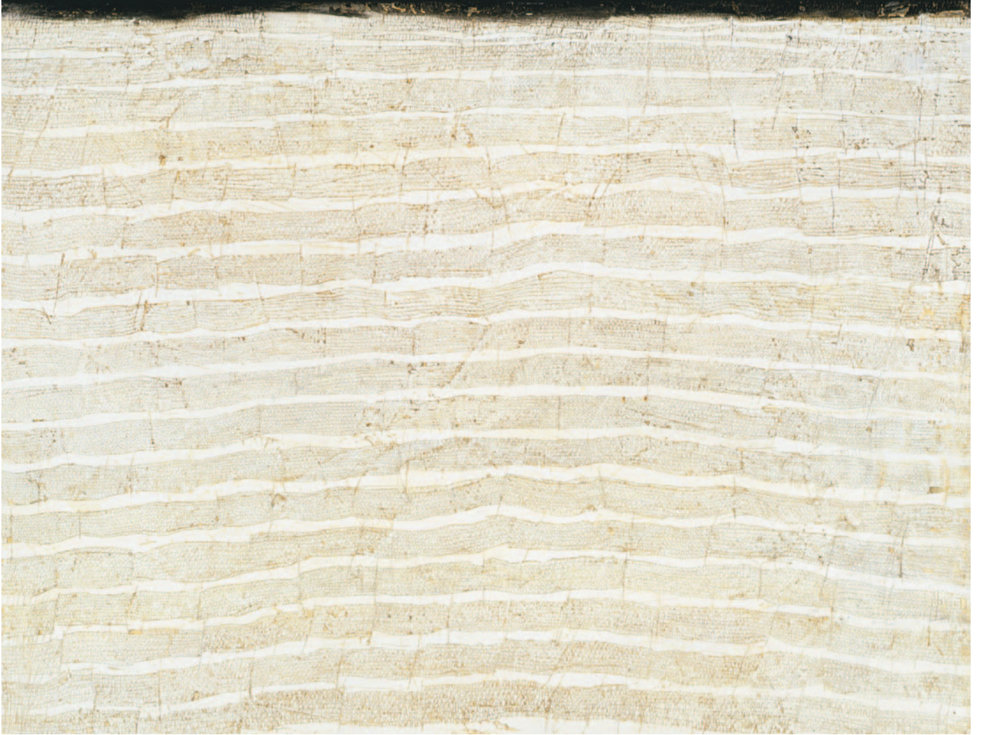
Space 2007 Encaustic and pigment on board 75 x 100cm