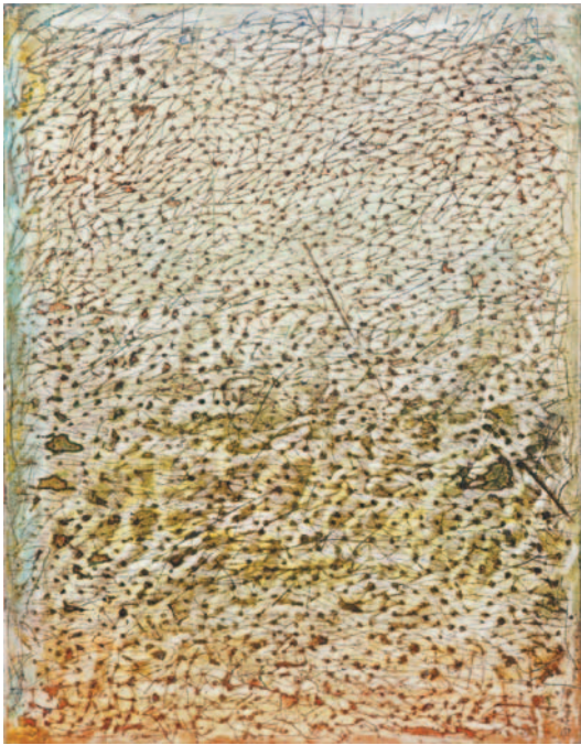
Colour 2007 Encaustic and pigment on board 32 x 24.5cm