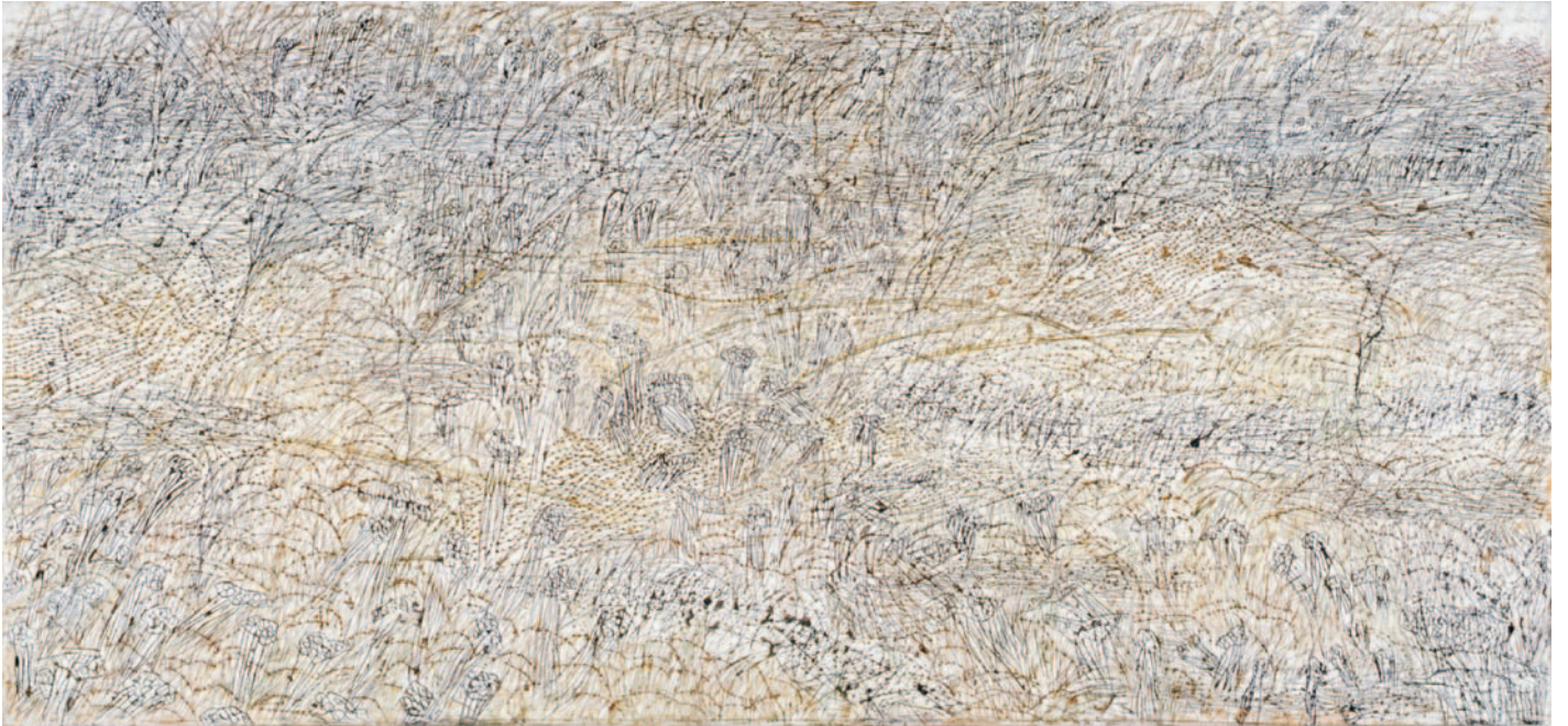
Autobiography 2007 Encaustic and pigment on board 70 x 150cm