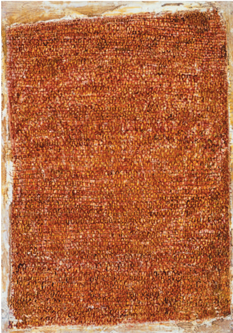
The Red One 2007 Encaustic and pigment on board 48 x 28.5cm