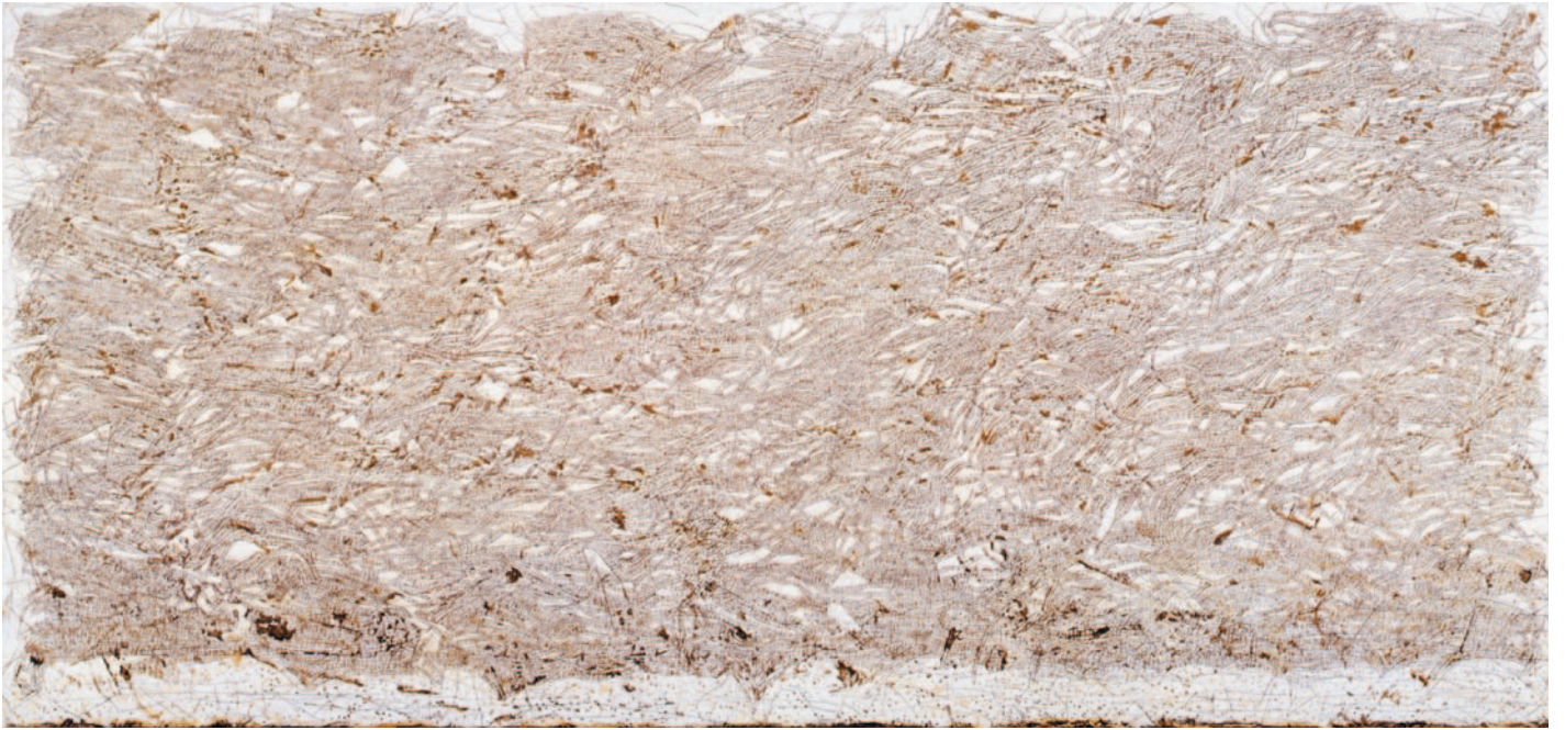
38 Black Bream 2008 Encaustic and pigment on board 70 x 150cm