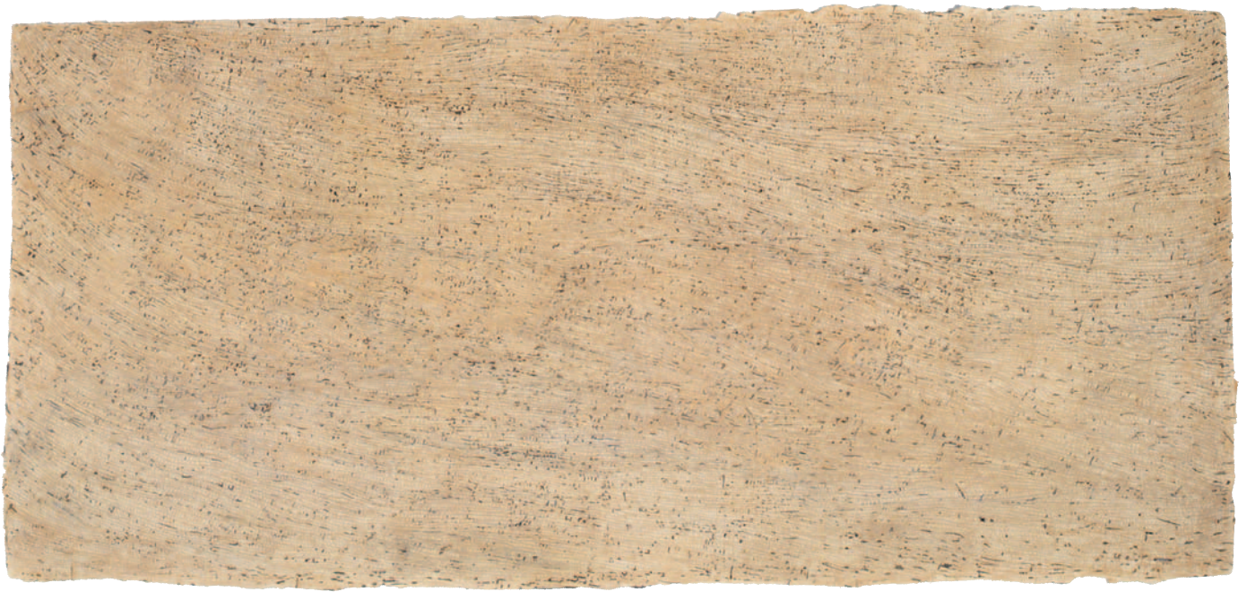
Silence 2007 Encaustic and pigment on paper 95 x 179cm