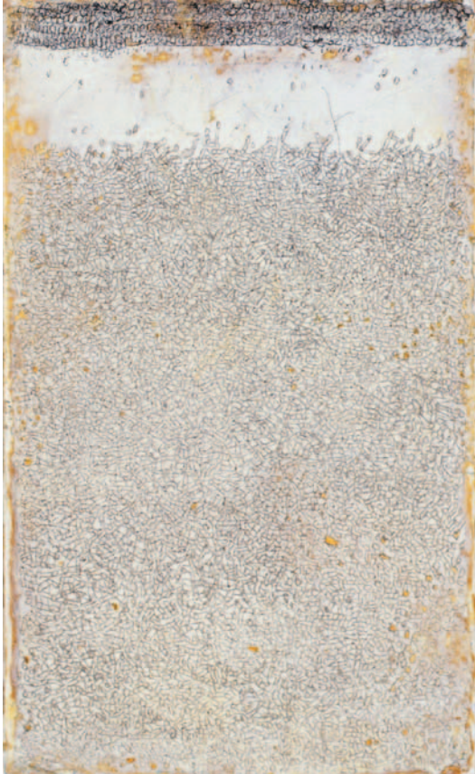
Stone Country 2007 Encaustic and pigment on board 38 x 23cm