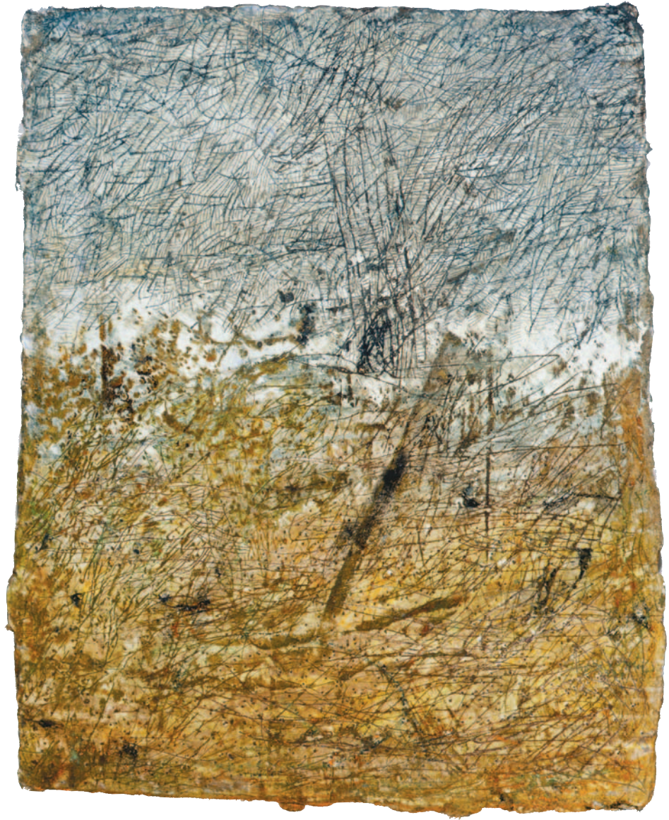
Thunder 2007 Encaustic and pigment on paper 49 x 42cm