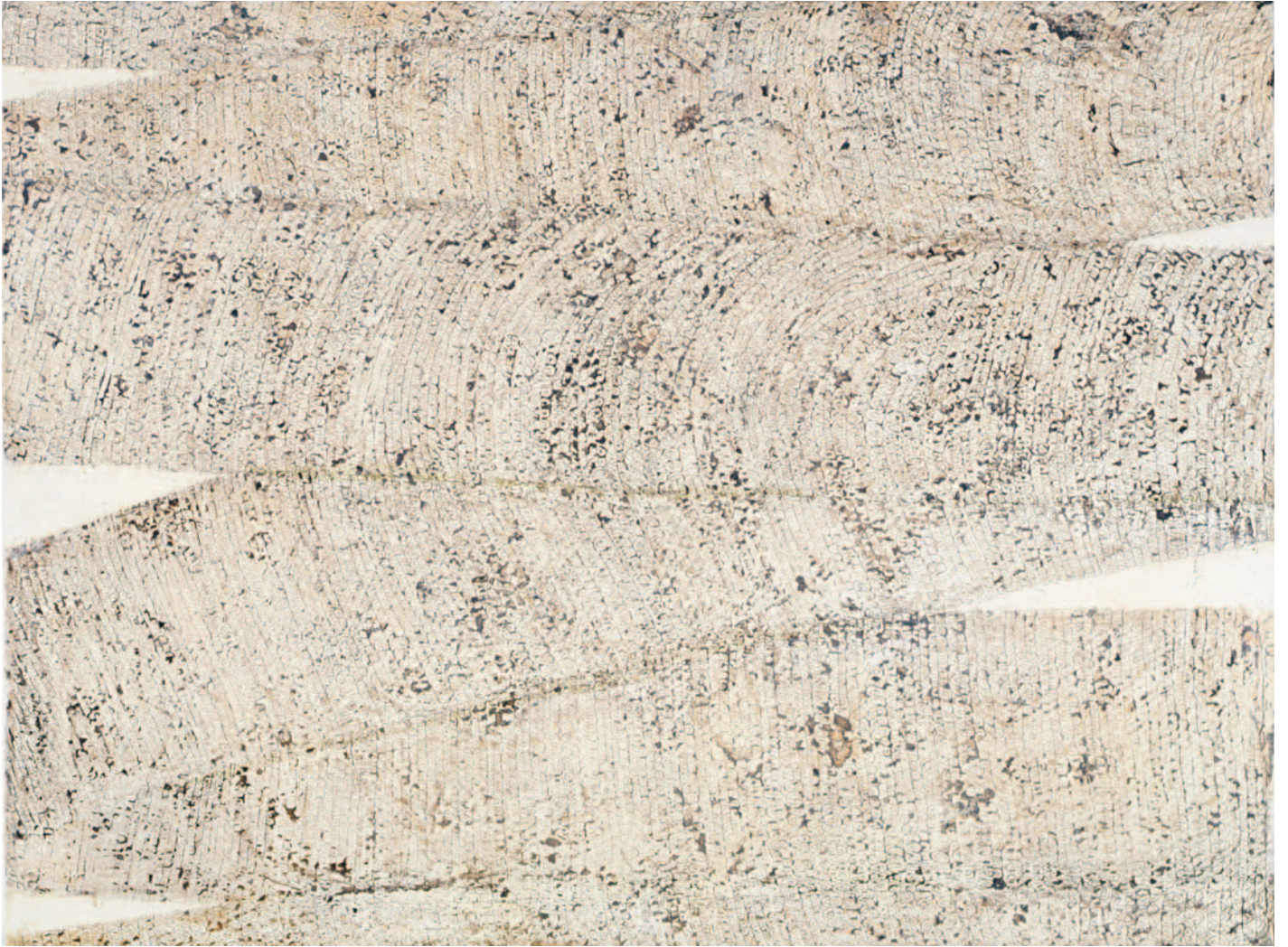
Distance Collapsed 2007 Encaustic and pigment on board 75 x 100cm