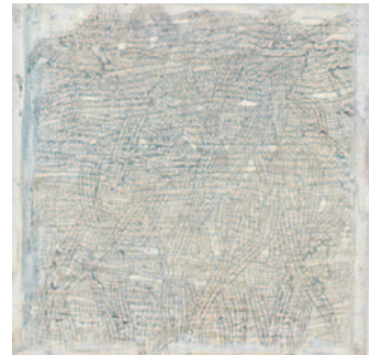
Fragments Remembered 2007 Encaustic and pigment on board Varied sizes