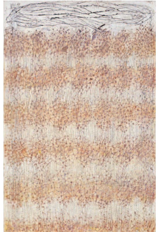
Constant Flux 2007 Encaustic and pigment on board 41 x 27cm