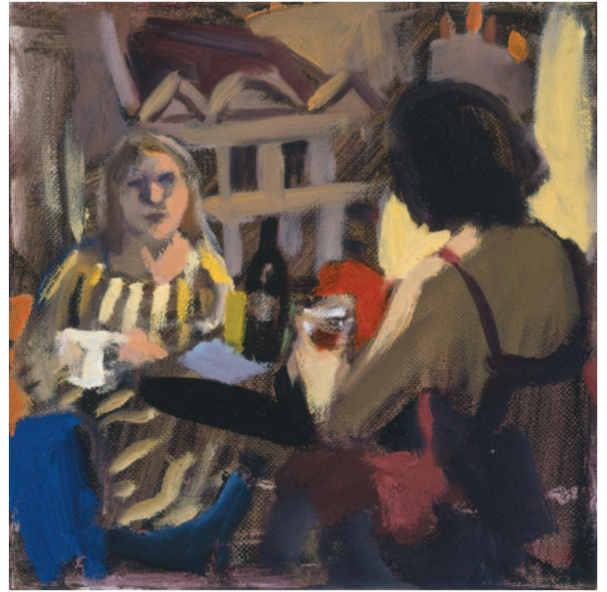
Breakfast in the Studio 2007 Oil on linen 20 x 20cm