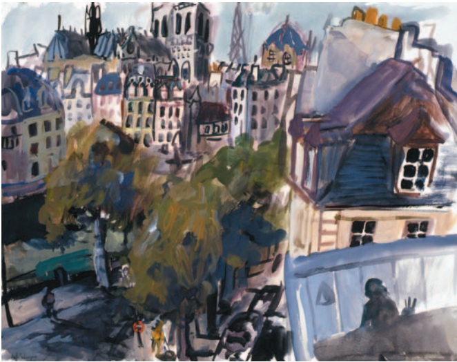
View from the Roof Shadow 2007 Gouache and mixed media on paper 50 x 65cm