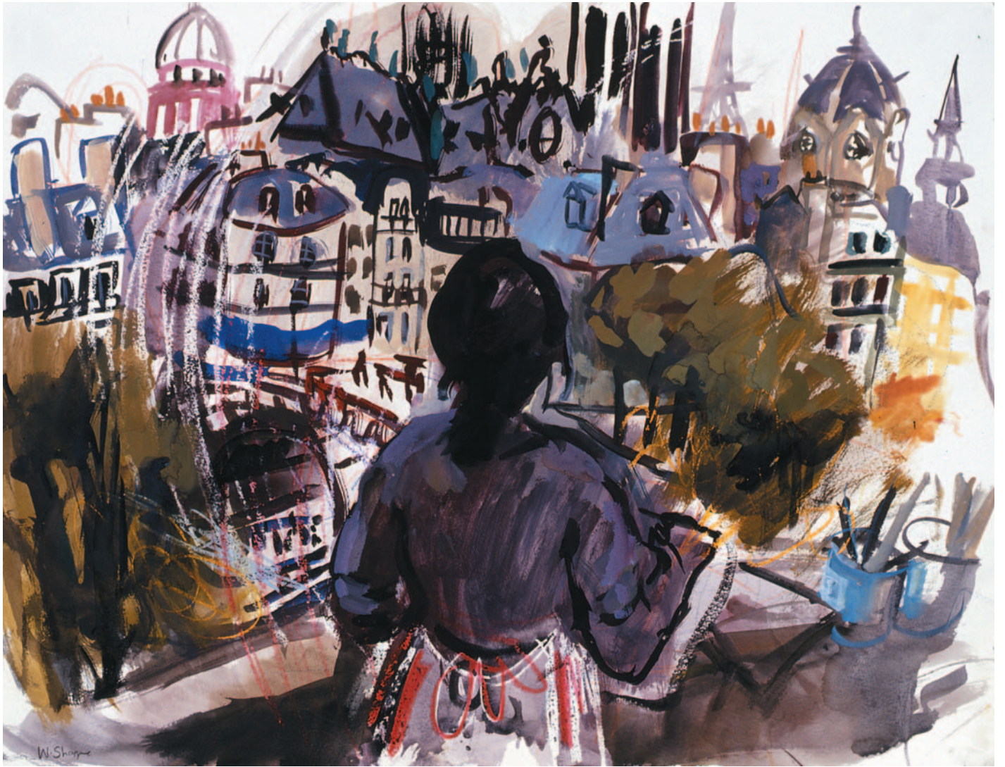
View from the Roof 2007 Gouache on paper 50 x 65cm