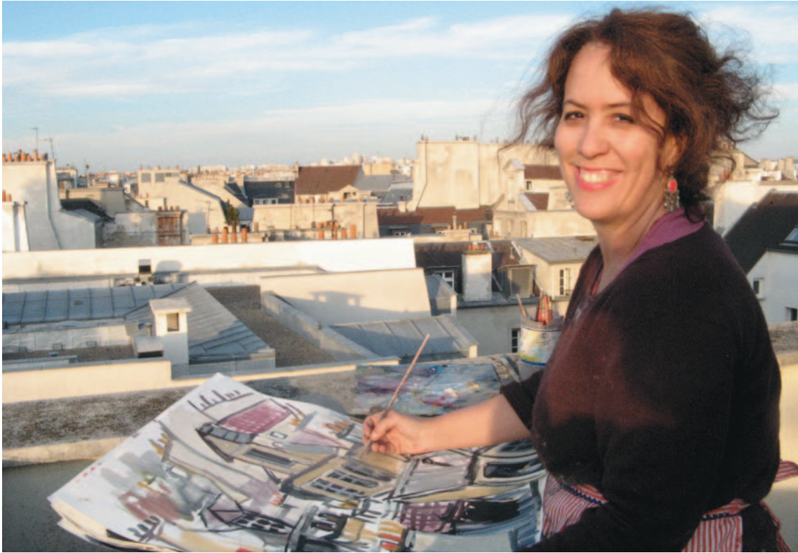
Rooftop Paris 2007