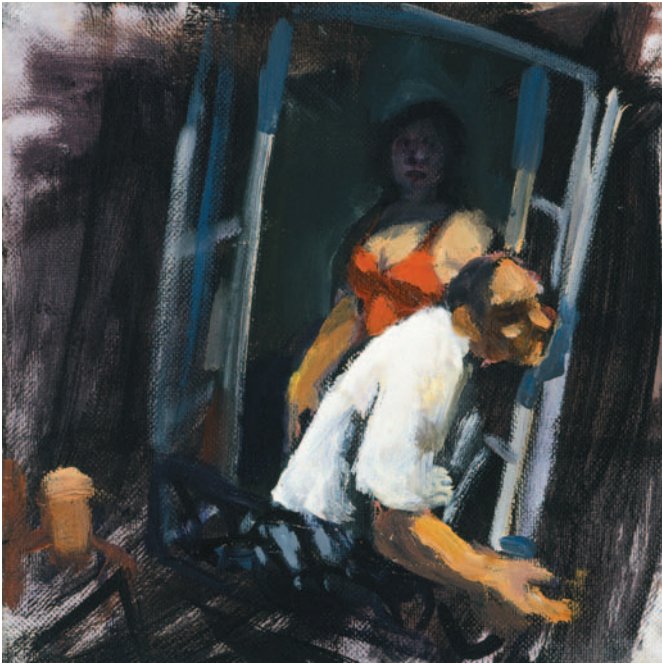
Mona and Stephane 2007 Oil on linen 20 x 20cm