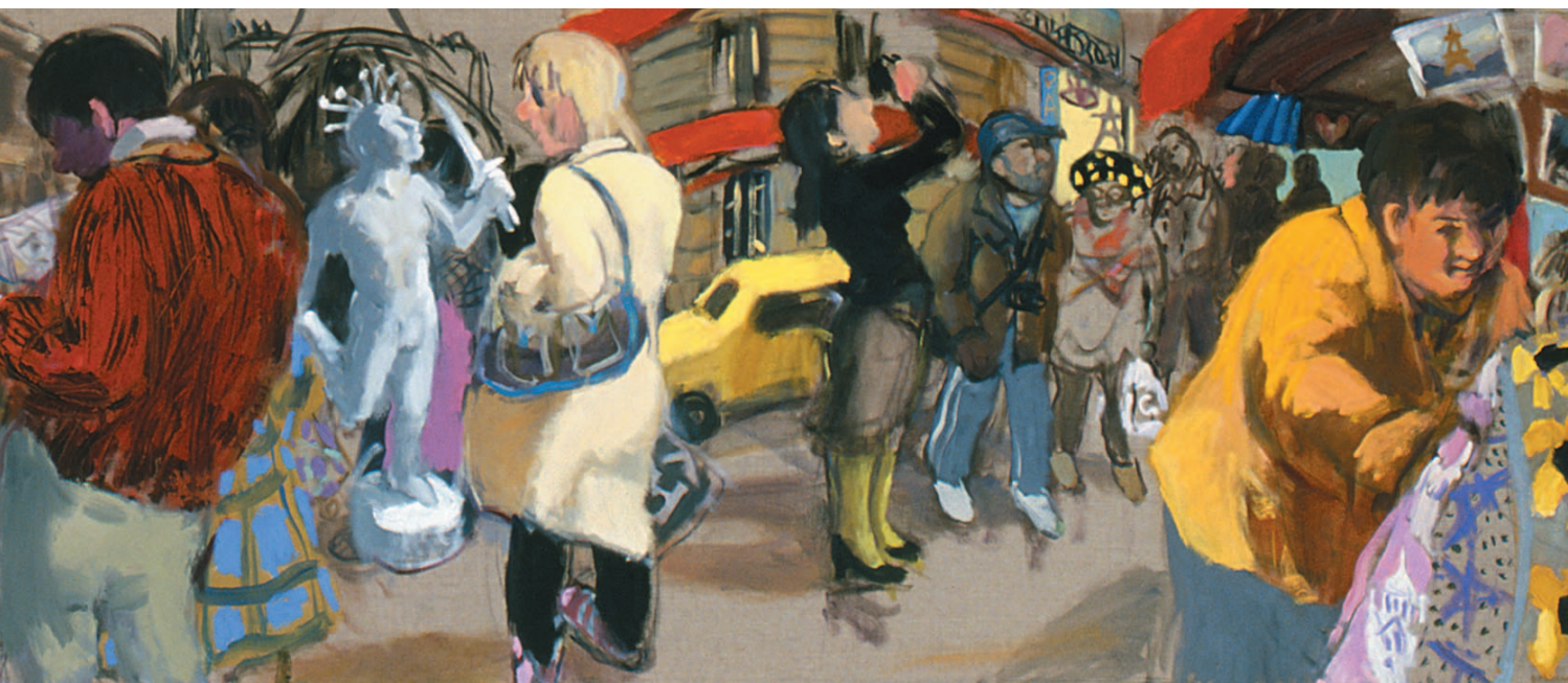
Tourist on Ile St Louis 2007 Oil on linen 80 x 378cm