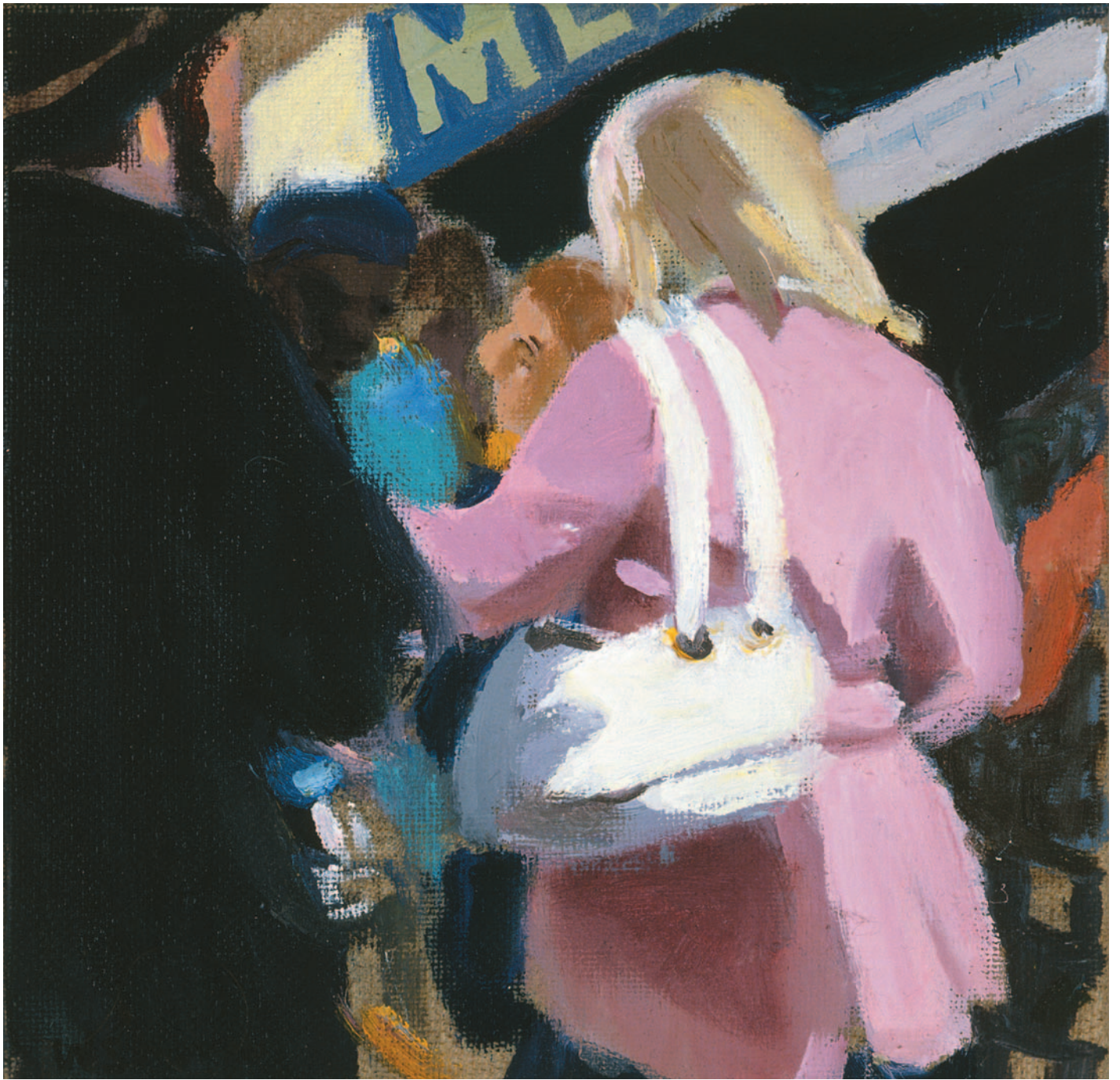
Pink Coat 2007 Oil on linen 20 x 20cm