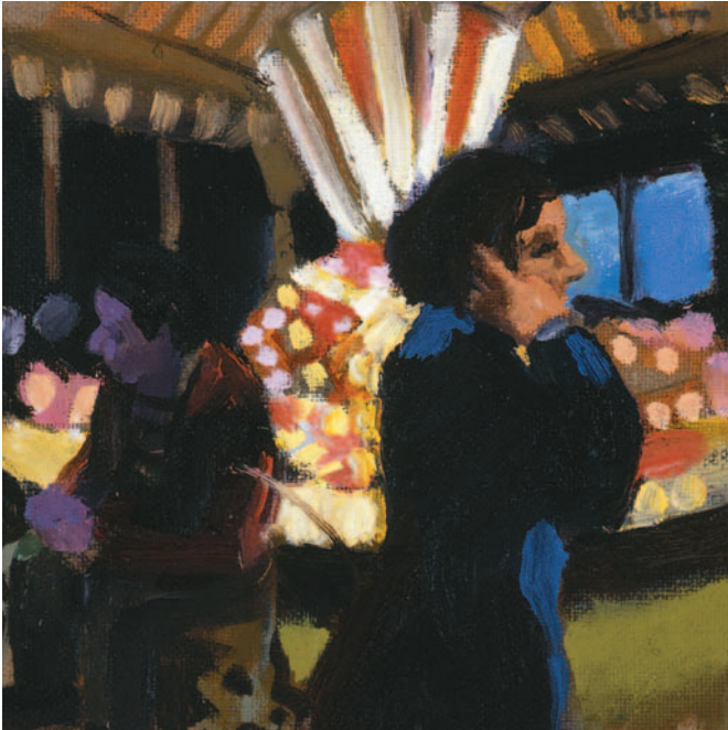
Carousel at St Paul Metro 2007 Oil on linen 20 x 20cm