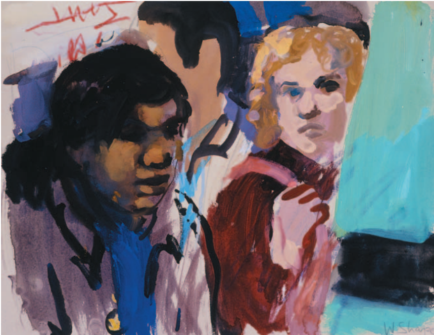
The Hairdresser The Metro 2007 Gouache on paper 28 x 36cm