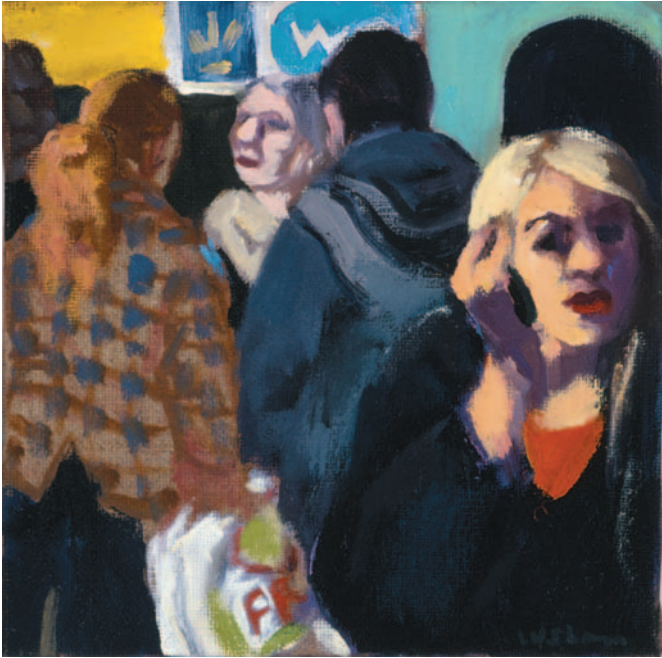
Carousel at St Paul Metro 2007 Oil on linen 20 x 20cm