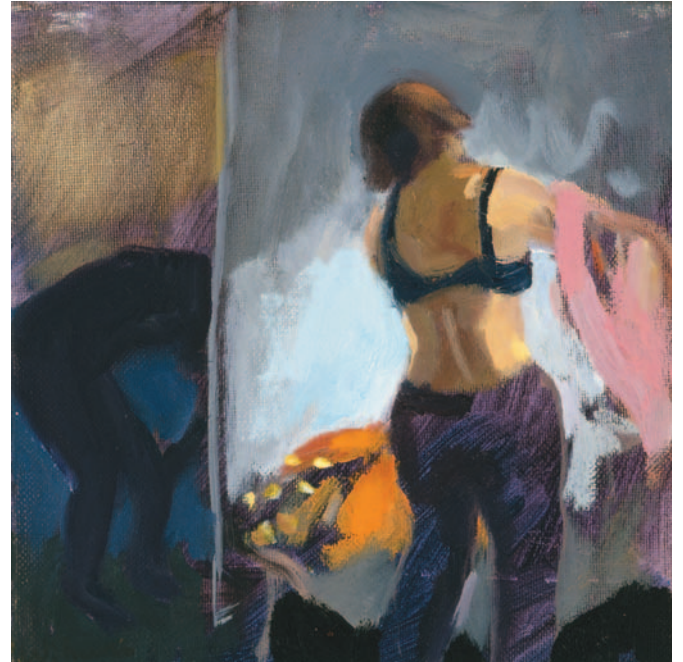
Woman Getting Dressed 2007 Oil on linen 20 x 20cm