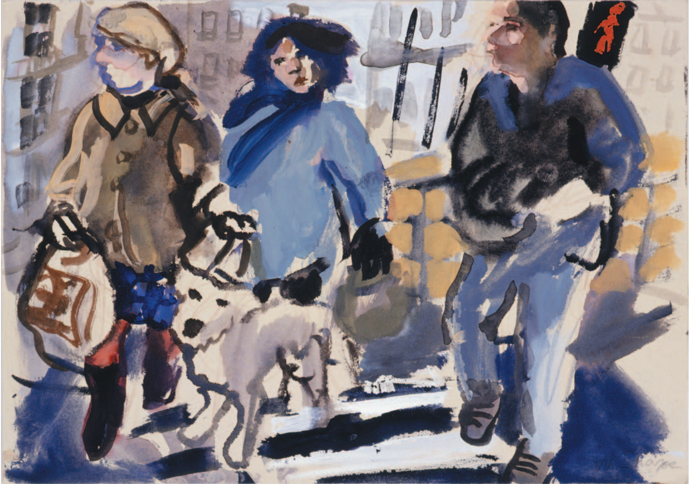
Dog 2007 Gouache on paper 28 x 36cm