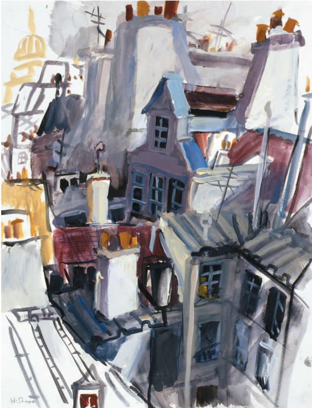
View from the Roof Backview 2007 Gouache on paper 50 x 65cm