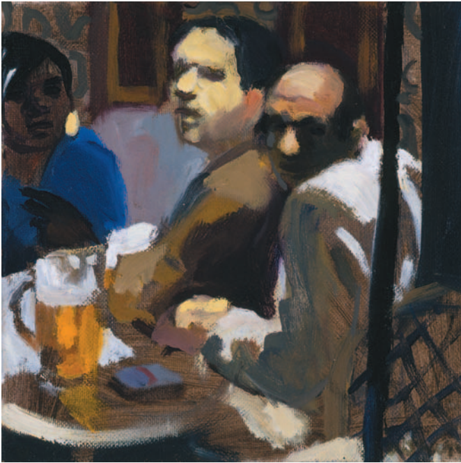
Men with Beer 2007 Oil on linen 20 x 20cm