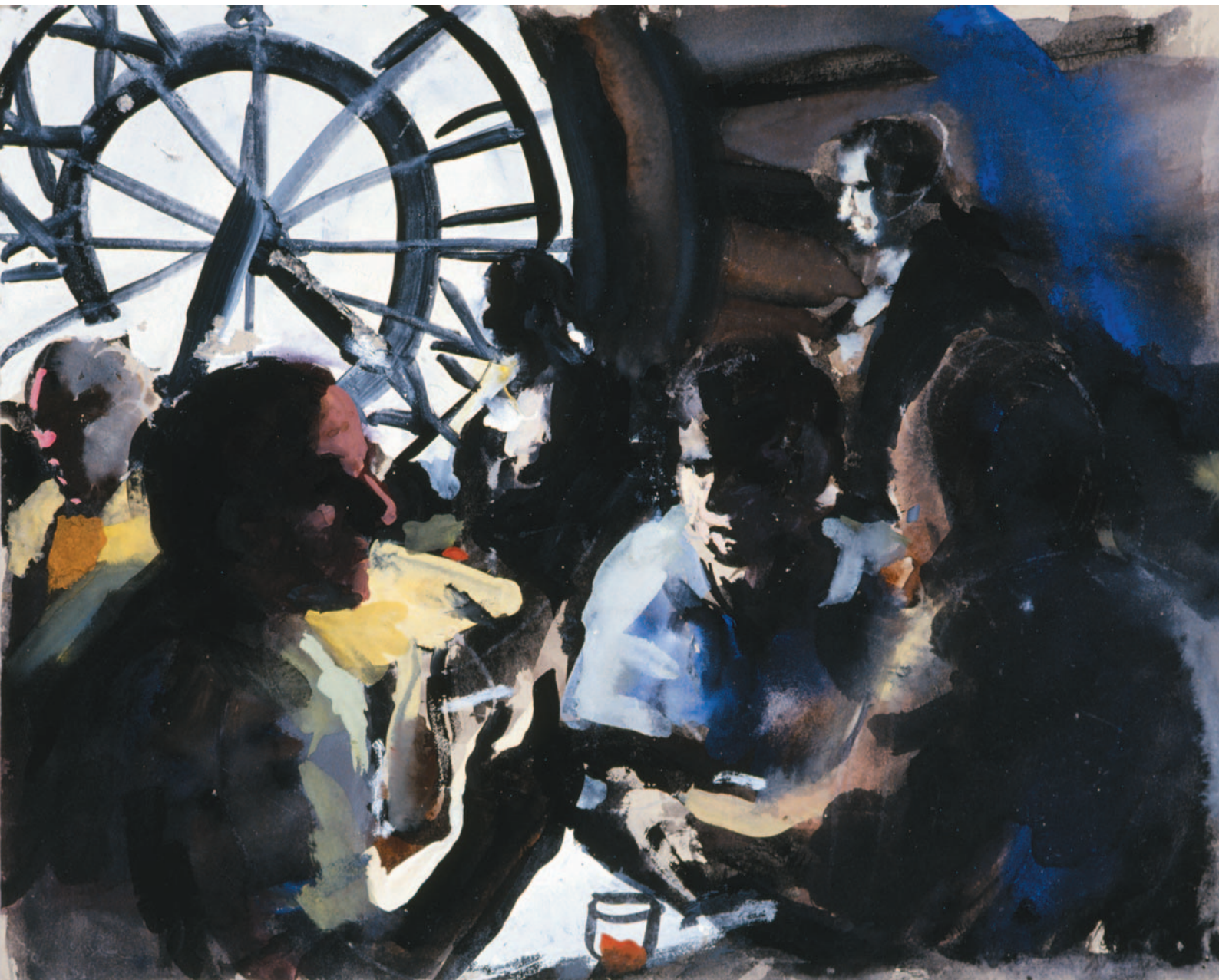
Musee D'Orsay 2007 Gouache on paper 28 x 36cm