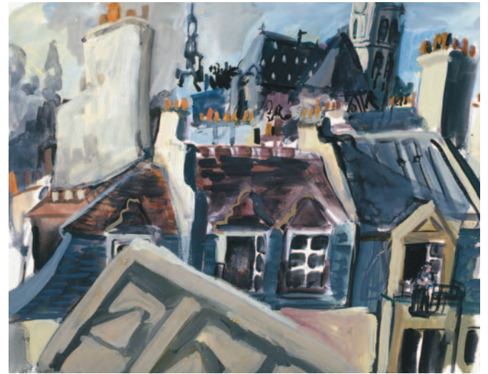
View from the Petit Hotel 2007 Gouache and mixed media on paper 28 x 37cm