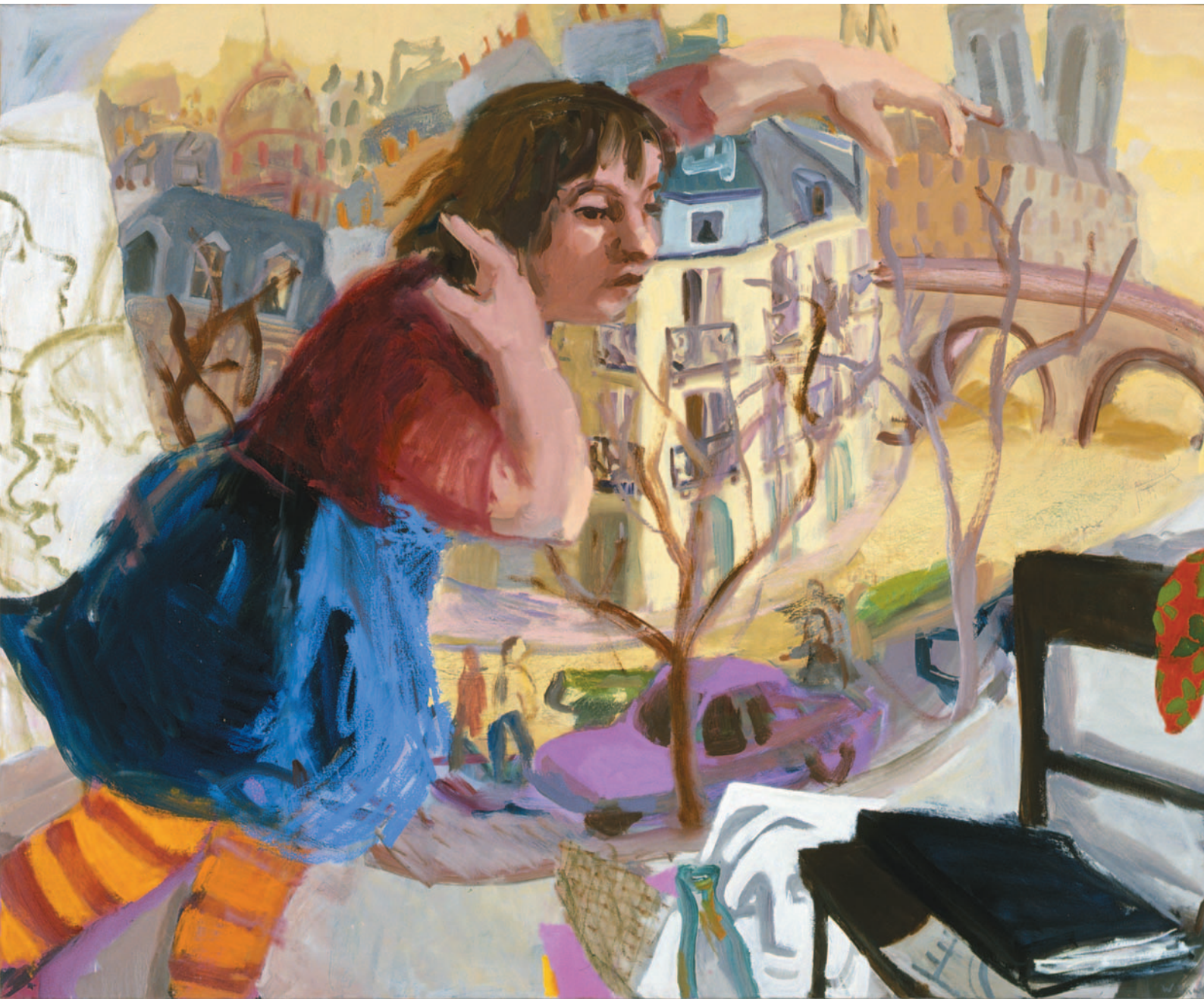
Paris Imagined 2007 Oil on canvas 145 x 180cm