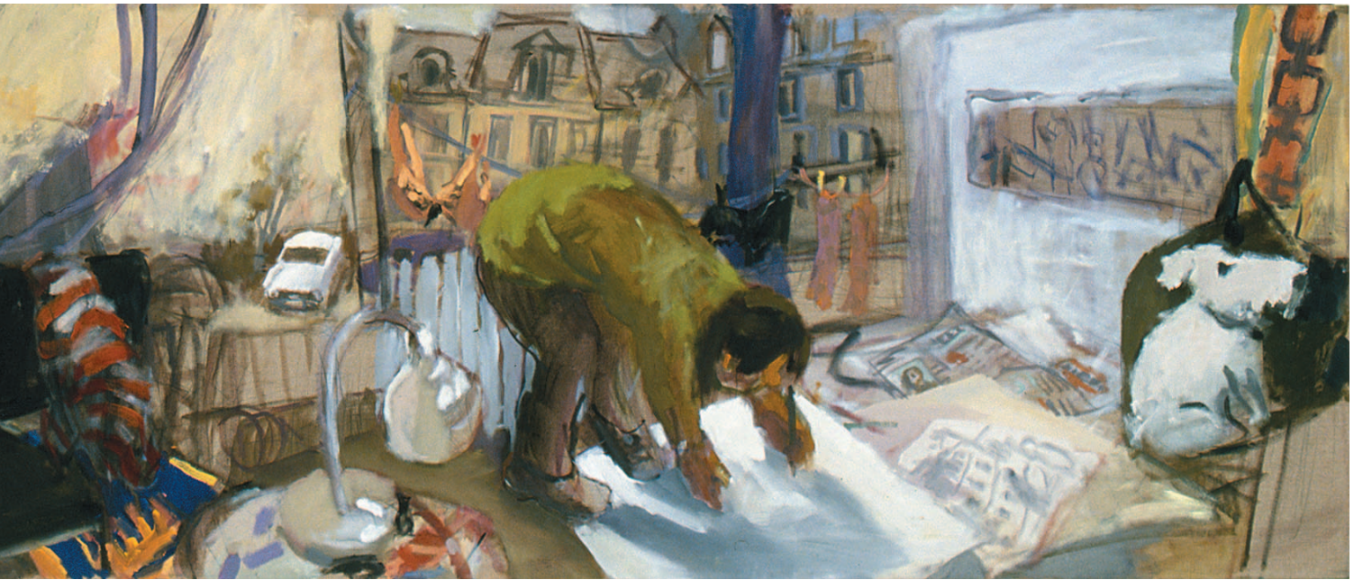
Paris Studio 2007 Oil on linen 80 x 378cm