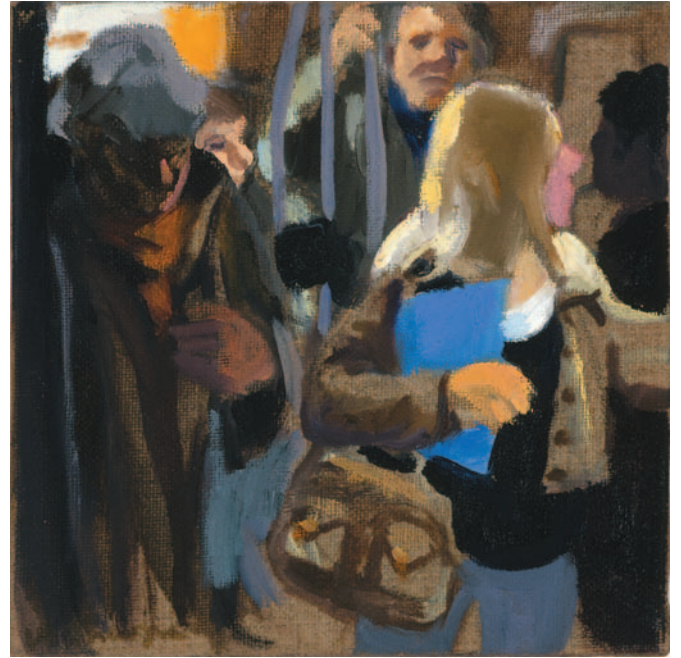
Woman with Blue Folder The Metro 2007 Oil on linen 20 x 20cm