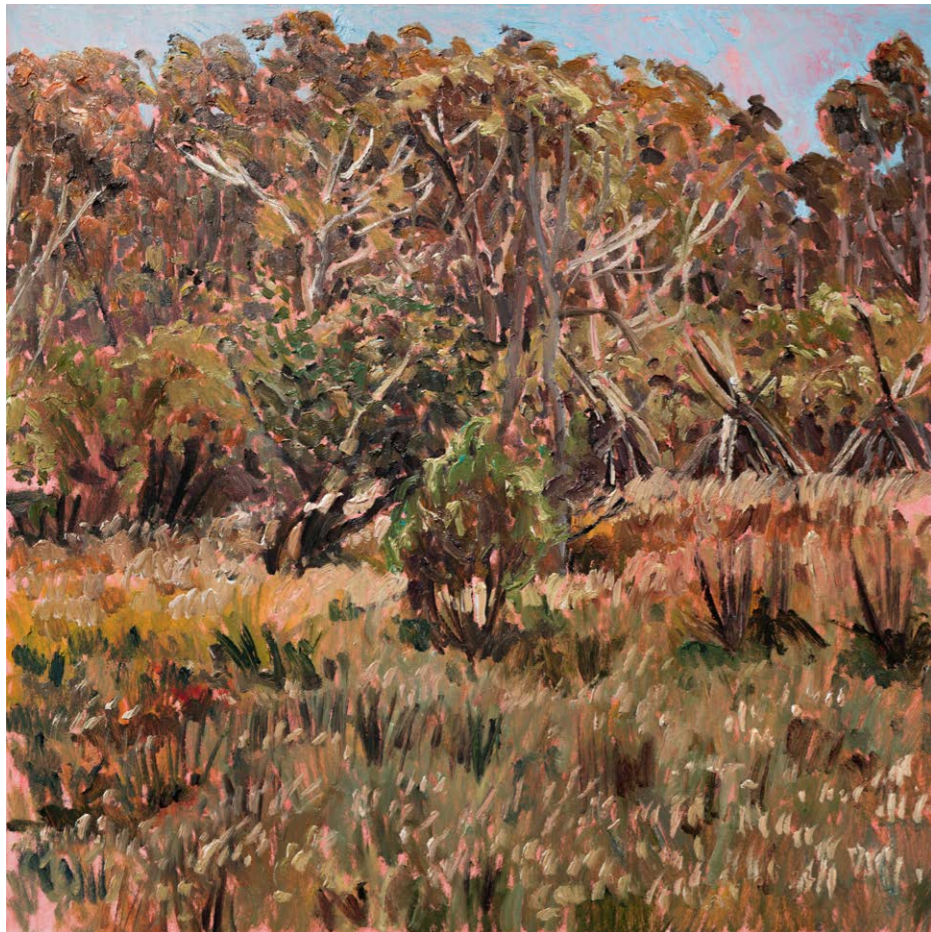
Top Swamp 1v, 2022, oil on board, 60x60cm