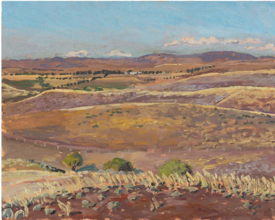
Gunningrah Dusty Day, 2009, oil on board, 48x60cm