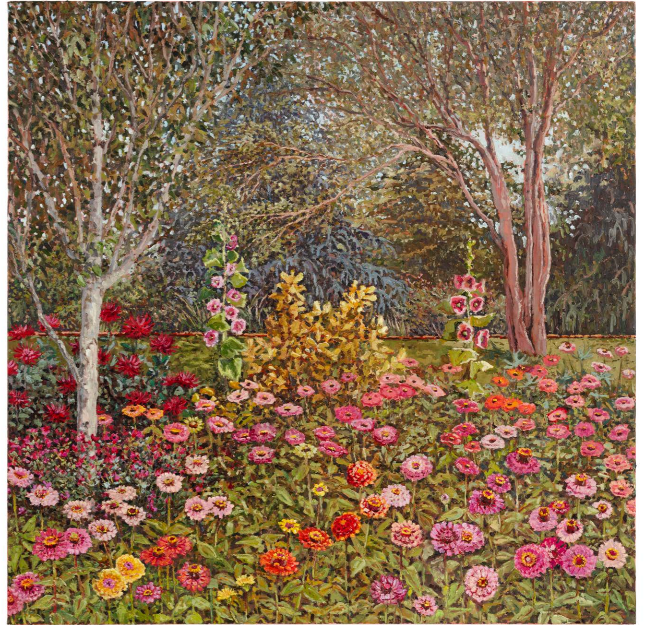
Autumn Bibbenluke Zinnias , 2025, oil on canvas, 137x137cm. Collection of NSW Parliament.