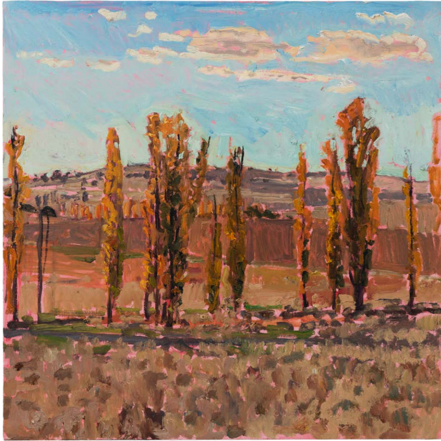
Gunningrah Poplars II , 2023, oil on board, 60x60cm