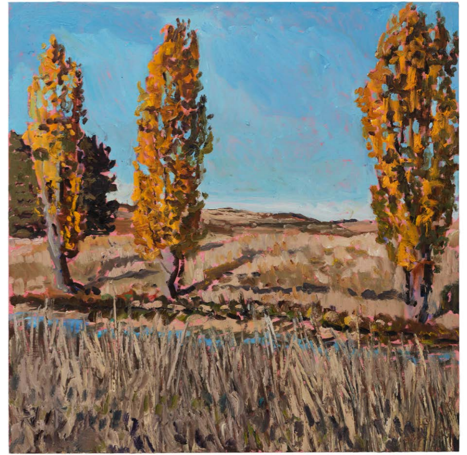
Gunningrah Poplars III , 2023, oil on board, 60x60cm