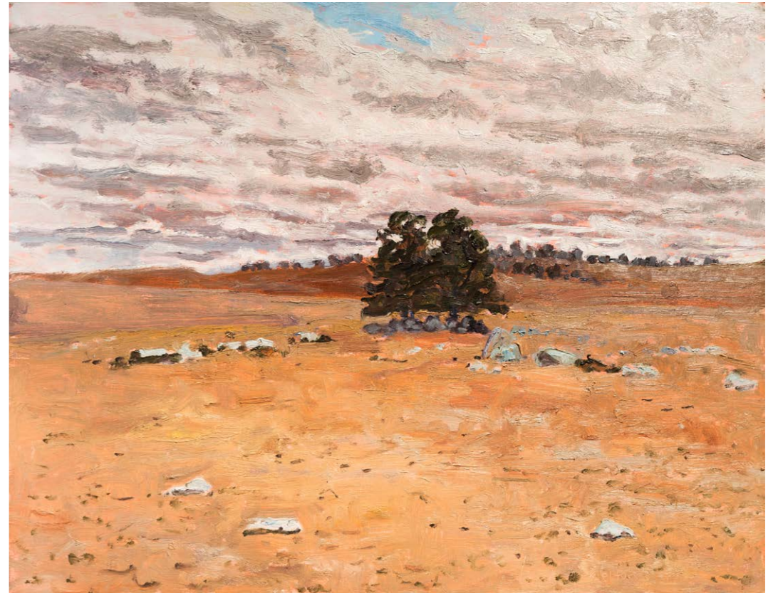
Kelton, 2023, oil on board, 55x70cm