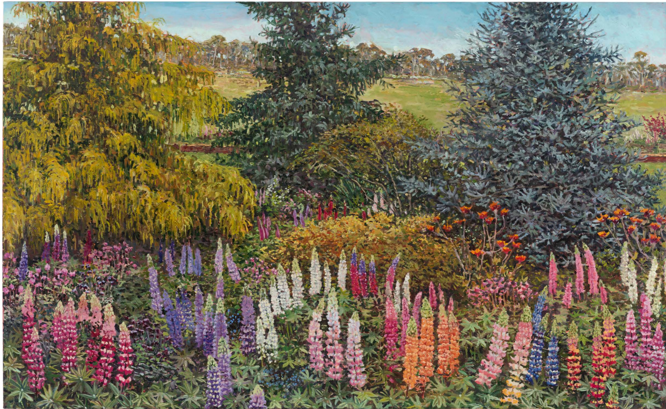
Bibbenluke Spring, 2025, oil on board, 122x198.5cm