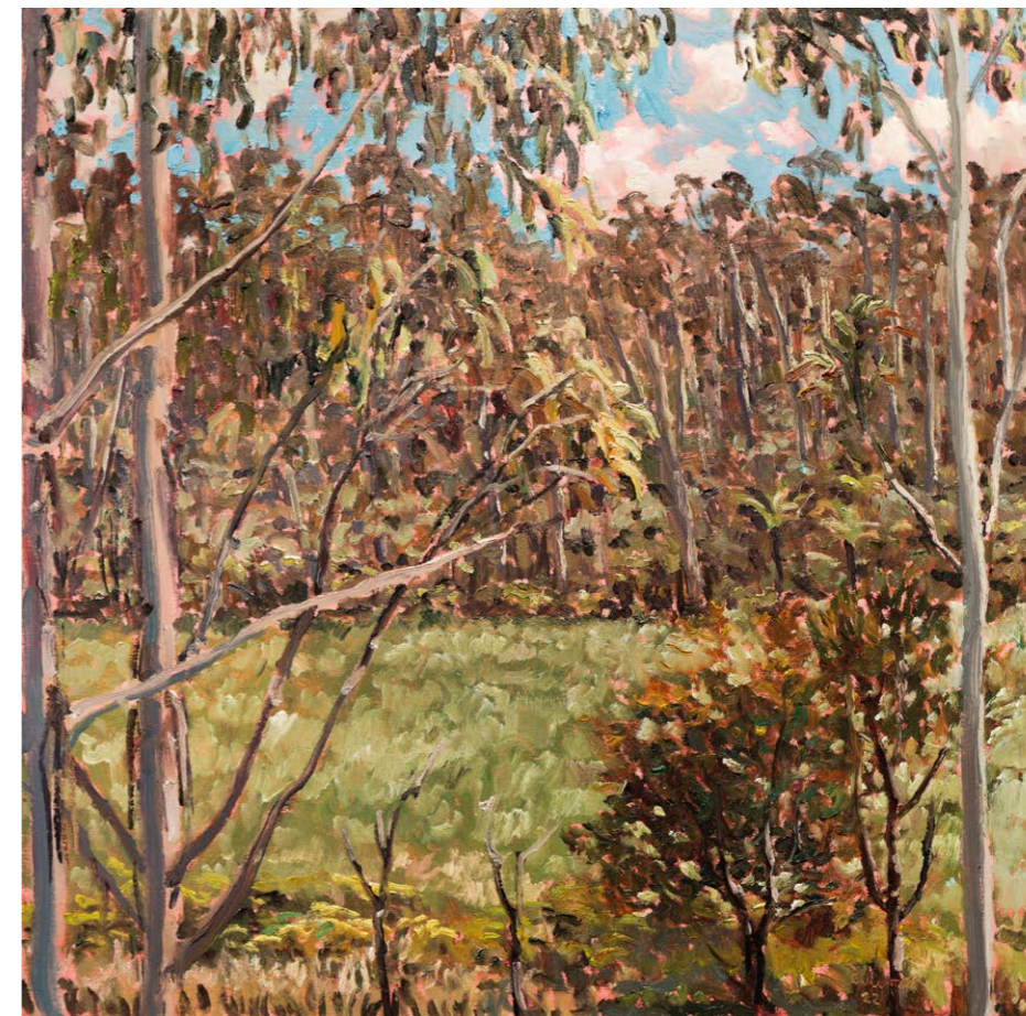
Middle Swamp, 2022, oil on board, 60x60cm