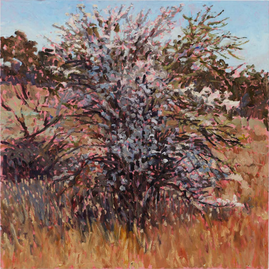
Plum Blossom , 2023, oil on board, 60x60cm