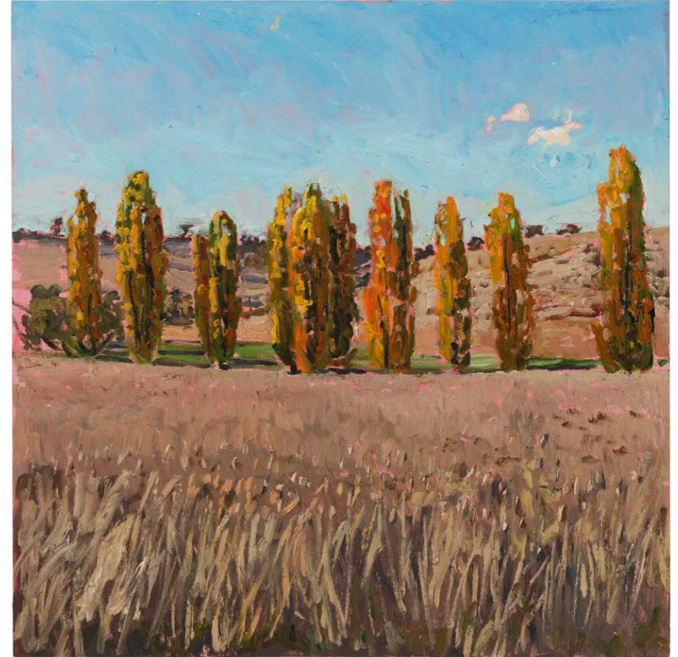
Poplars , 2023, oil on board, 60x60cm