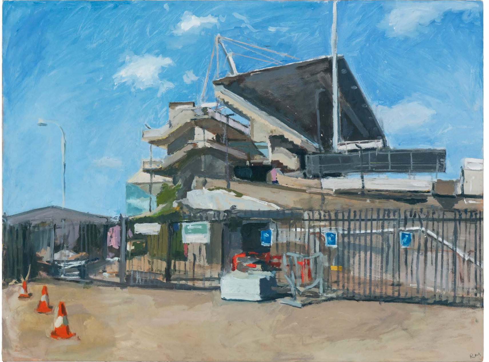
McDonald Jones Stadium, 2026, oil on board, 60x80cm