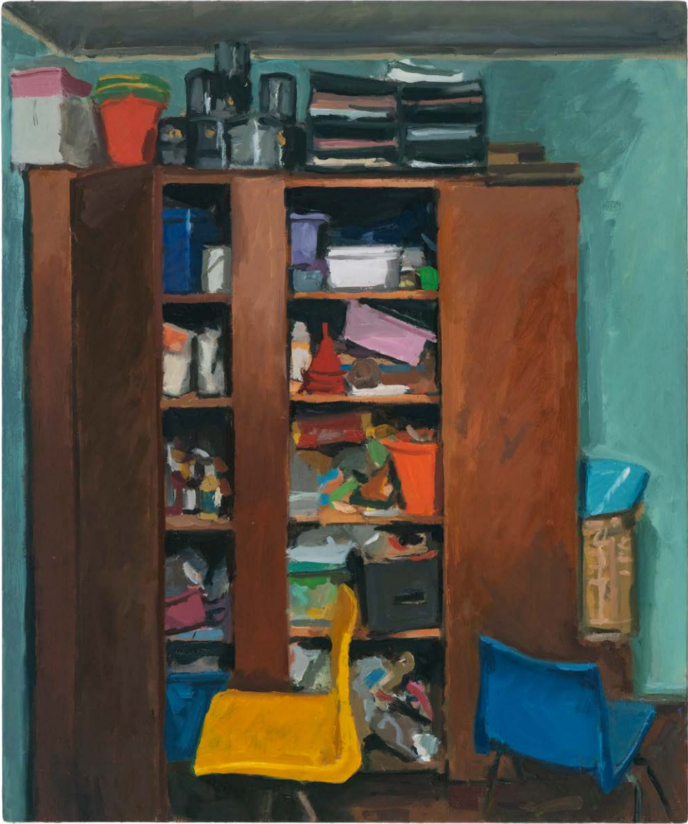
Craft Cupboard, 2026, oil on board, 60x50cm