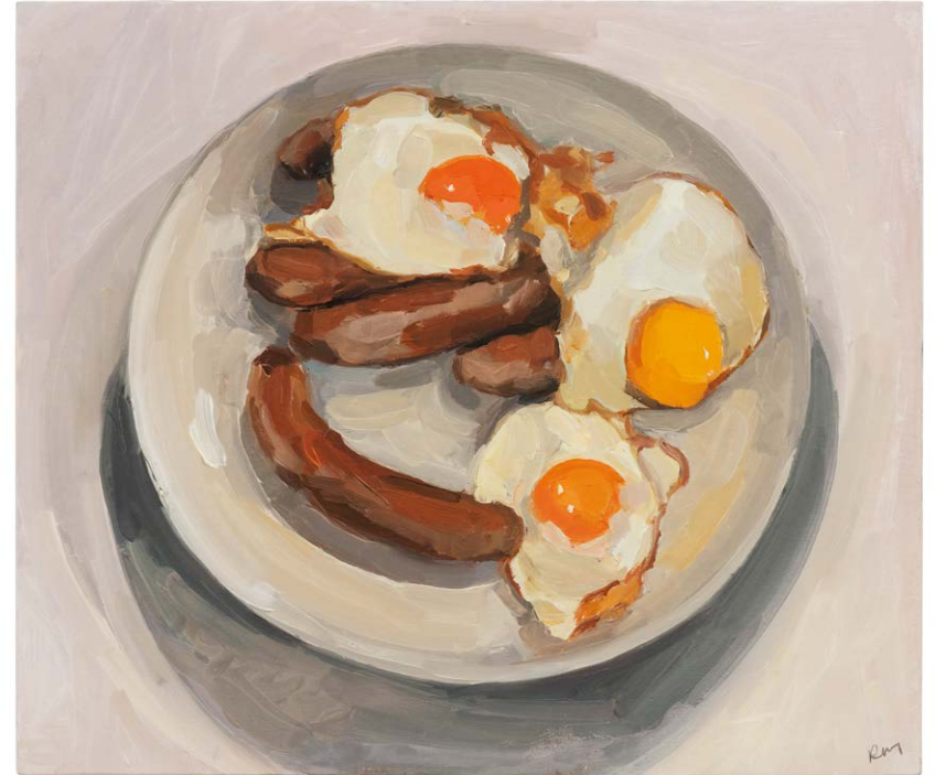
Bad Breakfast , 2025, oil on board, 30x35cm