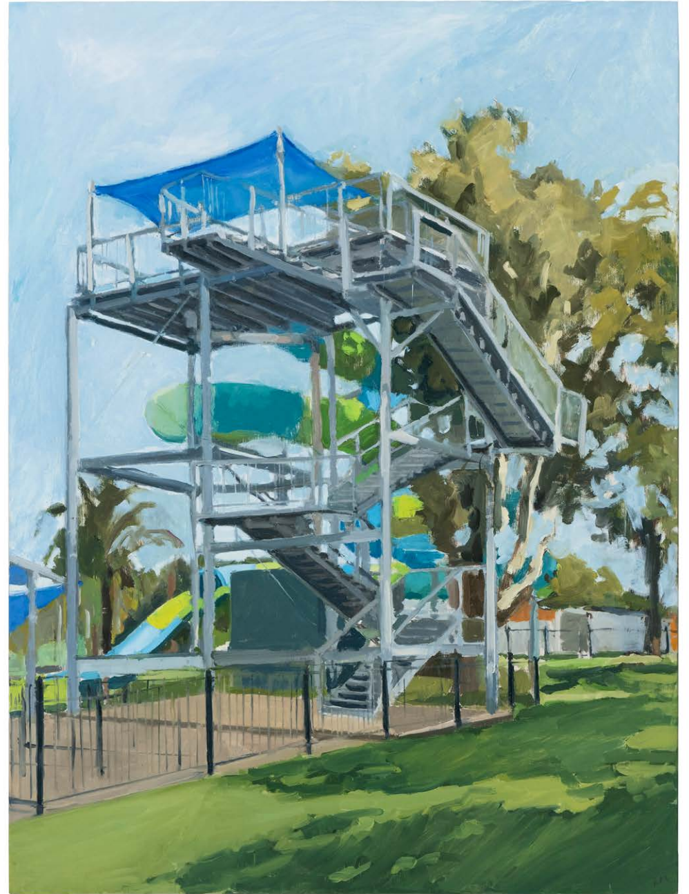
Water Slide, Lambton, 2026, oil on board, 80x60cm