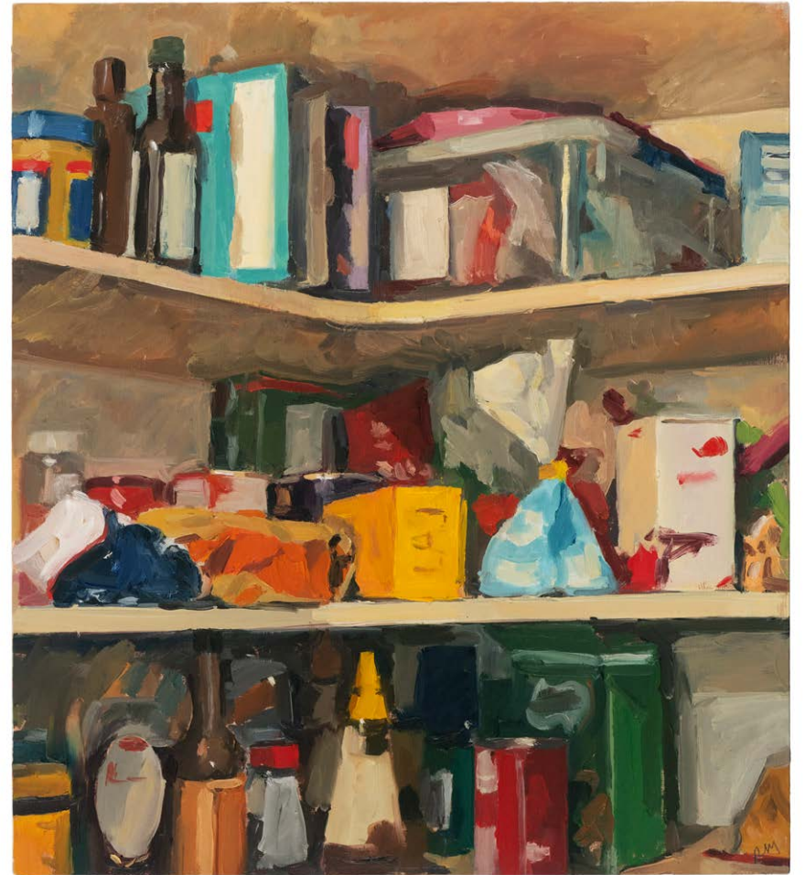
Top of Pantry , 2025, oil on board, 45x40cm