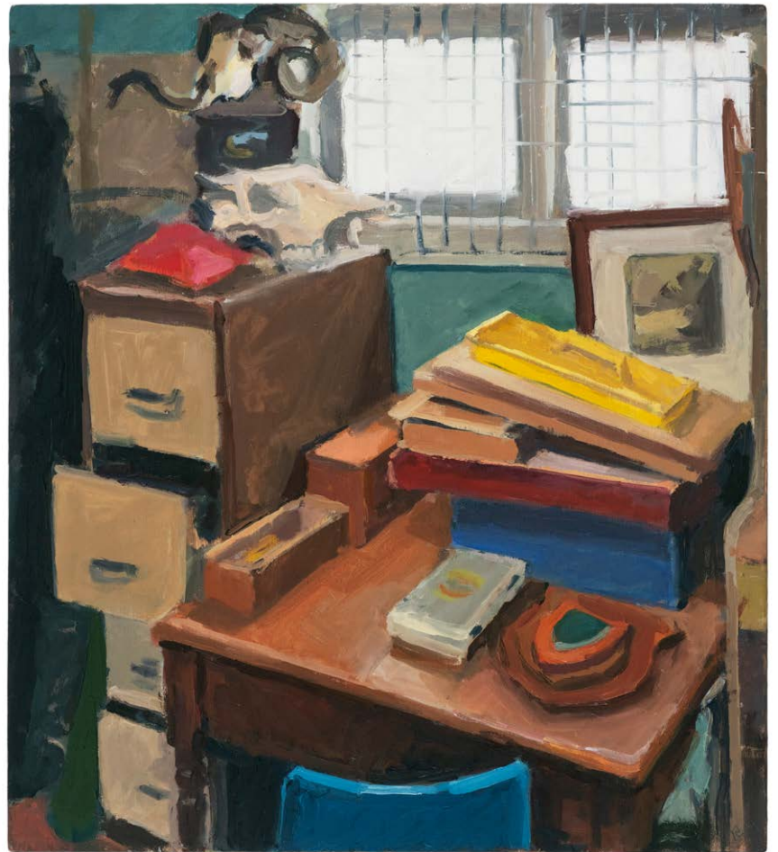
Suburban Office, 2026, oil on board, 45x40cm