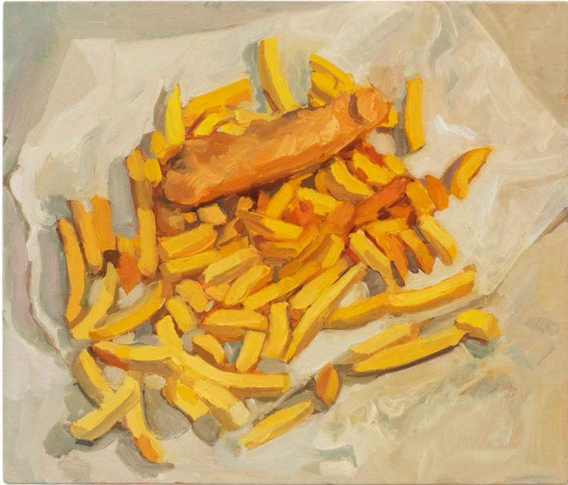
And Chips , 2025, oil on board, 30x35cm