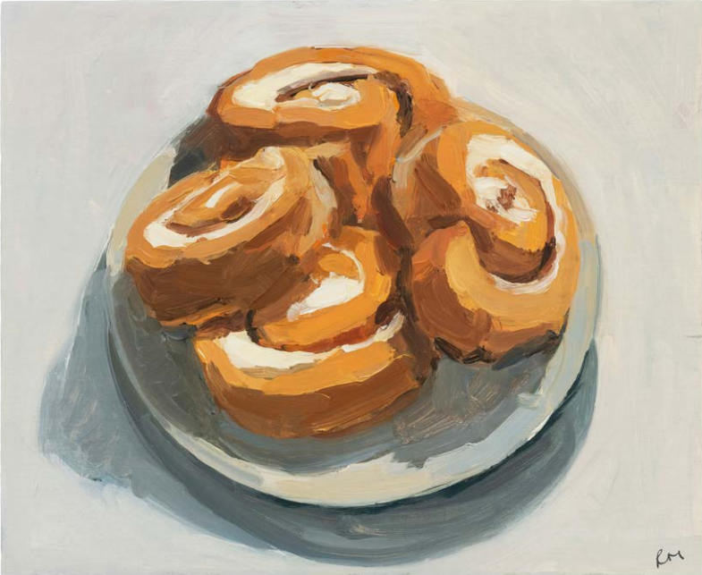
Fat Cake, 2025, oil on board, 23x28cm