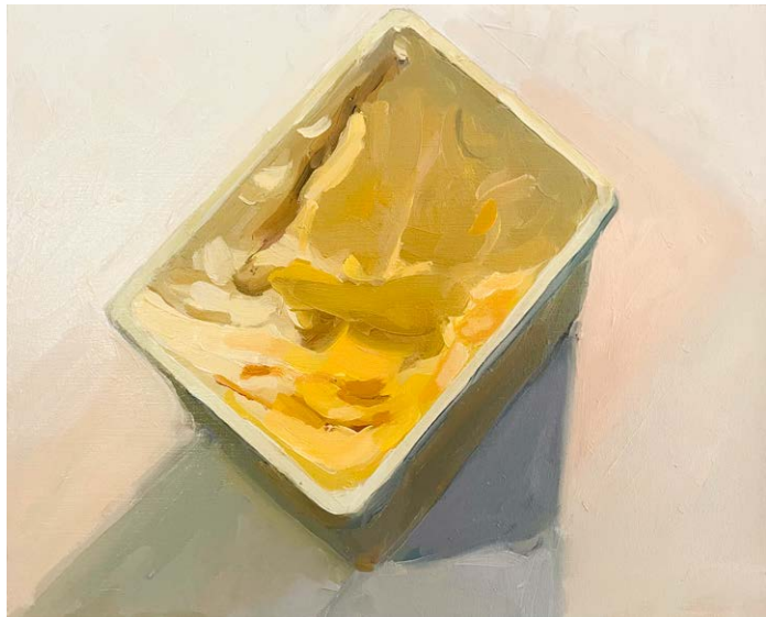
Butterfully , 2026, oil on board, 25.5x21.5cm